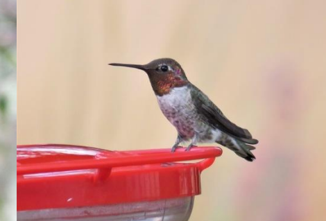
Anna's males are great to see.