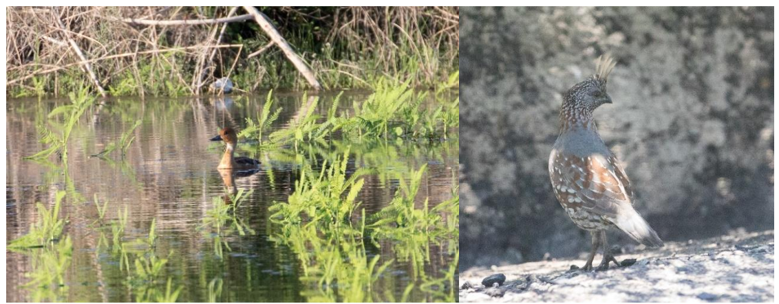
Fulvous W.D.not common in northern Mexico

4 ex. at the Hermosillo Sewage ponds. Seems to be