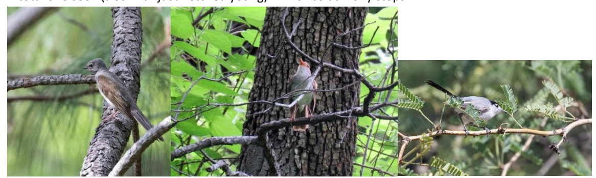
Brown-Backed Solitaire by Mel Senac, Orange-billed Nightingale Thrush by myself and Black-tailed Gnatcatcher by Mel Senac.