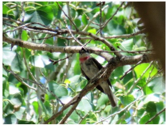
Rose-Throated Becard along the Anza trail in Arizona.