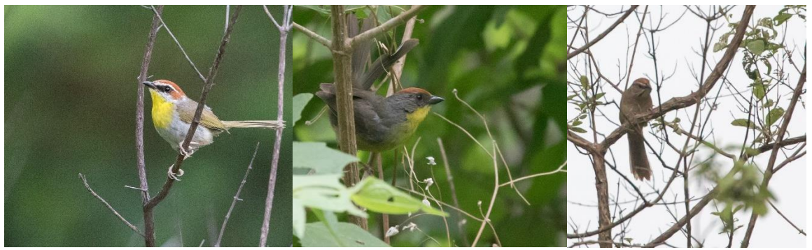
Rufous-capped Warbler, Rufous-capped Brush Finch and Rusty Sparrow all around a little valley at Yecora.