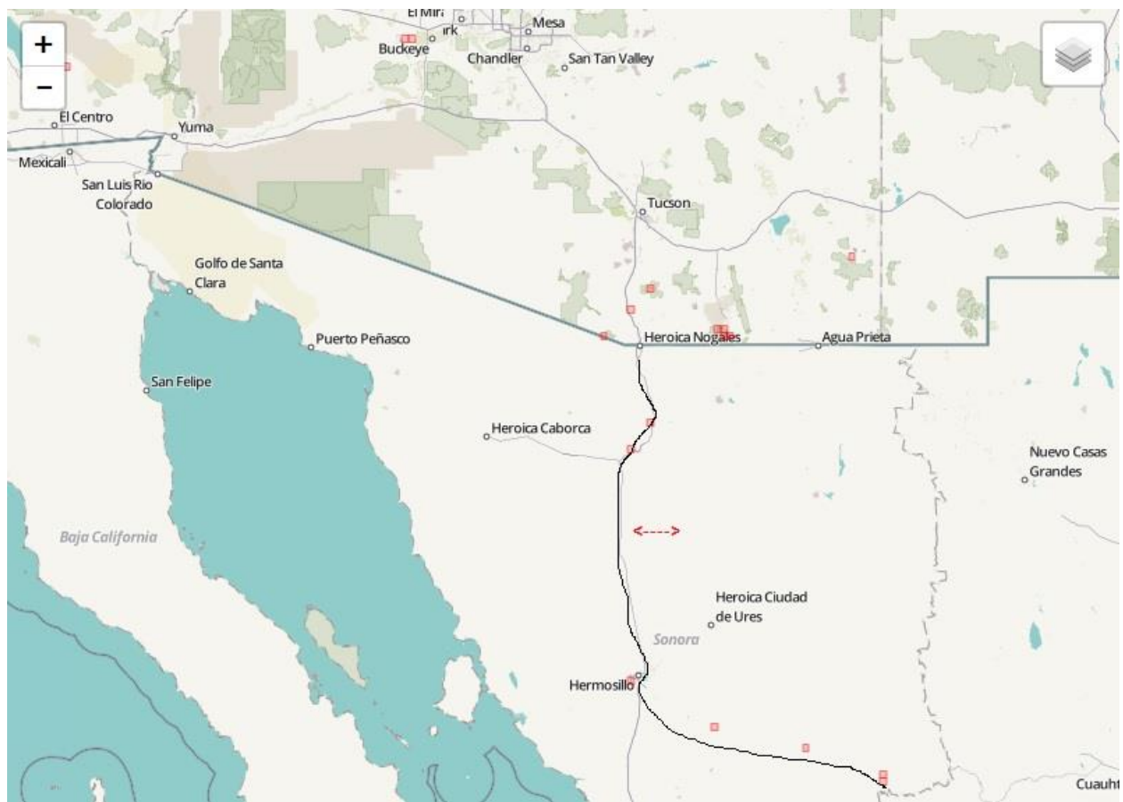
Here in red the birding spots visited for the important species and in the black line the route into Mexico (back and for the same way)