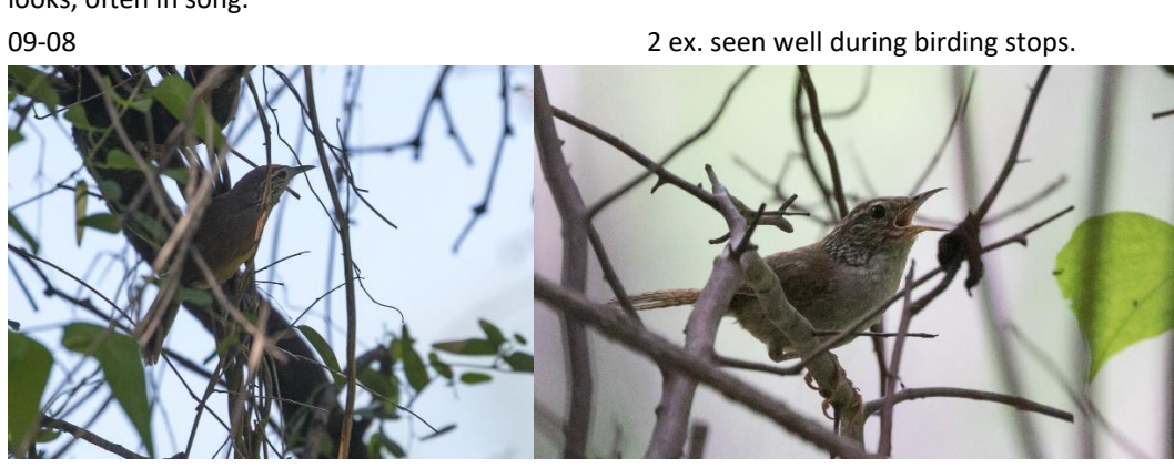
Happy Wren (buff underparts) and Sinaloa Wren (right)