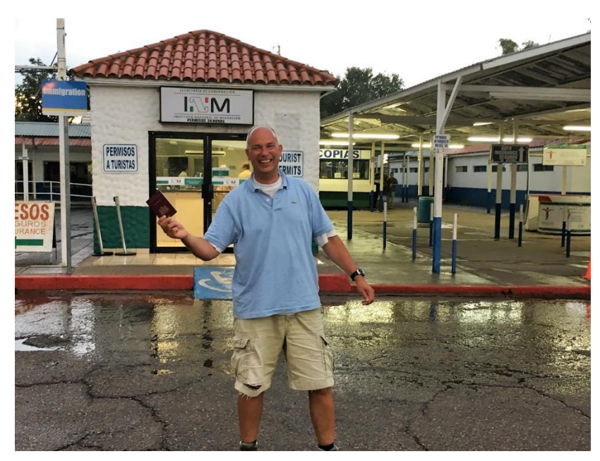
Safe back in Arizona, but Mexico tastes like more .....