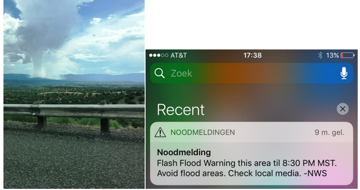
These rainshowers can give a lot of water in a very short period, in Arizona they give out a warning on your phone when you are nearby.