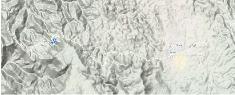
The often-visited valley near Yecora.

10-08 Flew from Phoenix back to Amsterdam and twitched an Aquatic warbler on the way back home to my house.