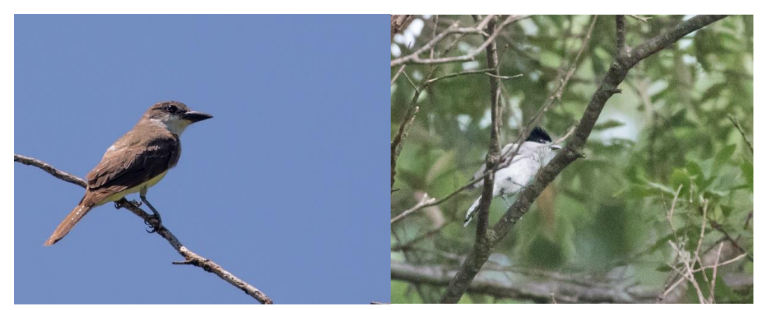
Thick-billed Kingbird and Gray-Collared Becard both by Mel Senac.