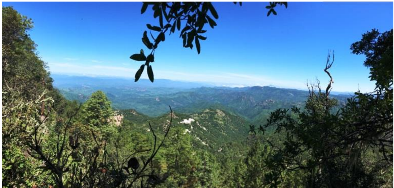
Sonora "room with a view"

On this trip the weather was good with almost no rain, mostly sunny with (dry) temperatures far above the 30 C but often no wind.