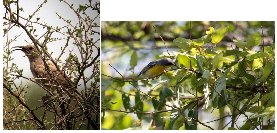
L.C. Thrasher made with my phone and Tropical Parula (by Mel Senac)

2 ex. seen well at "Thrasher corner" near Phoenix. Great views, out in the open. Quite plain (light) grey with peachy colored undertail coverts.