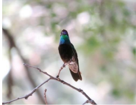
Nice "Maggie" but now renamed.

A total of 12 seen in total in Arizona and in the Mexican part (were there are no feeders).