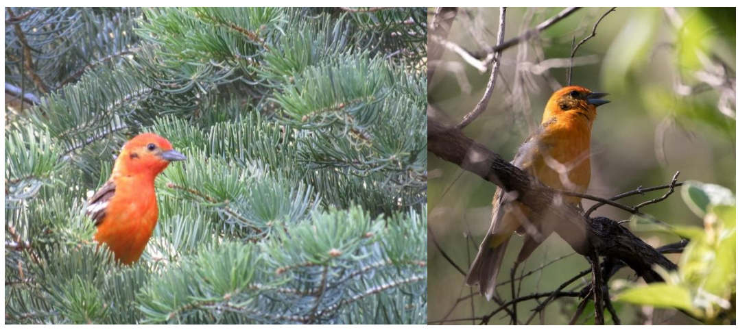
Flame-colored Tanagers, left in Ramsey Canyon, right in Yecora

2 ex. seen and hear well around a little valley near