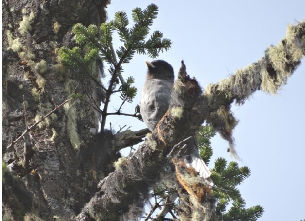
Sichuan Jay at Menbi Shan, after 15 hours of intensive searching.

(a special trip to see some difficult pheasants and parrotbills)