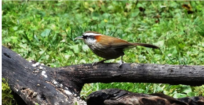
This bird turned me briefly into a "mealwormman".

21-04 1 ex. seen very well fed by mealworms at the University grounds of Chengdu. This is a rare bird in the middle of the city attracting many Chinese photographers.