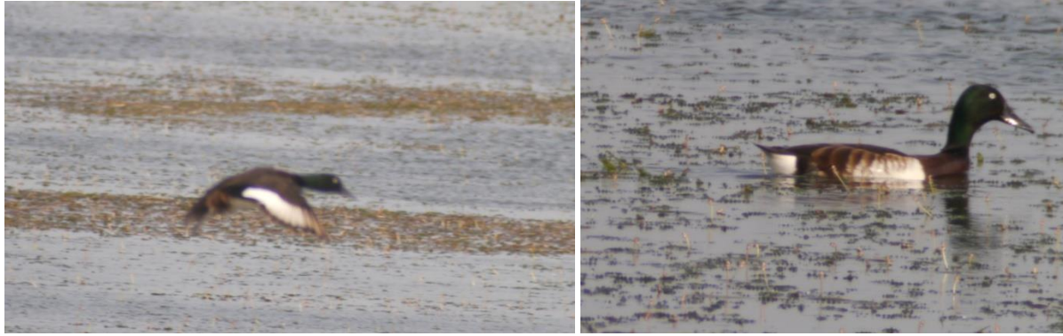
Several postures of Bear's Pochards.

22+23-04 60 ex. in Total spread over the two days at Bear's Pochard Lake, some males paired with female Bear's.