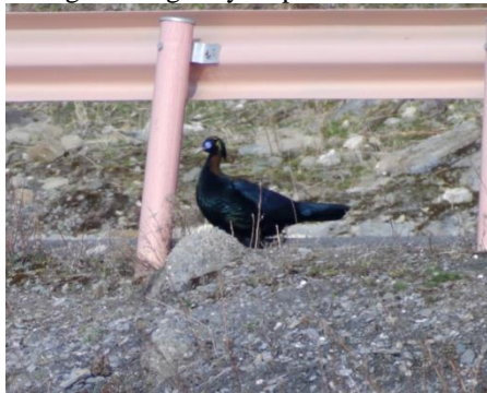
This Monal almost was hit by a car while crossing the road

15-04 3 ex. seen very well, walking (one almost hit by a car while crossing the road), in flight (with the white back), calling on the grassy slope of Balan Shan.