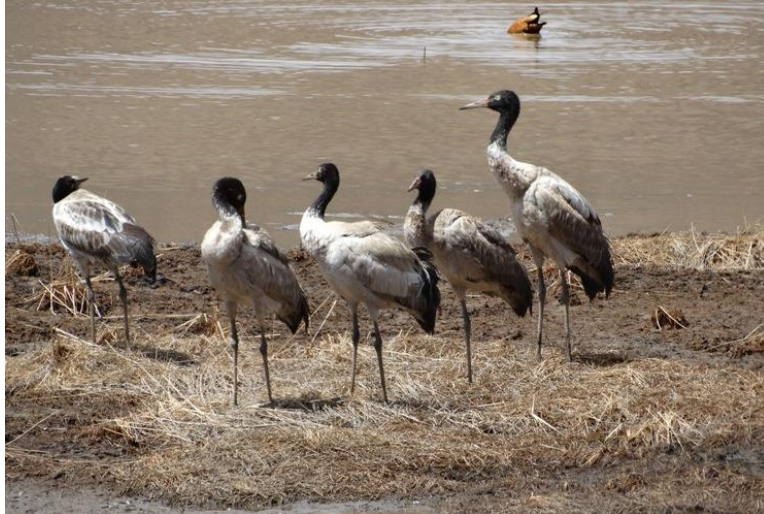
First year birds

17-04 30 ex, all but one first summer birds at the plateau at several wet places.