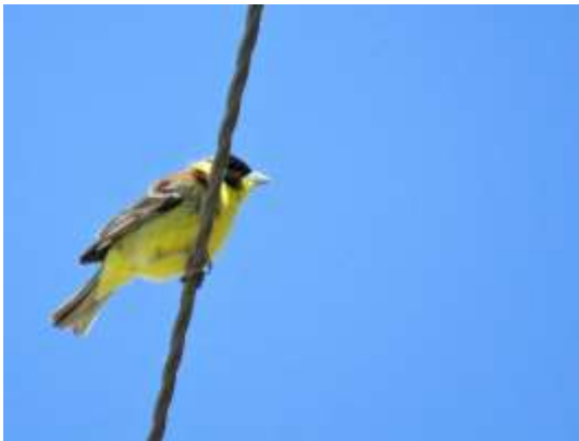
The only BH Bunting of the trip

2 birds heard in song in the hills but we were unable to find them and did not pay enough time.