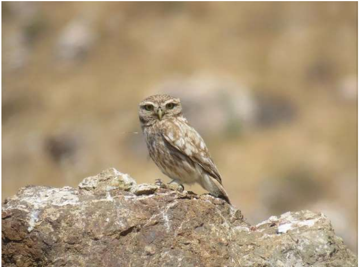
Lilith (Little) Owl, also a nice addition to the trip list

https://www.instagram.com/p/CO4dQDZgXZt/?utm_source=ig_web_copy_link