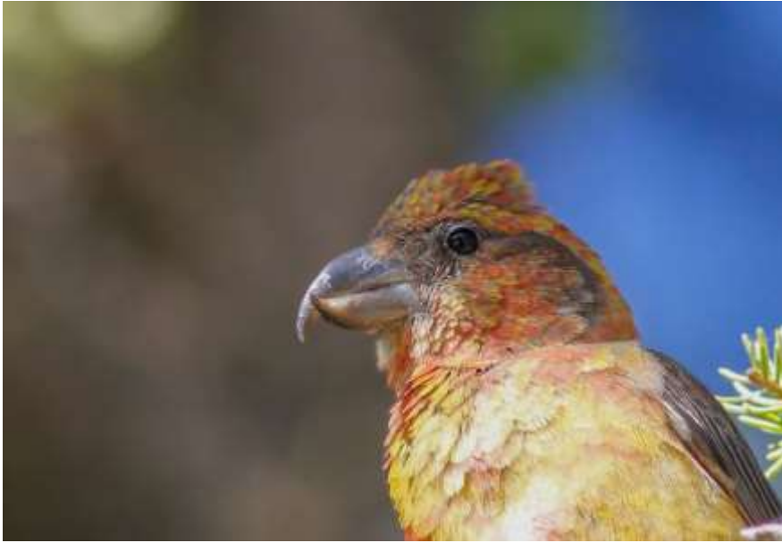
The male at this site by Matt Smith.

Kruisbek ssp guillemardi - Loxia curvirostra guillemardi - Observation.org . The male was rather palish red. The immatures were being fed.