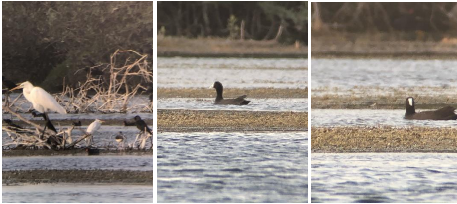
Eastern Cattle Egret and Red-knobbed Coot at the Western Khwar.