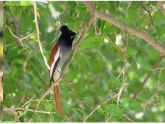
and African Paradise Flycatcher