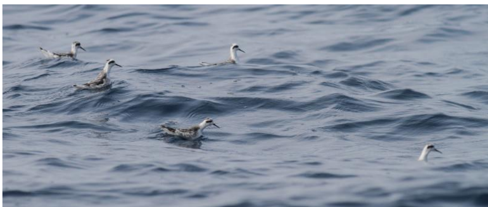
Phalarope flock by Bram Ubels on the pelagic a day before (same birds)

Common along the coast, mostly on the beaches and khwars.