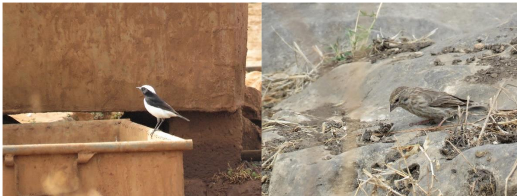
Arabian Wheatear and Yemen Serin, nice birds to find in the mountains north(east) of Salalah.

2 males seen very well in the hills NE of Salalah.