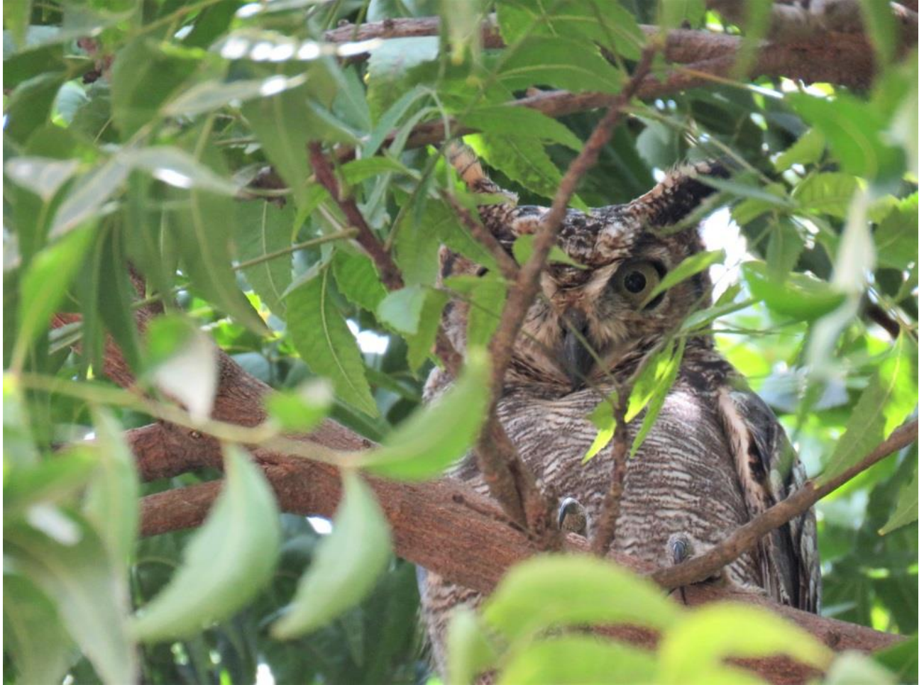
Arabian Eagle Owl, one of the two "needed" owls.