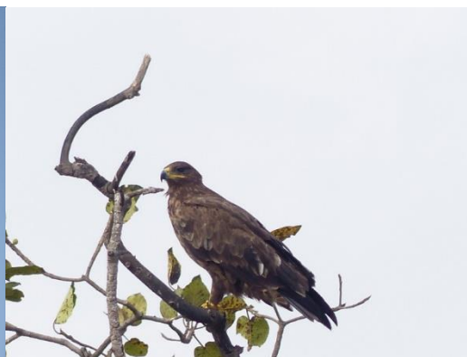
A Steppe Eagle in a tree near a dead donkey

The commonest aquila seen during the trip, seen daily in low numbers but no concentrations.