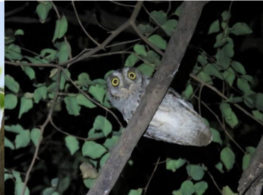
Aranbian Scops Owl (one of my targets)