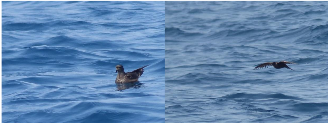
Swinhoe's Storm Petrel (one of the two) by Hughes Dufourny