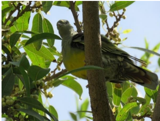
Nice Green Pigeon and

2 ex. at Ayn Razat botanical gardens. Very close