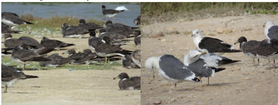
Sooty Gulls and

Common along the coast, mostly on the beaches and khwars.