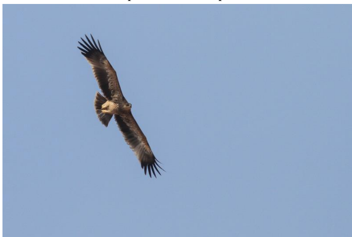
Nice immature Eastern Imperial near the famous sink hole

A total of 3 birds seen spread over the trip all immatures