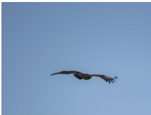
Nice mystery pic Greater Spotted Eagle