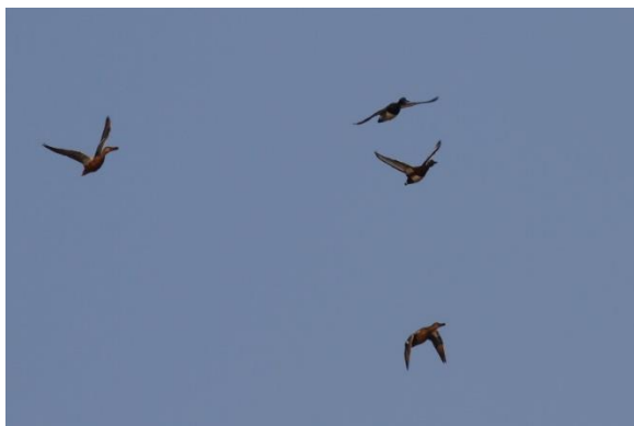
The two birds at the western khwar

A total of 4 birds recorded at both Khwars and Wadi Darbat.