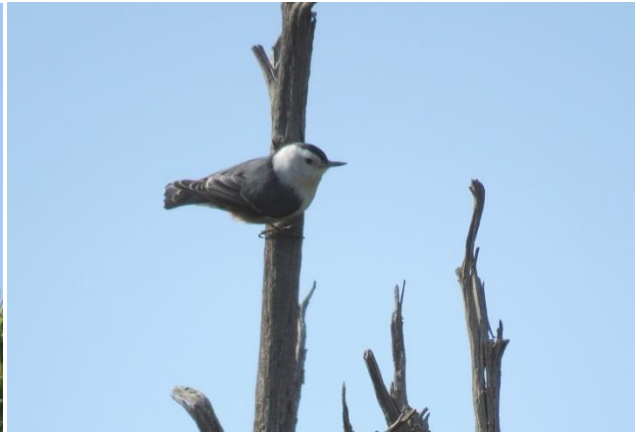
Juniper Titmouse and "Slender-billed" or Interior White-breasted Nuthatch, both at the same site.