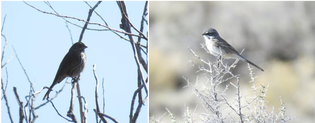
Slate-colored Fox Sparrow and Sagebrush Sparrow both much wanted on this trip.

2 ex. seen well along a stream near Gunnison.