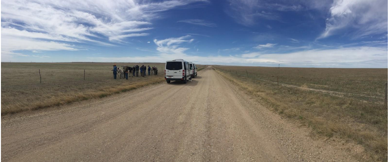
Ending the trip at Pawnee Grasslands was a good choice