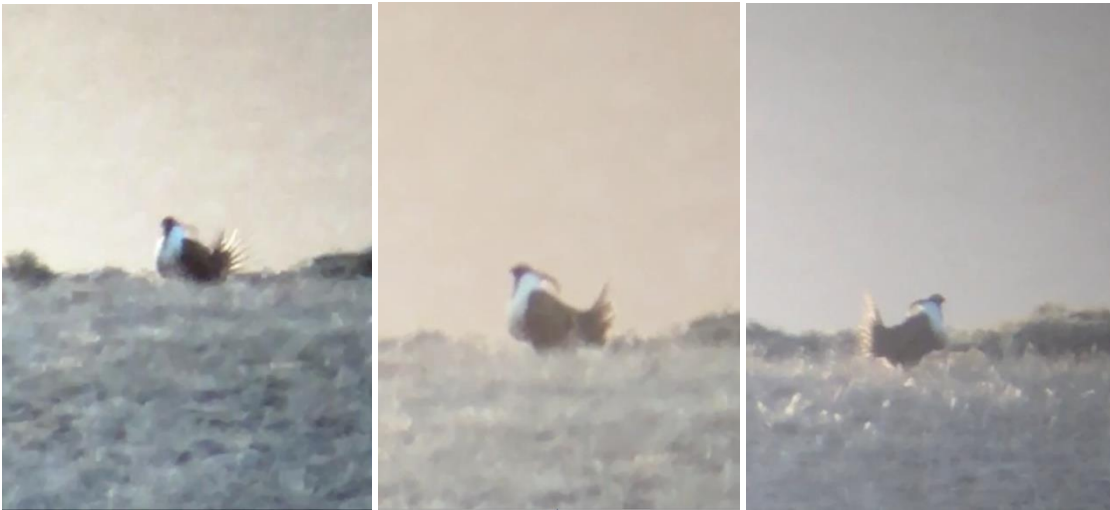
Distant but good scopeviews, the ponytails is visible.

A bit far but good views in the scope. See also: https://www.youtube.com/watch?v=BfnYPEoAdig