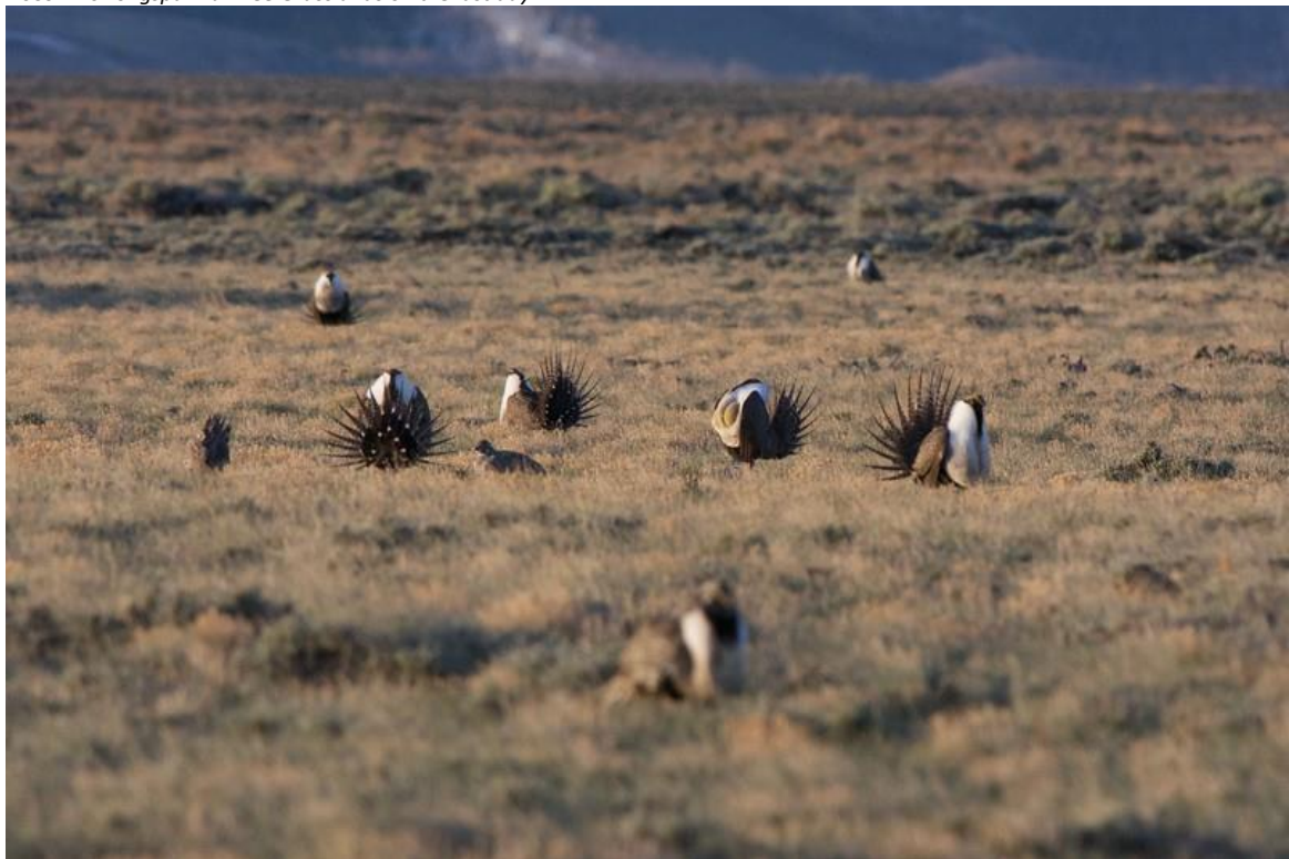
The grand finale of the tour, Greater- Sage Grouse near Walden