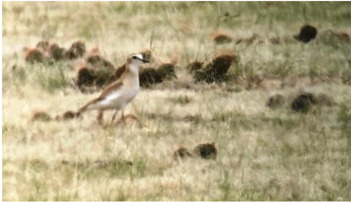
Great to see them on the breeding grounds after winter birds in '93

nice to see them in summer plumage with the black forehead band. The males appeared more rich brown colored on the mantle and fore neck.