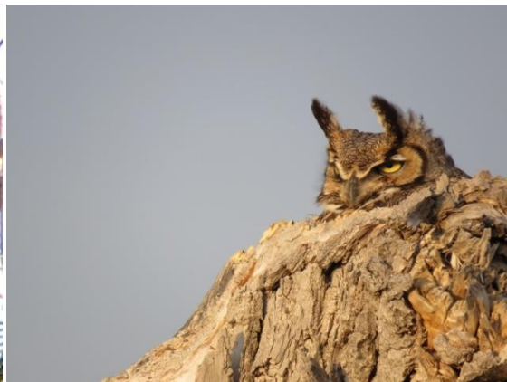
Small (Northern Pygmy) and Big (Great Horned) Owl.