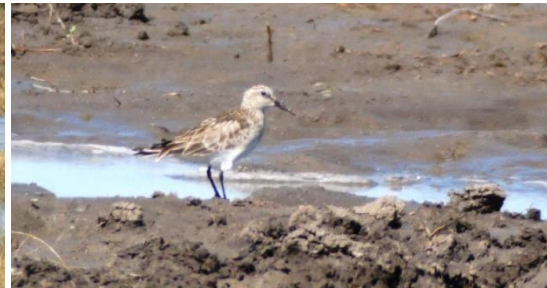
Long (not seen)-billed Curlew and Baird's Sandpiper where wader highlights on this trip.