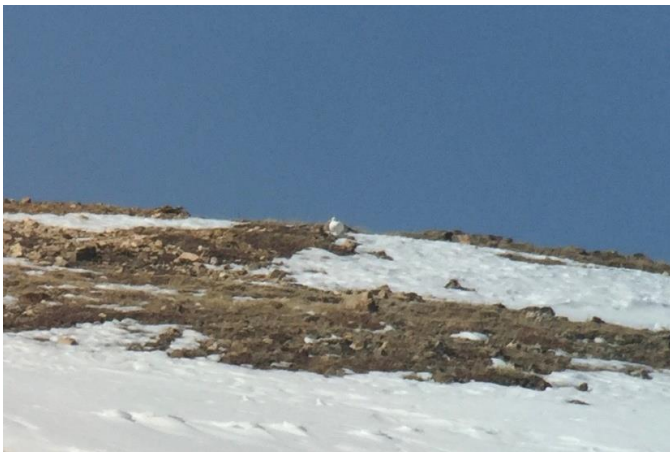
Luckily I saw this species at foot range long ago.

The white tail was seen well in the scope.