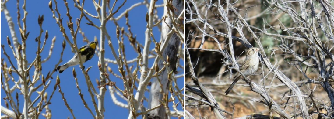
Nice migrating Audubon's Warblers and singing Brewer's Sparrow.