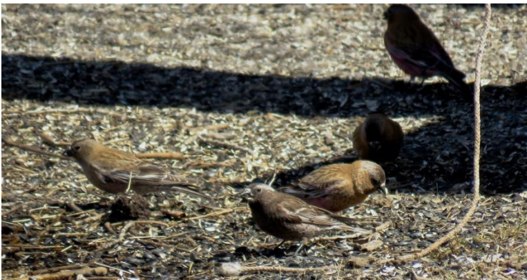
The second male, with nice brown-capped.

2 males at a different feeder at Silverthorne. The males where "cracking" birds with nice pink underbellies and undertailcoverts.