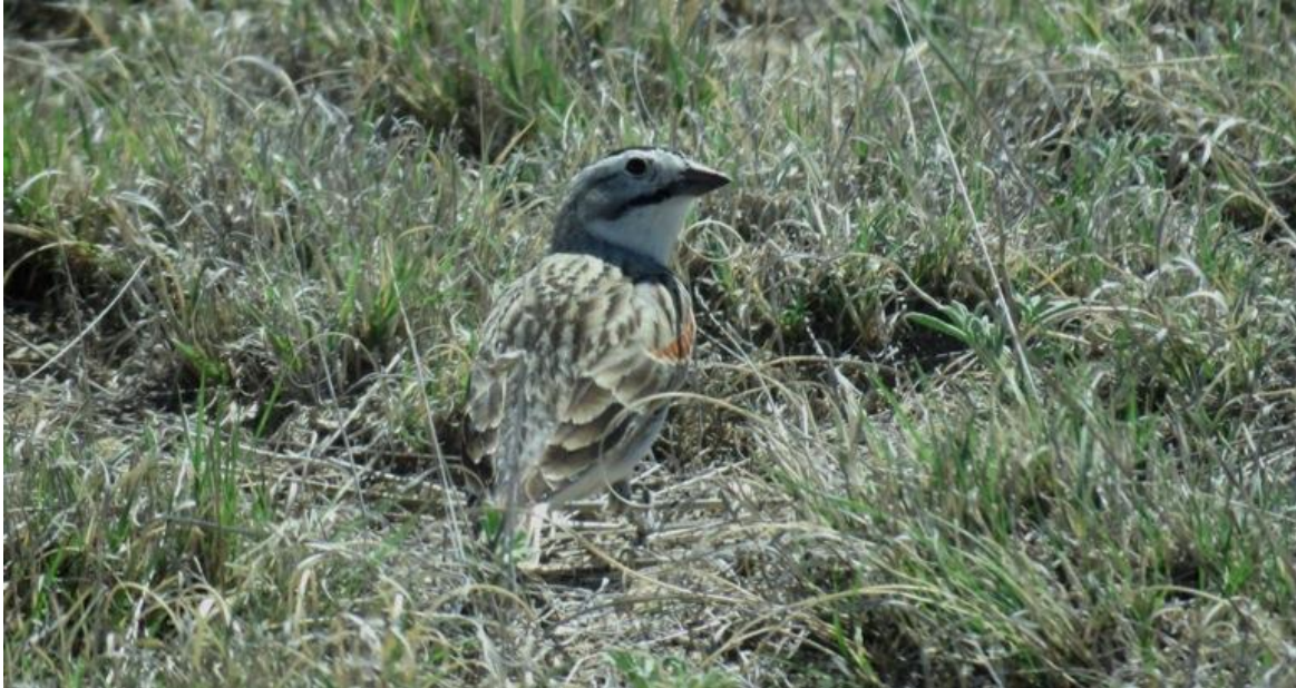
McCown's Longspur Pawnee Grasslands on the last day.