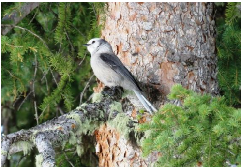
Always curious, Gray Jay