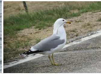
California Gull collecting nesting material.