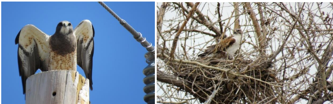
Swainson's left and Ferruginous right, both great to see them after many years.

A total of 32 seen, all incoming migrants.