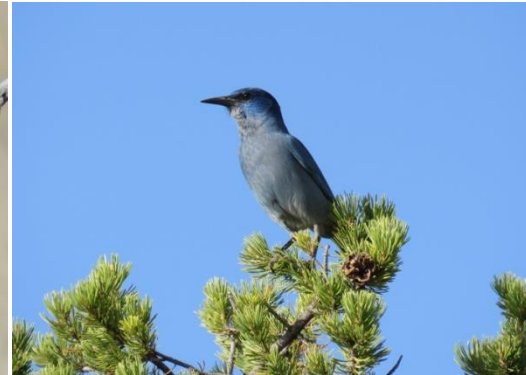
Pinyon Jay not an easy species to photograph.