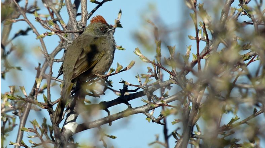
The only we saw, by Cory Gregory

16-04 1 singing male at Black Canyon, seen well.