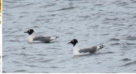
Franklin's Gulls in full "dress".