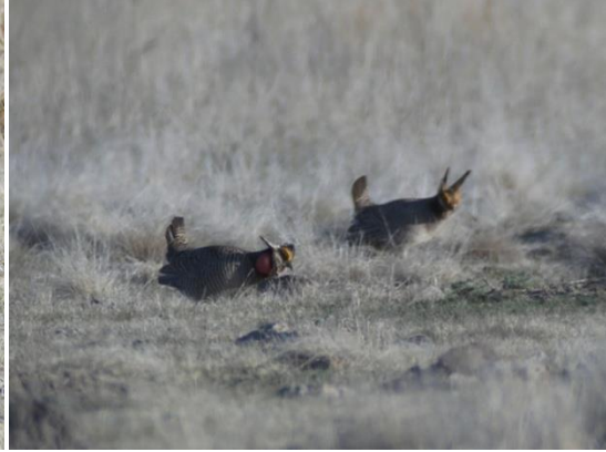
Both no lifers but good to see again, Greater left, Lesser right.