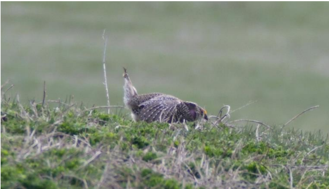
Not a lifer but never seen in display.

spread out. Great scope views of displaying males in there typical “toybird like” way.