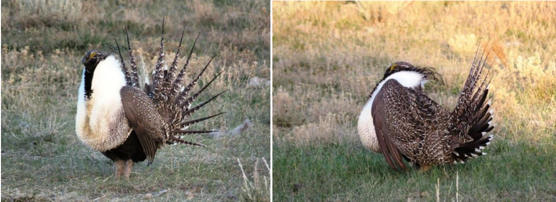
Speechless after this spectacle.....