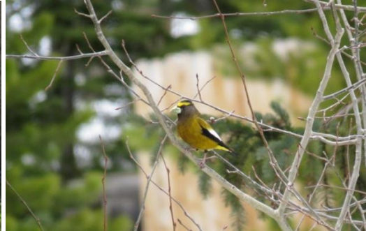
Nice Cassin's Finches and Evening Grosbeaks were encountered