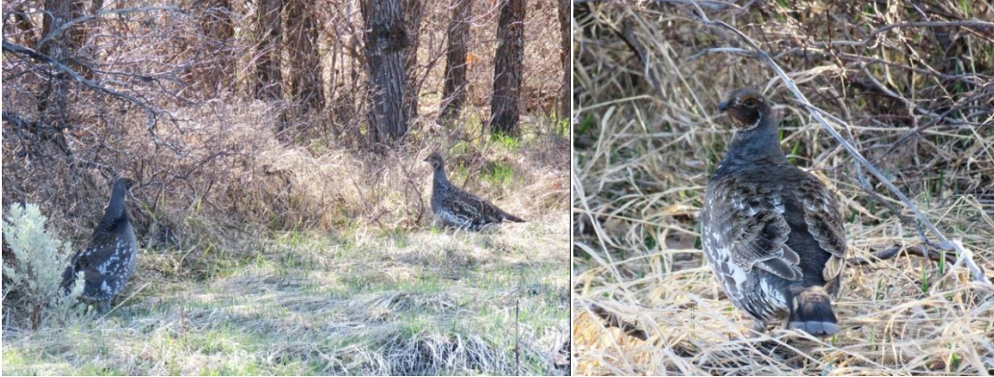
A nice pair and a solitaire male, stole the show...

and a female, at Black Canyon. No display was seen but one time it raised its neck feathers showing its naked skin.