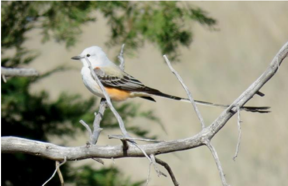
Rare so far north and quite early in the year.

1 ex. was a surprise bird along the way in Kansas.