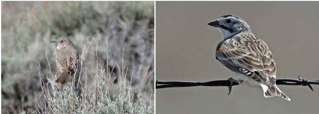
Sage Thrasher at the Great Sand Dunes was less exciting as a male McCown’s Longspur at the Pawnee Grasslands

A total of 8 birds present in the visited sage habitat. Often in song, great to see this small thrasher singing in top of the sage.