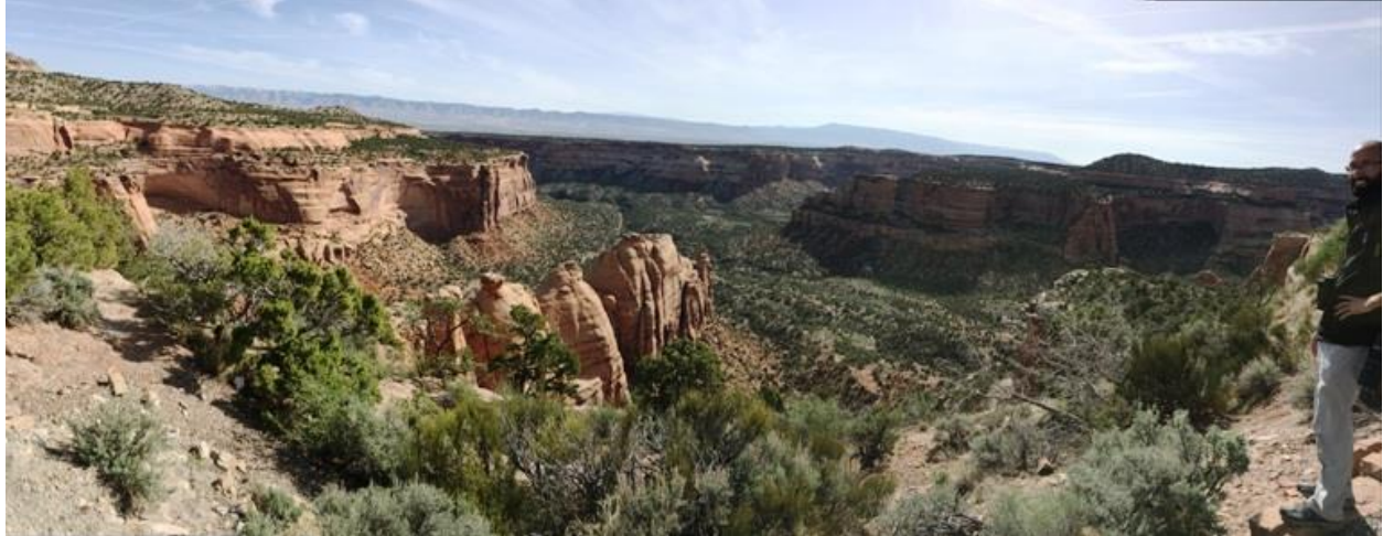
Cory, on the right...:-)

On this trip the weather was good with almost no rain, mostly sunny with (dry) temperatures above the 20 C but often wind, which gave a bit of a problem with finding passerines but for the rest very good birding