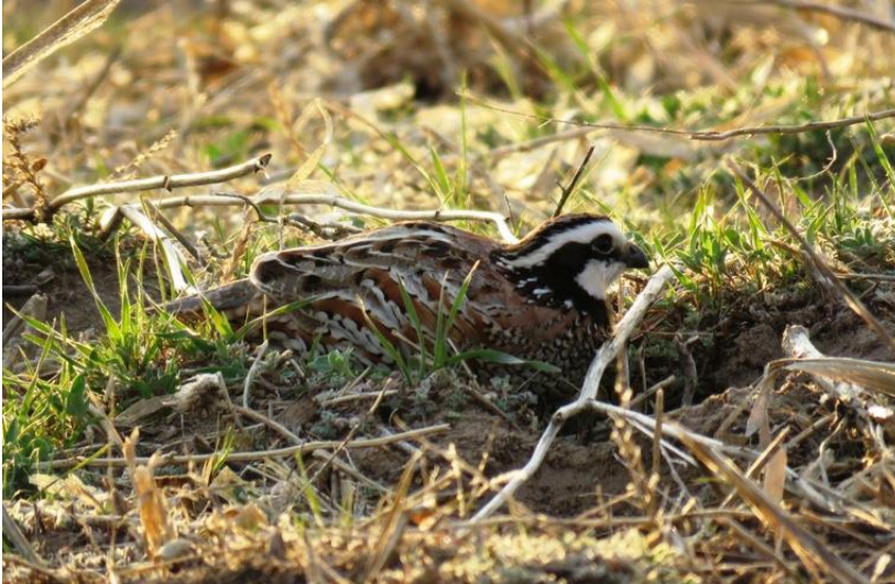
Often seen but not often so well

2 ex. seen well going out of the Bledsoe Cattle