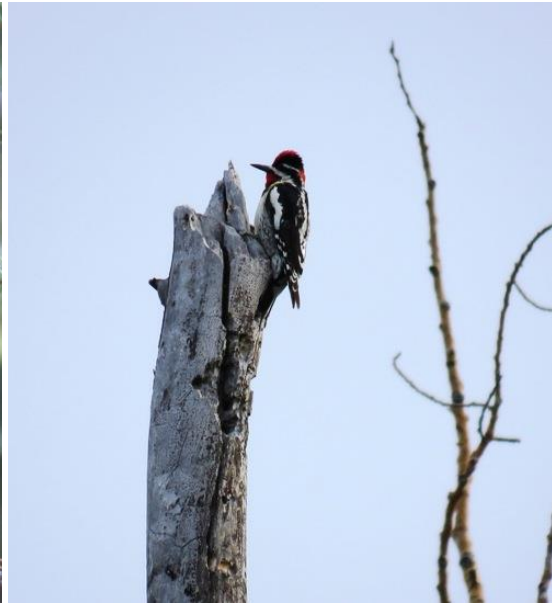
Williamson's and Red-Naped Sapsuckers.