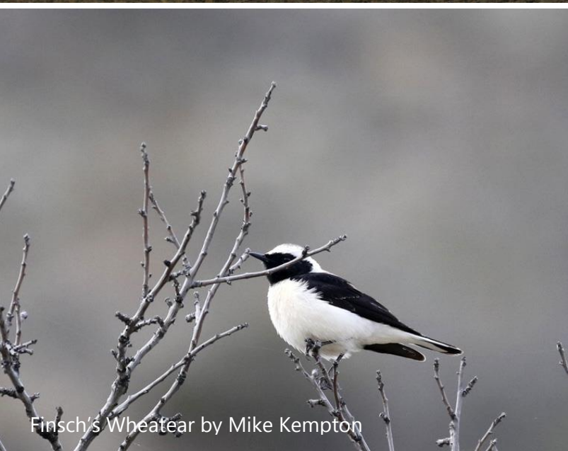
Finsch's Wheatear