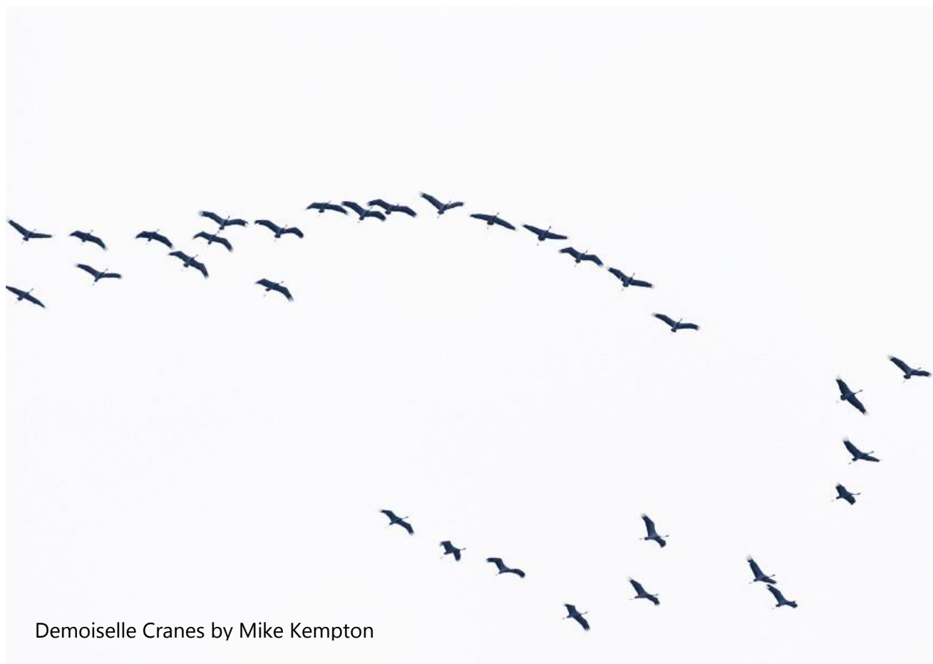
Demoiselle Cranes by Mike Kempton

Our last day took us further south to the place called David Gareji monastery. This is a country's one of the most remarkable hotspots along the border with Azerbaijan. The barren landscapes here got just incredible views, hosting some of the rich birdlife. The way to the monastery took us through the town Rustavi, with some of the common species seen on a drive, such as Barn Swallows, Collared Doves, Common Starlings, etc. We were keeping on driving when Mike and Christian spotted a flock of large wings in the sky. We stopped immediately... right in the middle of the road, looked up and saw the flock of 81 Demoiselle Cranes heavily flapping wings above our heads. Incredible luck!