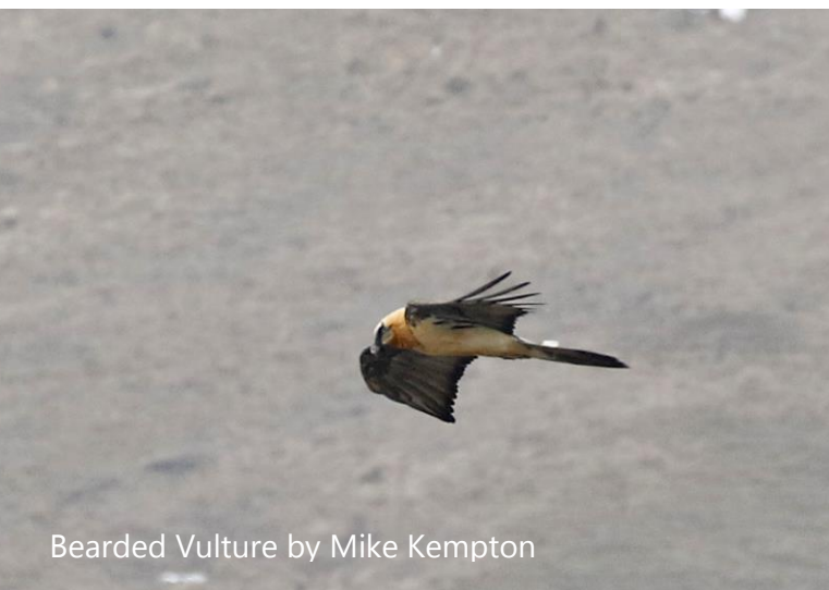
Bearded Vulture by Mike Kempton