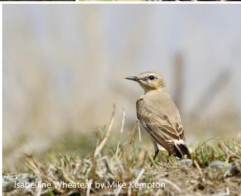
Isabelline Wheatear