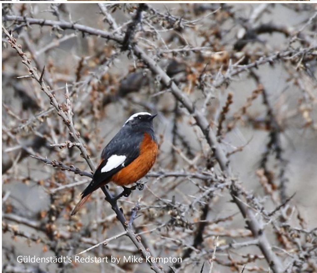
Güldenstädt's Redstart