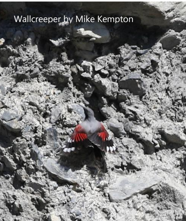
Wallcreeper