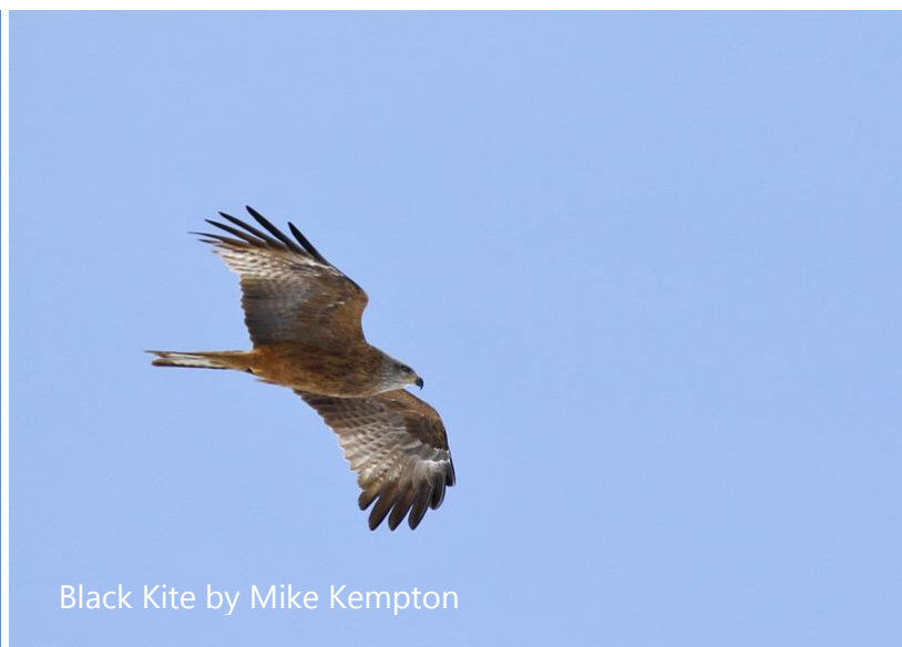
Black Kite