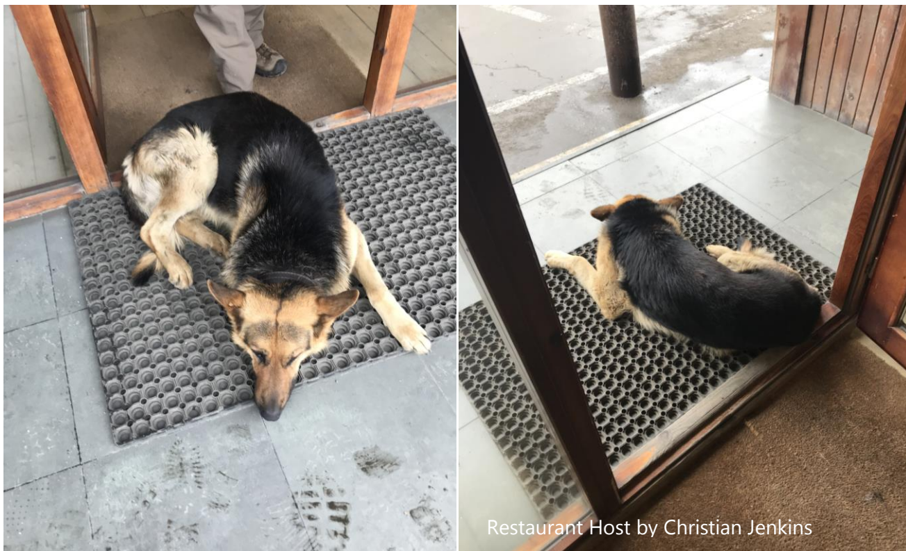
Restaurant Host

This friendly dog was welcoming us every day at the restaurant entry 😊