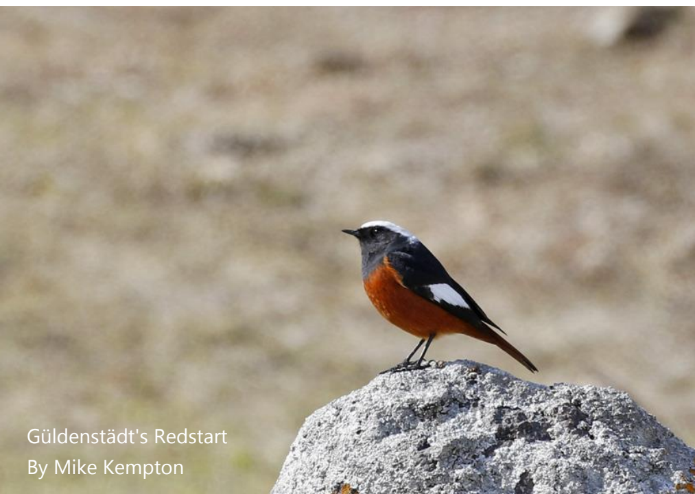
Güldenstädt's Redstart