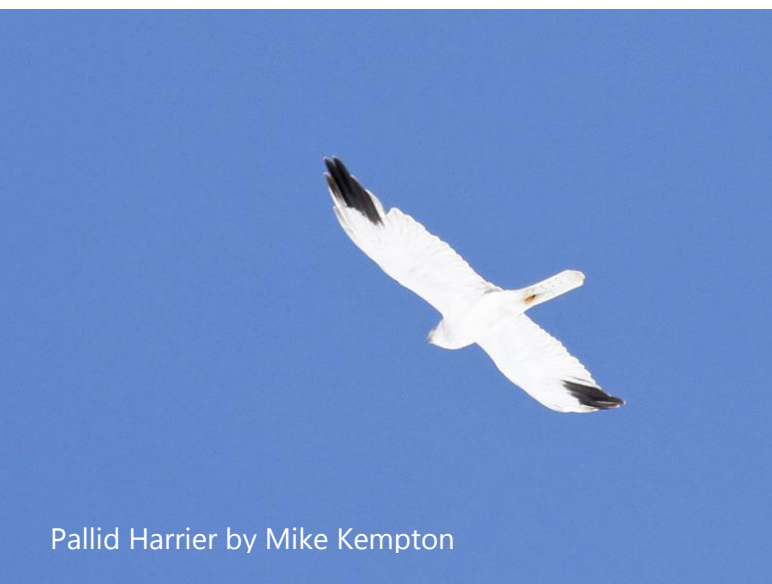
Pallid Harrier