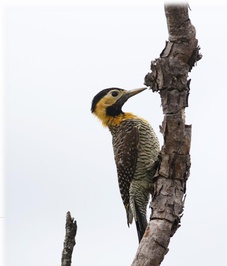
Campo Flicker Colaptes campestris Fazenda Agua Limpa

On our drive across to Paracatu we stopped off at a recently developed reservoir (-17.034748, -47.168299) where we had our first encounters with many wetland species; Muscovy Duck , White-faced Whistling Duck and Masked Water Tyrant . Unfortunately most of the birds were very distant from our roadside vantage point; a scope would have been extremely useful at this point. Most of the birds we saw here would have been easy to see at any wetland area.