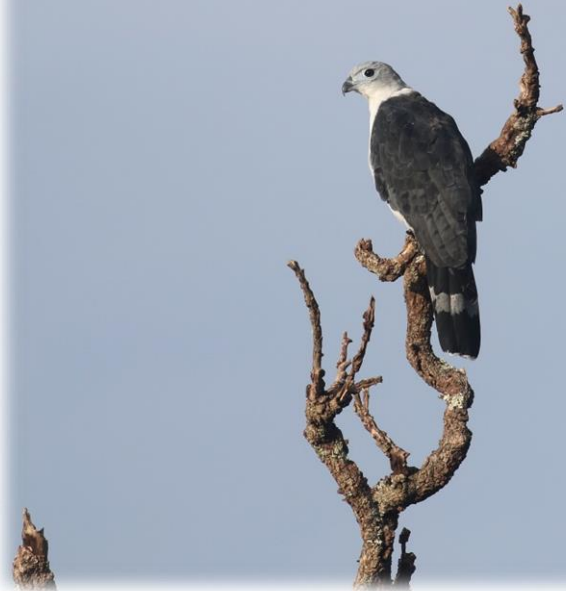
Gray-headed Kite Leptodon cayanensis Fazenda Agua Limpa

Faza de Agua Limpa: Undulated Tinamou, Brazilian Teal, Rusty-margined Guan, Black-crowned Night-Heron, Cattle Egret, Great White Egret, Whistling Heron, Capped Heron, Green Ibis, Buff-necked Ibis, Turkey Vulture, Black Vulture, King Vulture, Gray-headed Kite, Pearl Kite, White-tailed Kite, Plumbeous Kite, Bicolored Hawk, Roadside Hawk, White-tailed Hawk, Short-tailed Hawk, Southern Caracara, Yellow-headed Caracara, Collared Forest-Falcon, American Kestrel, Aplomado Falcon, Gray-necked Wood-Rail, Red-legged Seriema, Southern Lapwing, Ruddy Ground-Dove, Scaled Dove, Blue Ground-Dove, Rock Dove, Picazuro Pigeon, Pale-vented Pigeon, Eared Dove, Gray-fronted Dove, Blue-and-yellow Macaw, White-eyed Parakeet, Peach-fronted Parakeet, Blue-winged Parrotlet, Yellow-chevroned Parakeet, Yellow-faced Amazon Parrot, Turquoise-fronted Amazon Parrot, Squirrel Cuckoo, Smooth-billed Ani, Guira Cuckoo, Barn Owl, Tropical Screech-Owl, Burrowing Owl, Common Potoo, Pauraque, Little Nightjar, Scissor-tailed Nightjar, Sick's Swift, Fork-tailed Palm-Swift, Swallow-tailed Hummingbird, White-vented Violet-ear, Fork-tailed Woodnymph, Glittering-throated Emerald, Amethyst Woodstar, Ringed Kingfisher, Rufous-capped Motmot, Rufous-tailed Jacamar, Spot-backed Puffbird, Toco Toucan, Channel-billed Toucan, Chestnut-