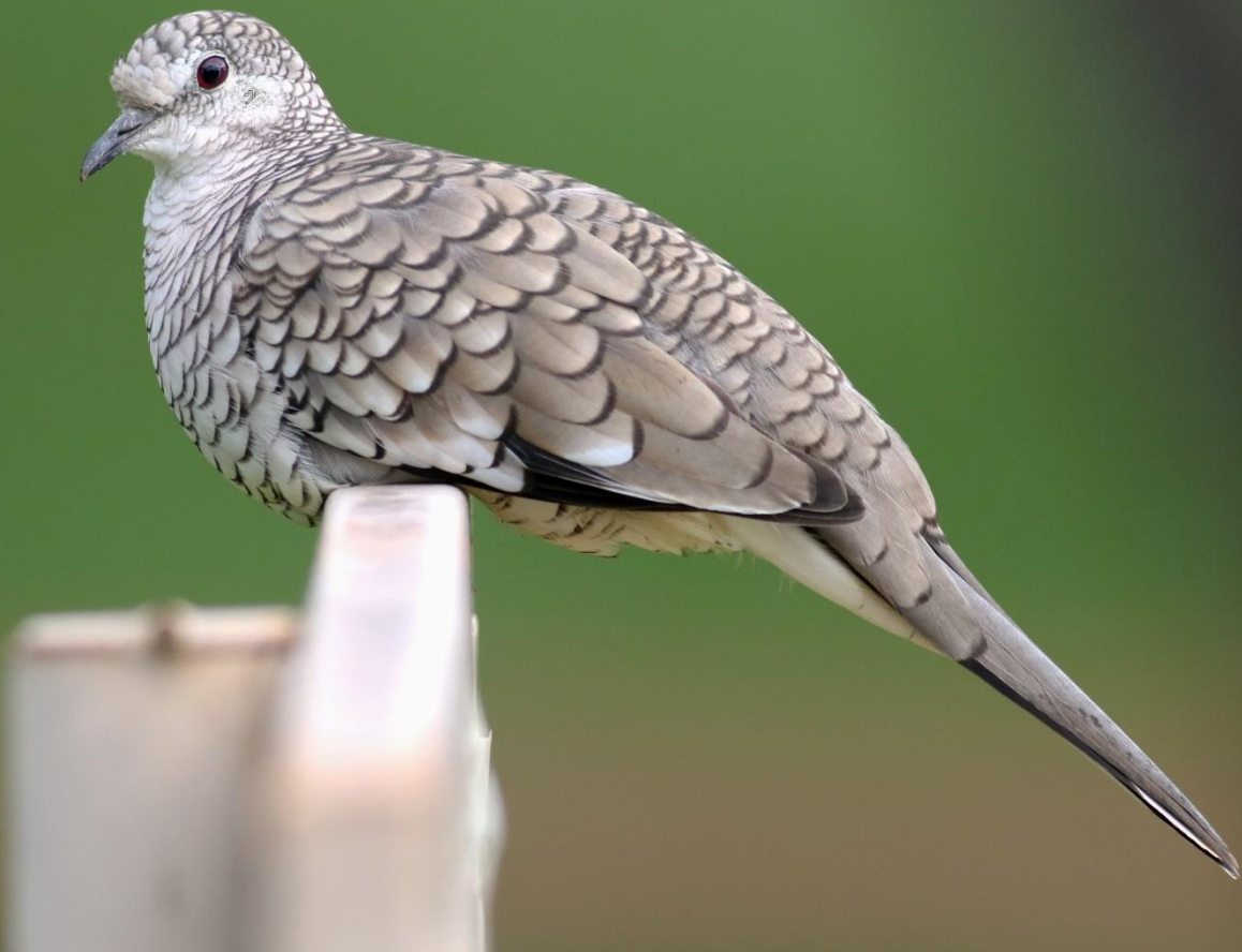
Scaled Dove Columbina squammata Botanical Garden