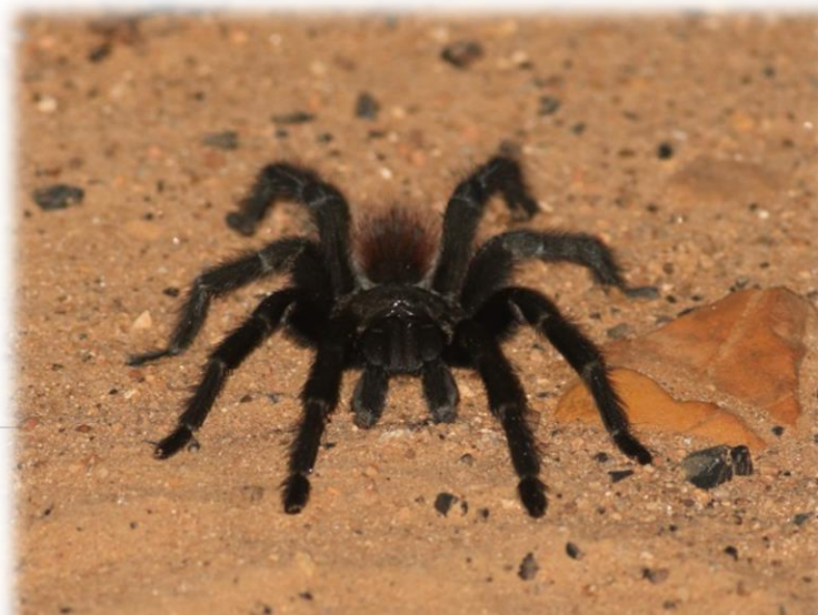
Avicularia sp. Terra Ronca

Rodovia DF-330: Whistling Heron, Buff-necked Ibis, Picazuro Pigeon, Scaled Dove, Swallow-tailed Hummingbird, Checkered Woodpecker, Rufous-fronted Thornbird, Suiriri Flycatcher, Chalk-browed Mockingbird, Shrike-like Tanager, Blue-black Grassquit,