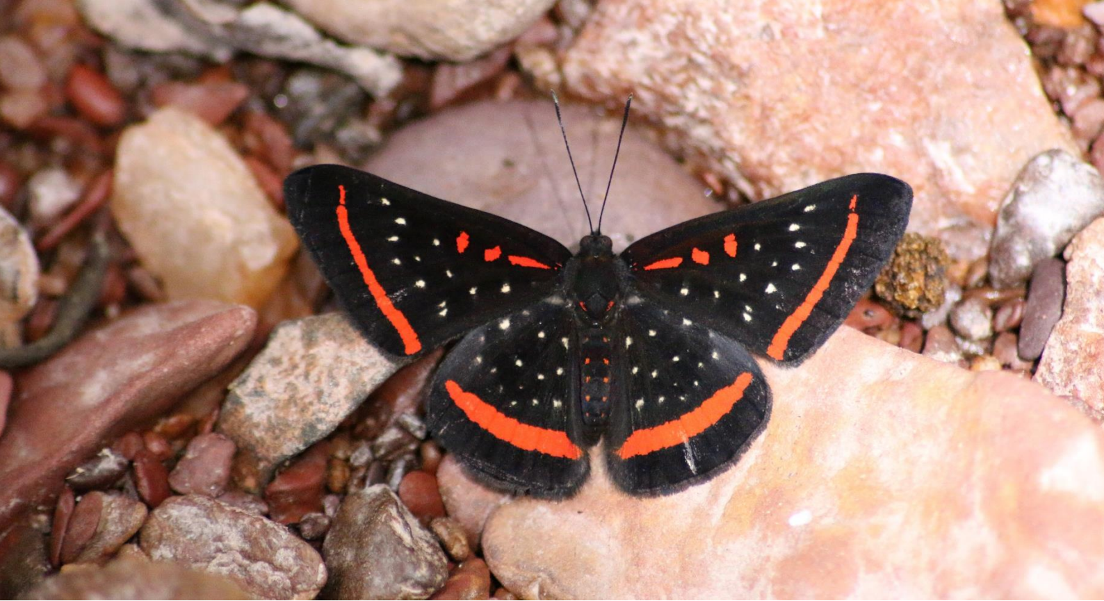
Red-barred Amarynthys Amarynthys meneria Fazenda Agua Limpa