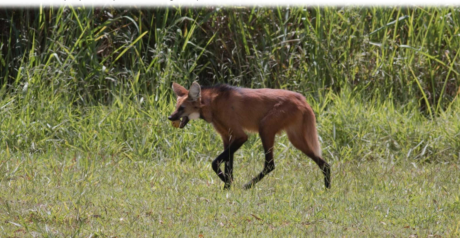
Maned Wolf Chrysocyon brachyurus Fazenda Agua Limpa

The variation within the Cerrado habitat, as well as the dense gallery forest and sizable river below meant a much wider variety of species that could be found here. Cerrado specialities such as Cinereous Warbler Finch , Sharp-tailed Grass Tyrant , Blue Finch (-15.847274, -47.729842), Horned Sungem (-15.842645, -47.716690) and Ocellated Crike were all seen at various points here. Playback was used for all the above species, to ensure that we saw them.