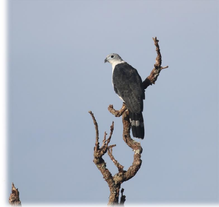
Gray-headed Kite Leptodon cayanensis Fazenda Agua Limpa

Faza de Agua Limpa: Undulated Tinamou, Brazilian Teal, Rusty-margined Guan, Black-crowned Night-Heron, Cattle Egret, Great White Egret, Whistling Heron, Capped Heron, Green Ibis, Buff-necked Ibis, Turkey Vulture, Black Vulture, King Vulture, Gray-headed Kite, Pearl Kite, White-tailed Kite, Plumbeous Kite, Bicolored Hawk, Roadside Hawk, White-tailed Hawk, Short-tailed Hawk, Southern Caracara, Yellow-headed Caracara, Collared Forest-Falcon, American Kestrel, Aplomado Falcon, Gray-necked Wood-Rail, Red-legged Seriema, Southern Lapwing, Ruddy Ground-Dove, Scaled Dove, Blue Ground-Dove, Rock Dove, Picazuro Pigeon, Pale-vented Pigeon, Eared Dove, Gray-fronted Dove, Blue-and-yellow Macaw, White-eyed Parakeet, Peach-fronted Parakeet, Blue-winged Parrotlet, Yellow-chevroned Parakeet, Yellow-faced Amazon Parrot, Turquoise-fronted Amazon Parrot, Squirrel Cuckoo, Smooth-billed Ani, Guira Cuckoo, Barn Owl, Tropical Screech-Owl, Burrowing Owl, Common Potoo, Pauraque, Little Nightjar, Scissor-tailed Nightjar, Sick's Swift, Fork-tailed Palm-Swift, Swallow-tailed Hummingbird, White-vented Violet-ear, Fork-tailed Woodnymph, Glittering-throated Emerald, Amethyst Woodstar, Ringed Kingfisher, Rufous-capped Motmot, Rufous-tailed Jacamar, Spot-backed Puffbird, Toco Toucan, Channel-billed Toucan, Chestnut-