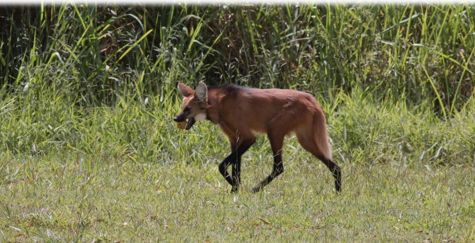
Maned Wolf Chrysocyon brachyurus Fazenda Agua Limpa

The variation within the Cerrado habitat, as well as the dense gallery forest and sizable river below meant a much wider variety of species that could be found here. Cerrado specialities such as Cinereous Warbler Finch , Sharp-tailed Grass Tyrant , Blue Finch (-15.847274, -47.729842), Horned Sungem (-15.842645, -47.716690) and Ocellated Crake were all seen at various points here. Playback was used for all the above species, to ensure that we saw them.