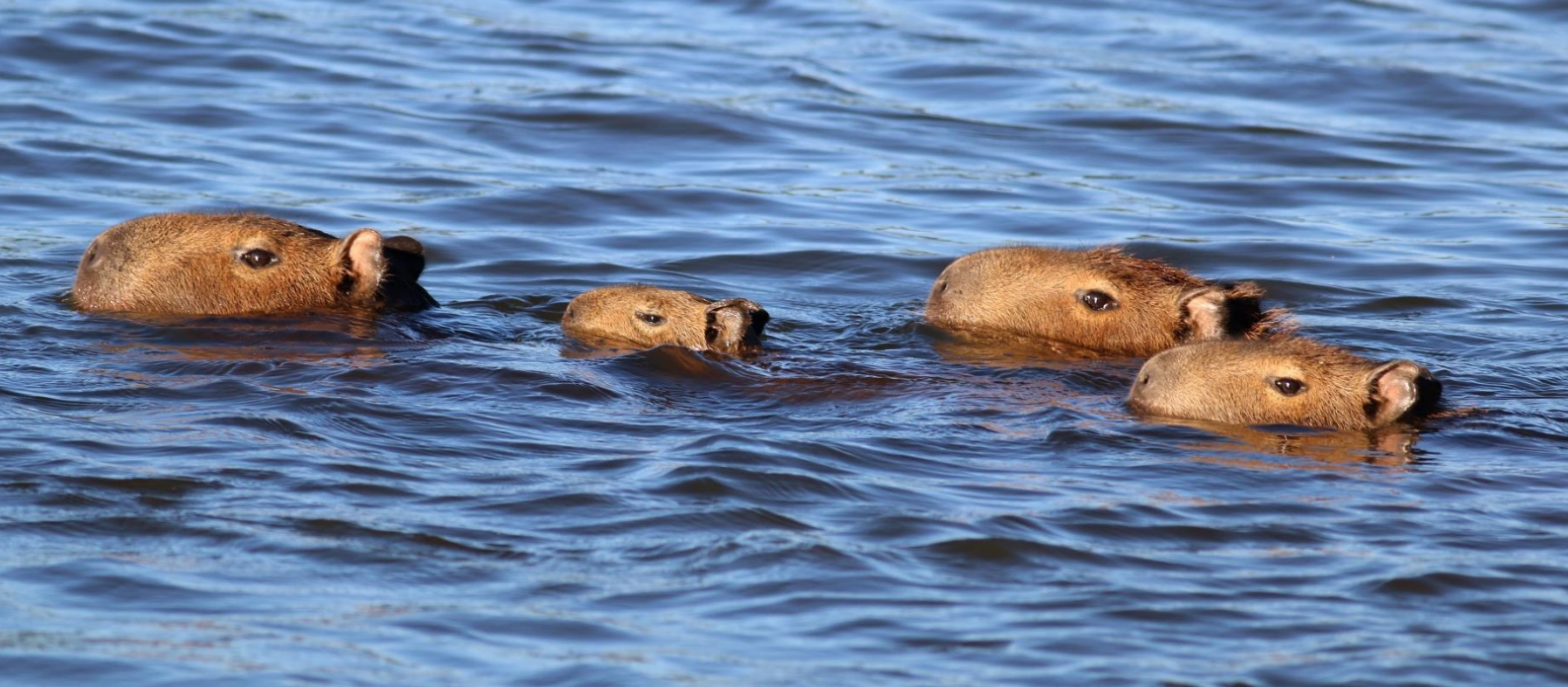
Capybara Hydrochoerus hydrochaeris Fazenda Agua Limpa

Most of the birding we did around Brasilia was at the same location that we were staying, the Fazenda Agua Limpa Protected Area. However, we did visit other sites to target species more local to this region and these sites are more likely to be useful to visiting birders