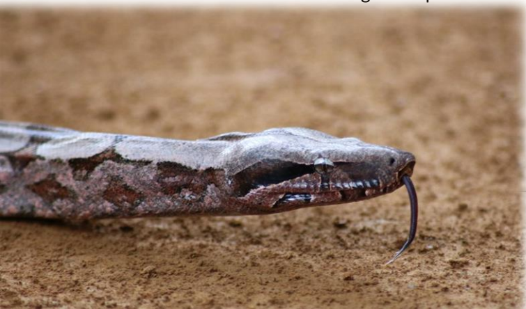
Boa Constrictor Boa constrictor Fazenda Agua Limpa

Playback was an extremely useful tool throughout the trip, and many species we only saw because we utilized playback. Birds respond quickly to Tropical Pygmy Owl call, often drawing in large mixed flocks of birds.