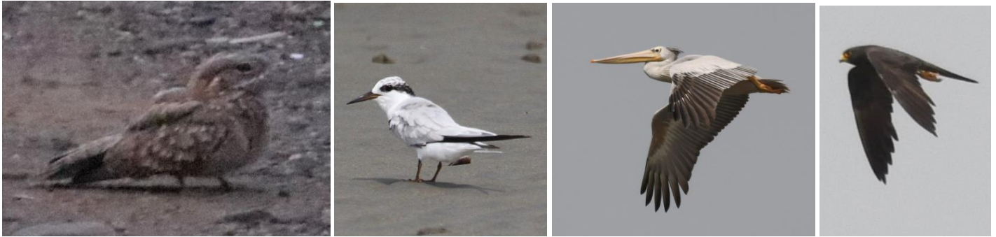
Al Saad Lake & Jizan – Nubian Nighthjar (SL), Saunders's Tern (OC), Pink-backed Pelican (DDL), Sooty Falcon (DDL)

We also took in the track running north at 17.020035, 42.986117 , which leads down to the lake. This might well be an ok place to scan the lake but we visited just before dusk to mainly try for Nightjars . We got very lucky with Nubian , a male appearing on the track to mob a cat in the half-light but had very poor views only of what was probably Plain . Both species were heard singing but not a lot and did not seem very active, despite the humid, buggy conditions. Almost 100 Abdim's Storks were in the area, mostly coming to roost on pylons a short way east of the track along the main road.