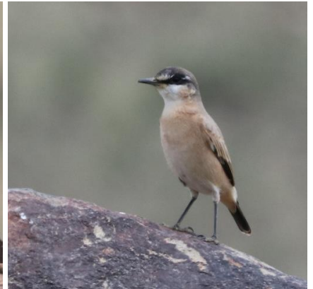
Wadi Reema: White-throated Robin (DDL), Rufous-capped Lark (SL), Red-breasted Wheatear (SL)

E Al Habalah ( 18.047422, 42.842344 is the Rufous-capped lark hotspot). This site of barren, rocky hills very rapidly produced lots of Rufous-capped Larks , in complete contrast to a 2–3hr search in spring. Birds were at the pin linked above, singing and feeding happily amongst the hundreds of families out with picnics. We also visited the escarpment edge by the old village itself (at about 18.027314, 42.875285 ; a site for Yemen Serin, at least sometimes) but soon departed, on account of the enormous numbers of visitors and thick mist that was billowing up over the rift below. An early morning visit could solve both these problems. Other species seen included the only Brown-necked Ravens of the trip and the fairly common Arabian Wheatear . En-route, we stopped at some nice looking fields at 18.090011, 42.850162 ; the roadside bushes here yielded Gambaga Flycatcher (right – OC)