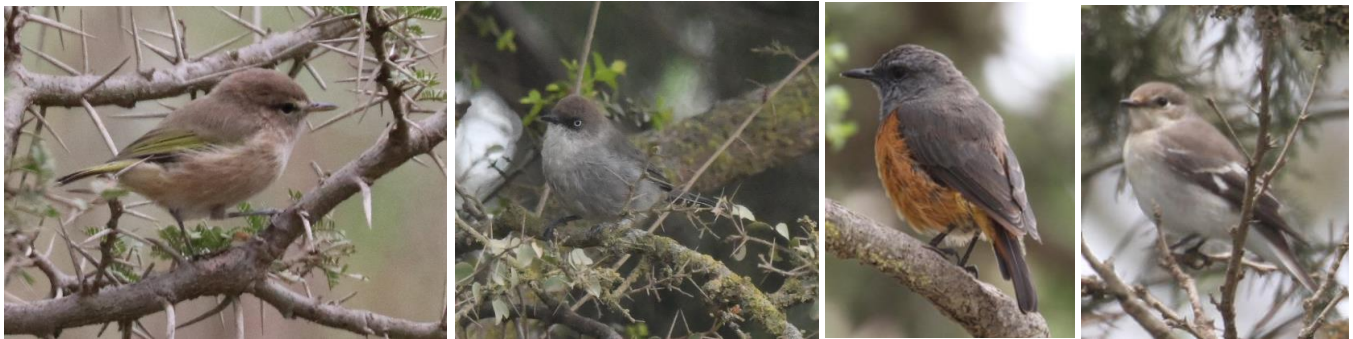
Mehfar Pak – Brown-Woodland-Warbler (SL), Yemen Warbler (DDL), Little Rock Thrush (OC), Semi-collared Flycatcher (OC)

B Mehfar Park 18.963716, 42.131463 and Al Wahdah Woods 18.957333, 42.144595 . These two similar and nearby sites, comprising open juniper woodland, small fields and lots of rocks, again produced the goods, despite a slow start and lots of mist billowing over the escarpment. Mehfar Park, despite being a bit run down, attracts lots of families to picnic; going here late afternoon in tourist season is not advisable; it was getting busy when we left (c1330). Al Wahdah was very quiet, with nobody about on our visit. Our notable species here included, at Mehfar, Brown Woodland and Yemen Warblers , Semi-collared Flycatcher (the only one of the trip; sparring with Gambaga !) and Yemen Serin (again, the only ones of the trip; this species is scarce – be sure to check all 'Arabian' Serins, especially if they are in the vicinity of large boulders). At Al Wahdah, we there was the trip's sole African Shikra , plus Arabian Woodpecker , Arabian Partridge calling distantly and a lot of Yemen Linnets ( right, SL ).