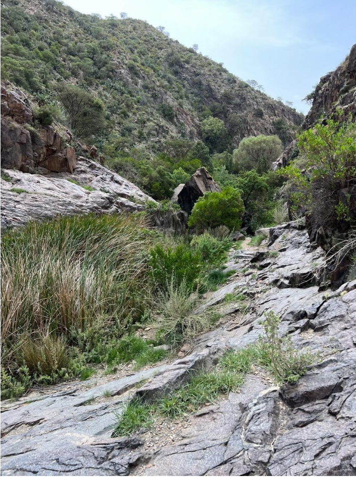
Superlative SW KSA scenery; clockwise from top right – Al Soudah Waterfall, Marabah Dam, Al Mehfar Park, Wadi Shanaka (all DDL)