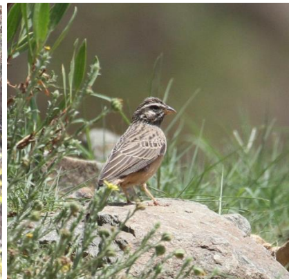
Abha Dam & Soudah Waterfall: Hamerkop (DDL), Arabian Eagle Owl (OC), African Stonechat (OC), Arabian Partridge (OC), Cinnamon-breasted Bunting (OC)