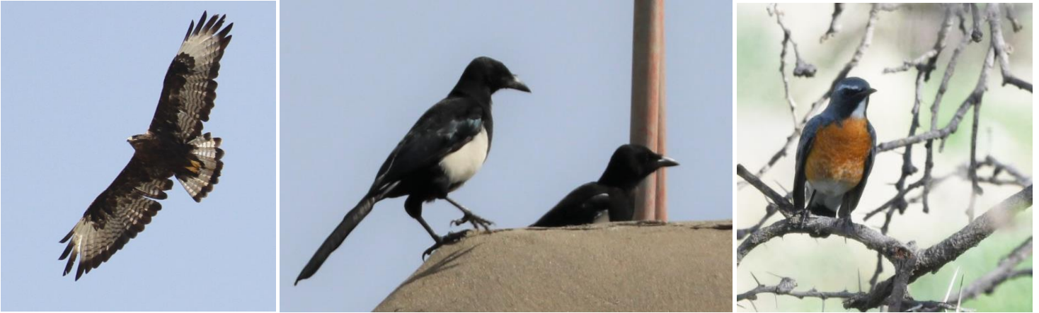
Wadi Danah – Long-legged Buzzard (OC), Asir Magpie (SL), White-throated Robin (DDL)

A Wadi Danah As before, we parked at 18.900485, 42.205118 and walked down the slope, to cross the bridge and up the other side for c1.5 km or so. This wonderful place was great fun in March and great fun again in August, were all the key birds were soon on show, despite a relatively late arrival (we were on the job by 0830). The star cast comprised Philby's Partridge (seen on right hand side about 200m above the bridge), Asir Magpie (heard calling, and eventually seen, perching on the buildings where we parked the car) and the first Arabian Woodpecker of the trip, flying in and perching near the start of the walk. The back-up cast included Brown Woodland Warbler and the only Long-legged Buzzard (two) and Red-backed Shrike of the trip, amongst a ton of other good stuff. After this we proceeded about 1 km further up-wadi, to some grassy fields where Arabian Pipit was display-flighting and, eventually, seen quite well on the ground.