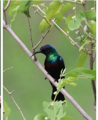
Marabah Dam, Rojal Alma'a & Wadi Shanaka – White-throated Bee-eater (OC), African Grey Hornbill (OC), Grey-headed Kingfisher (OC), Shining Sunbird (SL)

H Marabah Dam (easily accessed from Abha to Jizan road, 1hr downhill from Abha). Turn off the highway at 17.891007, 42.383906 and follow the graded gravel track round the south side of the dam, and up the wadi beyond – we went c7 km from the main road in total; the road was fine – with care – even for saloon cars to at least there. But if it starts raining heavily, get out quick, least rockslide closes the road by the dam. We made two visits here, first at dawn travelling to Jazan and at dusk the following day on the way back. As for Rojal Alma'a, this is an accessible place to reach some Tihama foothill habitat and the road can be followed for an awful lot further than we went, with good habitat and birding all the way (see March / April 2022 trip report ). The dam itself had very much more water (and a lot fewer birds) than in spring but the wide wadi running upstream was interesting. White-throated Bee-eater was a big deal at the time (although they are common on the Tihama; we saw loads; sorry about that, Ted!); we also enjoyed Pied Cuckoo (at the very start), White-browed Coucal (common on voice), Little Bittern , Bonelli's Eagle , a flyby African Grey Hornbill , Arabian and Upcher's Warblers and Nile Valley Sunbird (pretty common from here onwards towards the coast).