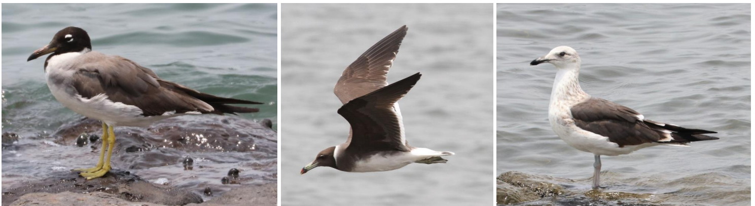
Jizan North Corniche Park – White-eyed Gull (SL), Sooty Gull (OC), Baltic Gull (OC)

E Jizan North Corniche Park Again, the centre of the park at 16.917386, 42.548719 was the place to concentrate on for both gulls and migrants. This was visited at the end of a hot morning but White-eyed Gull were no problem at all. Indeed, they were much more numerous than earlier in the spring, with almost 300 seen, albeit none being breeding adults. Amongst the White-eyed Gulls we also had some interesting first-cycle Baltic Gulls , whilst the Abdim's Storks from April had not gone far and we picked up a few migrants (mainly warblers, including Upcher's ) in the bushes.