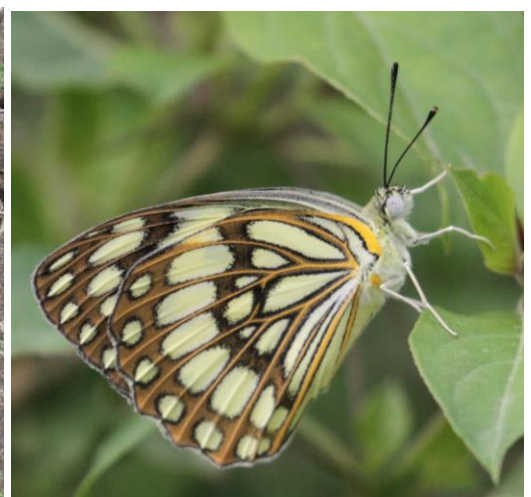
Afrotropical Wadi Shanaka (OC), Rojal Alma'a (OC), Yellow Spendour (OC)