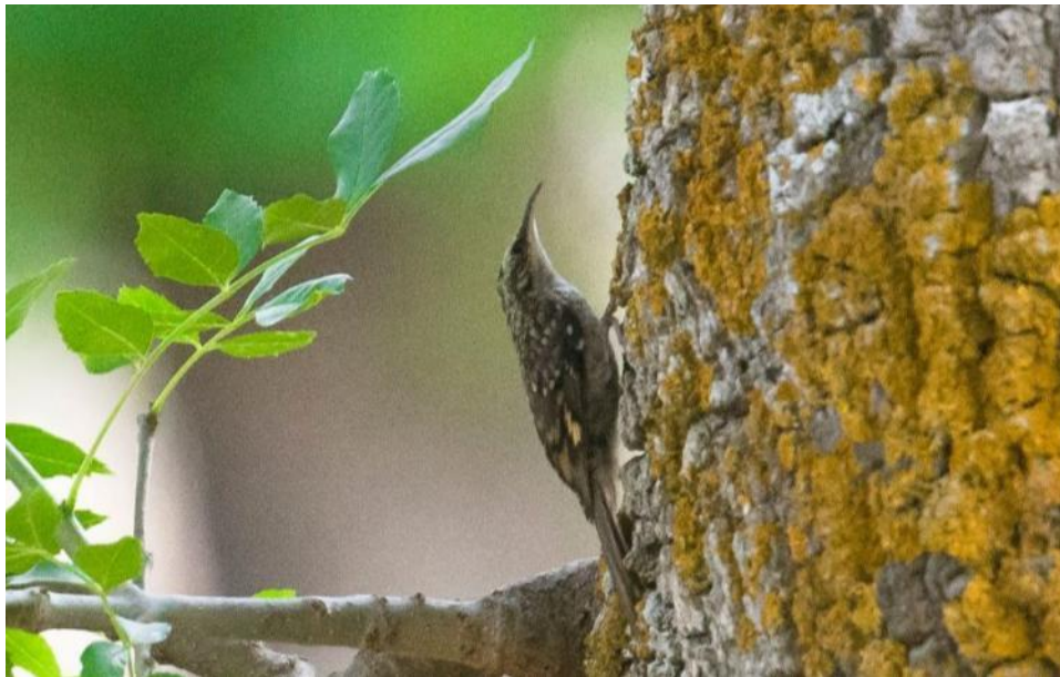
Bert de Bruin