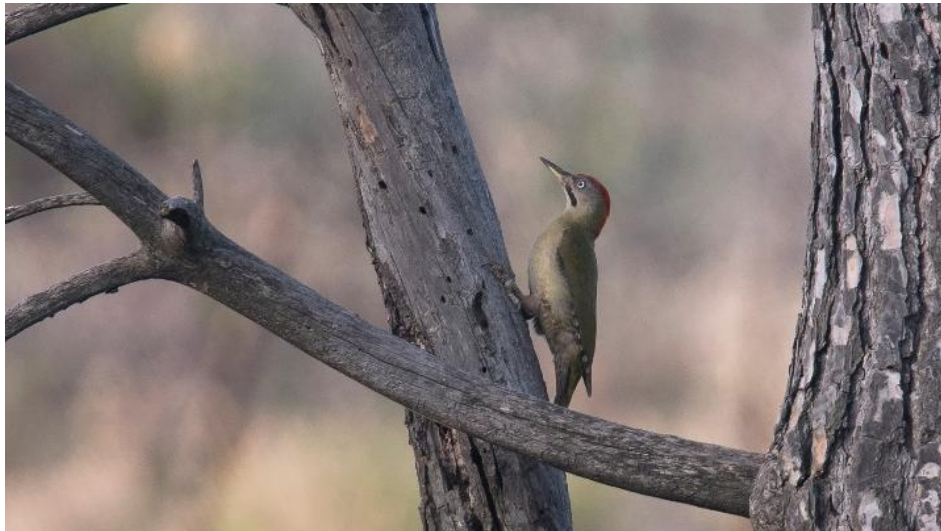
Bert de Bruin