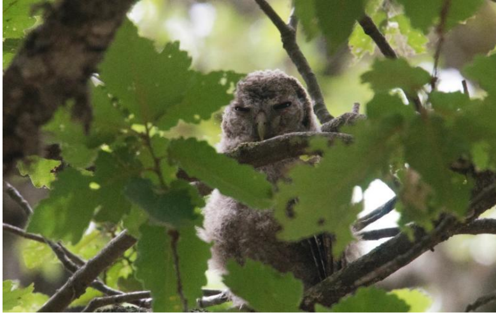
Bert de Bruin