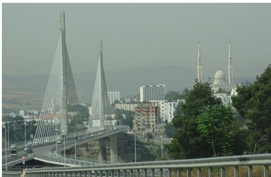
Bridge over the gorge in Constantine