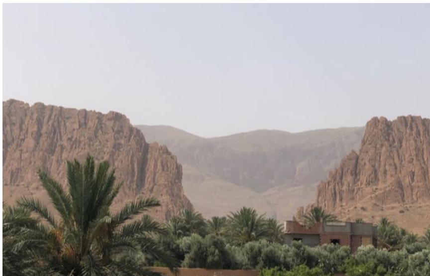
Bert de Bruin