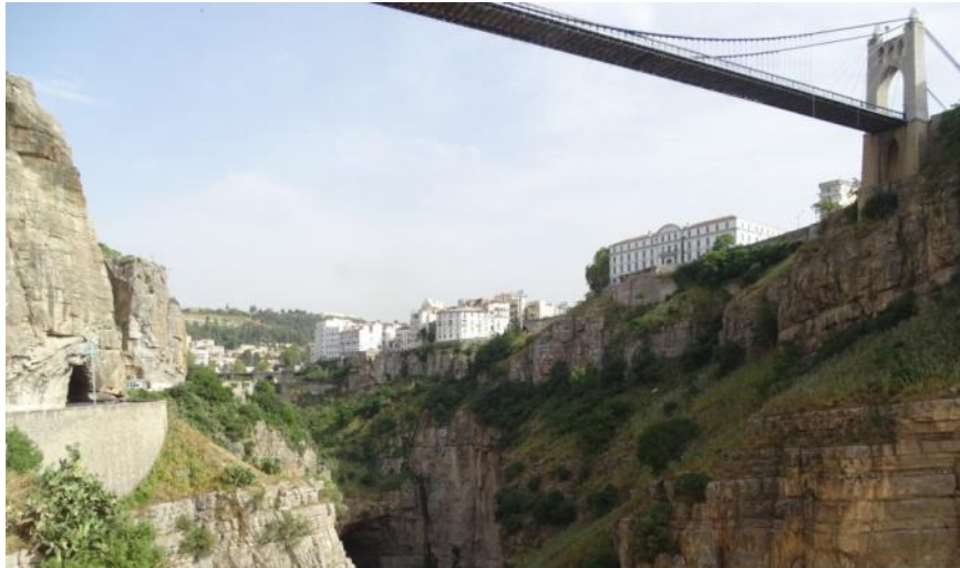
Gorge at Constantine, view to the city