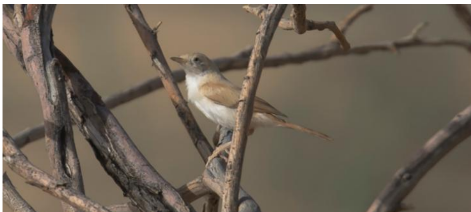
Bert de Bruin

Sylvia deserti 21-06 Nebka Bitam 22-06 Nebka Bitam