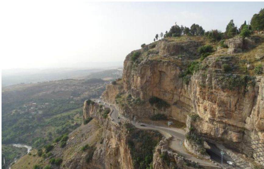
Gorge at Constantine, view to the north