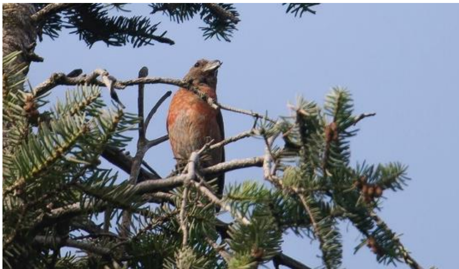
Bert de Bruin

104 Atlas Crossbill Loxia curvirostra poliogyna 1 female type 22-06 Djebel El Ouahch 1 male 23-06 Djebel El Ouahch