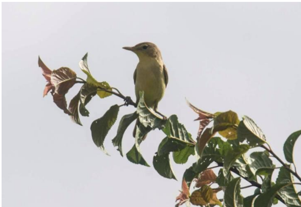
Bert de Bruin

Iduna opaca 20-06 Djimla forest 20-06 El Mellah, Mila 21-06 El Kantra