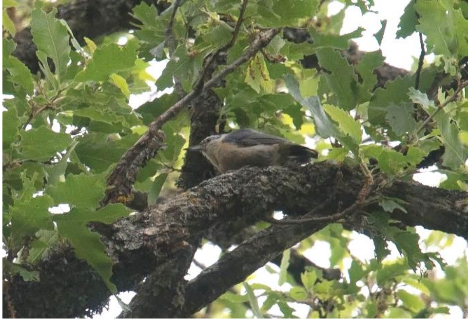
Bert de Bruin