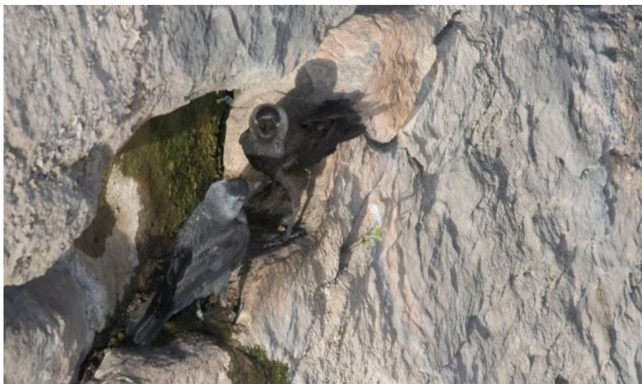
Bert de Bruin