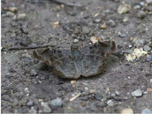
Sappho Bentwing Ebrietas sappho - 1 on 28th between Vallecitos and La Ceiba