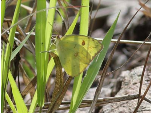
Mimosa Yellow Eurema nise - 1 on 21st at Lake Yojoa; few on 27th El Pizote trail, La Moralla NP