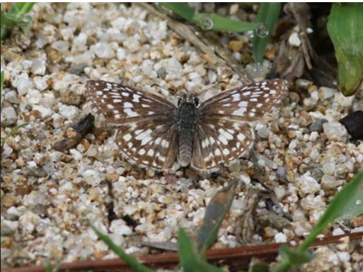
Guatemalan Checkered-skipper Pyrgus adepta - 1 on 27th at El Pizote trail, La Moralla NP