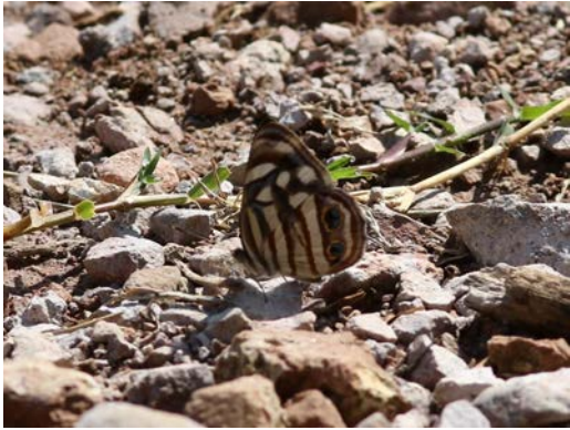
One-spotted Prepona Archaeoprepona demophon - 1 on 30th in mangroves at Cuero y Salado