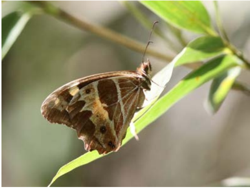
Carolina Satyr Hermeuptychia sosybius - several on 27th by visitor centre at La Moralla NP