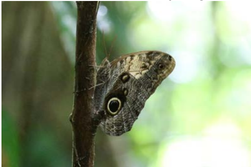
Split-spotted Owl-butterfly Eryphanis lycomedon - 1 on 28th at Pico Bonito Lodge