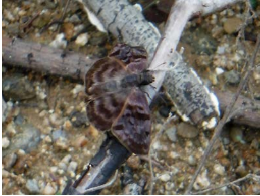
Tropical Checkered-skipper Pyrgus oileus - 1 on 21st at El Cajon dam; 1 on 28th between Vallecitos and La Ceiba