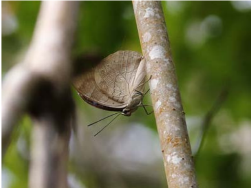
Yellow-fronted Owl-butterfly Caligo telamonius - 1 on 28th at Pico Bonito Lodge