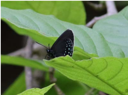
Dusky-blue Groundstreak Calycopis isobeon - 1 on 21st El Cajon dam