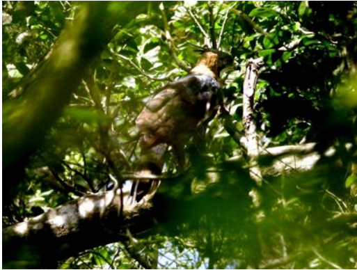
Crane Hawk Geranospiza caerulescens - Calakmul, 3rd June