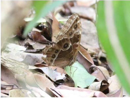
Renata's Satyr Yphthimoides renata - Sijil Noh Há, 4th June (1)