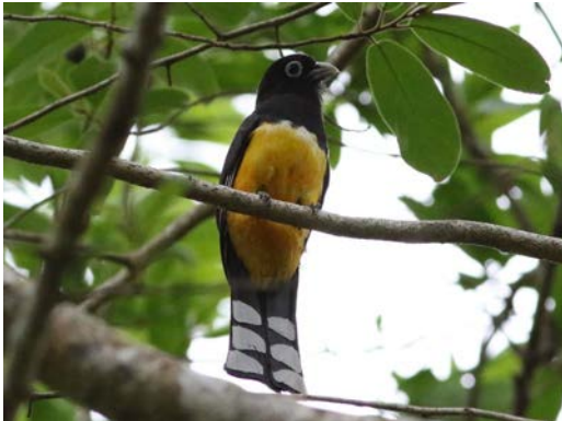
Violaceous (Gartered) Trogon Trogon violaceus - Muyil, 1st June; El Hormiguero, 2nd June