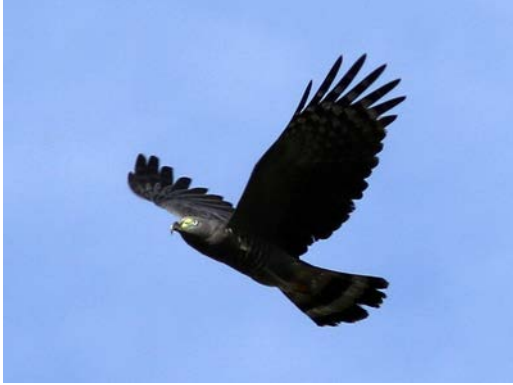
Ornate Hawk-eagle Spizaetus melanoleucus - Síijil Noh Há, 4th June