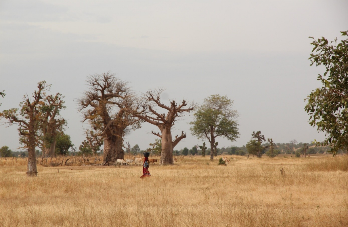
on our way to Podor and Bakel