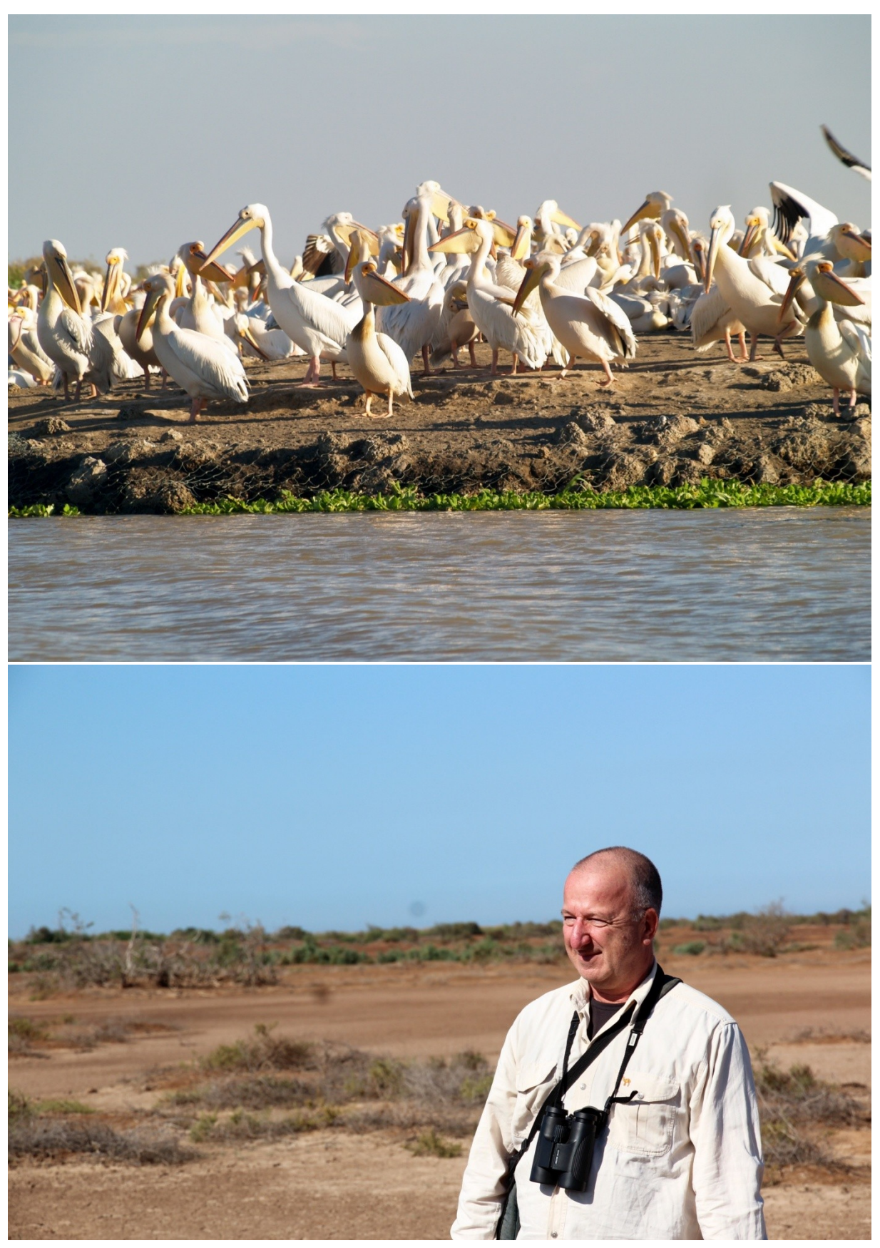
wetland, Pelican colony and semi-desert at Djoudj