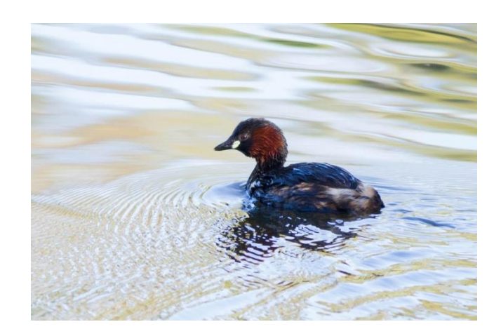
Little Grebe, Lac de Guettar el Aich