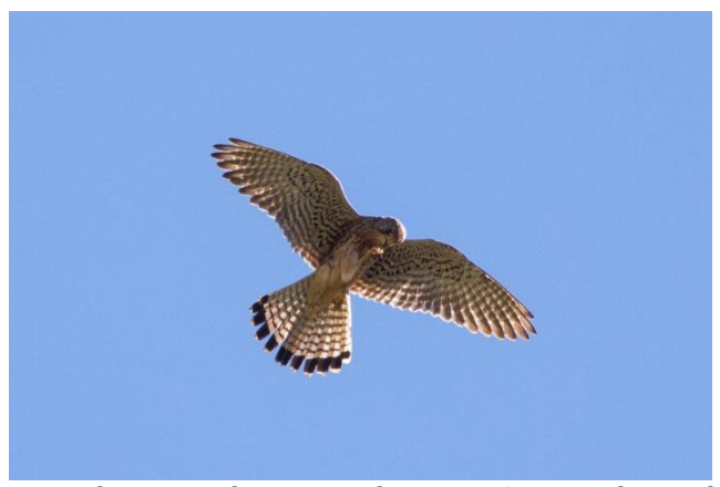
Eurasian Kestrel, en route between Constantine and Djimla