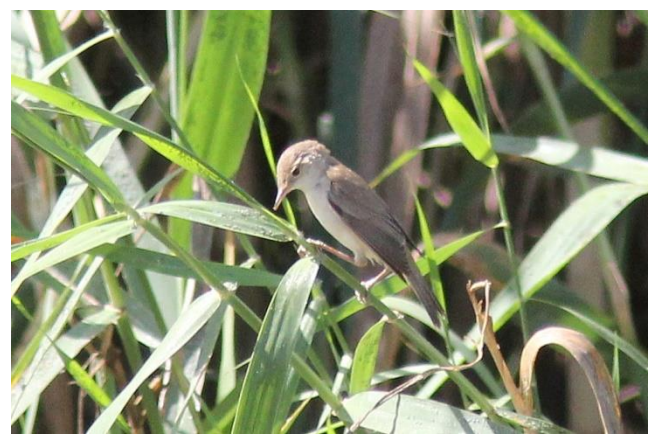
African Reed Warbler, Mechta Mellel