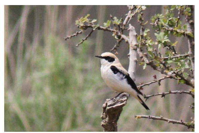
Black-eared Wheatear, en route between Constantine and Djimla

One male seen en route between Constantine and Djimla.