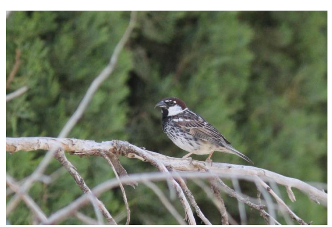
Spanish Sparrow, en route Constantine to Djimla