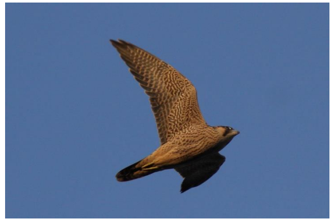
Peregrine Falcon, Gorge du Rhumel