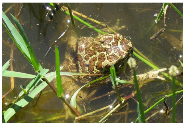
Moorish Toad, Park Djebel el Ouahch