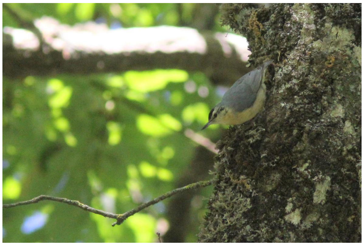
Algerian Nuthatch, Djimla forest