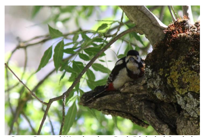
Great Spotted Woodpecker, Park Djebel el Ouahch