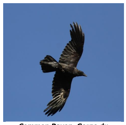
Common Raven, Gorge du Rhumel

Two seen en route between Constantine and Djimla and one heard at Lac de Guettar el Aich.