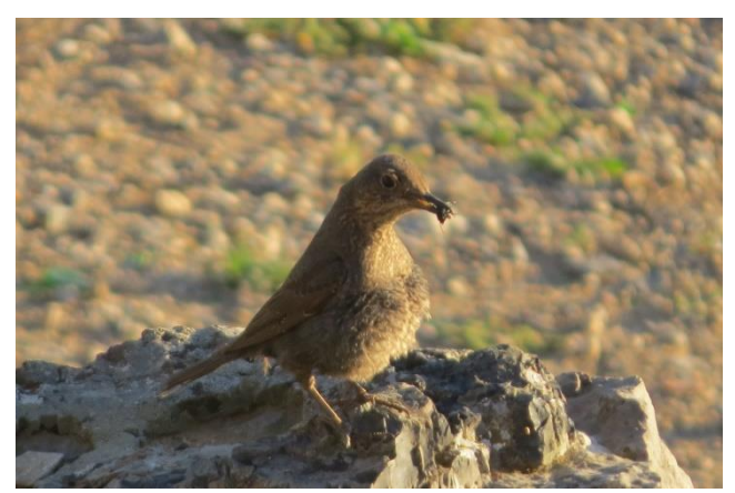
Blue Rock-Thrush, Gorge du Rhumel, Constantine