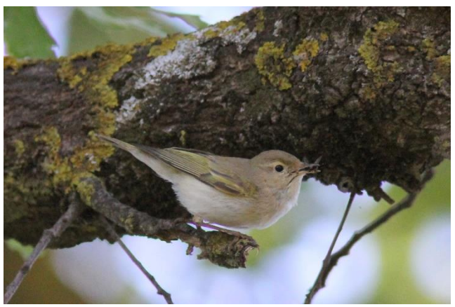
Western Bonelli's Warbler, Park Djebel el Ouahch