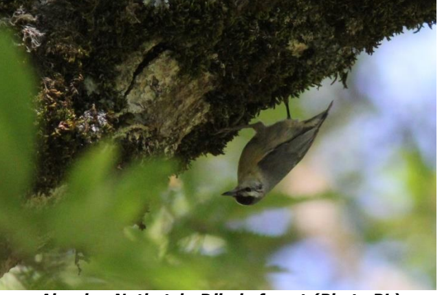
Algerian Nuthatch, Djimla forest