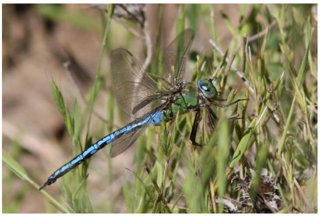
Blue Emperor, Park Djebel el Ouahch

Two seen at Mechta Mellel and five seen in Park Djebel el Ouahch.