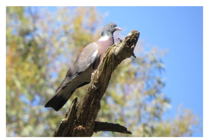
Common Wood-Pigeon, Park Djebel el Ouahch