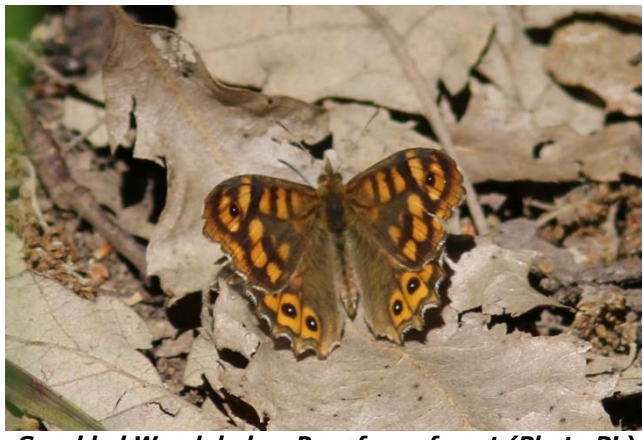
Speckled Wood, below Bouafroun forest