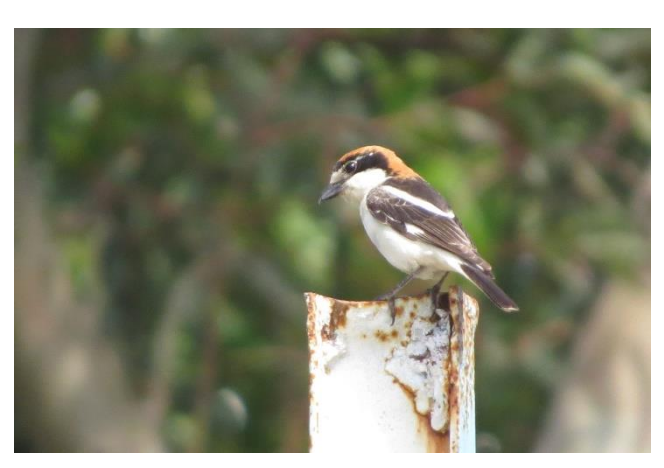
Woodchat Shrike, Mechta Mellel