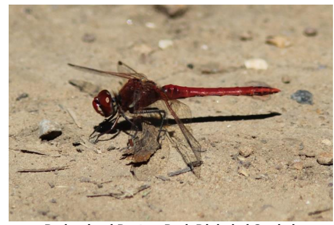
Red-veined Darter, Park Djebel el Ouahch