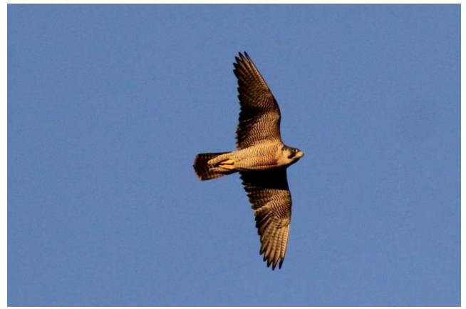
Peregrine Falcon, Gorge du Rhumel

A few seen and more heard in Bouafroun forest.