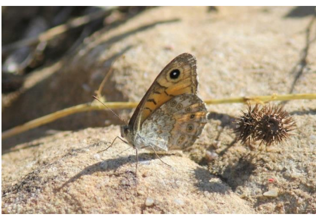
Wall Brown, Mechta Mellel