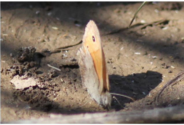
Oriental Meadow Brown, Mechta Mellel