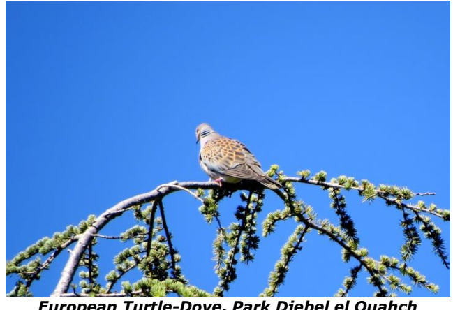
European Turtle-Dove, Park Djebel el Ouahch