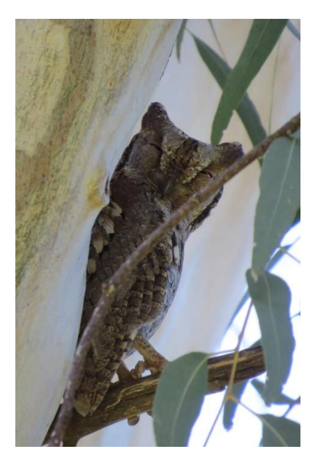
Eurasian Scops-Owl, Park Djebel el Ouahch

Six seen in Bouafroun forest and ten in Park Djebel el Ouahch.