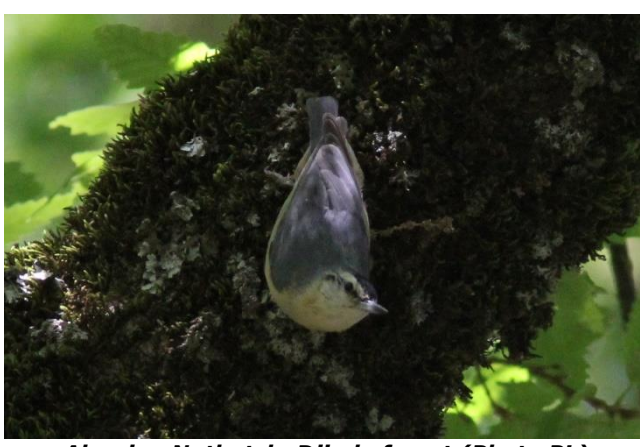
Algerian Nuthatch, Djimla forest