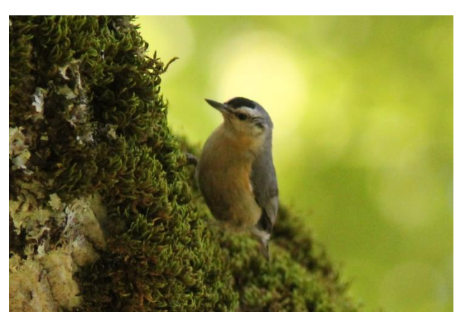
Algerian Nuthatch, Djimla forest