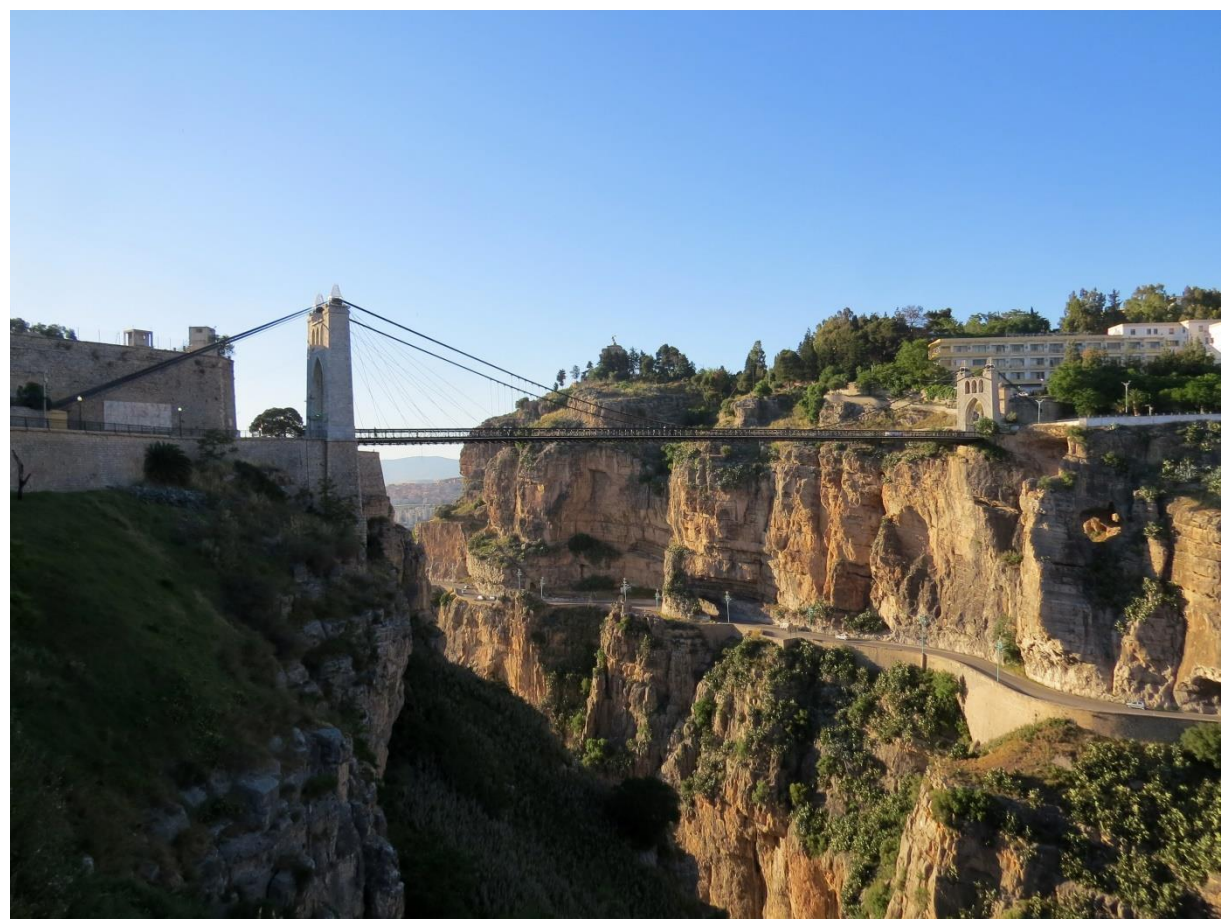
Gorge du Rhumel

Had breakfast at 5.00 hrs. and left our hotel at 5.30 hrs. again, then drove to Lac de Guettar el Aich (20 minutes), where White-headed Duck was a goodie. Three species of Grebe (Little, Eared and Great Crested) and Great Reed-Warbler are also noteworthy here, as well as Alpine Swifts at very close quarters. We then continued to the pine forest of Park Djebel el Quahch (30 minutes), where we readily found the cervicalis -subspecies of Eurasian Jay with distinctive white cheeks and black cap, and not much later after some effort the poliogyna -subspecies of Red Crossbill. Very showy Booted Eagles, a skulking Spectacled Warbler and a roosting Eurasian Scops-Owl are also worth mentioning at this site. Then drove to the airport and said good-bye to local agent Karim. Flew with Air Algérie flight AH 1122 from Constantine to Paris at 13.15 hrs. (2 hours and 15 minutes again), arrived in Paris at 16.30 hrs. Said good-bye to Geert and Silas and drove back to Gent, Dordrecht, Wijk bij Duurstede and Meppel. Had fine weather again in Algeria. Slept at home.