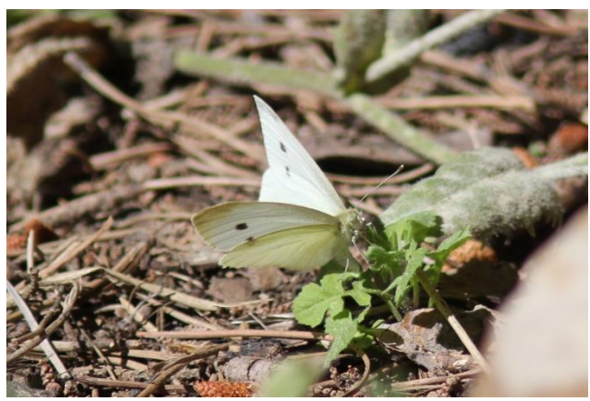
Small White, Bouafroun forest