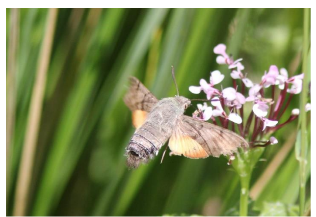
Hummingbird Hawk-Moth, Bouafroun forest