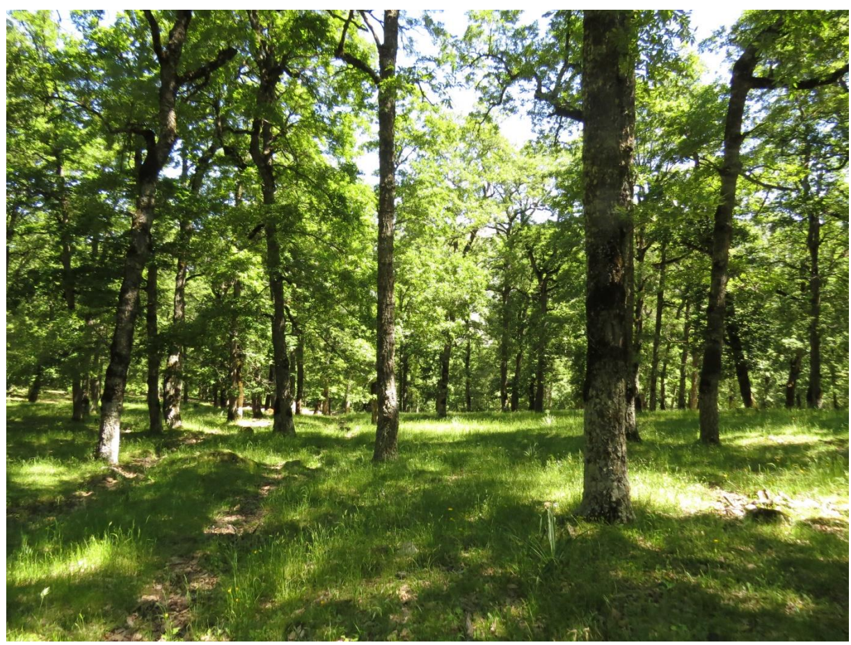
Bouafroun oak forest

The target species was easily found in the Bouafroun oak forest on a hill near Djimla at an altitude of 1,000 m. Atlas Flycatcher, a recent split from Pied Flycatcher, was also numerous there. It was very delightful to see and hear the arenicola-subspecies of European Turtle-Dove virtually everywhere around Constantine, our base during this trip. Other highlights were: the numidus-subspecies Great Spotted Woodpecker, the very distinctive cervicalis-subspecies of Eurasian Jay, the cirtensis-subspecies of Eurasian Jackdaw, the ledouci-subspecies of Coal Tit and the ambiguus-subspecies of African Reed-Warbler. Unfortunately we could not find the mauritanica-subspecies of Tawny Owl, a subspecies with split-potential. We recorded 92 species of bird and three species of mammal.