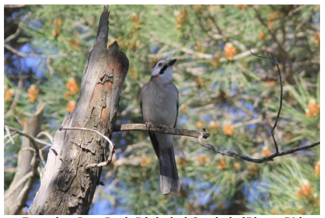
Eurasian Jay, Park Djebel el Ouahch

This endemic subspecies only occurs in the environment of Constantine and differs from ours by its darker nape.