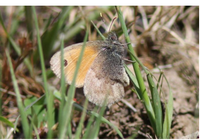
Small Heath, Bouafroun forest