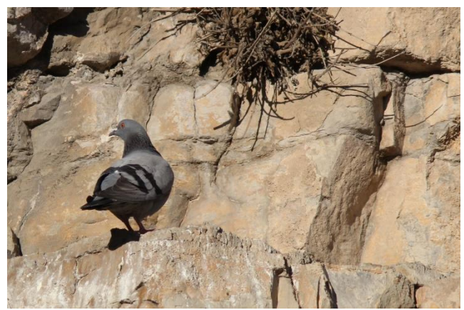
Rock Pigeon, Gorge du Rhumel