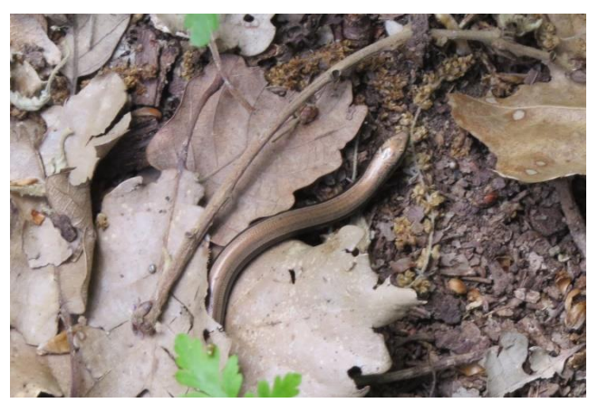
Koelliker's Glass Lizard, Bouafroun forest