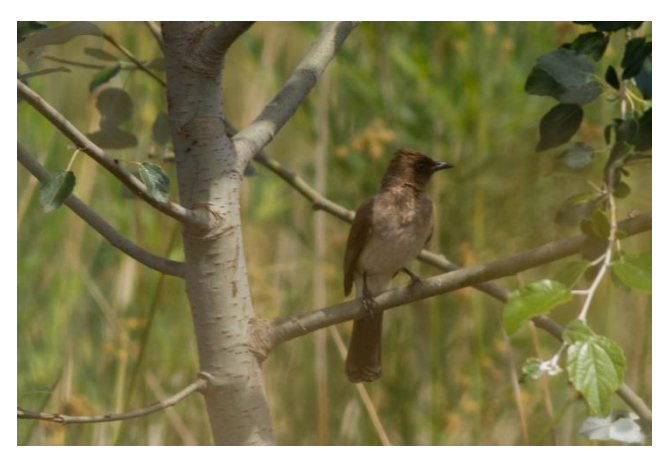
Common Bulbul, Mechta Mellel