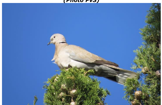
Eurasian Collared-Dove, en route between Constantine and Djimla forest