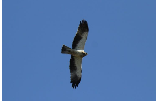
Booted Eagle, Park Djebel el Ouahch