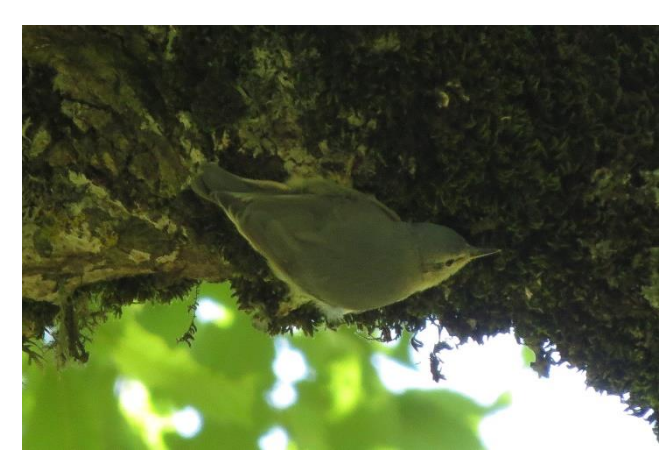
Algerian Nuthatch, Djimla forest