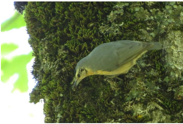
Algerian Nuthatch, Djimla forest