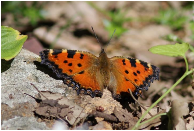
Large Tortoiseshell, Bouafroun forest