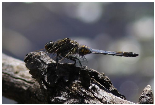
Black-tailed Skimmer, Park Djebel el Ouahch