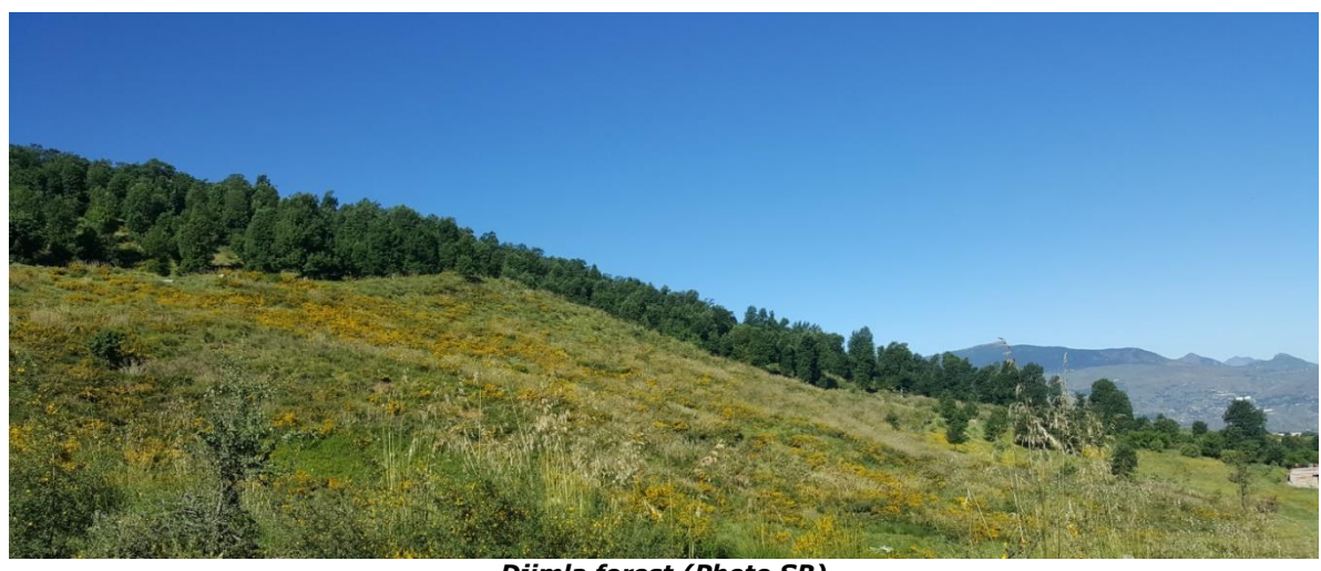
Djimla forest