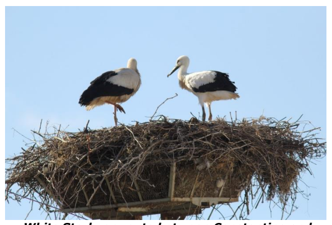
White Stork, en route between Constantine and Djimla

Two seen at Mechta Mellel and one at Lac de Guettar el Aich.