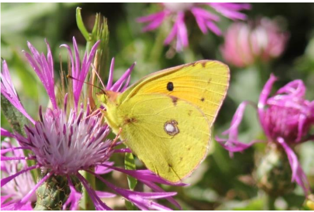
Clouded Yellow, Park Djebel el Ouahch