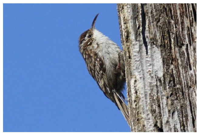
Short-toed Treecreeper, Park Djebel el Ouahch

Ten seen in Bouafroun forest and ten in Park Djebel el Ouahch.