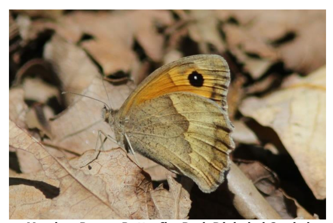
Meadow Brown Butterfly, Park Djebel el Ouahch