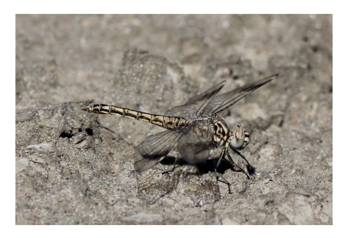
Banded Groundling, Mechta Mellel