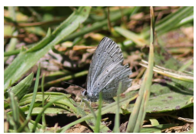
Holly Blue, Park Djebel el Ouahch