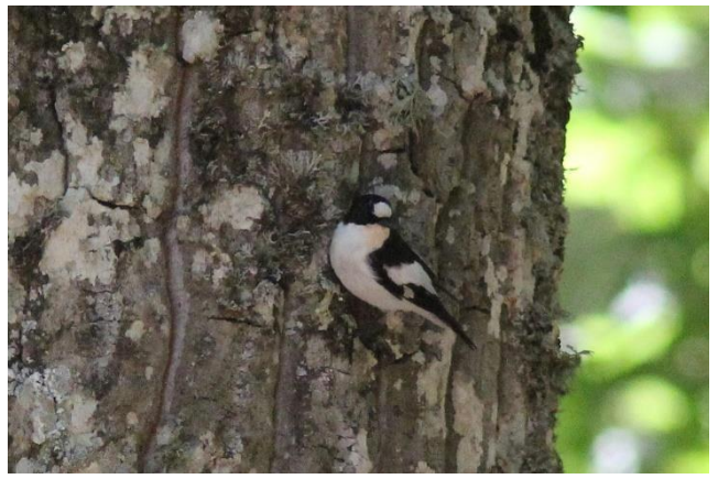
Atlas Flycatcher, Djimla forest

25 seen in Bouafroun forest and two in Park Djebel el Ouahch.