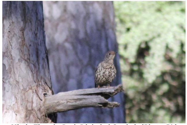
Mistle Thrush, Park Djebel el Ouahch