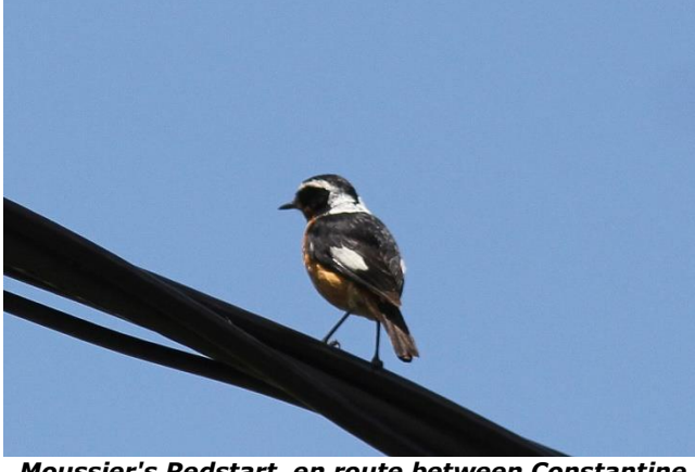
Moussier's Redstart, en route between Constantine and Djimla