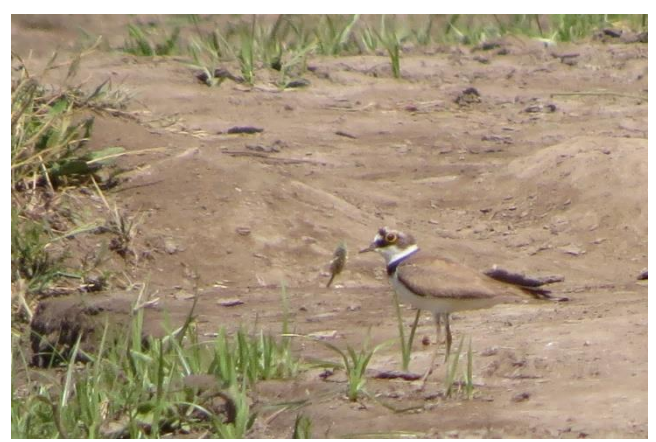
Little Ringed Plover, Mechta Mellel