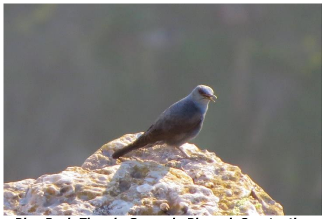
Blue Rock-Thrush, Gorge du Rhumel, Constantine