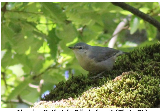
Algerian Nuthatch, Djimla forest