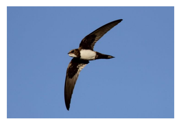
Alpine Swift, Lac de Guettar el Aich

40 seen in Gorge du Rhumel and 40 at eye level at Lac de Guettar el Aich.