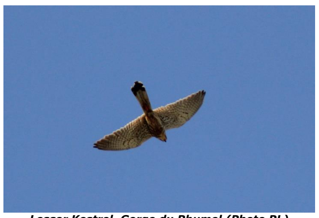
Lesser Kestrel, Gorge du Rhumel