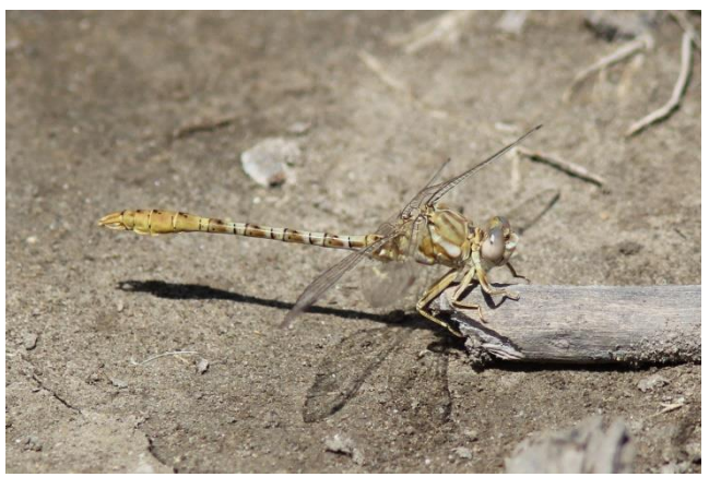
Faded Pincertail, Mechta Mellel