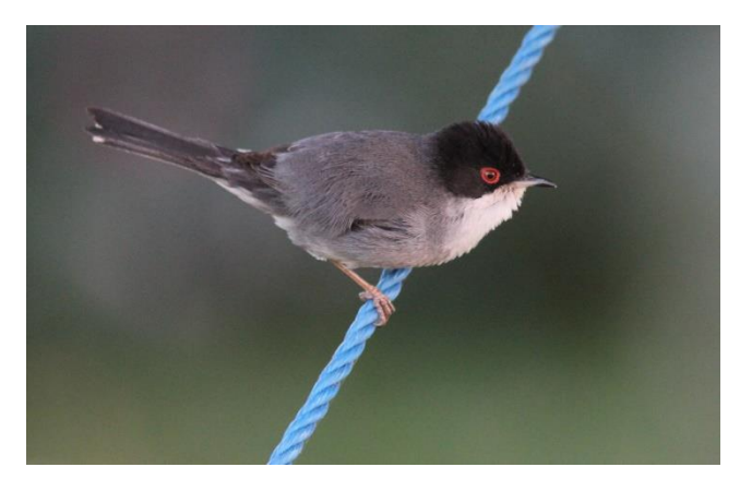
Sardinian Warbler, Constantine

Three seen just below Bouafroun forest, one at the hotel in Constantine and nine in Park Djebel el Ouahch.