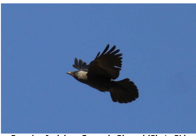
Eurasian Jackdaw, Gorge du Rhumel