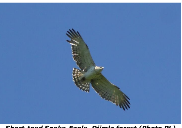
Short-toed Snake-Eagle, Djimla forest