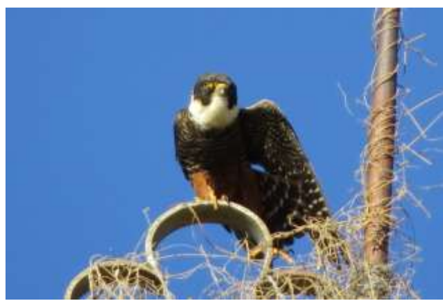
Bat Falcon, Copala