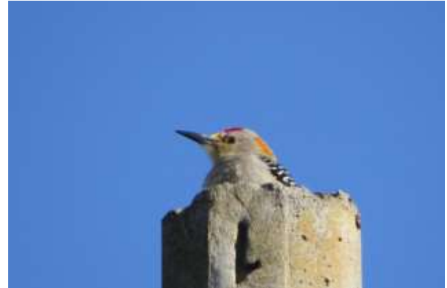
Golden-fronted Woodpecker, Laguna Zapotlan, Ciudad Guzman