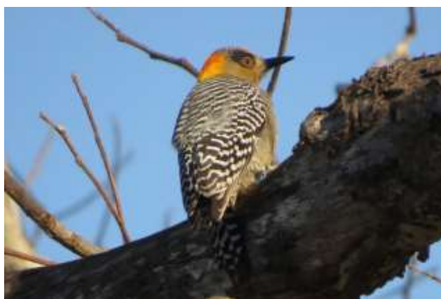
Golden-cheeked Woodpecker, Chacalilla, San Blas

A single seen at Sierra de San Juan and heard along La Palma – Tecuitata road.