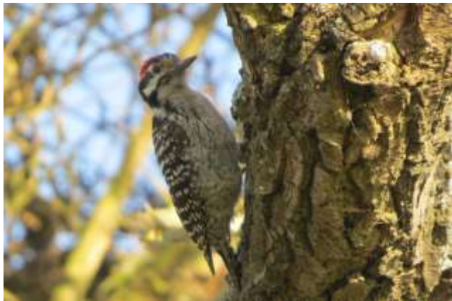
Ladder-backed Woodpecker, Laguna Zapotlan, Ciudad Guzman