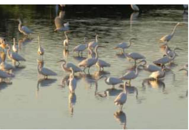
Great Egret, Humedal de las Garzas, San Blas