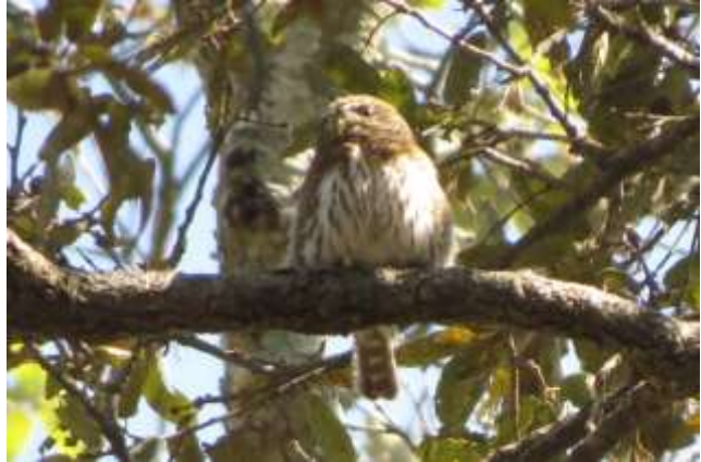
Northern Pygmy-Owl (Mountain), Volcan de Fuego

Splendid views of a single at Rancho La Noria.