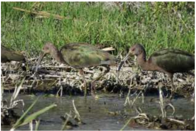
White-faced Ibis, Presa la Vega