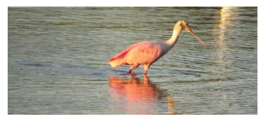
Roseate Spoonbill, Humedal de las Garzas, San Blas