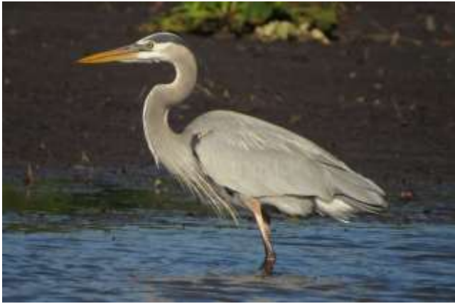
Great Blue Heron, Rio San Cristobal, San Blas