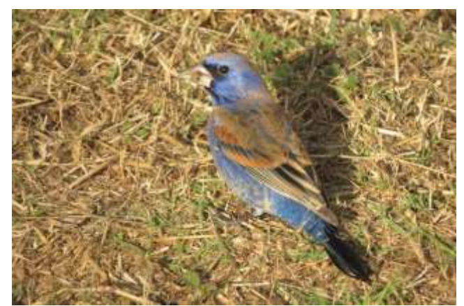
Blue Grosbeak, Mazatlan