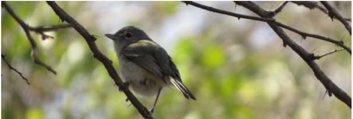
Bell's Vireo, Mazatlan

Two seen in Reserva de Paco, Mazatlan and two along the access road to Cocodrilario Kiekari.