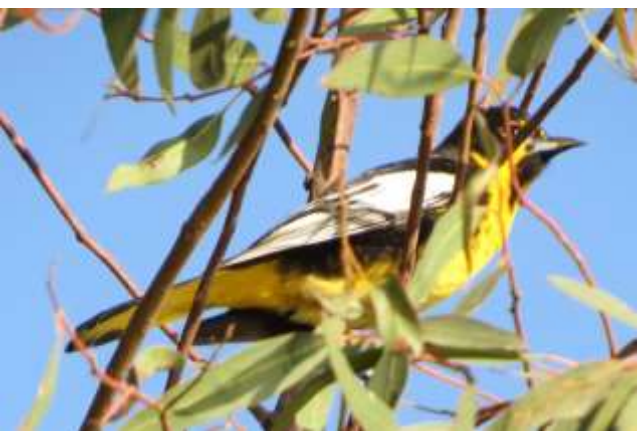
Black-backed Oriole, Laguna Zapotlan, Ciudad Guzman