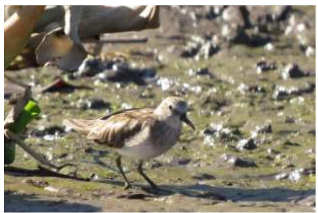
Least Sandpiper, Rio San Cristobal, San Blas