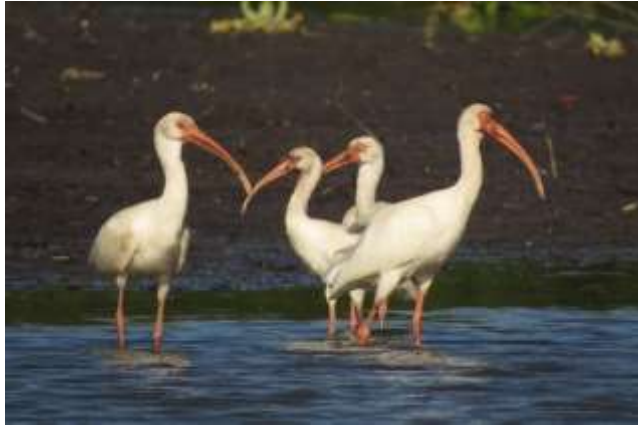
White Ibis, Rio San Cristobal, San Blas

Up to 200 (at Humedal de las Garzas) on seven dates.