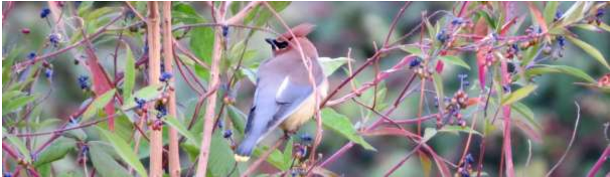
Cedar Waxwing, The Tufted Jay reserve

A single seen on clearing of the Tufted Jay reserve.