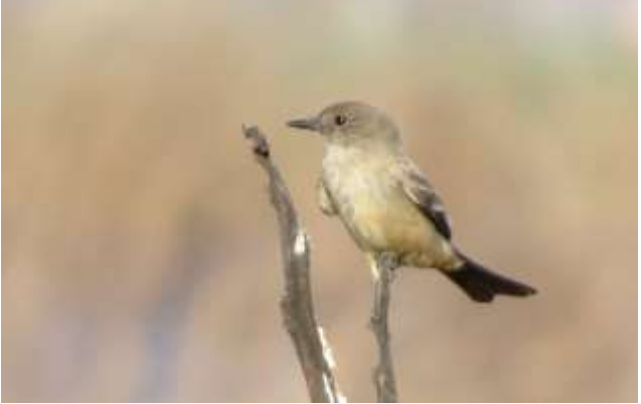
Say's Phoebe, Presa la Vega