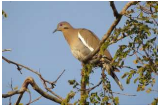
White-winged Dove, Mazatlan