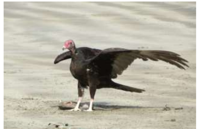
Turkey Vulture, Mazatlan