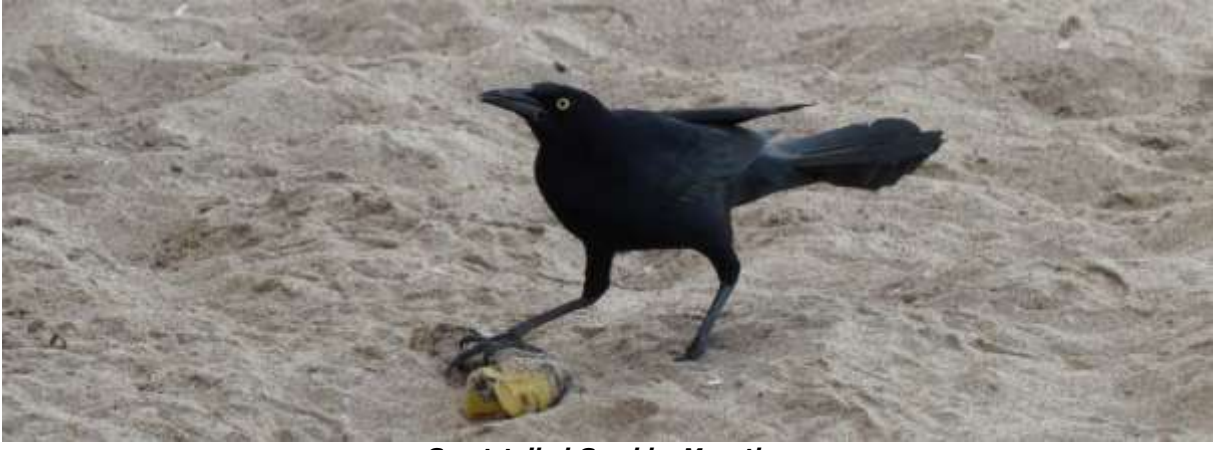
Great-tailed Grackle, Mazatlan