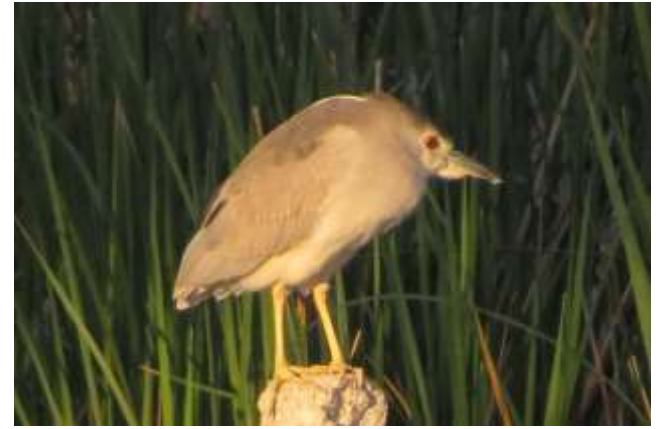
Black-crowned Night-Heron, Laguna Zapotlan, Ciudad Guzman