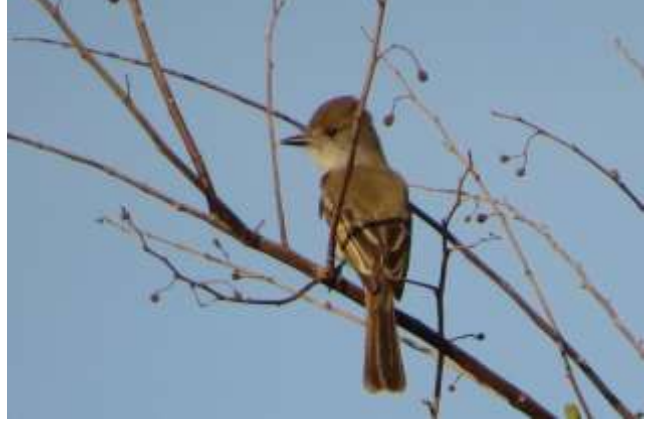
Nutting's Flycatcher, Mazatlan