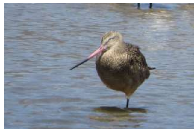
Marbled Godwit, Mazanillo-road to Vida Marina

Two seen in Salinas Cuyutlan, Manzanillo and ten along Palma Real – Boquita road.