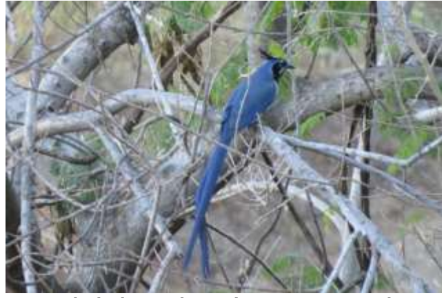
Black-throated Magpie-Jay, Petaca road

Fifteen seen in Reserva de Paco, Mazatlan, five along Durango road, fifteen along Panuco road, a single in Parque Ecologico Metropolitano, Tepic and ten along La Palma - Tecuitata road.