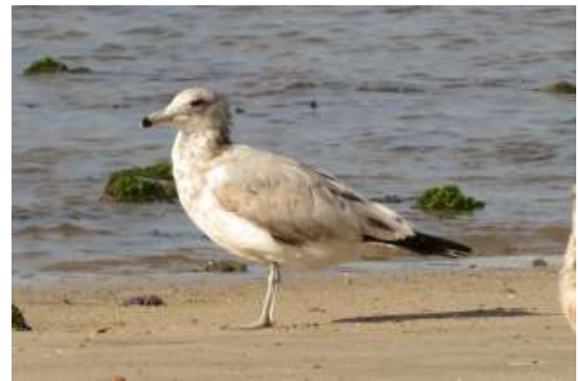
California Gull, Mazatlan