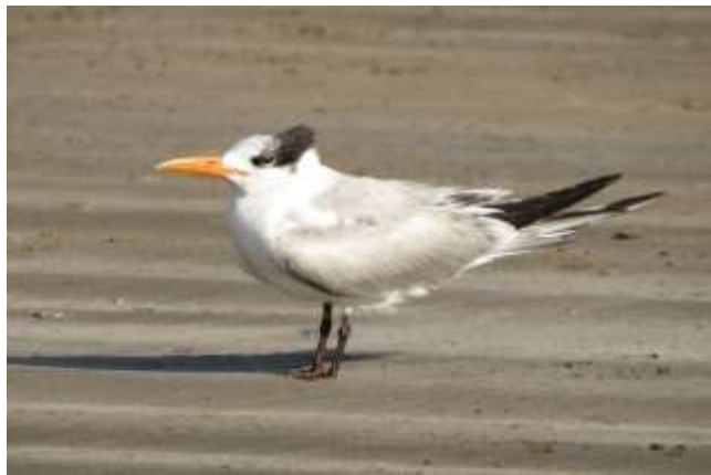
Royal Tern, Mazatlan

Four seen along Boulevard of Mazatlan, 30 in Salinas Cuyutlan and five in Manzanillo.