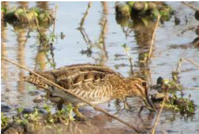
Wilson's Snipe, Laguna Zapotlan, Ciudad Guzman