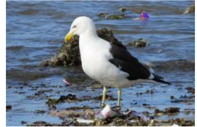
Kelp Gull, Mazatlan