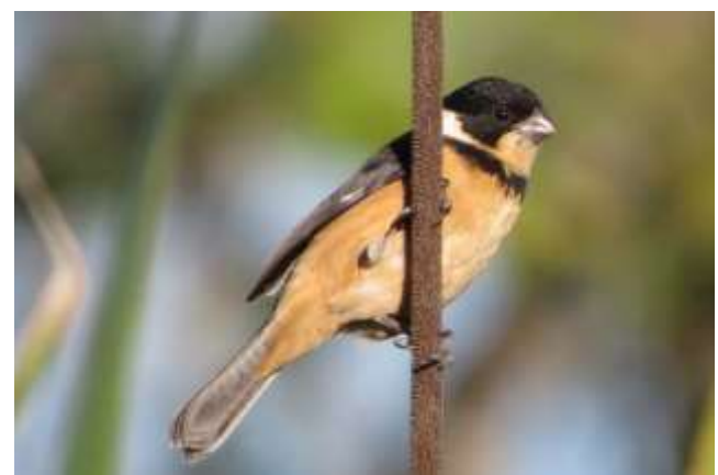
Cinnamon-rumped Seedeater, Parque Ecologico Metropolitano, Tepic