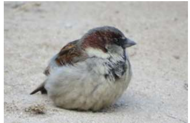
House Sparrow, Mazatlan