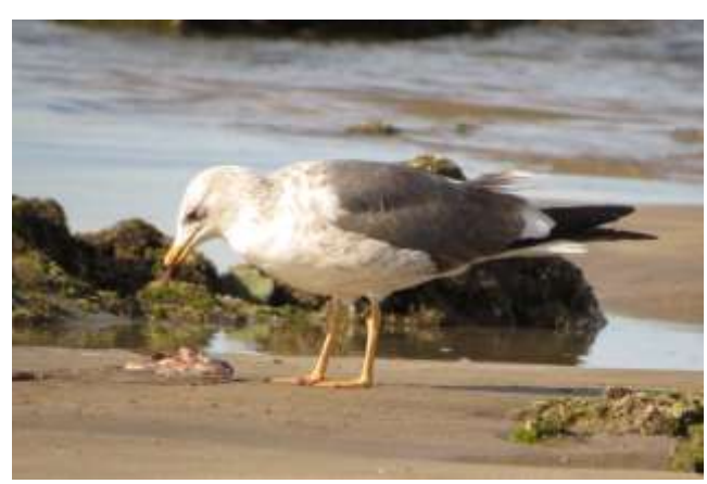
Lesser Black-backed Gull, Mazatlan