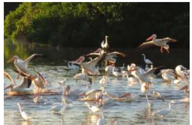
American White Pelican, Humedal de las Garzas, San Blas

Up to 1500 (in Salinas Cuyutlan) seen on seven dates.