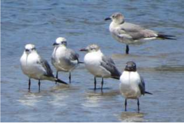
Laughing Gull, road to Vida Marina, Manzanillo