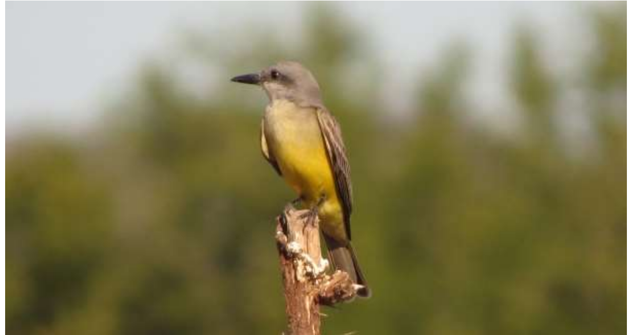
Tropical Kingbird, Mazatlan