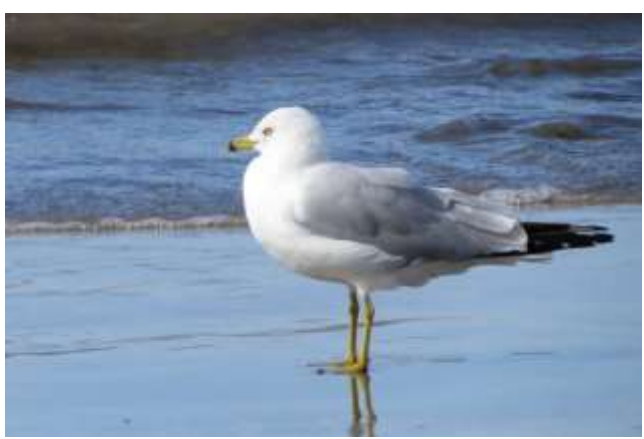
Ring-billed Gull, Mazatlan