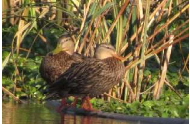
Mexican Duck, Laguna Zapotlan, Ciudad Guzman