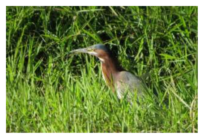
Green Heron, Parque Ecologico Metropolitano, Tepic