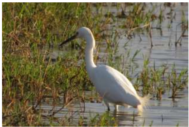
Snowy Egret, Laguna Zapotlan, Ciudad Guzman