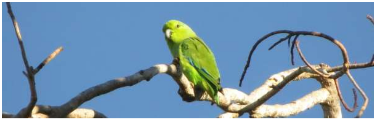
Mexican Parrotlet, Chacalilla, San Blas

Two seen in the town of Mazatlan and a single female – not far from the huge flocks of Yellow-headed Blackbirds – at Laguna Zapotlan, Ciudad Guzman.