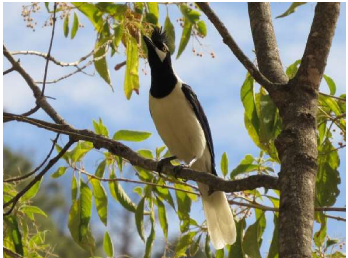
Tufted Jay, Petaca road