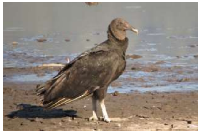
Black Vulture, San Blas

Common, the only species seen every day.