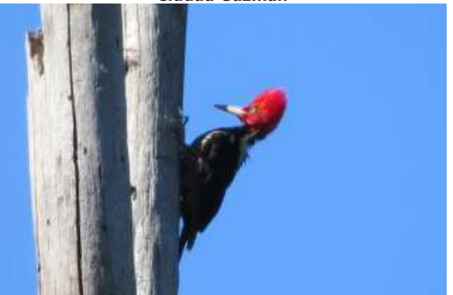
Pale-billed Woodpecker, Sierra de San Juan