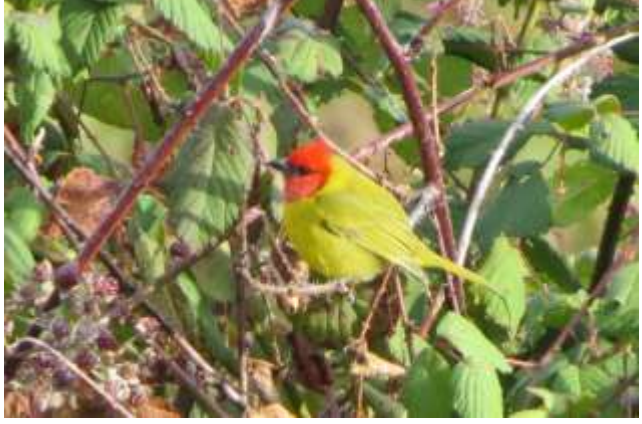
Red-headed Tanager, The Tufted Jay reserve

Three seen along Petaca road, three and singles in the Tufted Jay reserve on three dates, three at Sierra de San Juan and three along El Terrero road.