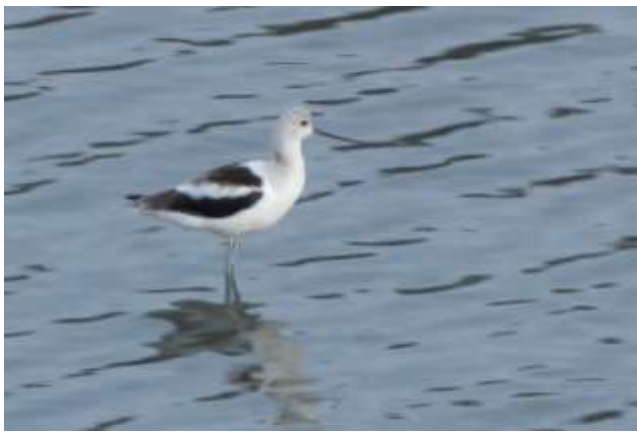
American Avocet, Mazatlan

Four seen in Estero el Yugo, 25 and 20 at Humedal de las Garzas on two dates, San Blas, five along Guadalupe road, San Blas, five in Laguna de Magdalena and 25 in Salinas Cuyutlan.