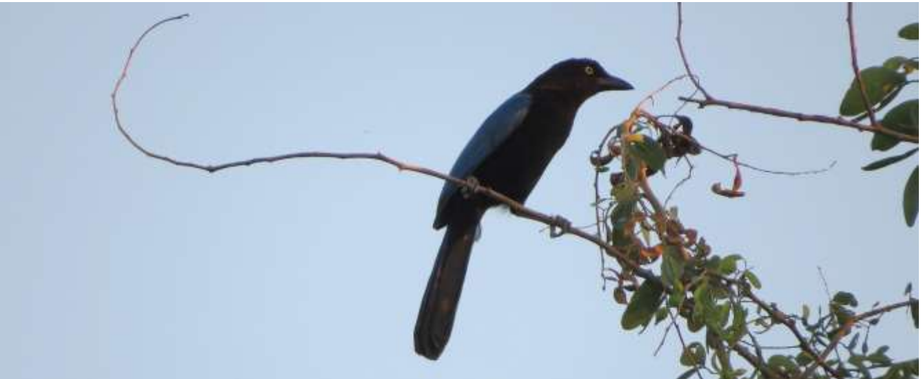
San Blas Jay, along Aeropuerto Playa de Oro road, Mazanillo