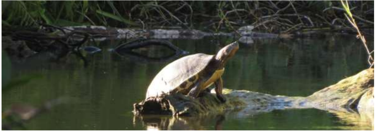
Ornate Slider, San Blas

A single seen along the access road to Cocodrilario Kiekari.