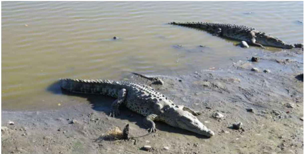
American Crocodile, Humedal de las Garzas, San Blas

Up to ten huge beasts seen behind fence of Humedal de las Garzas and three in Rio La Tovara.