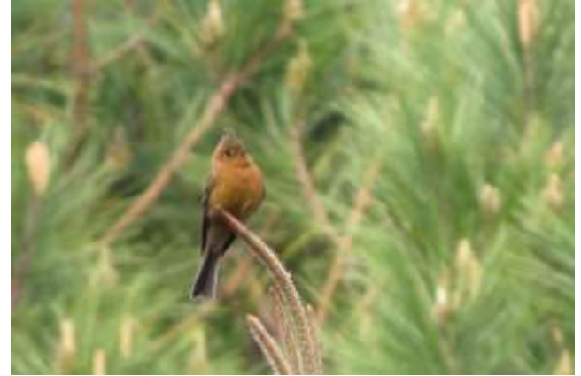
Tufted Flycatcher, The Tufted Jay reserve

A single identified at Laguna Zapotlan, Ciudad Guzman.