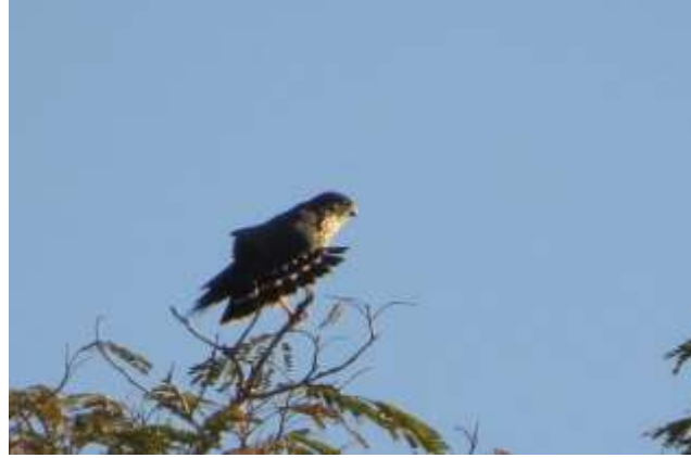
Merlin, Chacalilla, San Blas