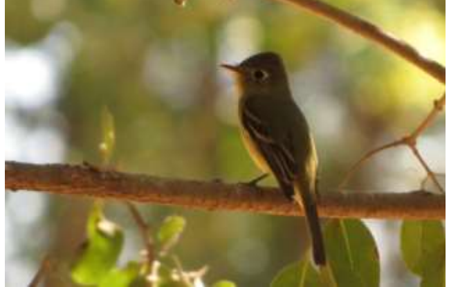
Pacific-slope Flycatcher, Mazatlan