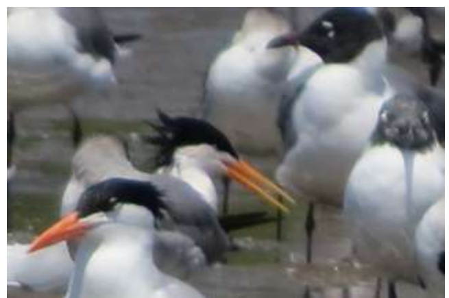
Elegant Tern (with Laughing Gull and Royal Tern), road to Vida Marina, Manzanillo

102. Elegant Tern ( Thalasseus elegans )