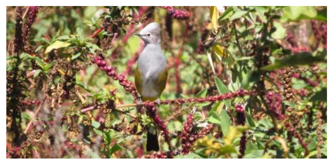
Gray Silky-flycatcher, rancho La Norida

Two seen along Panuco road, ten at Sierra de San Juan, ten in Park National Volcan Nevado de Colima, a single on Volcan de Fuego and four along El Terrero road.