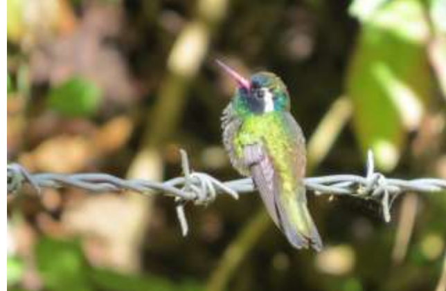
White-eared Hummingbird, San Blas road to La Noria

54. Rufous Hummingbird (Selasphorus rufus)