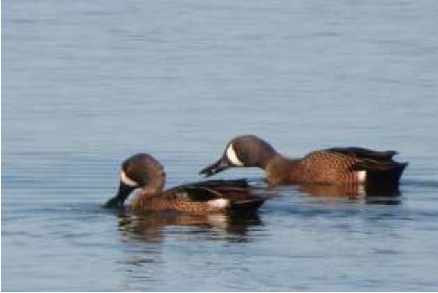
Blue-winged Teal, San Blas

Up to 200 (along Guadalupe road) seen on nine dates.