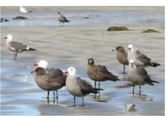
Heermann's Gull, Mazatlan