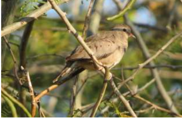
Common Ground-Dove, Chacalilla, San Blas