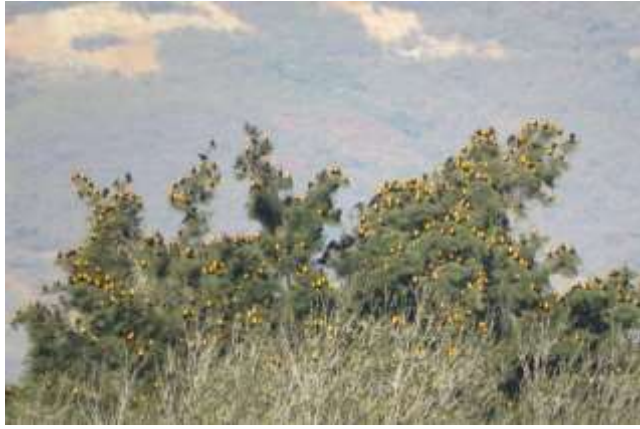
Yellow-headed Blackbird, Laguna Zapotlan, Ciudad Guzman

Flocks of up to 25000 (!) seen at Laguna Zapotlan, Ciudad Guzman on three dates.