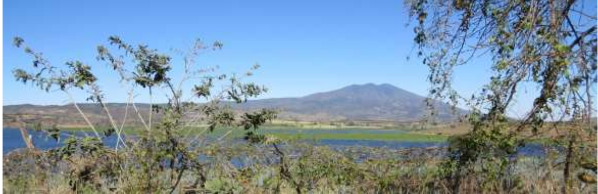
Presa la Colorada