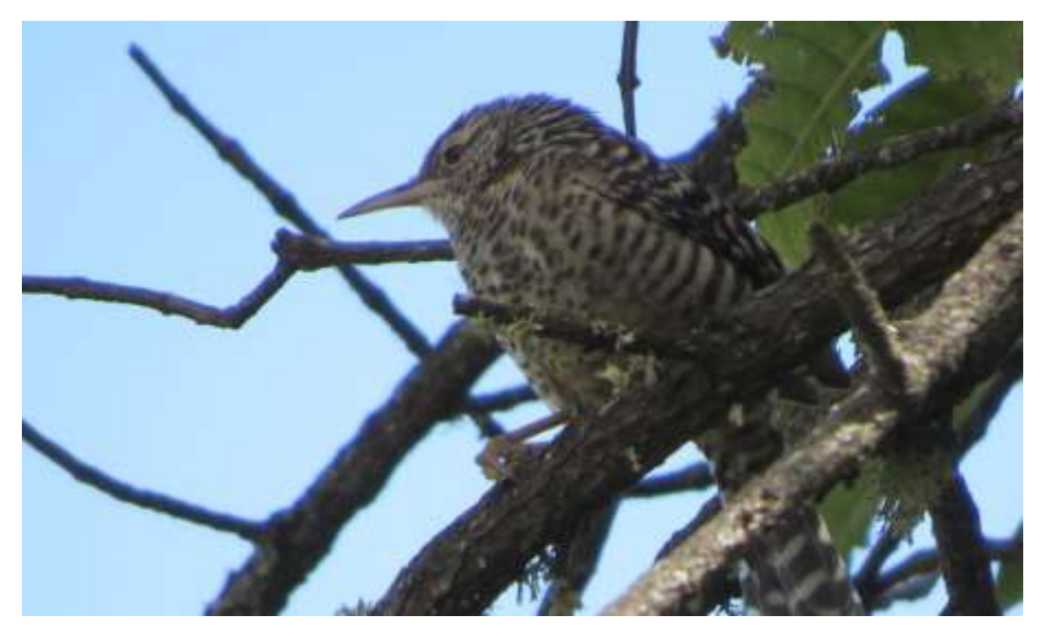
Gray-barred Wren Park National Volcan Nevado de Colima