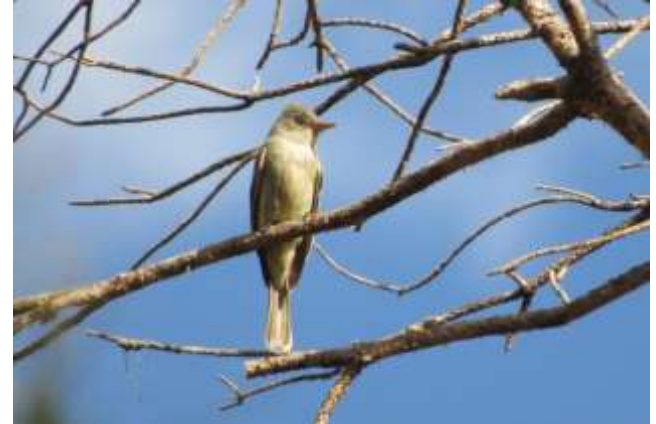
Greater Pewee, The Tufted Jay reserve