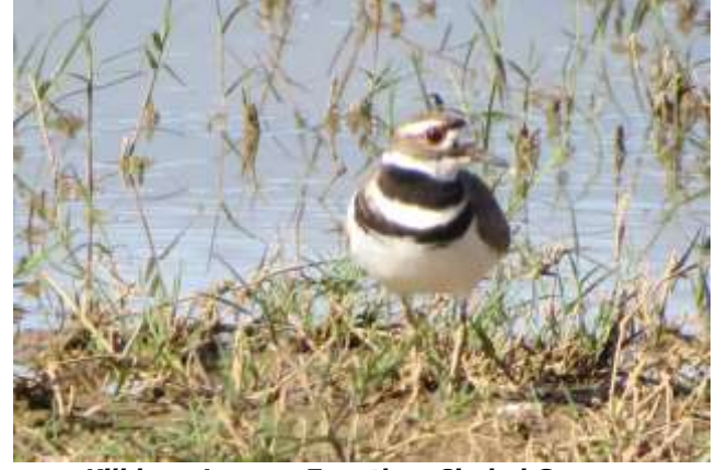
Killdeer, Laguna Zapotlan, Ciudad Guzman