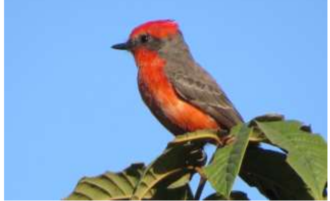
Vermilion Flycatcher, Parque Ecologico Metropolitano, Tepic