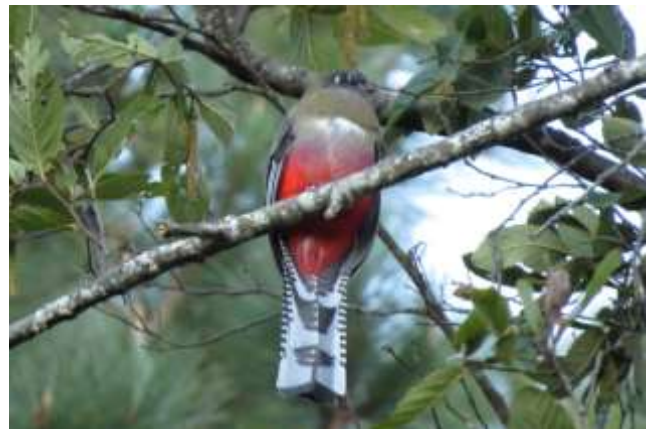
Mountain Trogon, Durango highway, The Tufted Jay reserve