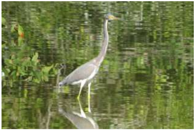
Tricolored Heron, San Blas