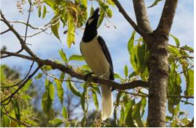
Tufted Jay, Petaca road