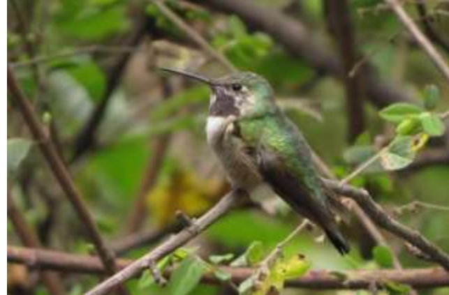
Broad-tailed Hummingbird, Park National Volcan Nevado de Colima