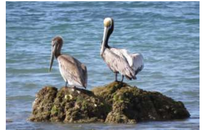
Brown Pelican, Mazatlan