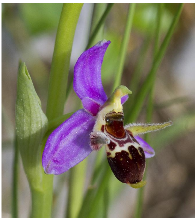
Woodcock Ophrys Ophrys scolopax

The early success is a great bonus and I can now turn my attention to the wild flowers at my feet, in particular the phenomenal display of flowering spring orchids. The delicate white-and-lemon blooms of Sparse-flowered Orchid are super-abundant, appearing by the thousand and in perfect fresh condition. Much smaller numbers of subtle pink Three-toothed Orchid are periodically picked out, with curving striped bonnets and boldly-dotted gown-shaped bodies which are a macro-photographic delight. The same is particularly true for a small group of exquisitely beautiful Woodcock Ophrys, whose form mimics the body of an exotic insect adorned in intricate markings of pink, mauve and yellow.