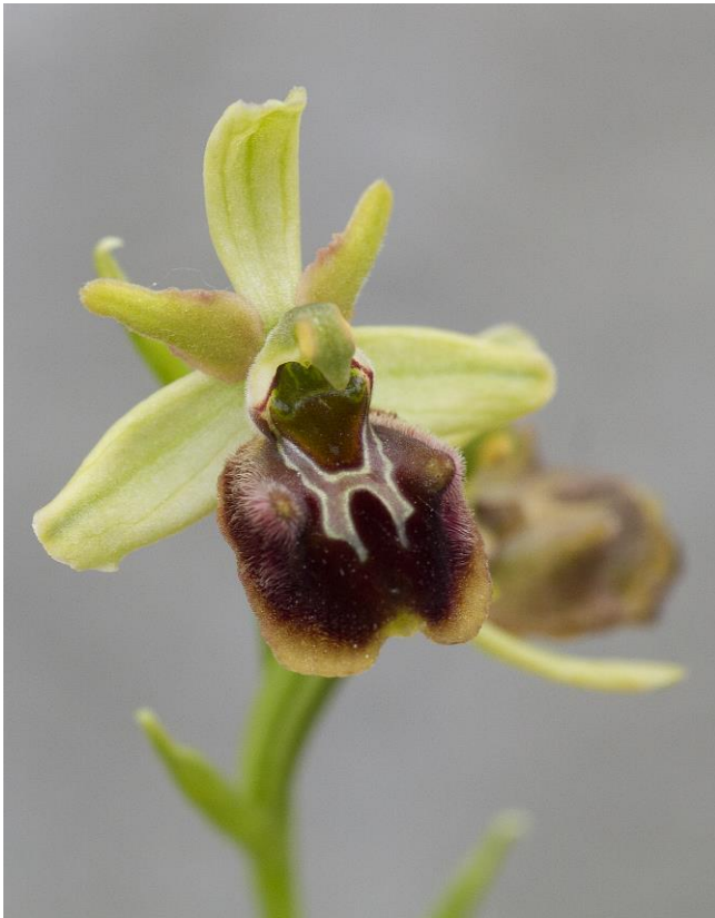
Early Spider Orchid Ophrys sphegodes

By mid-afternoon the sun has returned and another assault on the escarpment is made. A juvenile Montagu's Harrier passes overhead en route, with the usual assemblage of birds noted up top (though with a consistent lack of partridges). Most time is spent on the continuation of the Ronald Brown Pathway above Velji Do, with the gorgeous display of wildflowers being the main focus. Here we discover a small colony of exquisite Early Spider Orchid, plus a single teneral Red-veined Darter dragonfly.