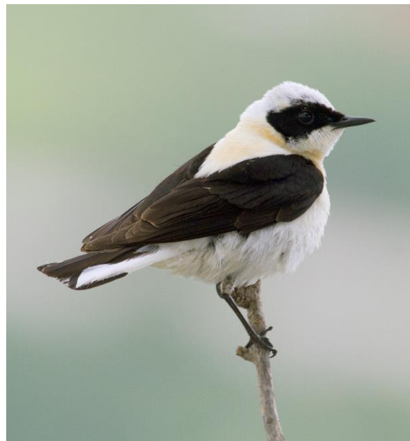
Eastern Black-eared Wheatear

Our fantastic and very full day is concluded back in Cavtat, where sundown drinks at the apartment are followed by a circuit of the harbour, which now hosts several ridiculously lavish yachts whose polished chrome and inbuilt illumination systems exude unfettered maritime affluence. The Pizzeria Kabalero provides us not only with some outstanding value-for-money cuisine, but also a bat-like Giant Peacock, which batters a street lamp before alighting to allow some precariously balanced photography of Europe's largest moth.