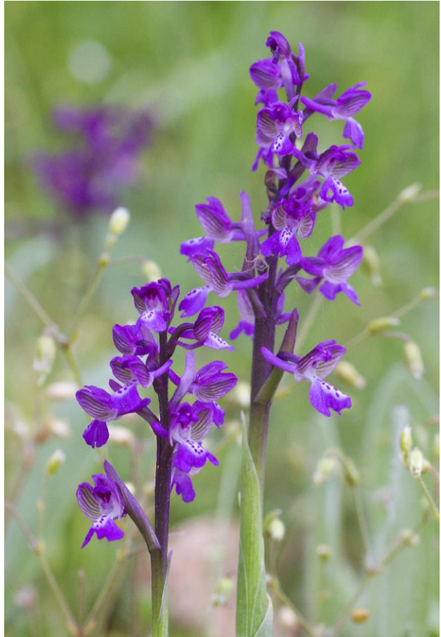
Green-winged Orchid Anacamptis morio