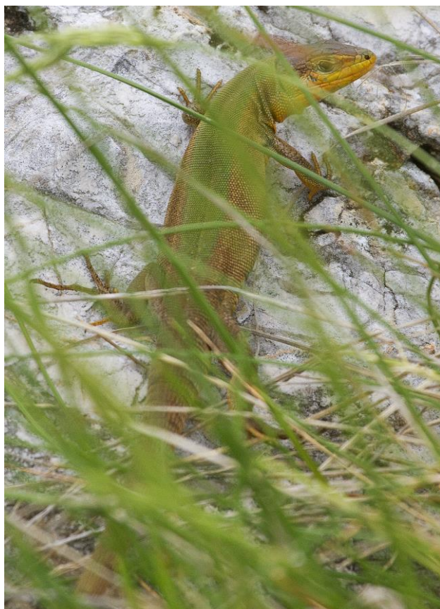
Balkan Green Lizard

For the next couple of grey hours I work my way through the low maquis towards the coast, seeing numerous 'Eastern' Subalpine Warblers, Sardinian Warbler, Woodchat Shrike, Cirl Buntings and a single flyover Hawfinch. Despite the gloomy weather there is clearly a significant passage of Honey Buzzards occurring, with eight birds recorded passing through, though oddly they all appear to be moving south.