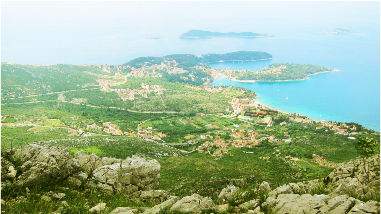
Cavtat town, viewed from the limestone hills above

We have hardly become accustomed to the pleasantly warm climate, elegant cypress trees and charismatic terracotta roof tiles when we arrive at our small apartment block in the coastal holiday town of Cavtat. At how many destinations can one be propelled from touching down on the runway tarmac to entering the hotel apartment in just an hour? Croatia is certainly set to be a dream of a logistical destination, if first impressions are anything to judge by.