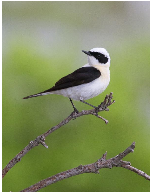
Eastern Black-eared Wheatear