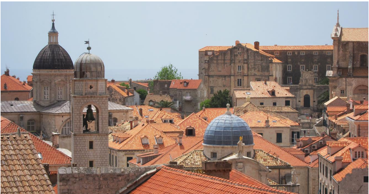
A view of Dubrovnik Old City from the city walls

A circuit of the Dubrovnik city walls is a must, but one has to pay for the experience. In our opinion it is, however, very worthwhile, and provides constantly changing views from a bird's eye perspective of one of the most captivating historic cityscapes in existence. Although the Unesco World Heritage Site was badly damaged by shelling during the 1991 siege, it remains one of the best preserved medieval cities in Europe, as the 6m thick, 22m high defensive high walls have served it very well over the millennia. It is still easy to detect which bomb-damaged buildings have been repaired and rebuilt, by the new bright orange terracotta roof tiles which contrast with the dulled ancient tiles of their neighbours.