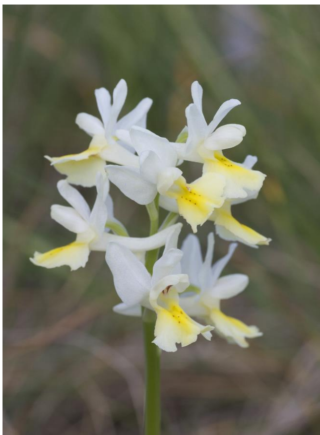
Sparse-flowered Orchid Orchis pauciflora

On the water's surface some five hundred metres below, two moving dark islands edge north towards the distant outline of Dubrovnik; these are two gigantic cruise ships which are set to descend on the sleeping city which will also be our target for a visit later in the day.