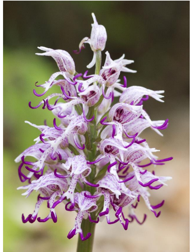
Monkey Orchid Orchis simia

To avoid yet another shower we follow the minor road inland towards Duba Konavoska, which takes us through a mixture of cultivation and low oak forest, resplendent in a covering of fresh green leaves. Nightingales abound in this habitat, and the roadside orchid show is exceptional. Green-winged Orchid is abundant, but without doubt, the floral stars are two Monkey Orchid spikes, which are the most surreal flowers I have ever seen. Each bloom head sports a subtly pink 'body', to which are attached bright purple 'arms and legs', each bent at the elbow/ankle. Above the 'body' a hooded pink bonnet shrouds a 'face', complete with smiling purple lips and eyes; absolutely amazing!