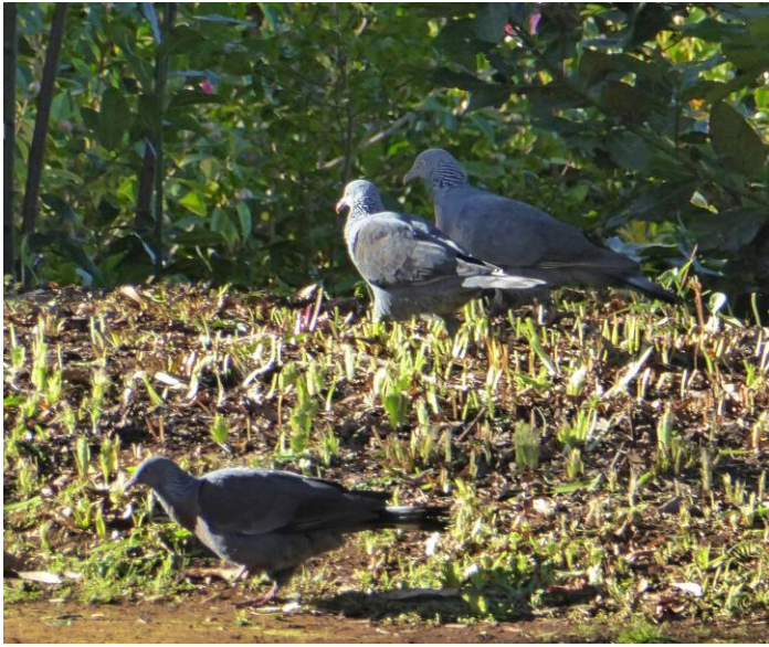
Trocaz pigeons, Quinta do Palheiro Ferreiro