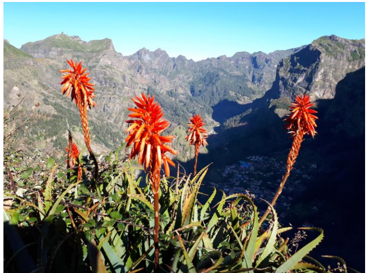
Aloe vera at Curral das Freiras - these are widely naturalised