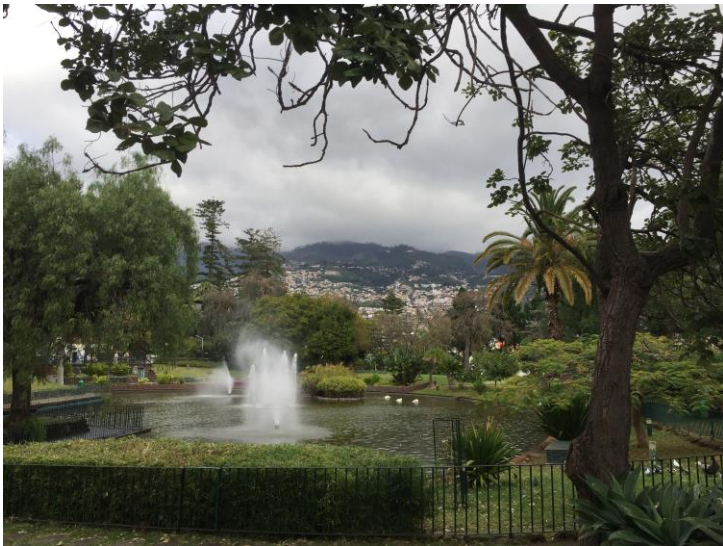
The little pond in Santa Catarina Park, Funchal

We spent the rest of the day exploring Funchal, which is a lovely old Portuguese city. As we walked around we heard and saw plenty of canaries, a couple of kestrels and some Monarch butterflies, which proved to be plentiful in the town gardens.