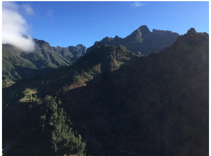
Roadside view, Serra de Agua