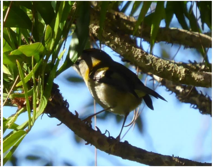
Madeiran firecrest, Quinta do Palheiro Ferreiro

We carried on eastwards to Ponta de Sao Laurencio and had a short walk, turning off the main trail to take a quiet track northwards towards the north coast. Along here we saw plenty of canaries, goldfinches, linnets a couple of Berthelot's pipits and a kestrel. After an excellent and good-value lunch in Frente Ao Sol in Canical (I had a plate of tasty and succulent octopus, fried with onions) we drove up to Santo Domingo da Serra for a walk through the park, where we heard more Madeiran firecrests.