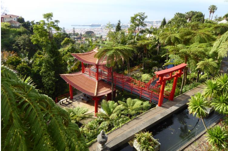
Monte Palace Tropical Garden - trocaz pigeons seen from here

We'd started to see a pattern with the weather - there seemed to be sun for a couple of hours each morning, and sometimes a bit more in the afternoon, but largely cloudy, especially on higher ground. Funchal definitely gets the best of the weather, as we'd been told, and back in town it was pleasantly warm. The little lake in Santa Catarina Park had 12 black-headed and 3 Mediterranean gulls on it in the afternoon.