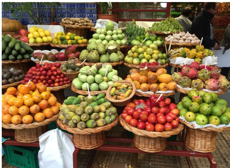
Locally grown tropical fruit, Mercado dos Lavradores, Funchal