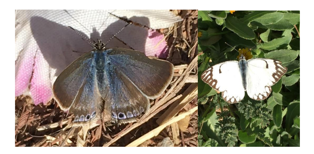
(Euchrysos cnejus and Belenois aurota)