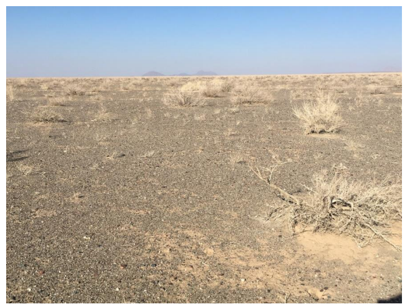
Landscape Pleske's Groundjay

desert. Again we had bad luck as the quads were not recovered from the day before. But finding some Hoopoe Larks compensated a lot.