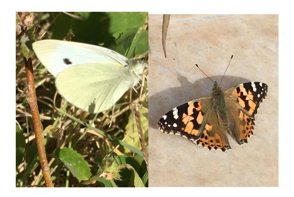
Pieris ergane and Vanessa cardui