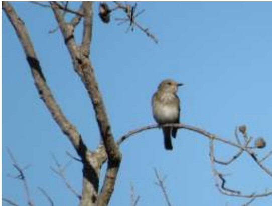
Spotted (Jijel) and

A total of 19 birds seen spread over the trip.