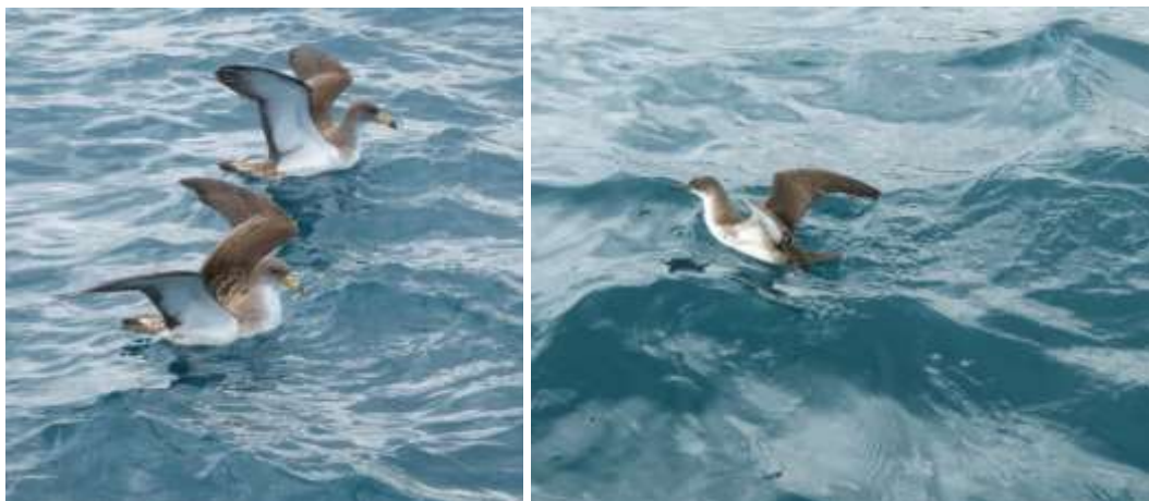
During the short pelagic we had excellent views of Scopoli's and Yelkouan Shearwaters

Common along the coast and from the pelagic giving very close views and it was great to here there sounds