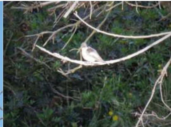
European Pied Flycatcher (Cap Bon)