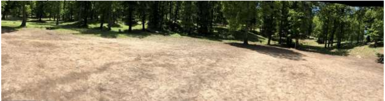
The breeding site of the first visited pair of Algerian Nuthatches