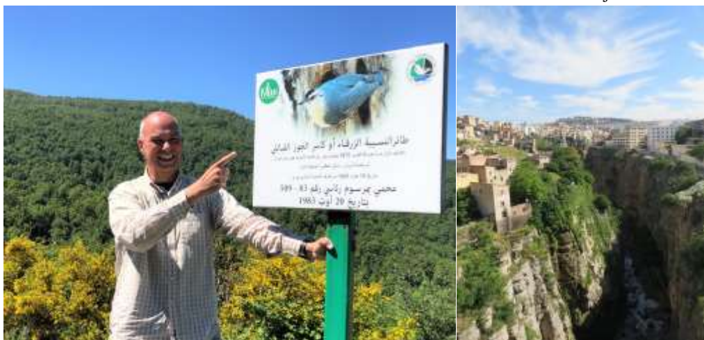
The notification of a special bird at Tazan N.P Constantine, Algeria

2 ex near the entrance of Djimla forest.