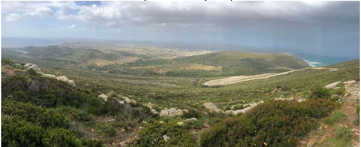
Cap Bon on a very windy day

On this trip the weather was good with no rain, mostly sunny with (dry) temperatures just above the 20 C and often no wind except on the first day at Cap Bon.