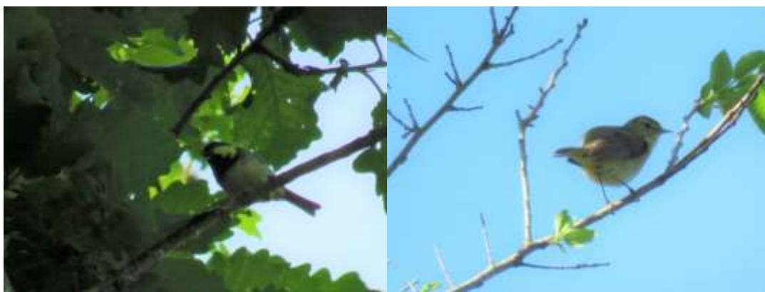
Quite yellow these Coal Tits