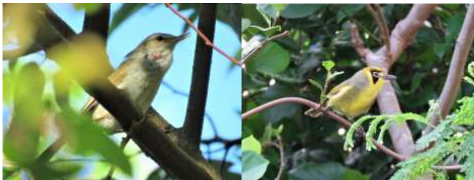
The bush warbler