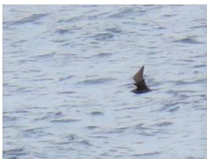
Long-tailed Skua passing the ferry