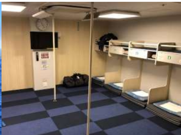
The sleeping place on the ferry.