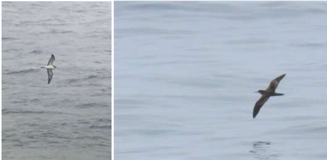
Streaked Shearwater and Wedge-tailed Shearwater