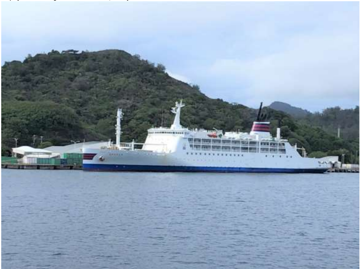
The Ogasawara maru in Haha-jima harbor.