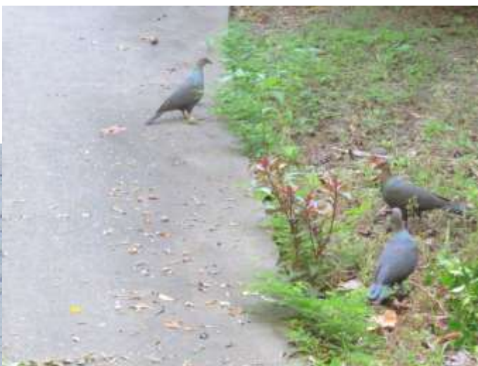
and a flock of "Red-headed Woodpeckers."