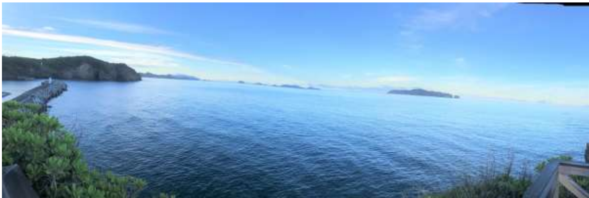
Hahajima from the viewpoint near the little town.

On this trip, the weather was really good with no real wind on both crossings to the Ogasawara's. It was hot and humid on the islands.