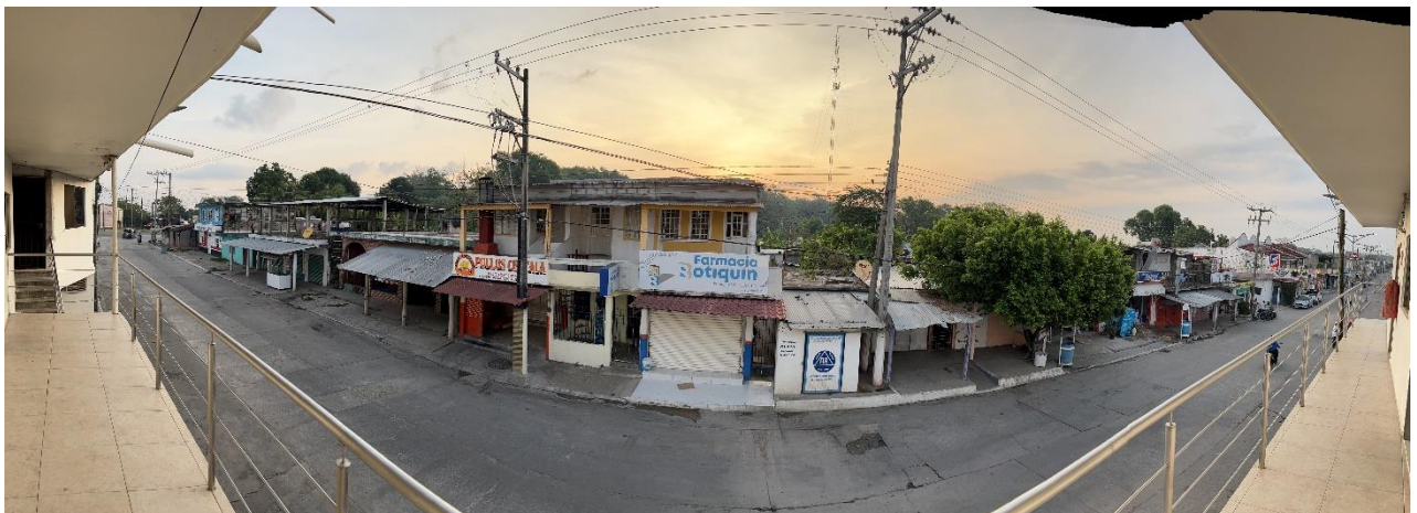
Early morning in the town of Chable where we spent the night for seeing Jabiru.