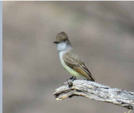
and Dusky-capped Flycatcher.