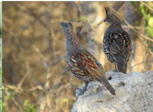
and Elegant Quail