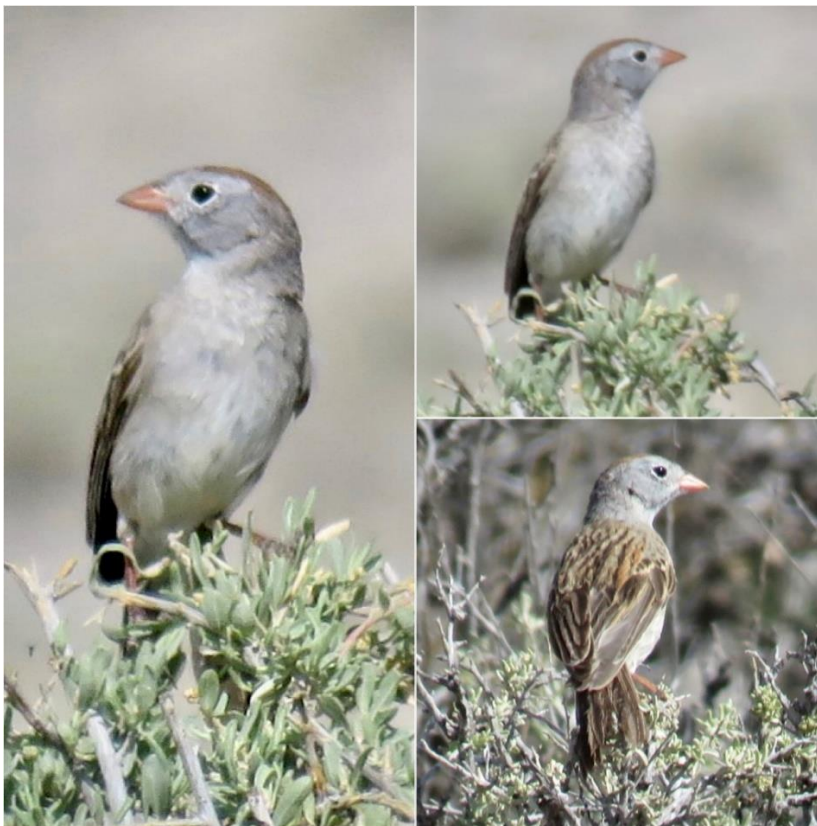
Worthen's Sparrow, not the best looking but very rare.