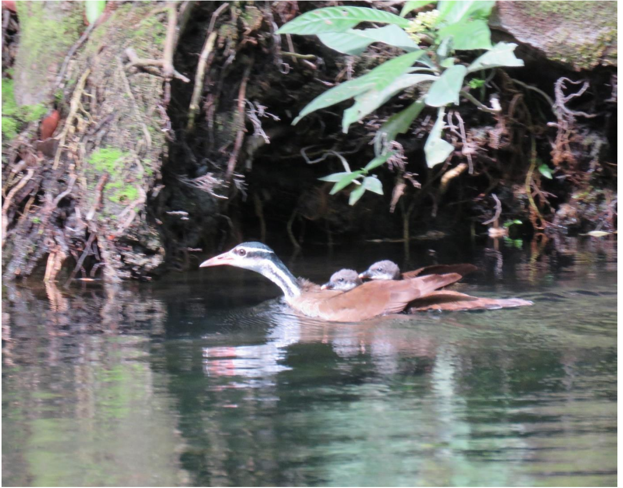
My second encounter ever with Sungrebe was great. .....