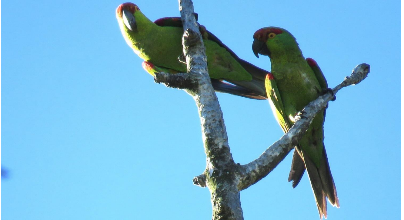
Starbirds of the trip: Thick-billed Parrot