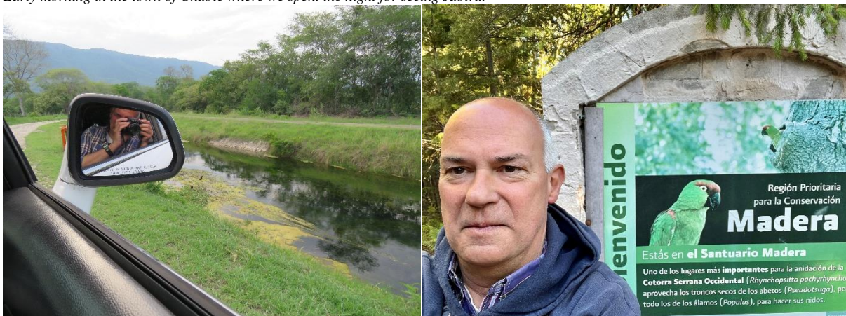
Birding from the car at El Cielo and finally after three attempts reached Madera Canyon