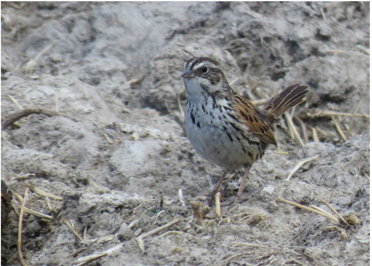
Sparrow of the trip, Sierra Madre

Quite common especially in the Madera area.