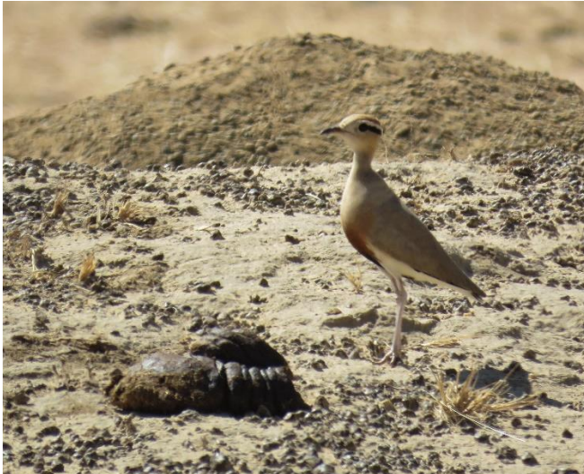
A very nice species to see again, so well. The Temminck's Courser.