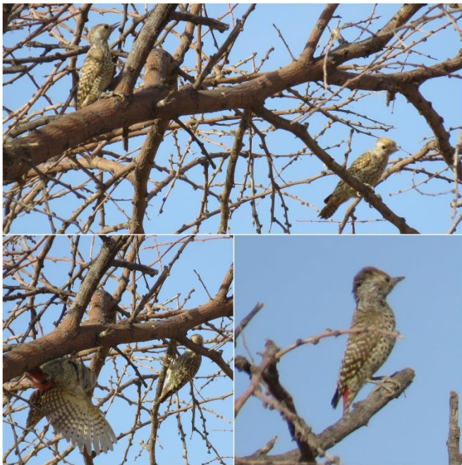
Nice endemic Little Grey Woodpeckers