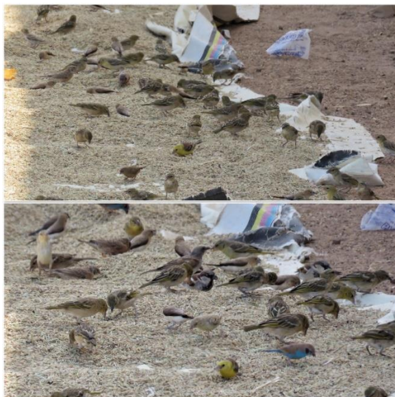
Feeding Frenzy of finches along the way on 02-12

Common sometimes in flocks during the whole trip.