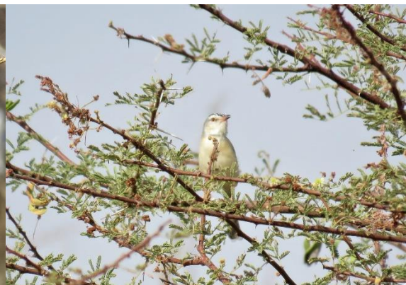
and Cricket Warbler