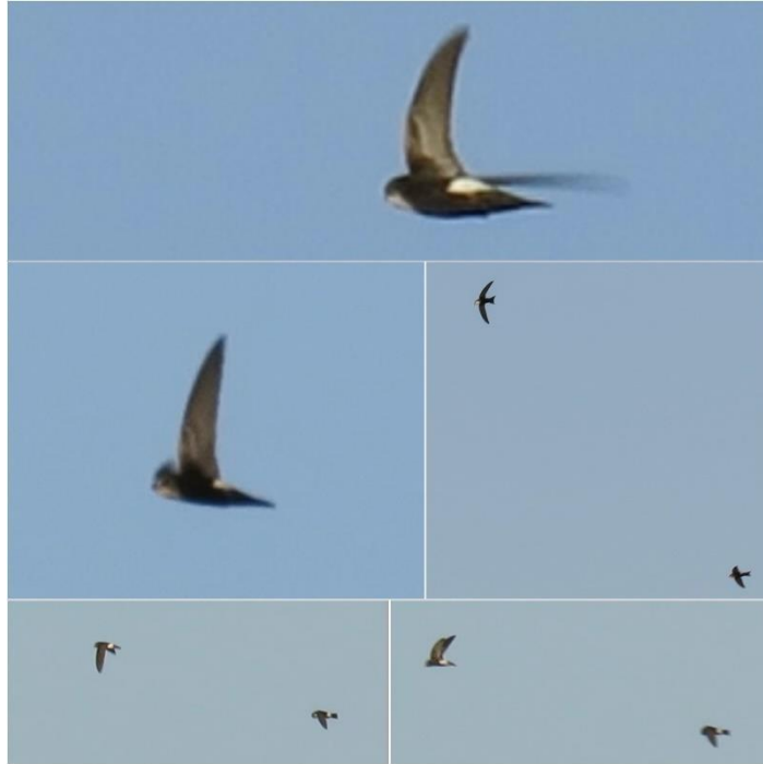
The Horus Swifts at Gamadji Sare

01st December: Arrival at Blaise Diagne International Airport at 16:15 picked up by guide carlostoubacouta@yahoo.fr . ( https://www.facebook.com/abdou.lo.5074 ) and transfer to Thiés (1 hour drive) and overnight at Massa Massa hôtel (Thiés).