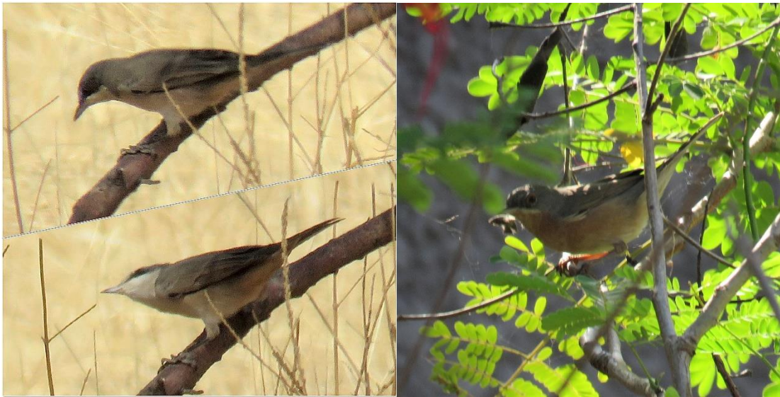
Nice to see them in winter