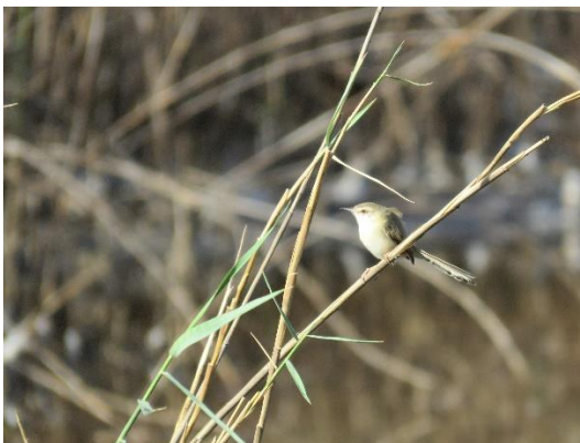
Two Long-tails: River Prinia

03-12 3 ex. seen and hear well near Podor.