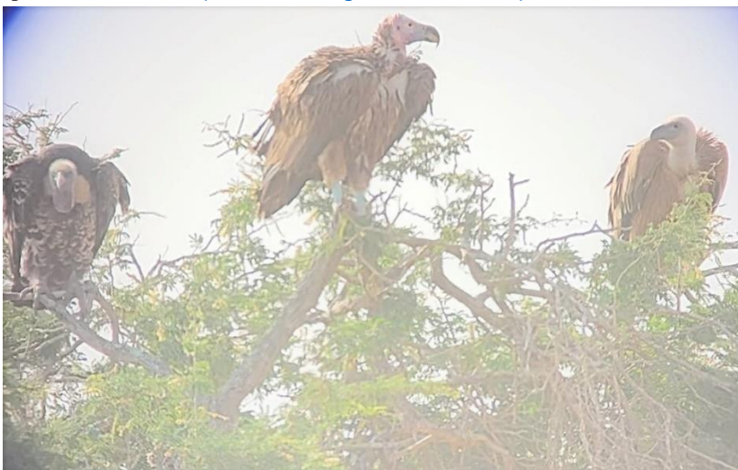
Three vulture species, Ruppel's, Lapped-faced and Griffon.

02-12 1 ex in a mixed vulture group. A beast compared to the other species. See also: https://www.instagram.com/reel/Clqu0xtKnFw/?utm_source=ig_web_copy_link