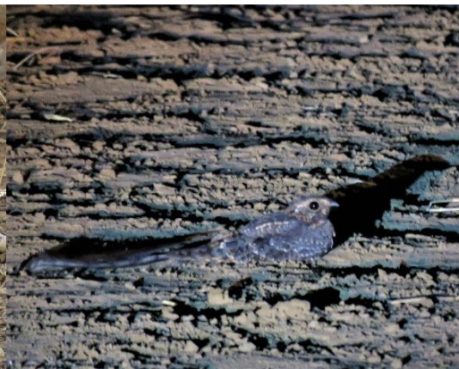
and a cracking male Standard-winged Nightjar.