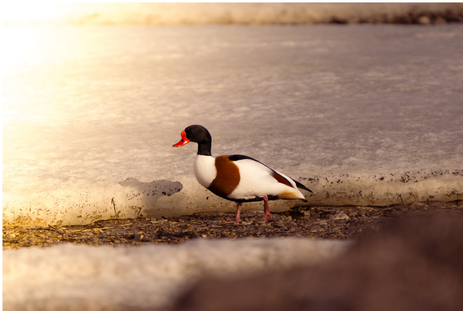
Shelduck; 28 th March 2022

Breakfast was planned at 7:00 and soon after we headed for sea watching at Puise in Matsalu National Park adding 2 female elks on the way to start off the day and a hare was seen running into a bush upon arrival. It is recommended to use a spotting scope during these sea watching sessions as some of the birds like Smews tend to be observed further away from the shore. Other notable birds observed were Goosander , Red-breasted Merganser , Oystercatchers , Shelducks , Great Scaups , Teals and Ringed Plovers while Long-tailed Ducks and Common Goldeneyes were present in large numbers. The Common Scoters , Velvet Scoters and Northern Pintails were seen migrating and a flock of about 12 Snow Buntings came feeding along shoreline. In nearby fields the Wood Larks showed well while Siskins and Skylarks could be heard occupying the meadows.