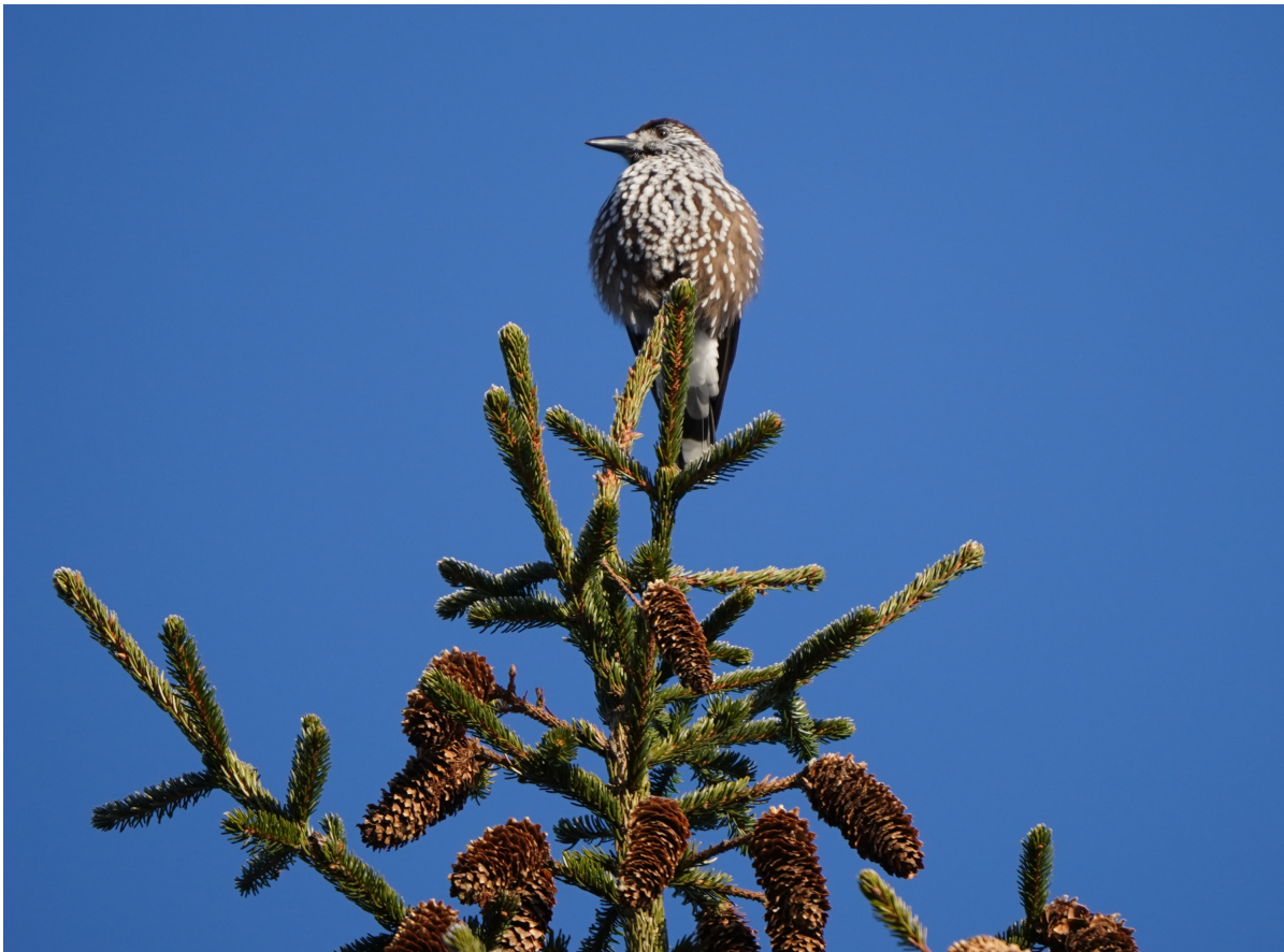
Nutcracker offering cracking views singing atop of a tree, observed on 1 st April 2022

We headed back to the scenery of Soomaa NP with the main targets being the Capercaillie and Hazel Grouse . The day kicked off really well with a Nutcracker making itself heard from the forest. It did not take long before it offered cracking views singing from atop of a tree just in front of us that can be seen in Figure 14.