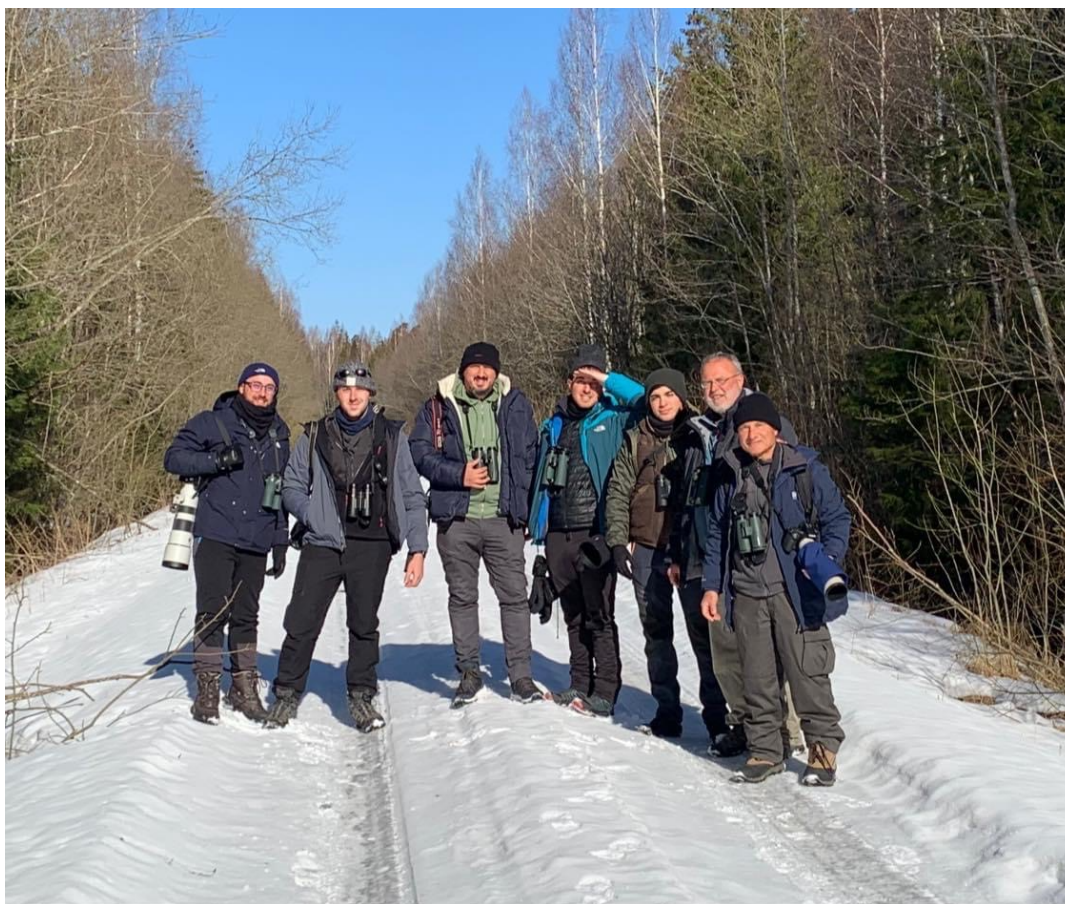
During one of our walks in Sooma National Park

Photographic opportunities were scarce especially during sea watching as birds tend to be too far away for suitable photographic subjects. Having said that, probably your best bet is to carry with you a 400 mm to 600 mm telephoto lens. During forest birding it is easier to find subjects for photography, in my opinion I found woodpeckers easy to photograph. We managed decent shots during our ferry crossing between the mainland and Saaremaa so keep the camera on you as you will encounter long tailed ducks, tufteds, common scoters and possibly common eiders.