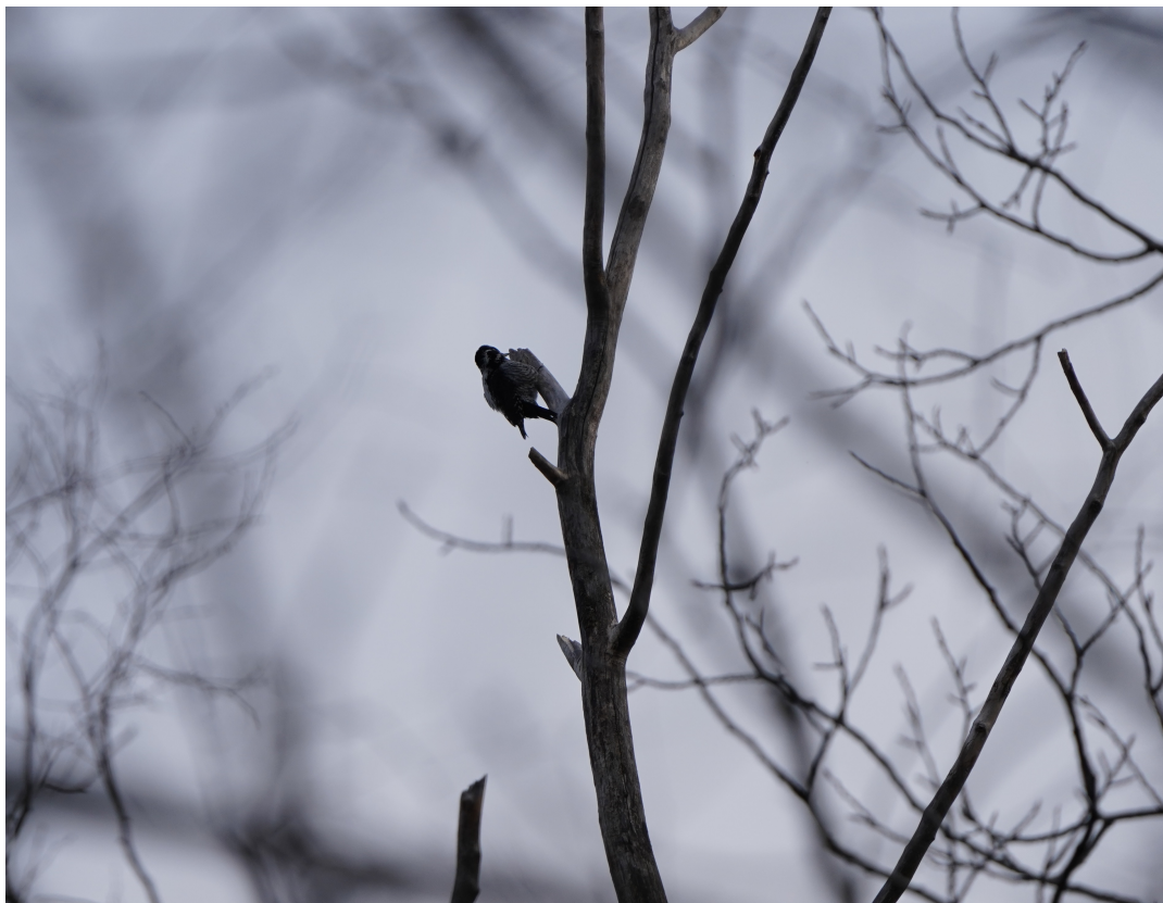
A Three-Toed Woodpecker giving life to dead timber in Soomaa NP observed on 31 th March 2022.

On this day, we had an early start and headed off to Soomaa National Park in search of a Tawny Owl which sadly we did not manage to see. Our next stop was the forest at Soomaa where we were greeted with a Crested Tit chirping atop of a tree. In the distance a familiar drumming caught our attention and saw a Black Woodpecker that unfortunately headed off to a wooded area and did not make itself seen again. Deeper in the forest the place was alive with birds and we continued our woodpecker streak where White-backed Woodpecker , Three-toed Woodpecker (Figure 12) and Great Spotted Woodpecker were all seen with relative ease. Walking slowly down the road through the forest rewarded us with sightings of Great Tits later joined by Coal Tits , Willow Tits and Marsh Tits . High up in the sky a winged figure loomed over the area that our keen birders of the group identified as Golden Eagle . Unfortunately it kept gaining height until it disappeared. Meanwhile we added a Nuthatch to the day list and it was good to see Blue Tits flying over our heads. Sightings of Common Cranes were present throughout and Common Goldeneye could be observed wherever we encountered bodies of water. Later we headed to a reed bed location in search of bearded tits. Unfortunately these were nowhere to be seen but instead we added a Moorhen and heard a Water Rail .