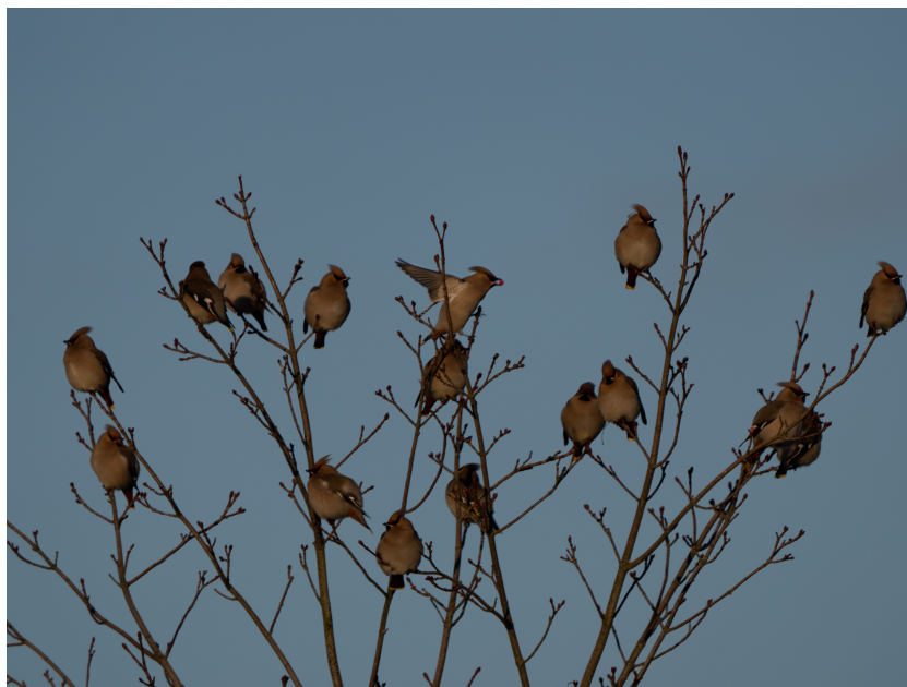
A flock of Bohemian Waxwings enjoying berries off a nearby tree observed on 30 th March 2022.

Various species of ducks were once again present floating on the sea surface during our ferry crossing back to the mainland. We resumed birding in mainland Estonia en route to our next guesthouse. The drive to Tuhi Bog proved fruitful as a Black Grouse was observed grazing from the van. We quickly got off the van to get a better look with the spotting scope and binoculars. One of them flew just in front of us drawing our attention to 2 others which were nearby. Later we also added a Middle Spotted Woodpecker and a Eurasian Nuthatch to our trip list during a brief visit to a park in Audru. Later, we headed to Klaaramanni guesthouse that we made our home for the next two days. After dinner we tried to locate a Tawny Owl which was calling from the forest behind our guest house. Unfortunately the bird could not be located and headed to bed hoping for better luck the following day.