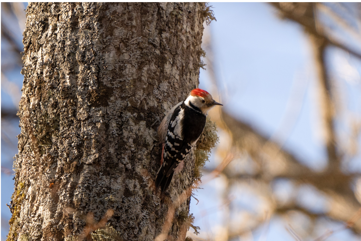
Top: Long tailed ducks and bottom: Middle spotted woodpecker