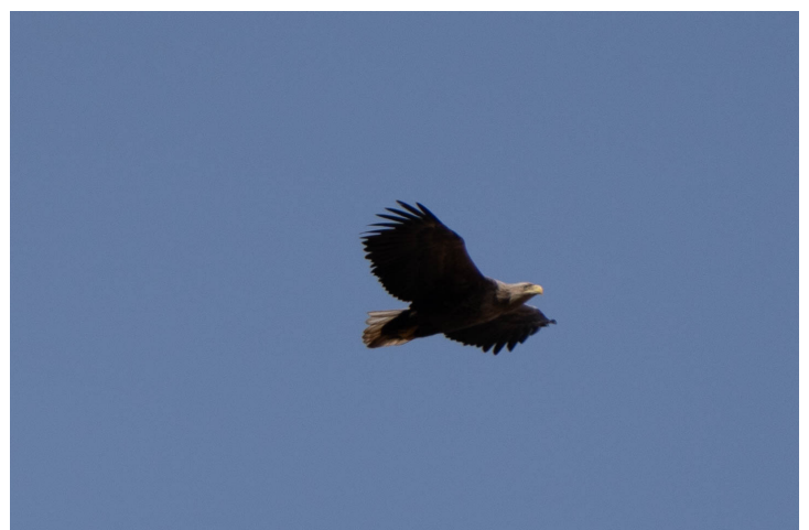
Tree creeper top & White tailed eagle bottom