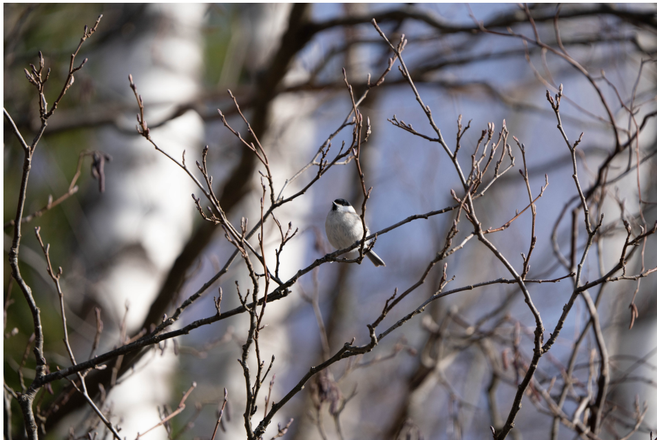
Top: Crested tit and bottom: Marsh tit