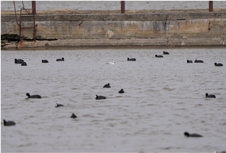
A male Smew showing prominently among a flock of coots

After we had dinner from the guesthouse we took a short walk close to the hotel in an attempt to see Woodcocks . Our efforts paid off as 4 Woodcocks were observed and circa 20 red deer running after each other crossed the street in front of us.