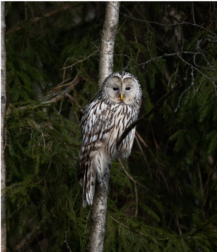
Ural Owl observed on the first day of the trip 27 th March 2022.

We arrived in Tallinn by Ryanair and found our guide Uku Paal waiting for us at the airport. En route to our planned lunch at Tallinn we saw flocks of geese mainly Greater White-fronted Geese migrating in large flocks. Our next stop after lunch was an owl session in Padise area. On our way, a pair of Grey Partridges was seen crossing the road until we arrived at a clearing where we had a raptor fest mainly Common Buzzard , White-tailed Eagle and Rough-legged Buzzard all seen hunting. The Eurasian Tree Creeper soon made an appearance immediately upon reaching Padise area. It was not long until we had excellent views of two Ural Owls seen in the image below which was one of the highlights of the trip for many. On our way to the guest house, our first male Hen Harrier and Curlew of the trip were spotted and not long after, the red fox got our mammal list up and running. Good numbers of Yellowhammers that were seemingly ever present throughout the trip were heard and observed flying. We stayed at Altmõisa guest house for our first night.