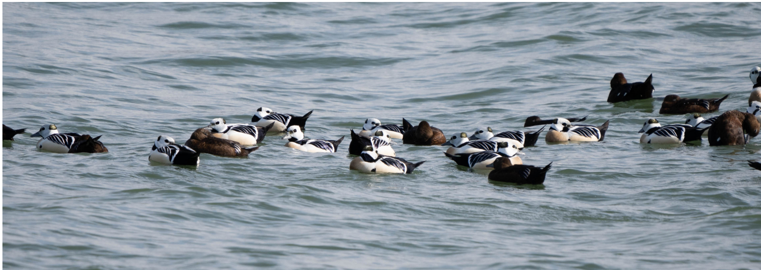
Top: Crossbill and bottom: The Steller's Eiders observed from Saaremaa Sadam