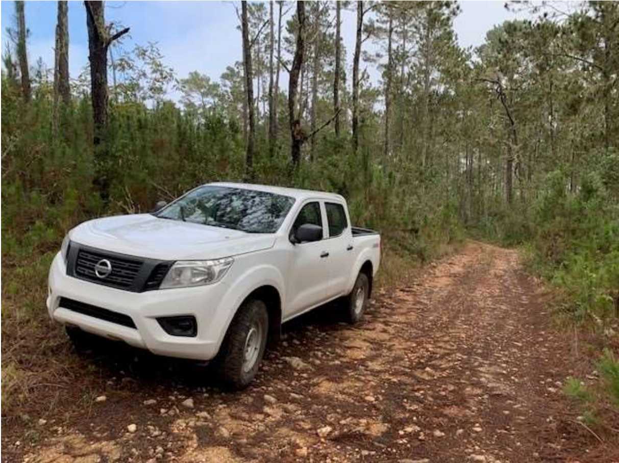
The Crossbill site above Zapoten

After having lunch at Zapoten station ( and trying without luck at a supposed good spot 200 m higher for White-fronted Quail Dove) we drove back down, stopping at Agua Cate where we saw Loggerhead Kingbird in the tree next to the station building at 18.329944, -71.70025.