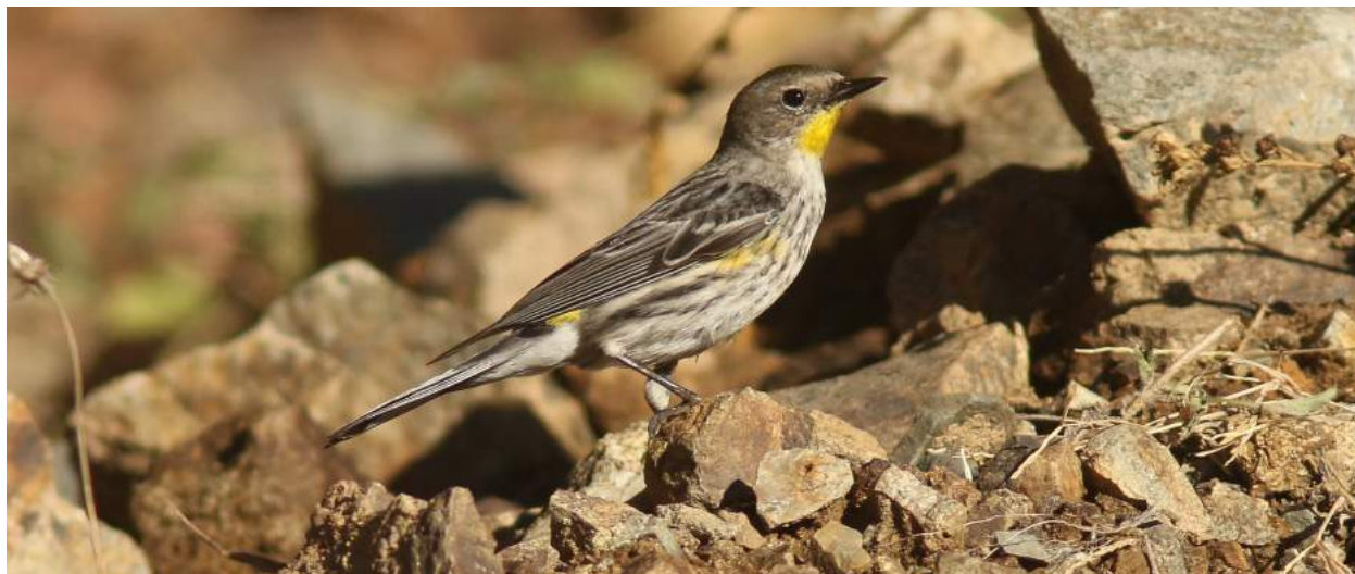
Audubon's Warbler Setophaga audeboni – Durango Highway