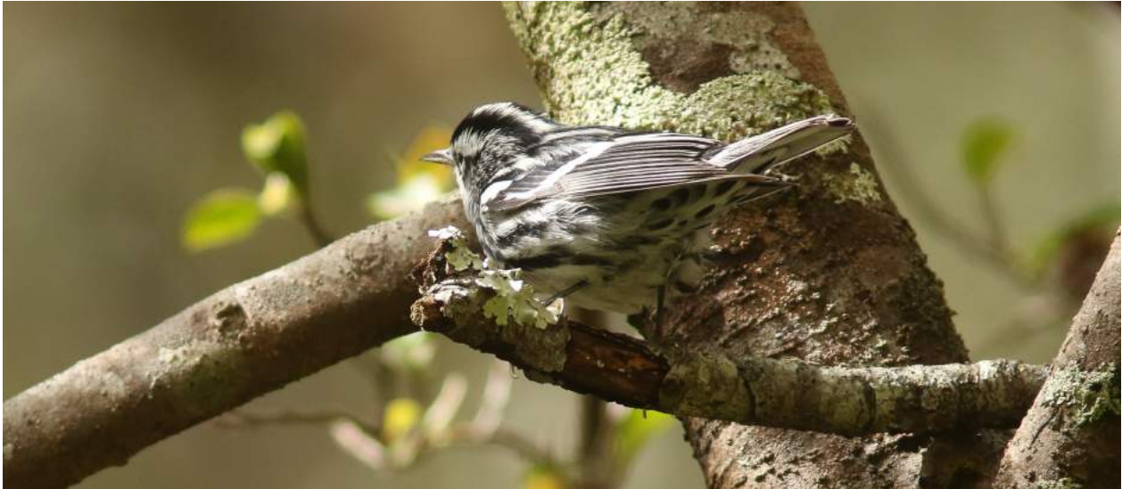
Black and White Warbler Mniotilta varia – Barranca Rancho Libre