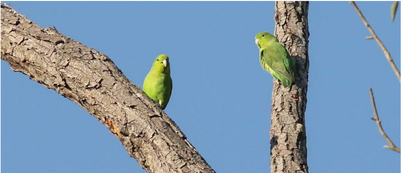
Mexican Parrotlet Forpus cyanopygius

Other notable species encountered were Mexican Parrotlet, Plain-capped Starthroat, Ivory-billed Woodcreeper, Buff-breasted Flycatcher, Curve-billed Thrasher, Collared Forest Falcon, White-throated Thrush, Virginia's Warbler, Black-capped Vireo, American Bushtit, Rusty-crowned Ground-Sparrow and Cinnamon-rumped Seed eater .