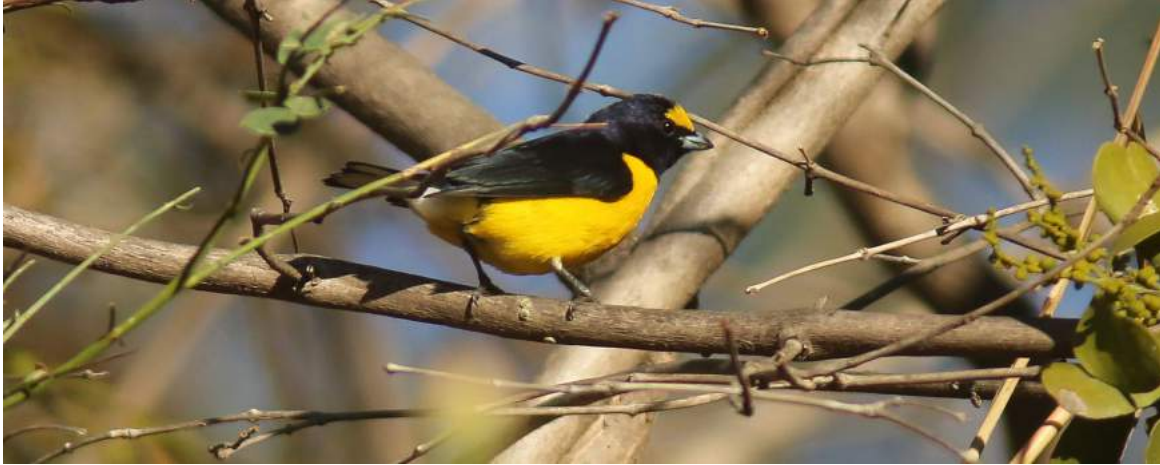
West Mexican Euphonia Euphonia godmani

This morning gave us a real boost to our list of observations.