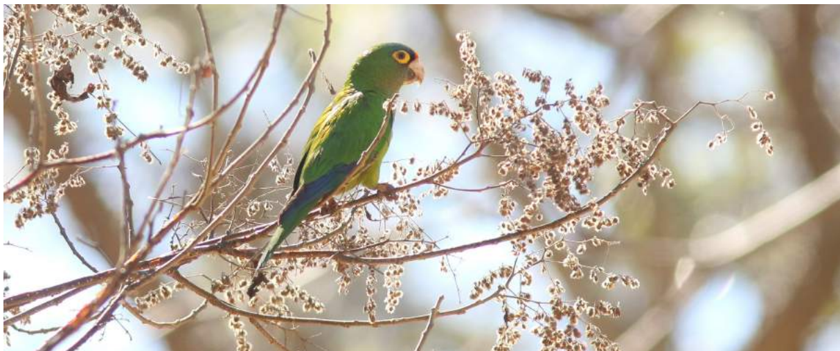
Orange-fronted Parakeet Aratinga canicularis – Panuco Road