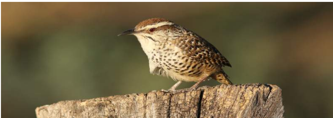
Spotted Wren Campylorhynchus gularis