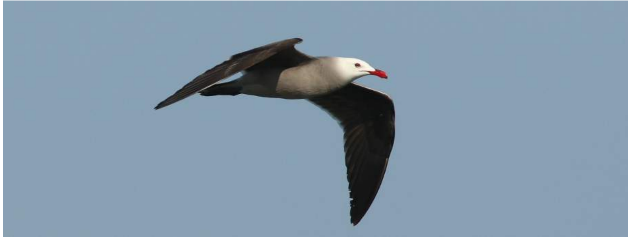
Heermann's Gull Larus heermanni – harbour of Barra de Navidad