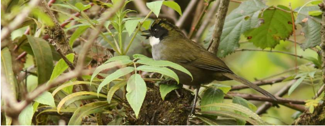
Green-striped Brushfinch Atlapetes virenticeps

Pine Flycatcher was a target species for one of us but we could not find it.