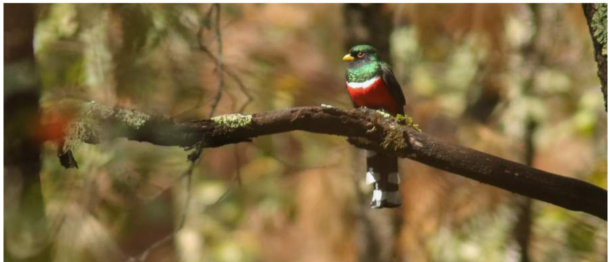
Mountain Trogon Trogon mexicanus – Barranca Rancho libre