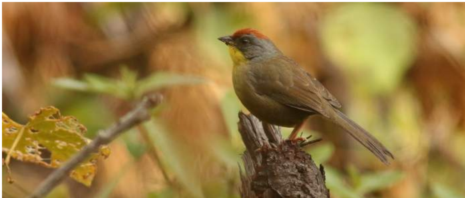
Rufous-capped Brushfinch Atlapetes pileatus