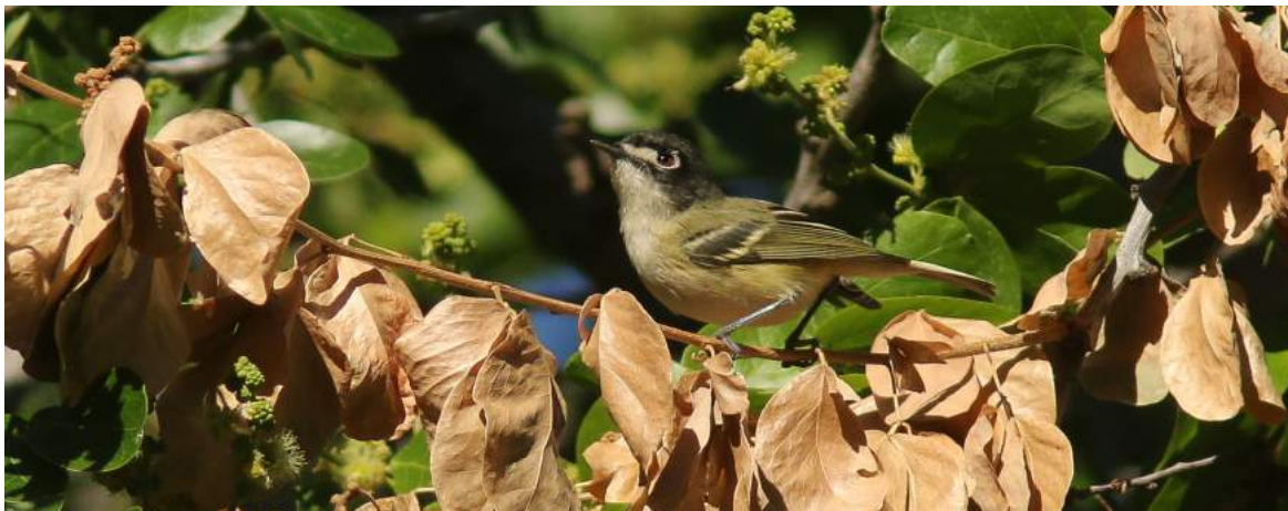
Black-capped Vireo Vireo atricapillus