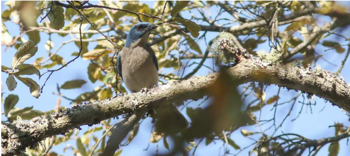
Transvolcanic Jay Aphelocoma ulytamarina

Several times we had excellent views of a small group of Transvolcanic Jays .