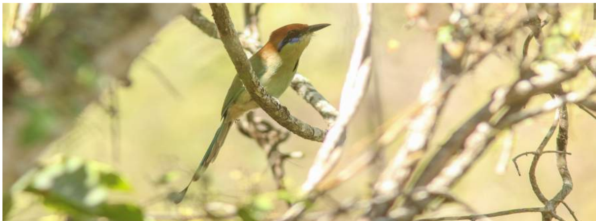
Russet-crowned Motmot Momotus mexicanus – Panuco Road