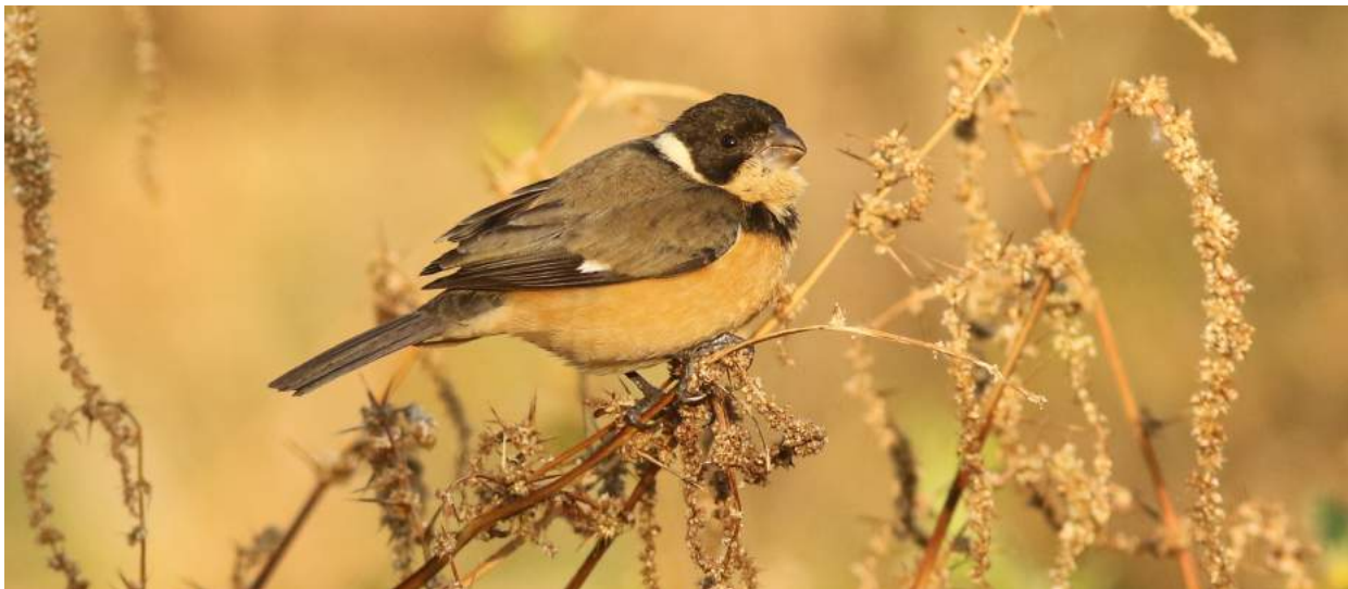
Cinnamon-rumped Seedeater Sporophila torqueola