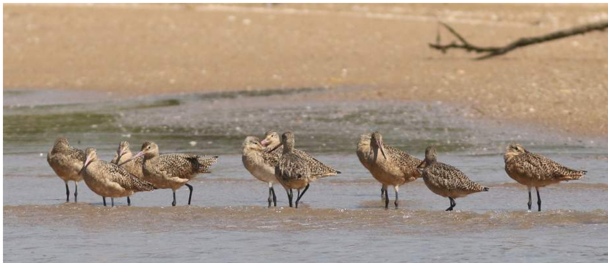
Marbled Godwits Limosa fedoa – harbour of Barra de Navidad