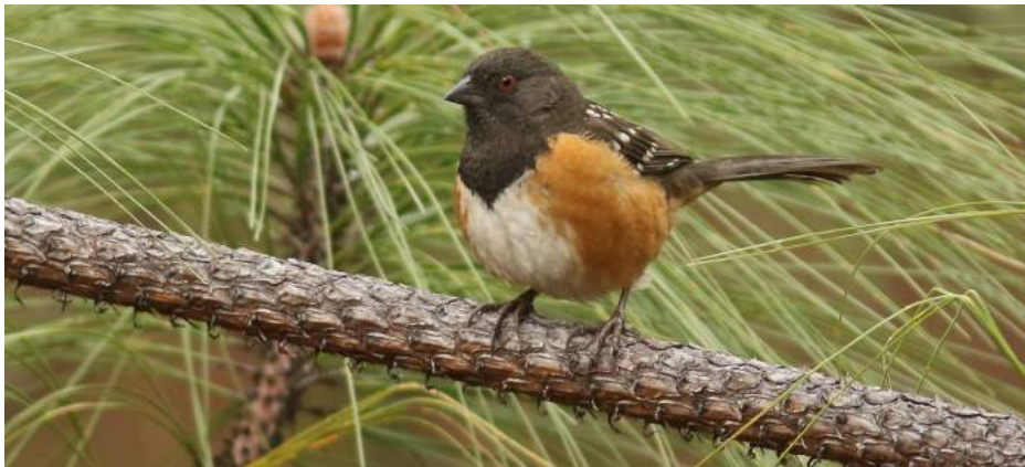
Spotted Towhee Pipilo maculatus