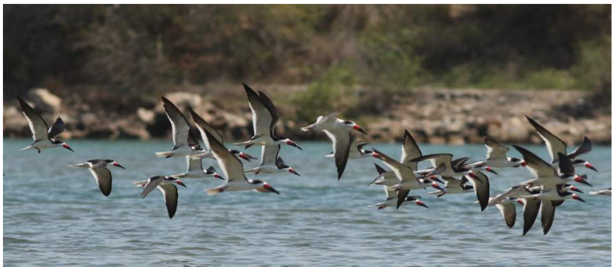
Black Skimmers Rynchops niger – harbour of Barra de Navidad