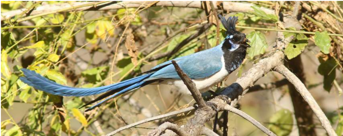
Black-throated Magpie Jay Calocitta colliei