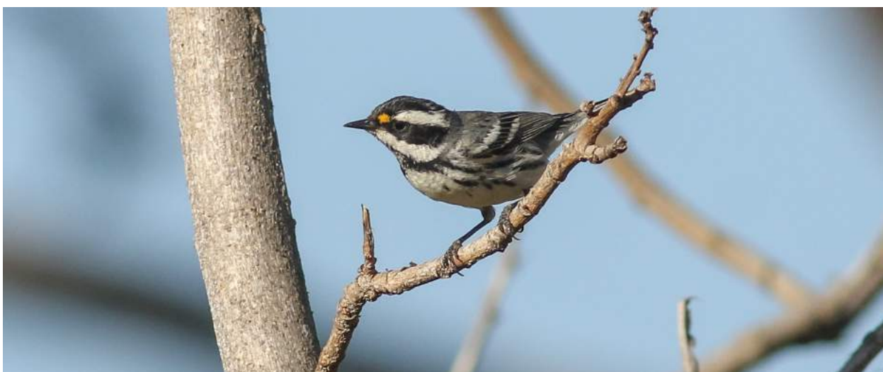
Black-throated Grey Warbler Dendroica nigrescens – Volcan de Fuego area.