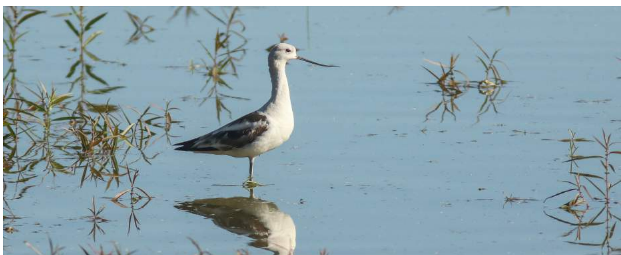
American Avocet Recurvirostra americana – San Blas