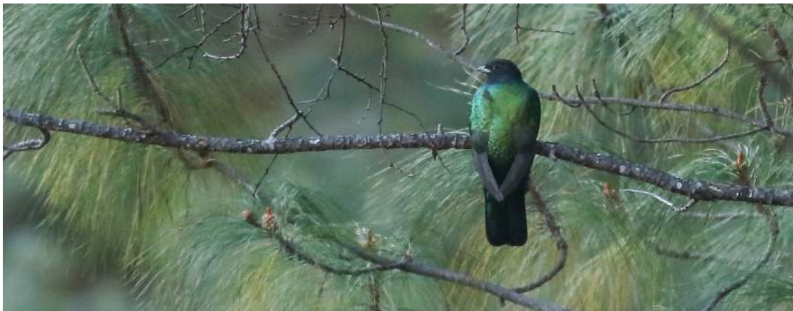
Eared Quetzal Euptilotis neoxenus

In the end we estimated that the flock contained between 15 to 20 individuals. Amazing.