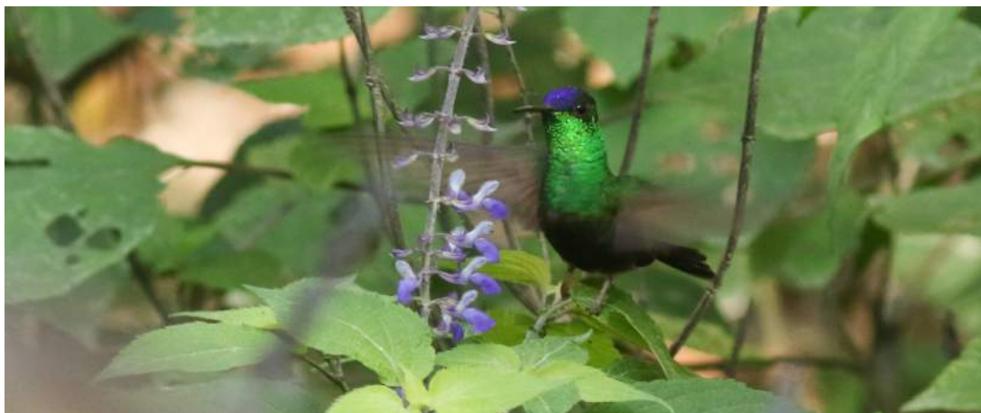
Mexican Woodnymph Thalurania ridgwayi

We finally succeeded in observing several times a female Bumblebee Hummingbird at some flower banks. In the same area Mexican Woodnymph gave great views.