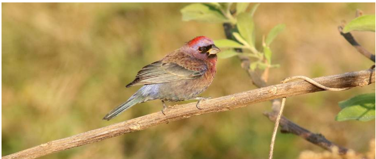
Varied Bunting Passerina versicolor