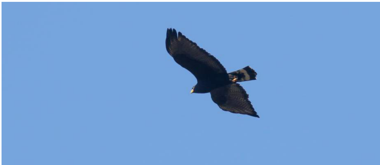
Zone-tailed Hawk Buteo albonotatus – Panuco Road.