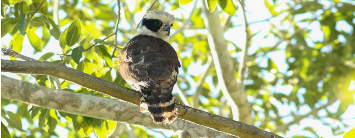
Laughing Falcon Herpetotheres cachinnans

Afterwards we visited another nearby track where we searched for Flammulated Flycatcher and Red-breasted Chat but we failed to find these species.