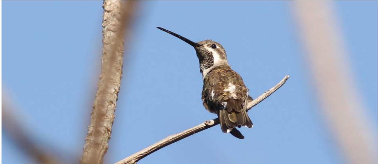
Plain-capped Starthroat Heliomaster constantii