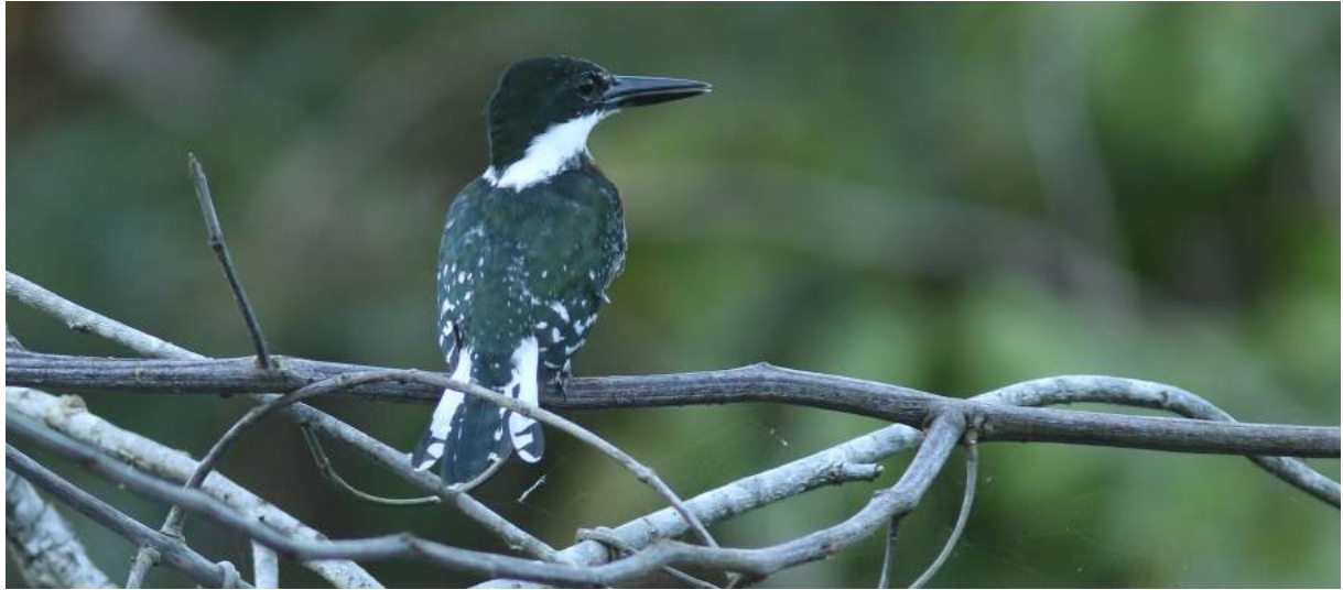
Green Kingfisher Chloroceryle americana – La Tovarà boat trip