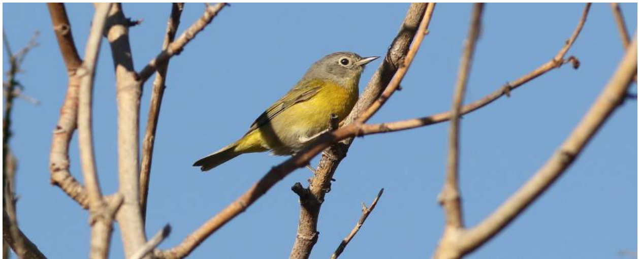
Nashville Warbler Vermivora ruficapilla – Volcan de Fuego area.