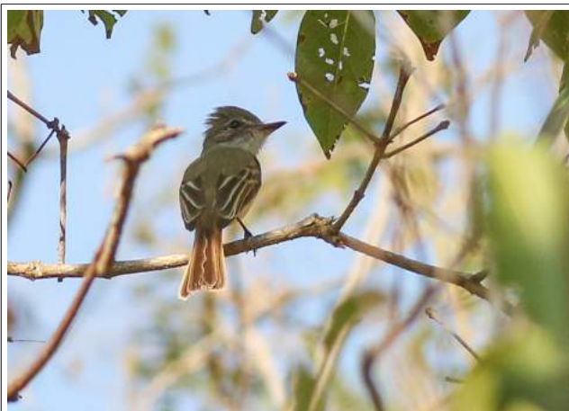
Flammulated Flycatcher Myiarchus flammulatum