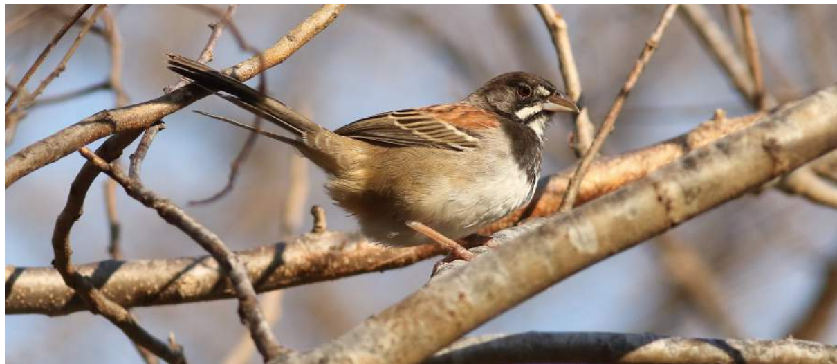
Black-chested Sparrow Aimophila humeralis