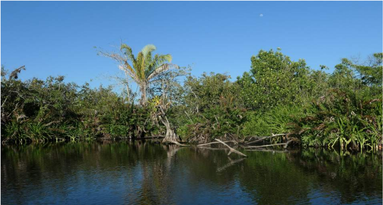
La Tovar boat trip