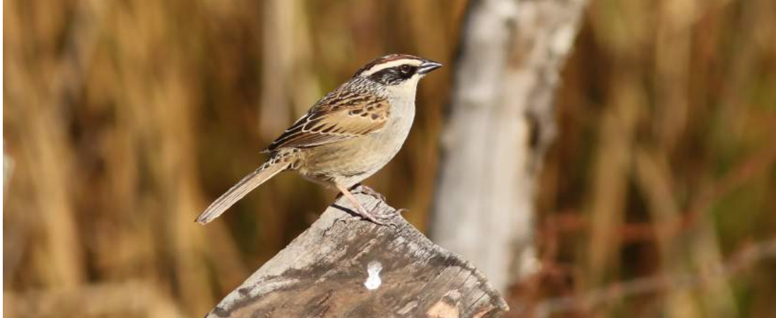
Striped Sparrow Oriturus superciliosus