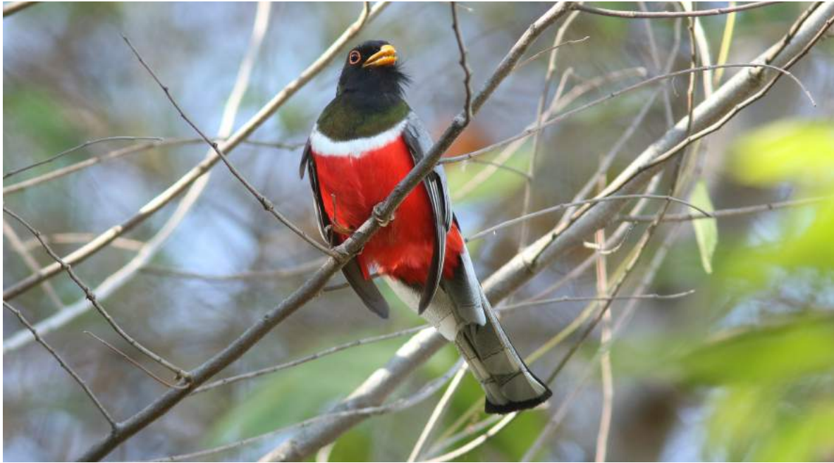
Elegant (Coppery-tailed) Trogon Trogon elegans ambiguus – Panuco Road