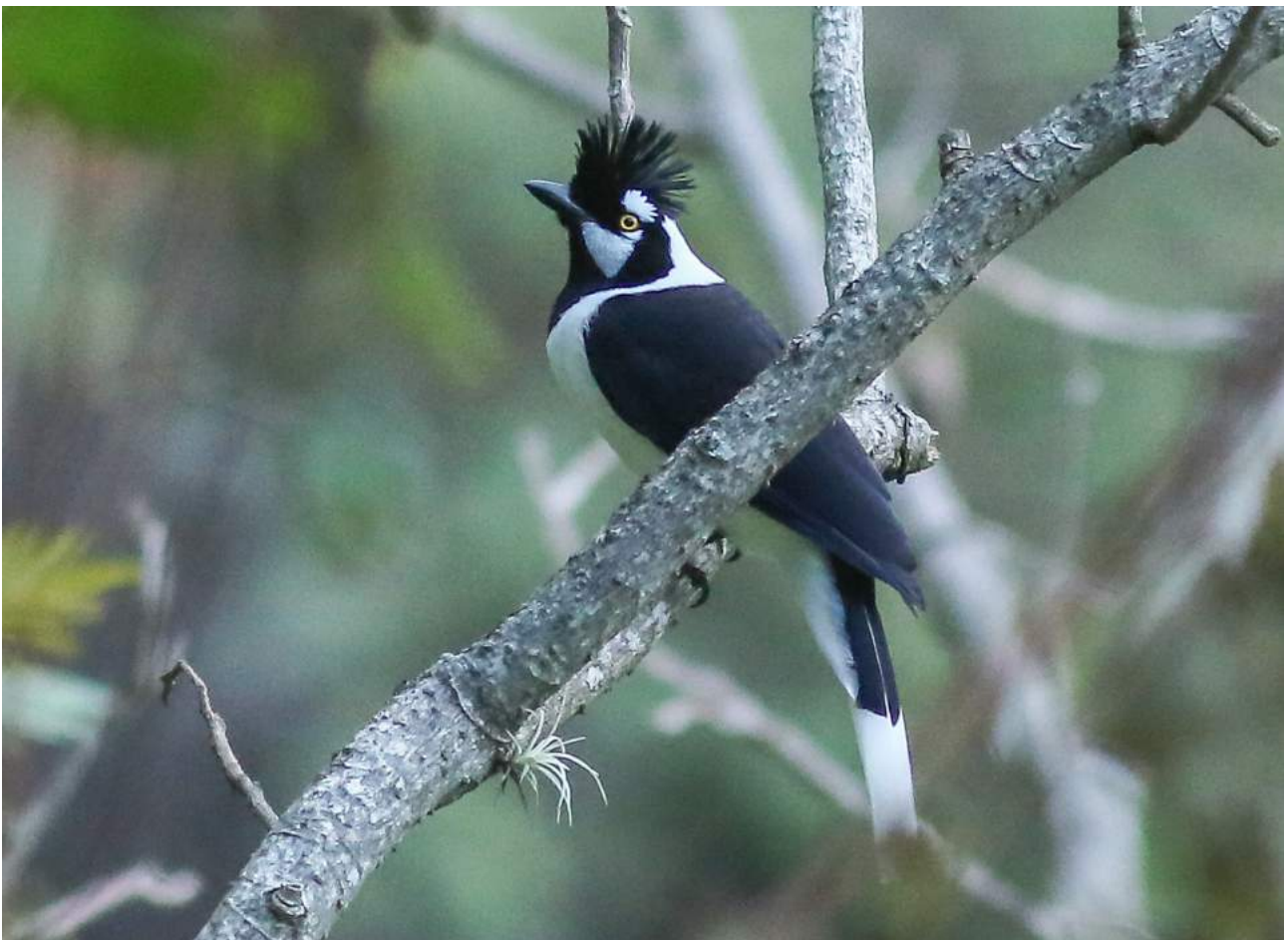
Tufted Jay Cyanocorax dickeyi