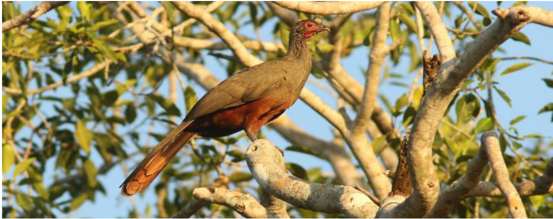
Rufous-bellied Chachalaca Ortalis wagleri