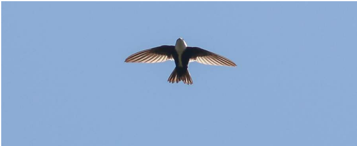
White-throated Swift Aeronautes saxatalis

Another target species encountered this morning was Dwarf Vireo but we failed to find Slaty Vireo . Other species recorded this morning include West Mexican Chachalaca , a flock of White-throated Swifts , Olive Warbler and Grey-barred Wren