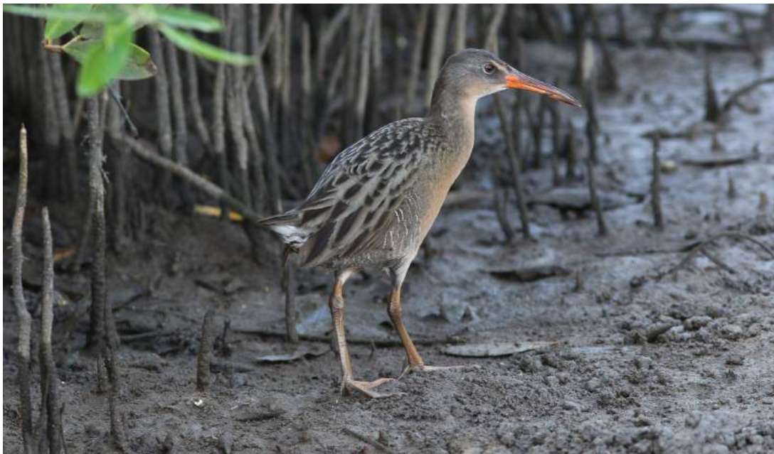
Ridgway's Rail Rallus obsoletus

At this site we had fantastic and close views of the rail. Several Black Hawks performed brilliantly and some fishponds gave a small selection of waterbirds including a fine drake Redhead .