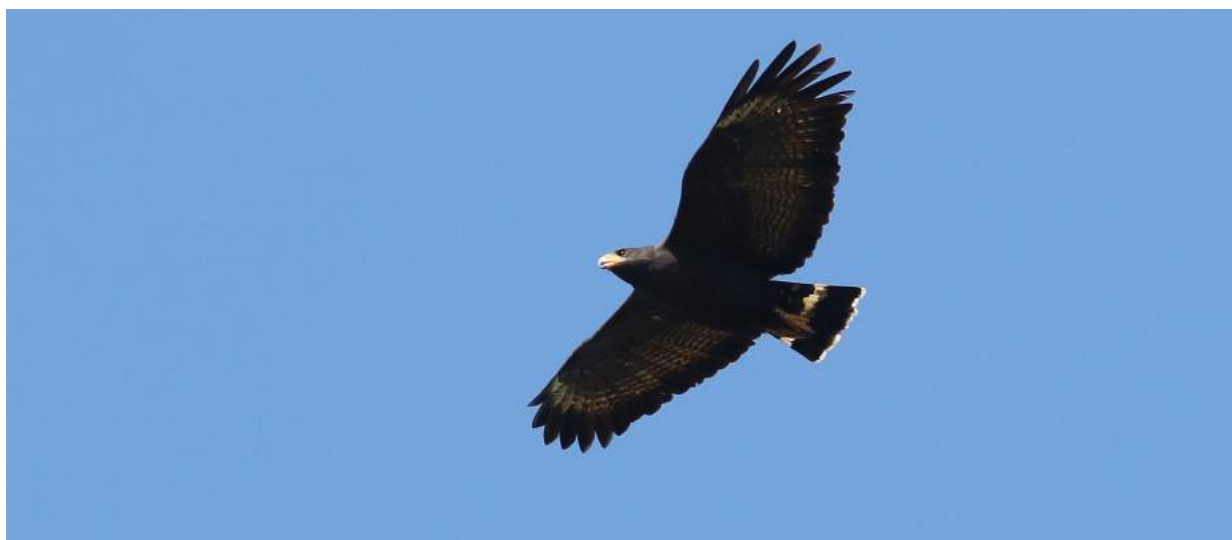
Common Black Hawk Buteogallus anthracinus – San Blas mangrove area