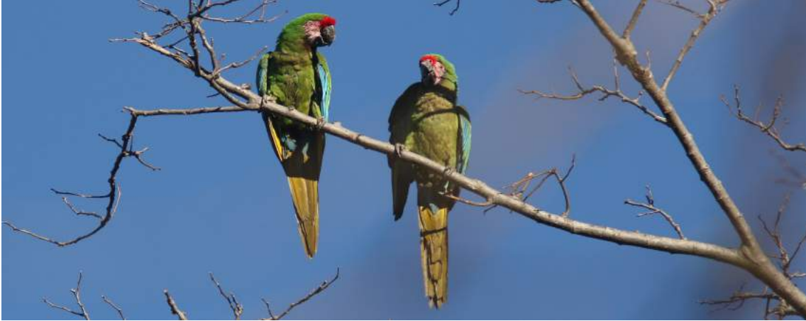
Military Macaw Ara militaris

Elegant Trogon subspecies ambiguus , Golden-cheeked Woodpecker , Pale-billed Woodpecker , Greater Pewee , Western Flycatcher , a single Nutting's Flycatcher , Thick-billed Kingbird , Happy Wren , Sinaloa Wren , Blue Mockingbirds , Rusty-crowned Sparrow Lark , Yellow Grosbeak , Cinnamon-bellied Saltator , Western Tanager , West Mexican Euphonia , Audubon's Warbler , Black-throated Grey Warbler , Wilson's Warbler , Fan-tailed Warbler , a fine Black-capped Vireo , Golden Vireo , a single Plumbeous Vireo , Yellow-breasted Chat , Hooded Oriole and Orchard Oriole .