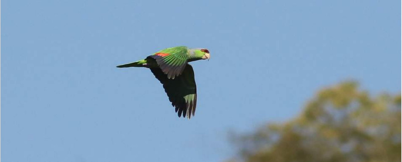
Lilac-crowned Amazon Amazona finschi

During our birding session we had very good views of Lilac-crowned Amazons passing by several times at close range.