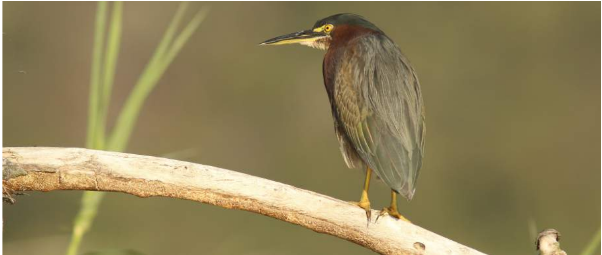
Green Heron Buteo virescens Tovarà boat trip