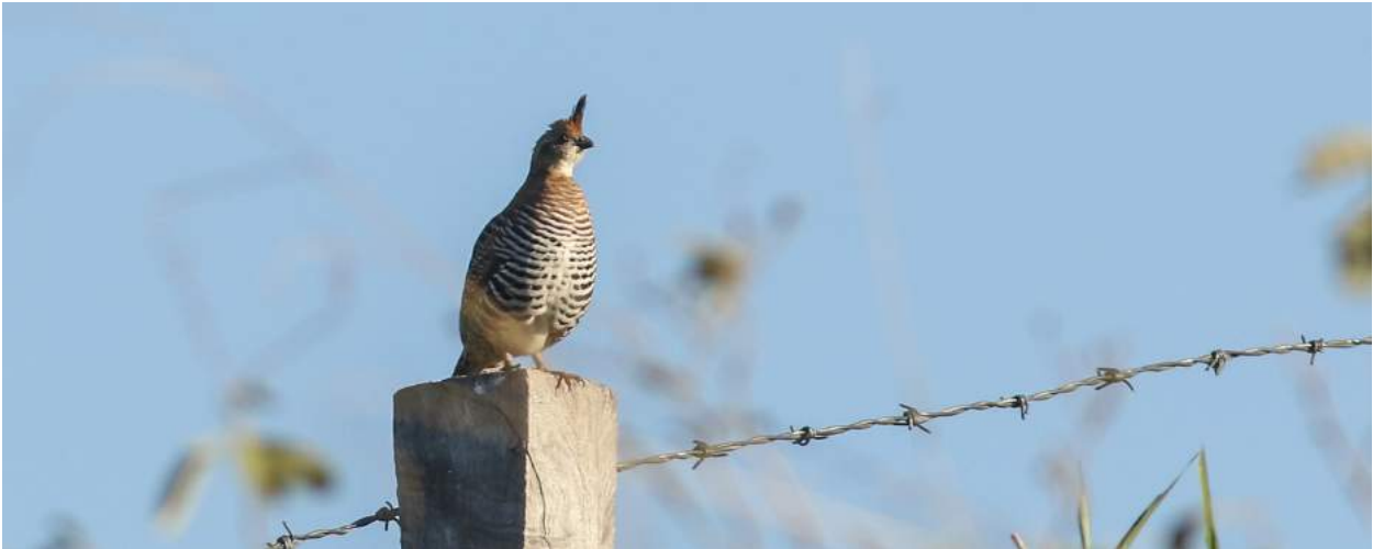
Banded Quail Philortyx fasciatus