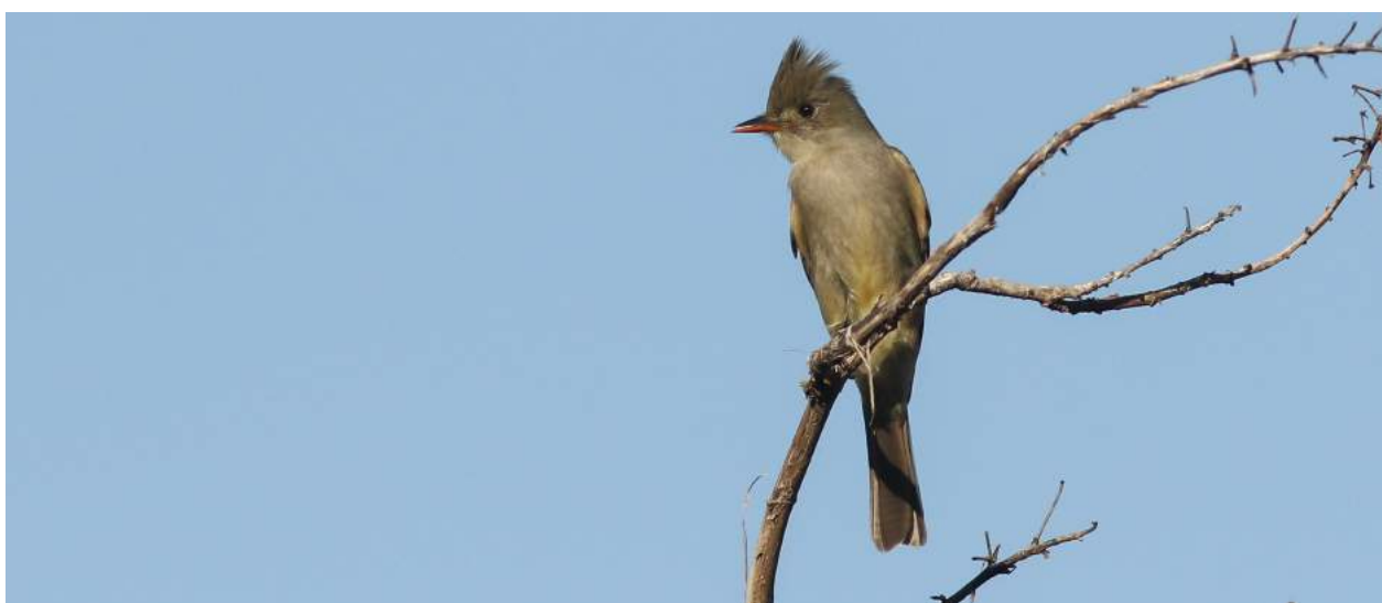
Greater Pewee Contopus pertinax – Volcan de Fuego area