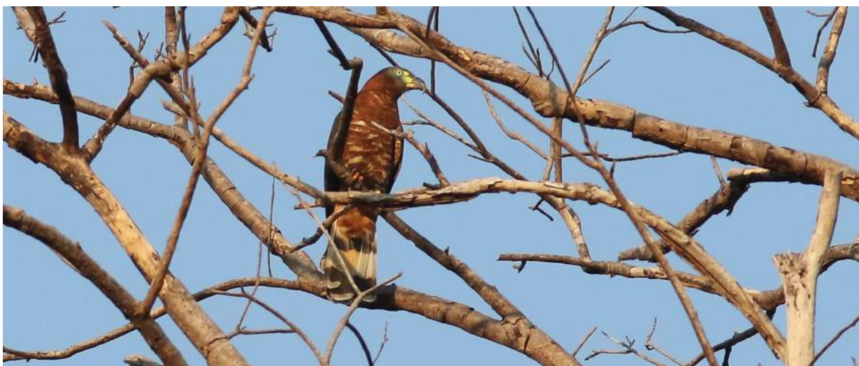
Hook-billed Kite Chondrohierax uncinatus – Playa de Oro Road