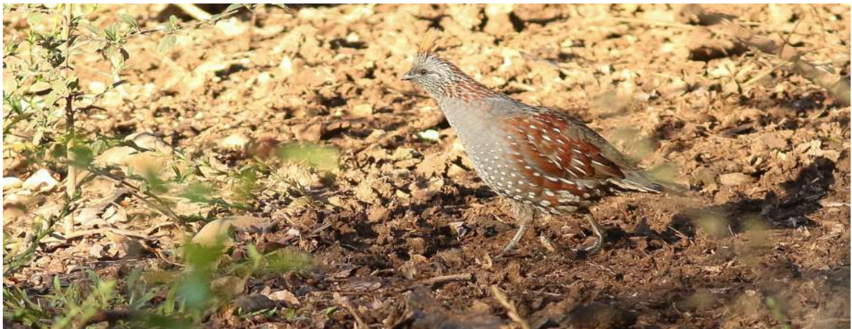
Elegant Quail Callipepla douglasii

We obtained excellent views of several birds, walking completely in the open on the meadows along this road.