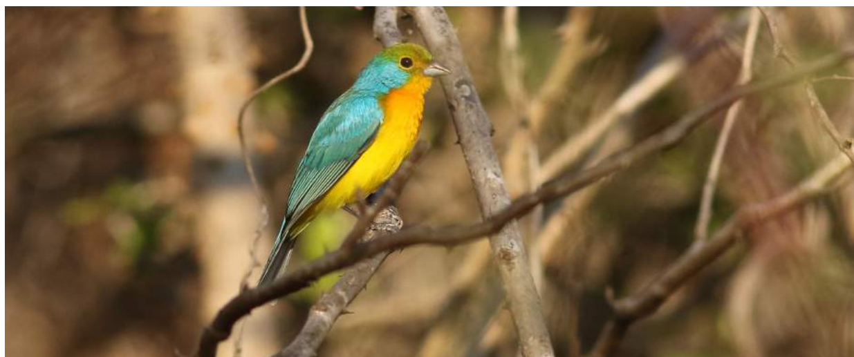
Orange-breasted Bunting Passerina leclancherii