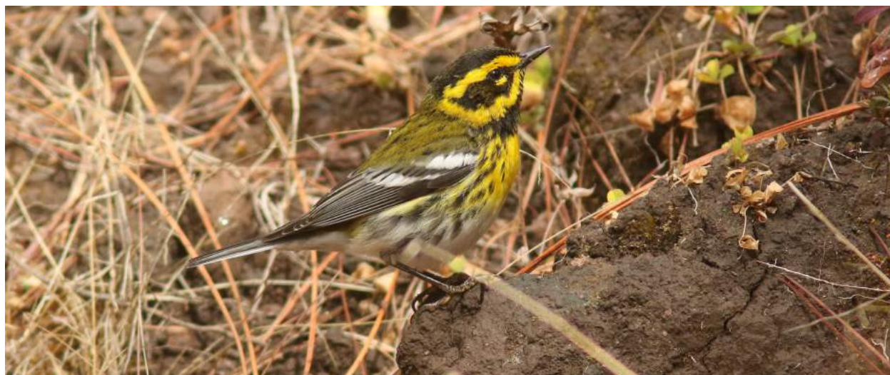
Townsend's Warbler Dendroica townsendi – Durango Highway