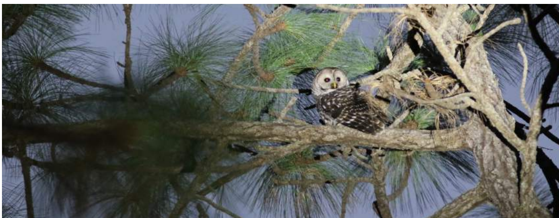
Cinereous Owl Strix sartorii

We quickly went back up and had fantastic views of a Cinereous Owl .