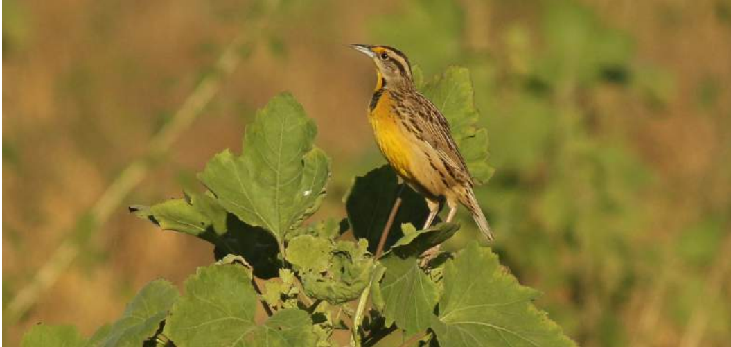
Chihuahuan Meadowlark Sturnella lillianae