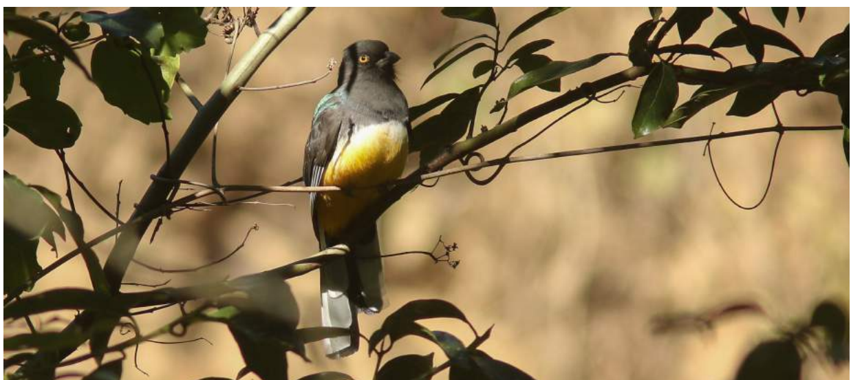
Citreoline Trogon Trogon citreolus – Panuco Road