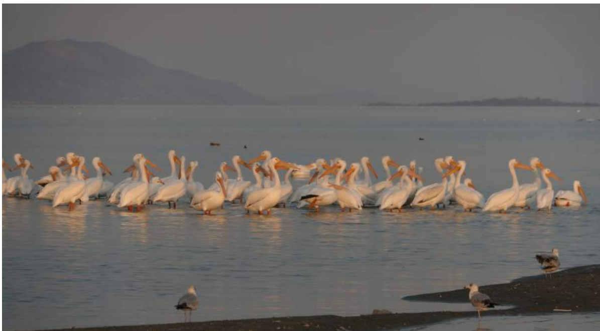
American White Pelican Pelecanus erythrorhynchos

Early evening Antonio dropped us at a hotel close to the airport of Guadalajara.