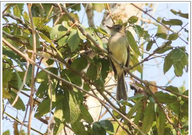
Flammulated Flycatcher Myiarchus flammulatum

Other species observed along this road include West Mexican Chachalaca , Hook-billed Kite , Golden-crowned Emerald , Lilac-crowned Amazon and at the end of the track near the beach we heard Lesser Ground Cuckoo which we had all seen before.