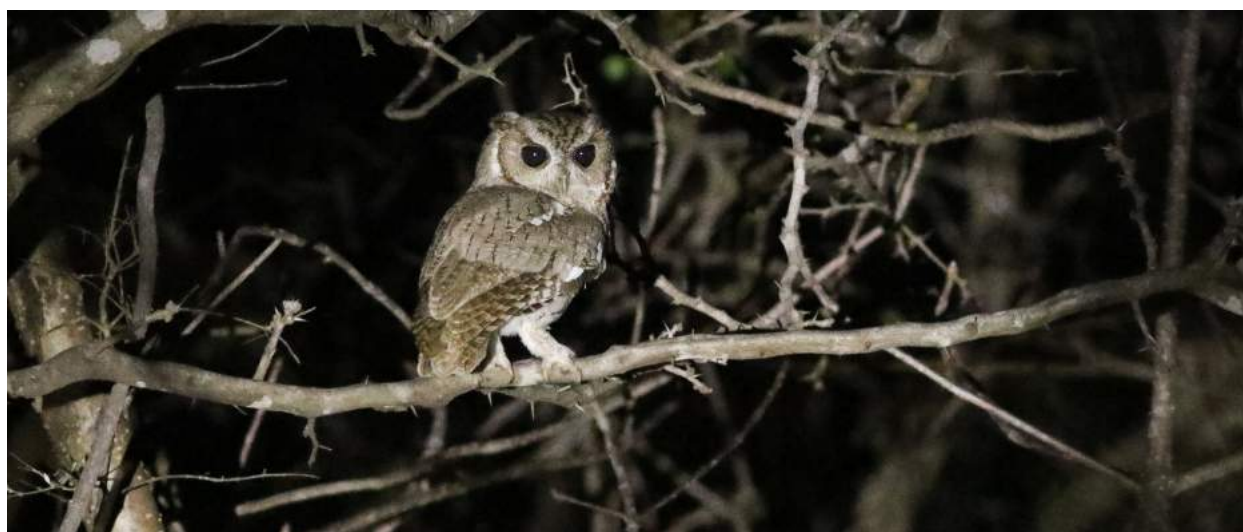
Balsas Screech-Owl Otus seductus