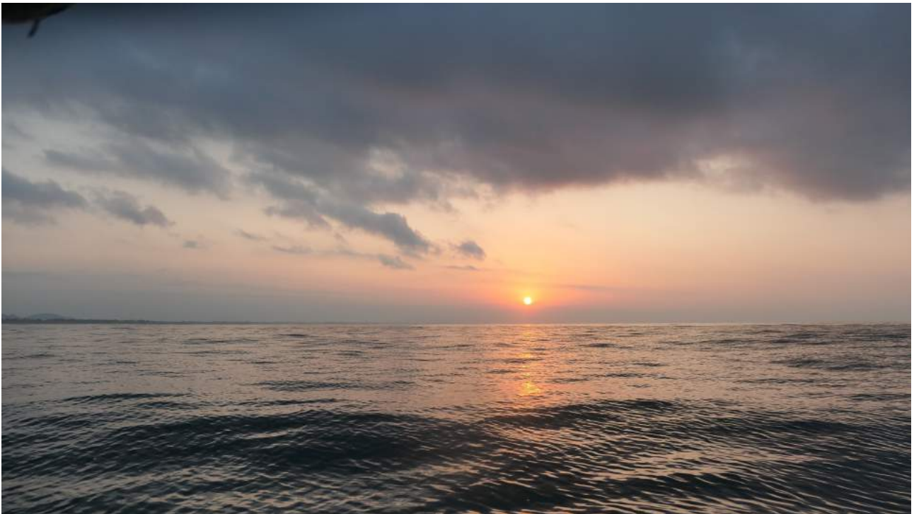
Sunset at Barra de Navidad