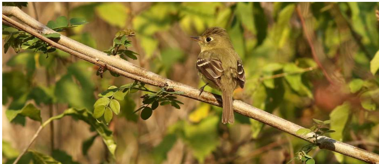
Western Flycatcher Empidonax difficilis – Playa de Oro Road.