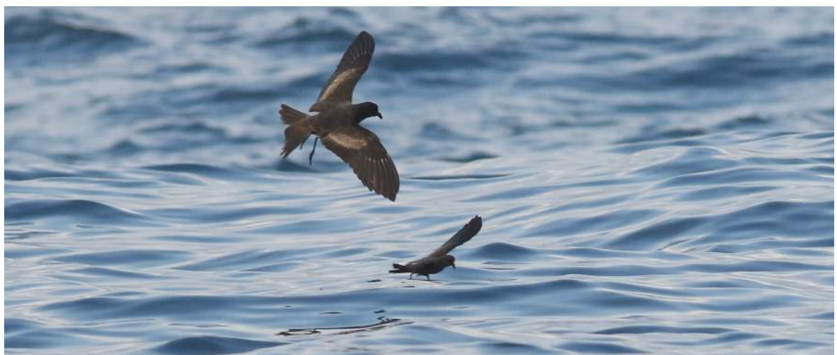
Black and Least Storm Petrel