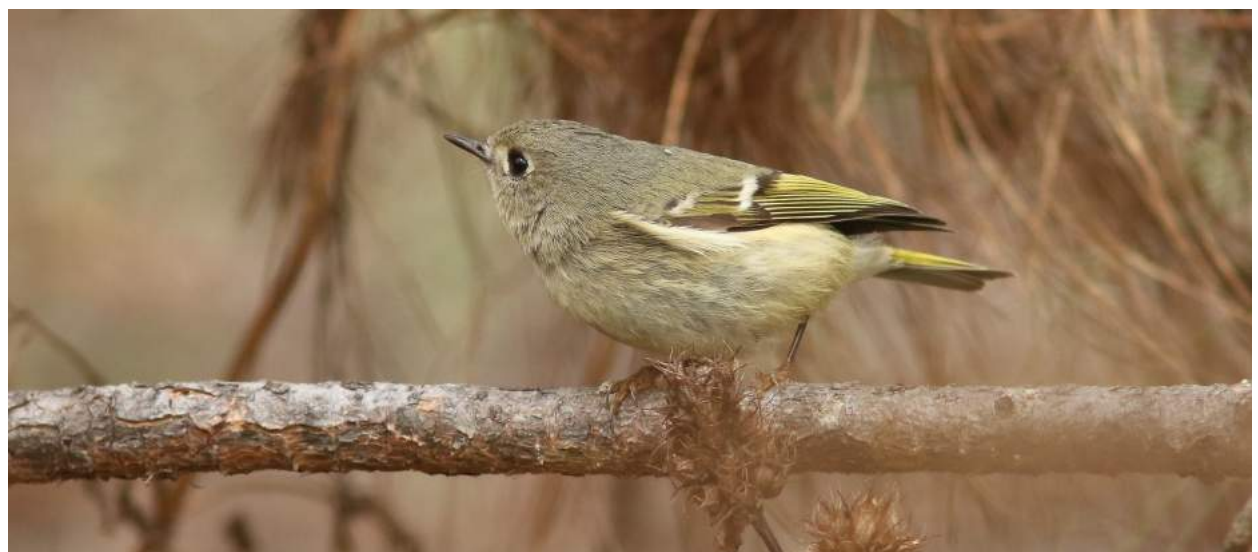
Ruby-crowned Kinglet Regulus calendula – Durango Highway