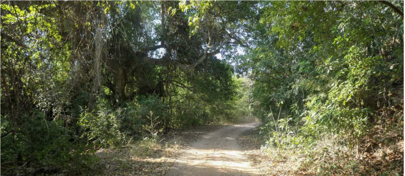
Playa de Oro Road

We birded two hours along this road. Our targets were Flammulated Flycatcher and San Blas Jay . The flycatcher gave fine views but we failed to find the jay.