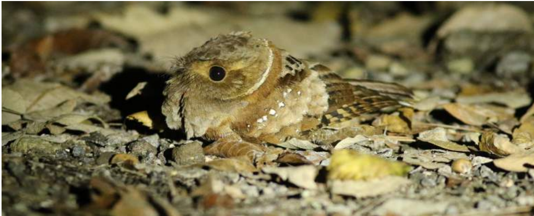
Eared Poorwill Nyctiphrynus mcleodii

We had absolutely fabulous views of an Eared Poorwill on the track but Mexican Whip-Poorwill was only heard.