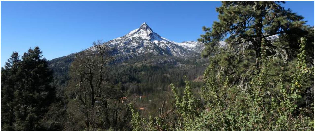
View of Volcan de Nieve

But not today. Many, mostly big SUV's, were driving up the road today. Apparently the storm we encountered during the first days of our trip had brought fresh snow to the mountain which resulted in the fact that the Volcan de Nieve was really covered in snow. And today was a beautiful sunny day with great blue skies and so many people drove up the road to see the snow-covered peak in glorious sunshine