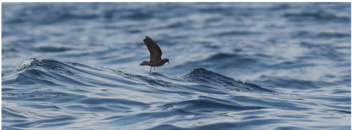
Least Storm Petrel Oceanodroma microsoma