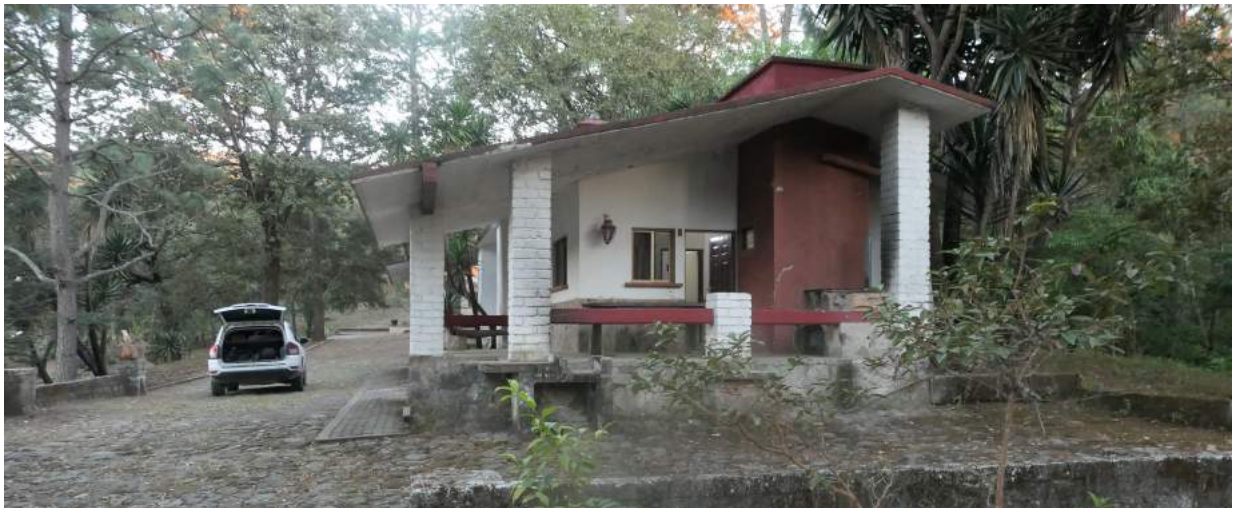
Cabins at La Noria, Cerro de San Juan

At 6 am we left San Blas for our one hour drive to La Noria, Cerro de San Juan. We birded a full morning along the main track just passed the area of the cabins.