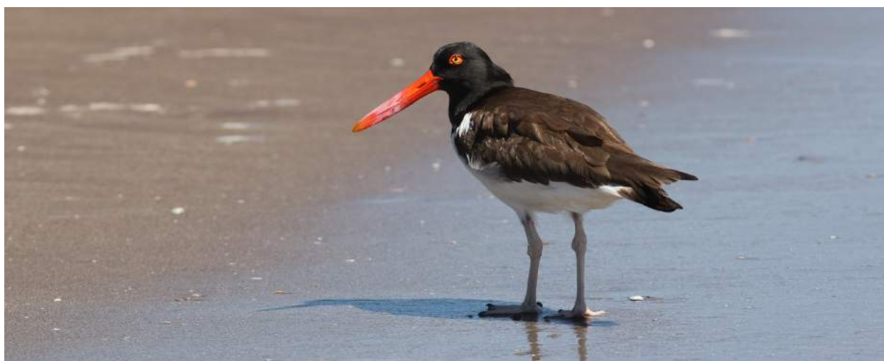
American Oystercatcher Haematopus palliatus – San Blas