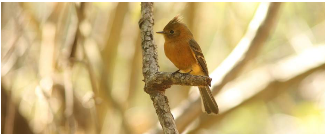
Northern Tufted Flycatcher Mitrephanes phaeocercus