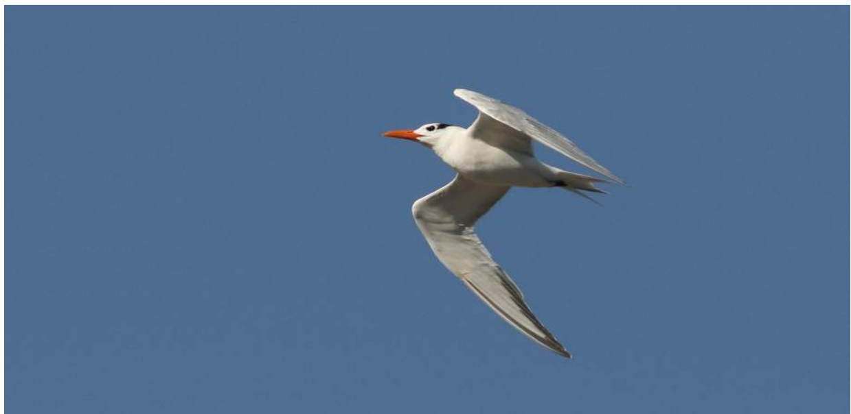
Royal Tern Sterna maxima – harbour of Barra de Navidad