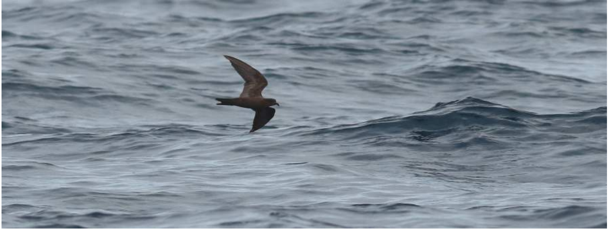
Black Storm Petrel Oceanodroma melania

After five hours we arrived back at the harbour around noon.