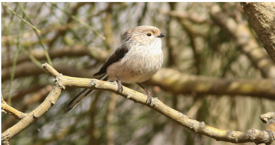
Long-tailed Tit Aegithalos caudatus siculus

After a short drive we turned right at 37.796713, 15.062857 towards Ristorante Monte Conca, which is situated around 1800 meters of altitude. But unfortunately it started to snow heavily and we decided to turn around.