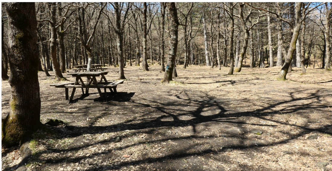
the picnic site at Piano Donavitta, along the Via Mareneve.

The next half hour we tried to lure the Marsh Tit into view but I only had a few fleeting views of the bird. We had lunch at this site and decided to check other areas further along the road. (Via Mareneve)