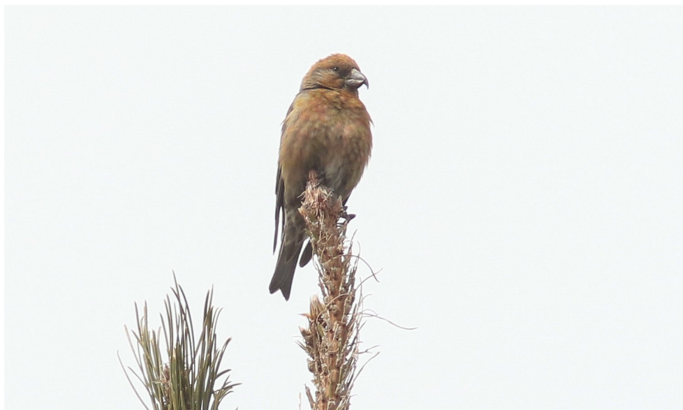
Red Crossbill Loxia curvirostra poliozona