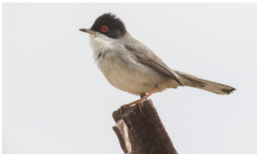
Sardinian Warbler Sylvia melanocephala