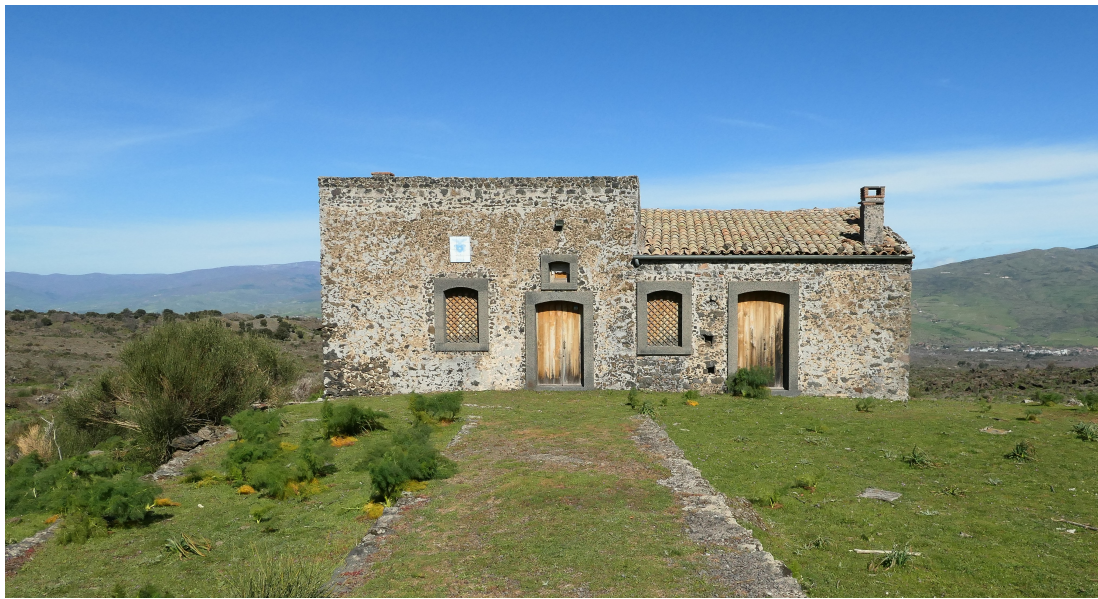
Refugio Case Giusa

We did have nice and lengthy views of a patrolling fox.