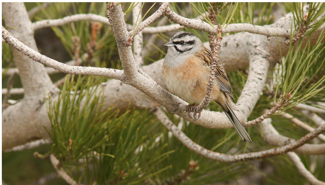
Rock Bunting Emberiza cia

As we were not very far from a site where a Dutch birder had observed Sicilian Partridge a few years ago we decided to drive to that site. We arrived at the site along the SP92 at 4 pm and birded around for a time but nothing moved. When we returned to the car I noticed a small track on the opposite side of the road and we decided to check that out. When I randomly played the call of the partridge we suddenly had a response.