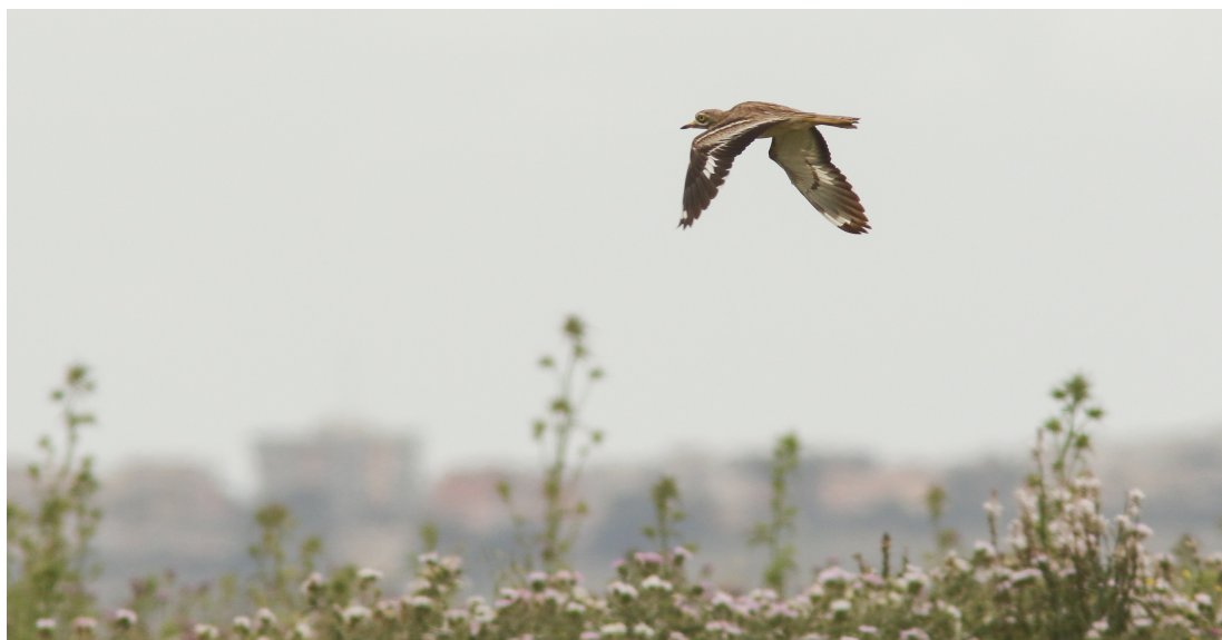
Eurasian Stone Curlew Burhinus oedicnemus saharae