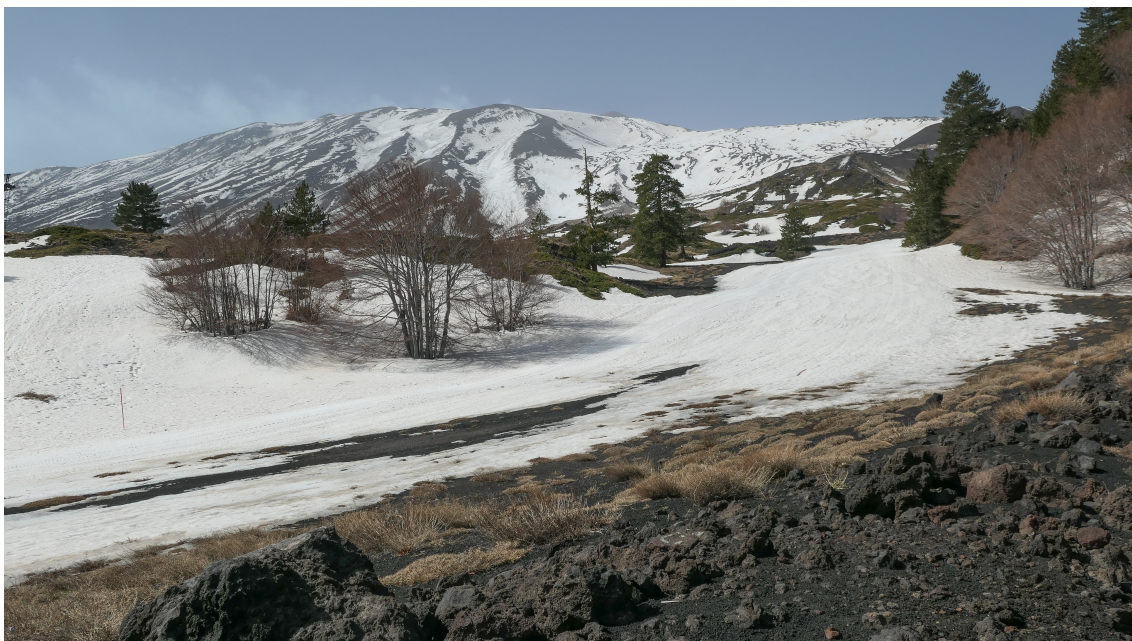
The area around ristorante Monte Conca.

We birded for an hour around ristorante Conca and among the snow patches we located several Rock Buntings , a singing young male Red Crossbill , many Chiffchaffs , Coal Tits and a vocal Marsh Tit which gave brief but fine views.