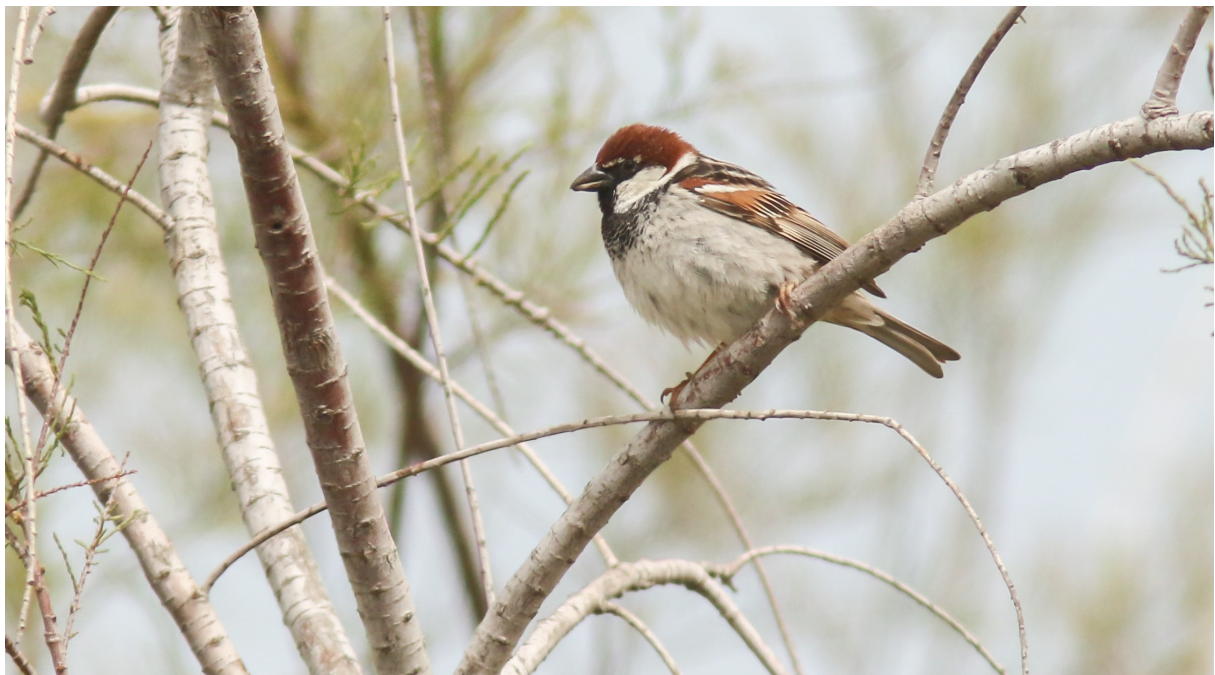
Italian Sparrow Passer italiae