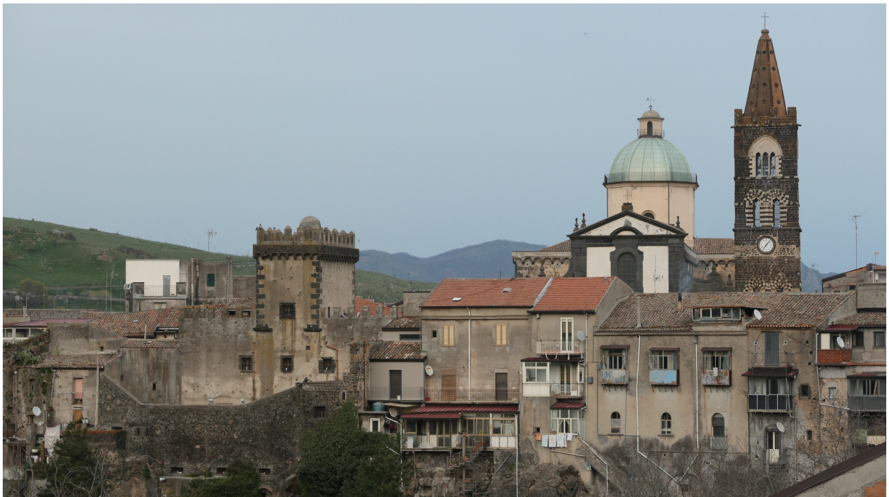
Randazzo, village just north of the Etna area.

In the evening we had dinner in the center of Randazzo. (restaurant La Bifora)