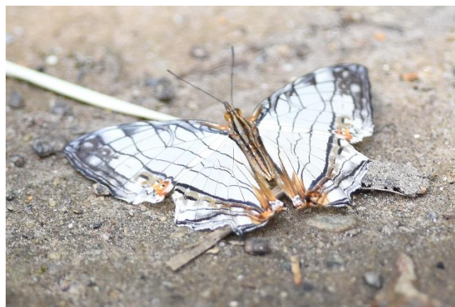
Oriental Map Butterfly

that made our journey into the plains slower than usual. After our final picnic lunch, we bid farewell to our ground crew and slowly made our way to the border town of Gelephu where we would spend our last night in Bhutan. With a couple of hours before dusk we explored our surroundings. It was evident from the birdlife that we were now well out of the hills, finding species associated with the Brahmaputra plains such as Citrine Wagtail, Lesser Whistling Duck, Lesser Adjutant, Red-wattled Lapwing, Temminck's Stint, Common Snipe, Common and Green Sandpipers, Common Kingfisher, Chestnut-headed Bee-eater and Indian Roller.