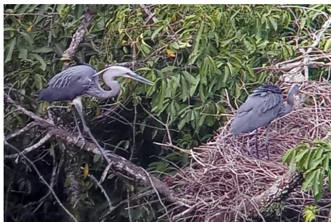
White-bellied Herons on nest

Cuckooshrike, Grey-chinned, Short-billed and Scarlet Minivets, Rufous-capped Babbler, Yellow-throated Fulvetta, Striated, Bhutan, Scaly and Chestnut-crowned Laughingthrushes, Blue-winged, Bar-throated and Red-tailed Minlas, Rusty-fronted and Hoary-throated Barwings, White-browed Fulvetta, Hodgson's Treecreeper, Yellow-browed Tit, Spot-winged Grosbeak, Red-headed and Grey-headed Bullfinches, Scarlet Finch, Black-headed and Green Shrike-babblers, Maroon Oriole, and a big selection of warblers.