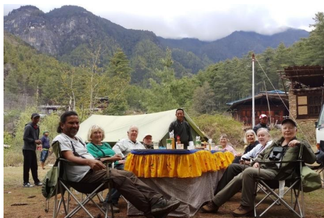
Picnic lunch below Tiger's Nest

forest, we came across Darjeeling (Pied) Woodpecker, Long-tailed Minivet, a variety of warblers including Buff-barred, Lemon-rumped, Blyth's Leaf and Green-crowned, Rufous Sibia, White-throated, Black-faced and Chestnut-crowned Laughingthrushes, Bar-throated Minla and Mrs Gould's Sunbird, before arriving back to the trailhead in time for our cooked picnic lunch. After lunch we departed for the drive to Thimphu (2350m/7710ft), Bhutan's capital city along the lateral road. The journey took most of the afternoon, with some brief stops to photograph the spectacular landscape and some historical sites, and for some good views of Nepal House Martins. We arrived early enough for a relaxed walk along the Thimphu River, reviewing some of the more common birds we'd come across over the last few days including a few Ibisbill with one on a nest, and watching a local game of darts. Local sewage ponds, usually a hotspot for some key species, were uncharacteristically quiet, but we did find Common and Green Sandpipers, Eurasian Hoopoe, White-capped Redstart, Grey Wagtail and Rosy Pipit this afternoon.