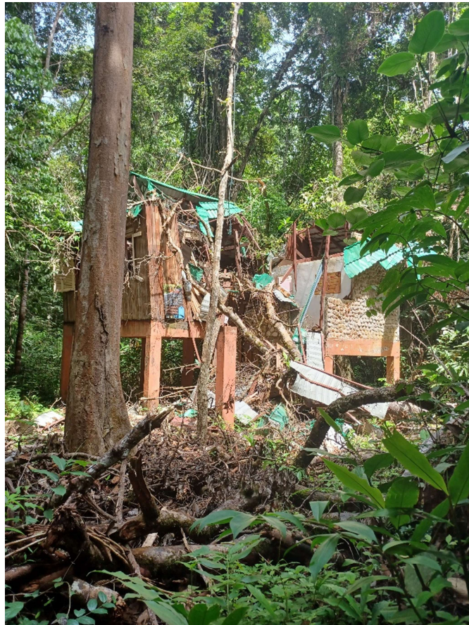
The destroyed Blau hide...