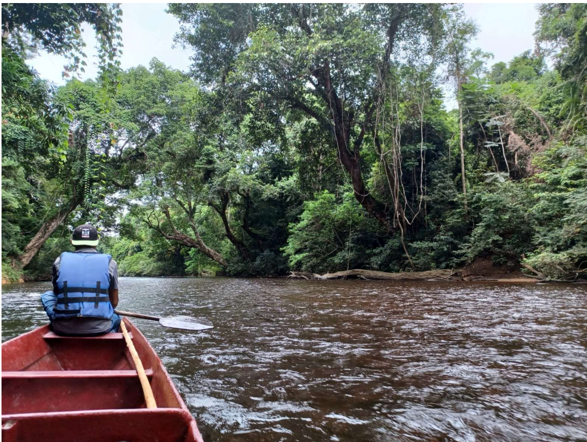
We had the river all to ourselves in the early morning

3 okt: For our last morning at Taman Negara we decided to book a (slightly overpriced) boat ride on the Tahan river, confident we could rack up some more species before leaving. You need to specifically charter a boat for yourself early morning, don't book the tourist trip to Lata Berkoh they sell everywhere! These only start from 09:00 and surrounded by other noisy tourists and boats chances of seeing anything good are slim at best. Our ride was a success with Large Green-Pigeon, Malaysian Blue-banded Kingfisher, Stork-billed Kingfisher, Whiskered Treeswift all showing. I finally got decent views of Straw-headed Bulbul and a Short-toed Coucal was a very nice unexpected tick!