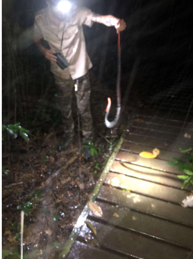
Worst moment ever to start raining...

We continued the trail to Bukit Terisek but it was really busy here as well. Jenut Muda trail was much more quiet and birds started to show again. Some good flocks were encountered containing many species of babbler including Chestnut-winged, Chestnut-rumped, Scaly-crowned and Sooty-capped together with more goodies like Raffles's Malkoha, Rufous-winged Philentoma, Spotted Fantail, Yellow-bellied Bulbul and the strangely enough only Black-naped Monarch of the trip. On our way back to the resort a very noisy party of Great Slaty Woodpeckers was a nice addition. During our night walk along river trail we encountered one of my personal highlights of the trip; a gorgeous Red-headed Krait. Unfortunately one minute after this amazing find it started pouring down, ruining our photo shoot of this rarely seen beauty.