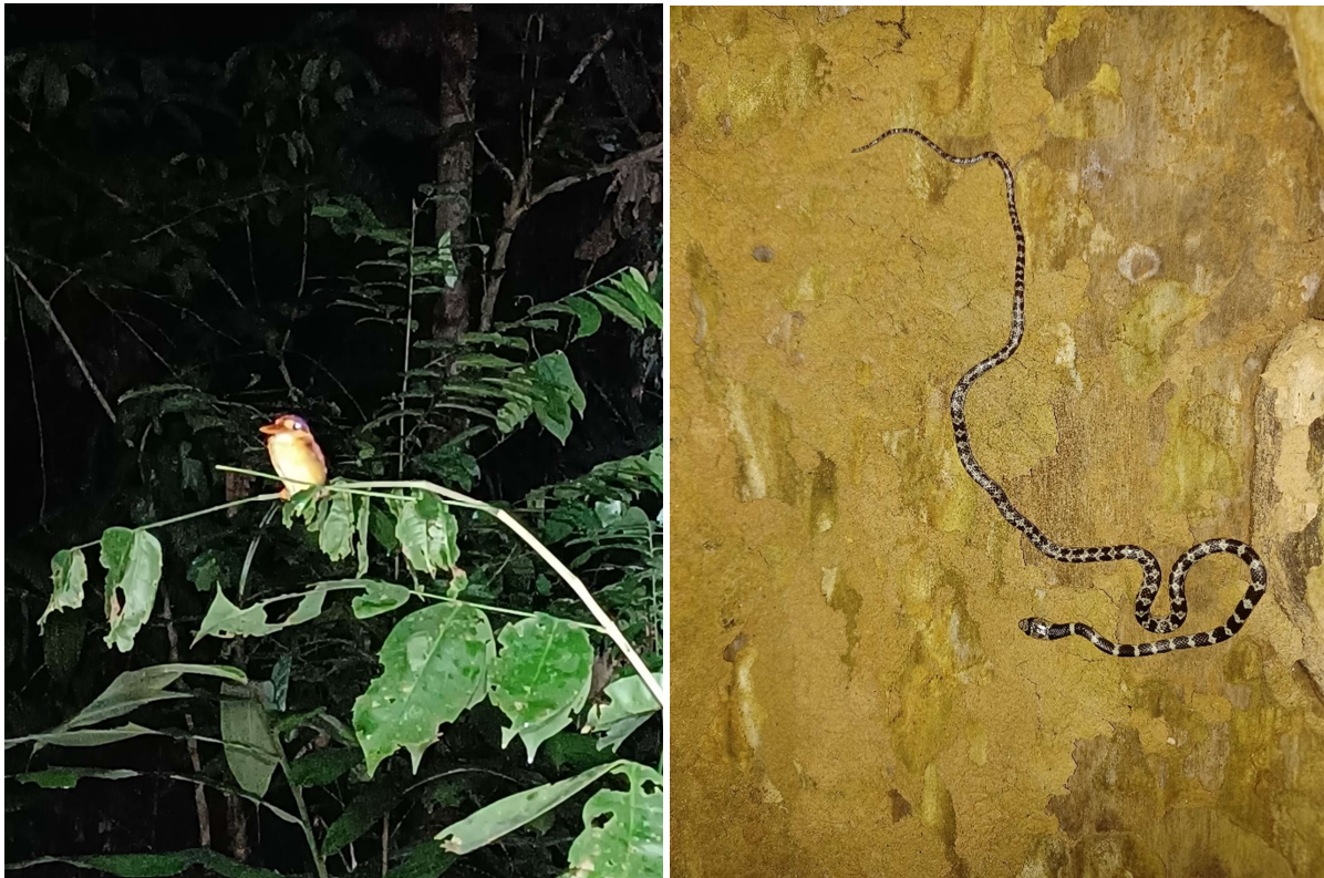
Poor record shot of the RBDK and a Malayan Bridle Snake

We continued to the canopy walkway and made the loop back to Mutiara resort, some new additions to our lists included Maroon Woodpecker, Green Iora, Gray-cheeked Bulbul and Ferruginous Babbler. Different from the days before, it got very hot early and activity died with it, after lunch and moving in our room at the Mutiara resort we tried River trail and Lubuk Simpson again for the damn hornbill, but the only new species we found was a Gray-breasted Spiderhunter. An evening walk at swamp loop was quite productive with a calling Reddish Scops-Owl, roosting Rufous-backed Dwarf-Kingfisher (seems to be a resident at the pond / marsh behind the resort) and White-crowned Forktail, a Lesser Mouse-Deer and several snakes.