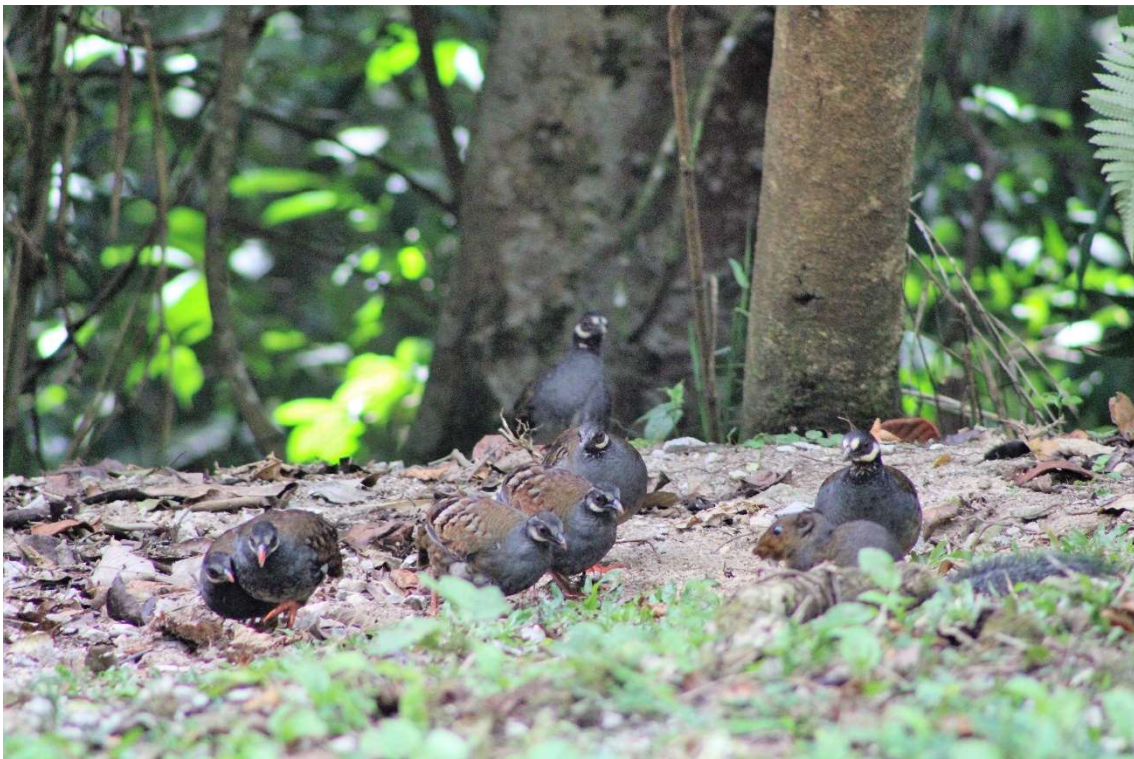
Malayan Partridge at Richmond bungalow, Bukit Fraser

25 sept: In the morning we combined Hemmant, Bishop and Maxwell trails to look for more skulking species, but birding here was hard work. Bishop and especially Maxwell trails had terrible visibility and were quite overgrown, making it hard to move quietly. Eventually White-tailed Robin, Rufous-browed Flycatcher, Buff-breasted Babbler and Red-headed Trogon gave themselves up. No sign of Rusty-Naped Pitta unfortunately... When having a coffee at the Smokehouse the friendly waiter showed us the place to see Malayan Partridge on the map, our target for this afternoon. Together with some local photographers we patiently waited at a small gravel patch at Richmond bungalow. After 30 minutes a flock of 7 partridges showed extremely well, our first endemic was in the bag!