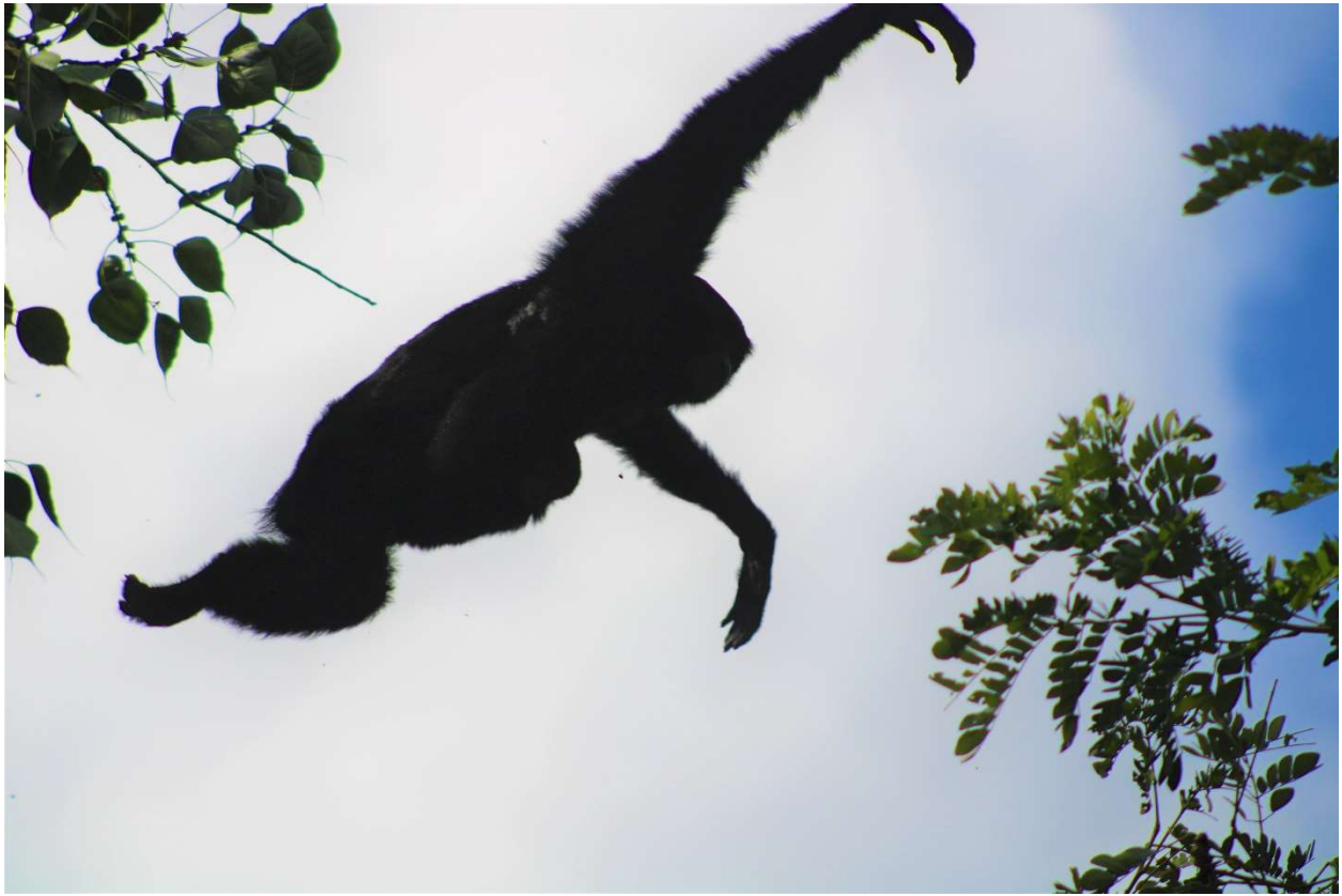
Mother and baby Siamang on the move

We then slowly made our way back down the hill, ticking off Gray-rumped Treeswift, Black Eagle, Red-bearded Bee-eater and Sooty Barbet. A family of Siamang, including a baby, was found close to the road at checkpoint 3.