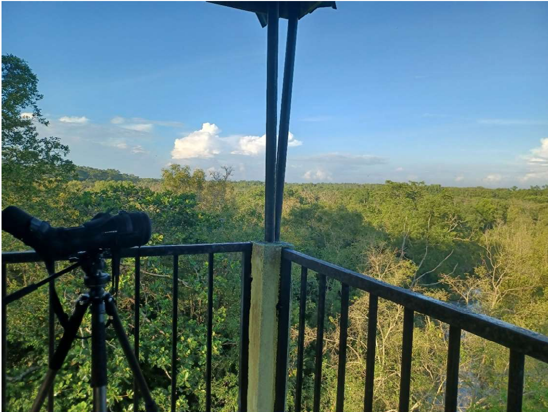
Viewing platform over the mangroves at Kuala Selangor nature park

23 sept: We arrived at Kuala Selangor nature park at dawn and started exploring the area, slowly making our way to the mangrove boardwalk. Collared Kingfisher, Common Flameback, Brown-throated Sunbird, Abbot's Babbler and other common species were encountered along the way. The boardwalk itself provided us with a nice flock of mangrove specialists like Cinereous Tit, Mangrove Whistler, Golden-bellied Gerygone, Sunda Pygmy Woodpecker, Ashy Tailorbird and Pied Triller amongst others. On the mudflats of the estuary we found Lesser Adjutant which gave distant views. Good migrants encountered were a Japanese Sparrowhawk, Amur Paradise-flycatcher and a female Yellow-rumped Flycatcher. The very localized selangorensis subspecies of Silvery Leaf Monkey is quite habituated here and can be found around the entrance of the nature park, alongside the more common Long-tailed Macaques.