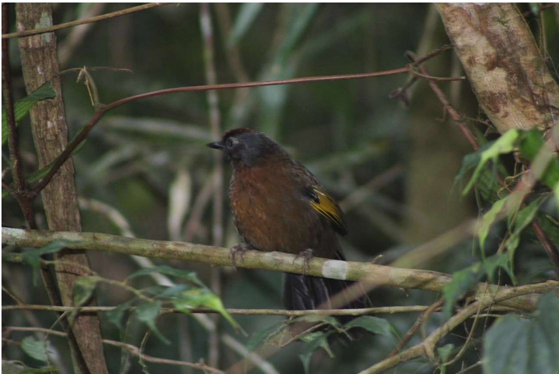
Malayan Laughingthrush, another Peninsula endemic

The star of the drive back up was unfeathered however, suddenly we found ourselves between 2 groups of Siamang singing their lungs (or throat pouch) out. After some hide and seek we had good views of these beautiful endangered apes. Back at the top we walked Hemmant trail once more, with no new additions but a Blyth's Shrike-Babbler to show for. I was getting worried we would dip Malayan Laughingthrush, so off to the kind shop owner we went for info. After no more than 30 seconds waiting at the spot he told us about, 2 laughingthrushes popped up from the dense undergrowth. (look for a small stream next to the road near the Fraser public campsite)