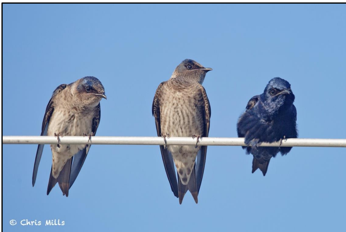
Above: Prothonotary Warbler