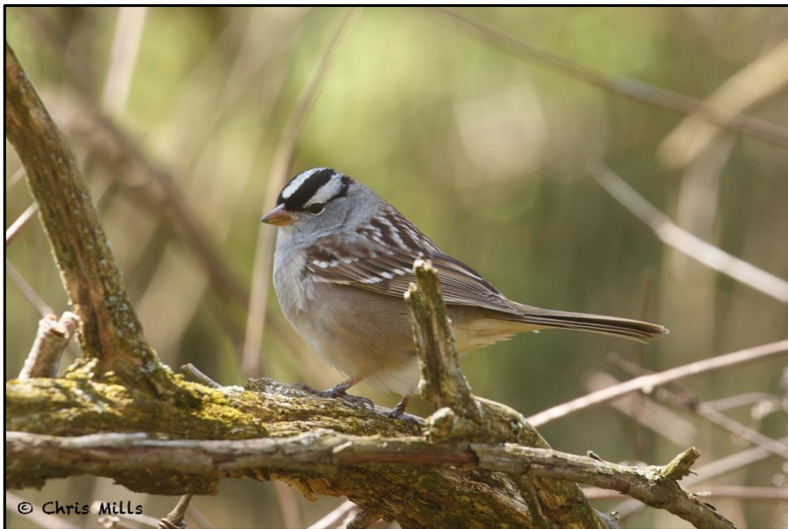
Above: Warbling Vireo