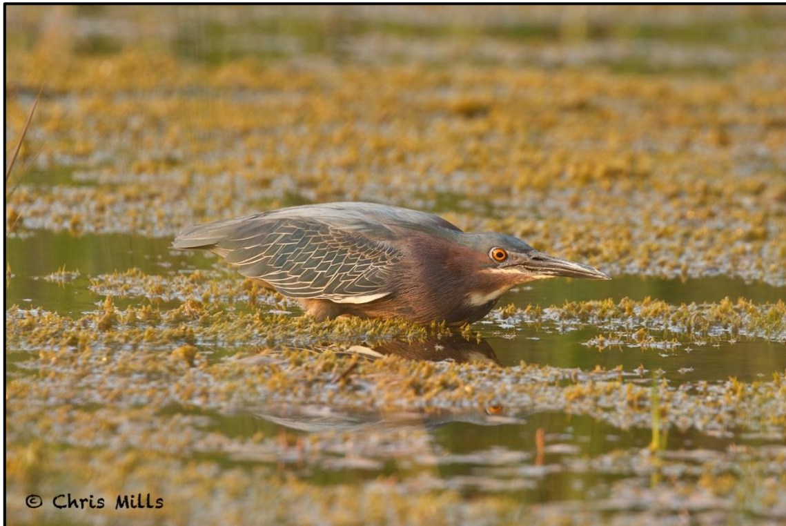
Above: American Green Heron