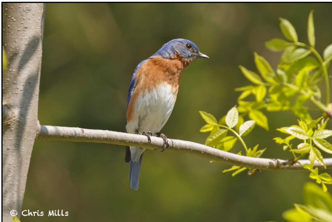
Above: Common Loon