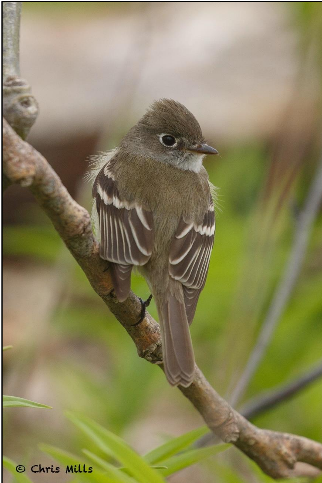
Above: Least Flycatcher