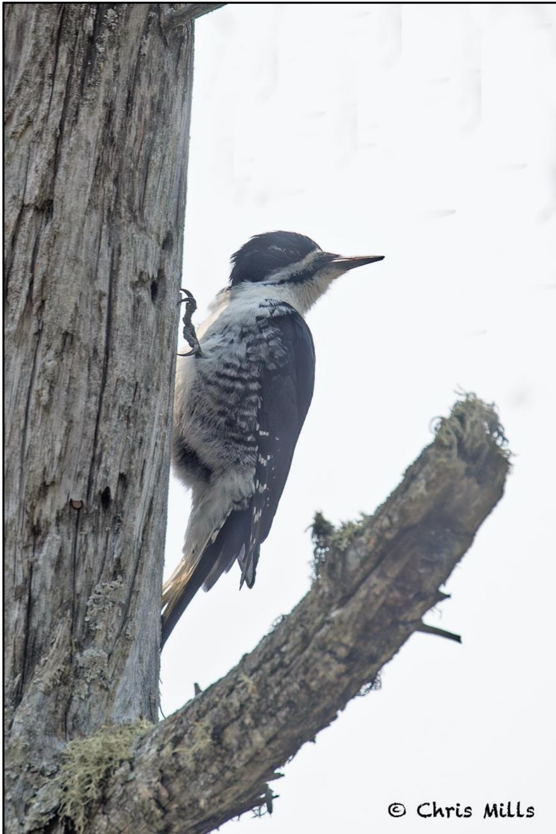
Above: Black-backed Woodpecker