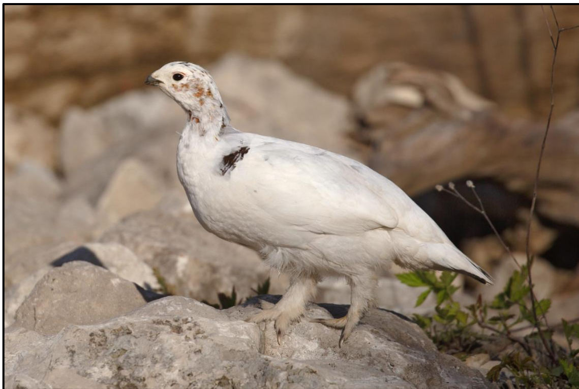
Above: Wilson's Warbler