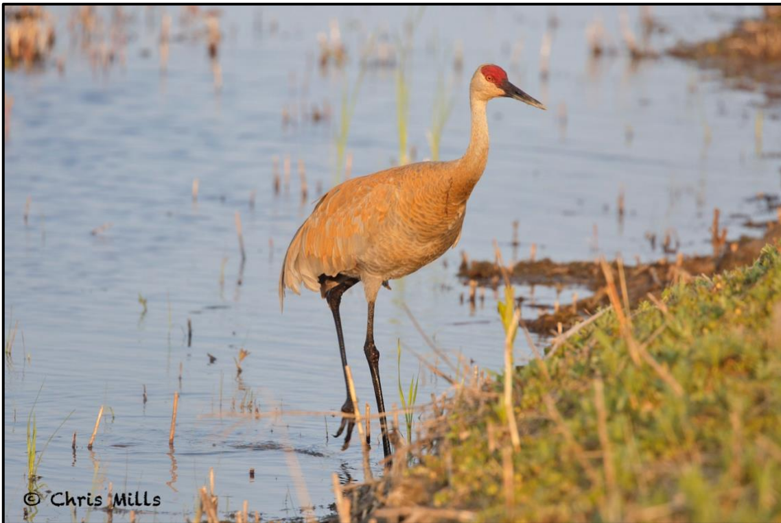
Above: Rose-breasted Grosbeak