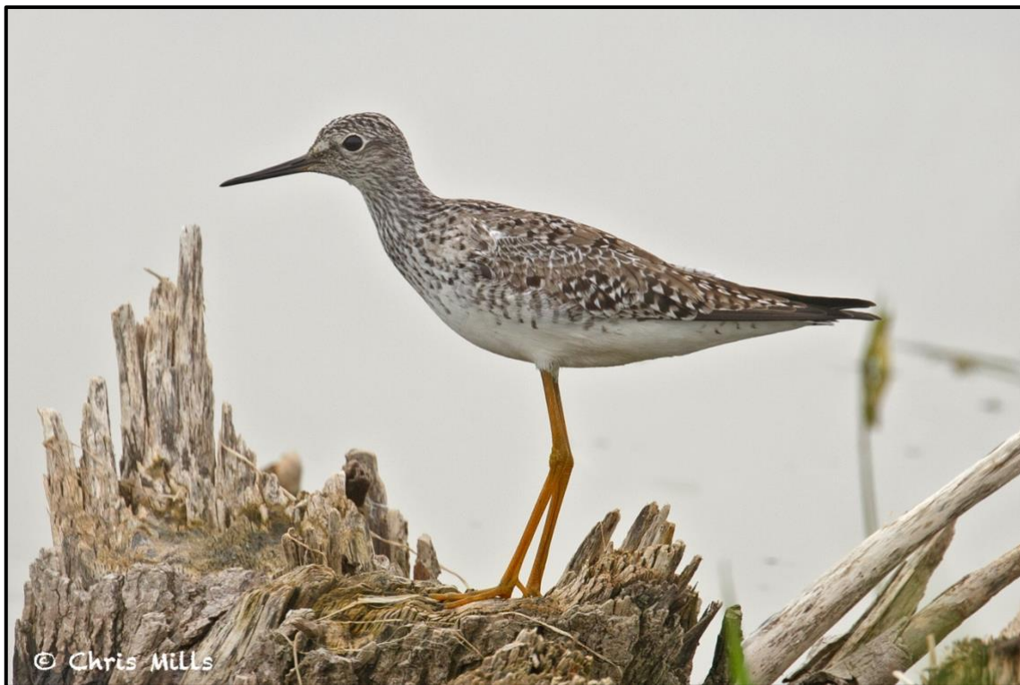
Above: Least Sandpiper