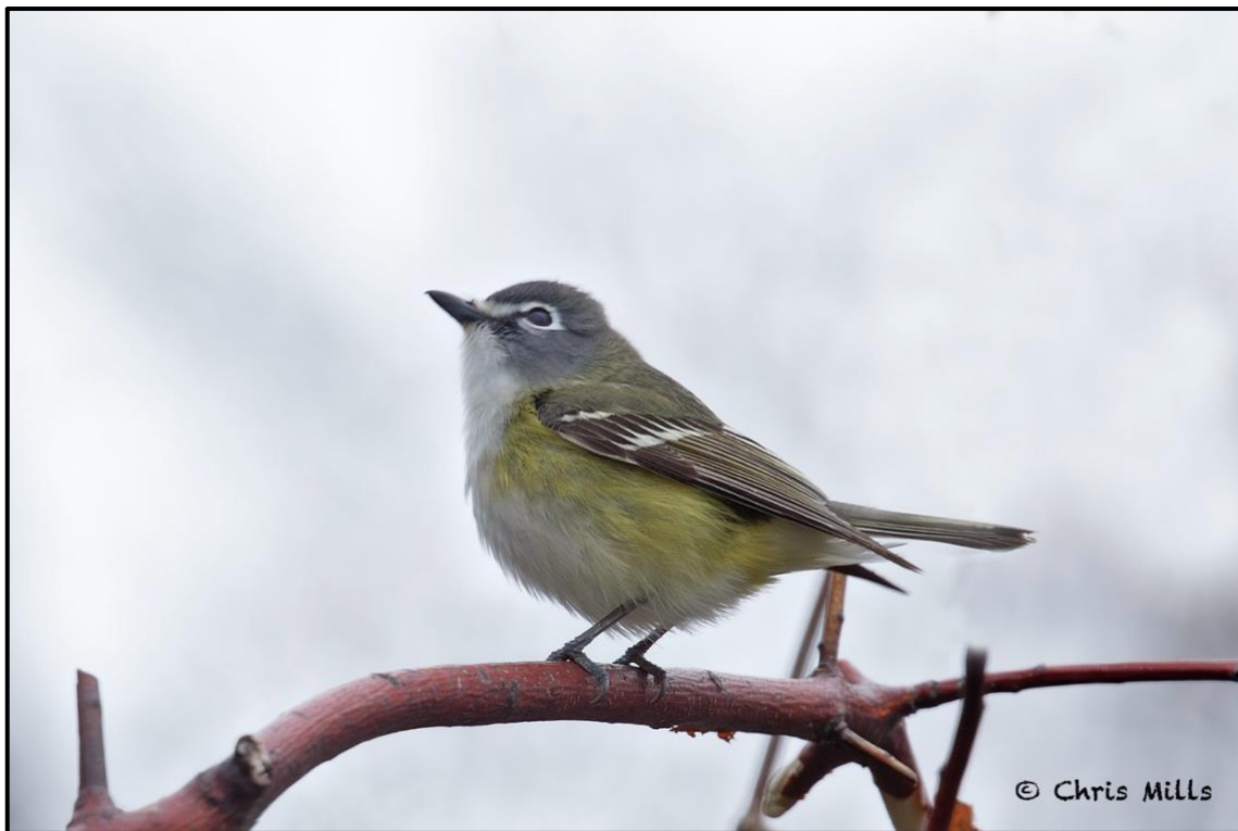
Above: Blackburnian Warbler