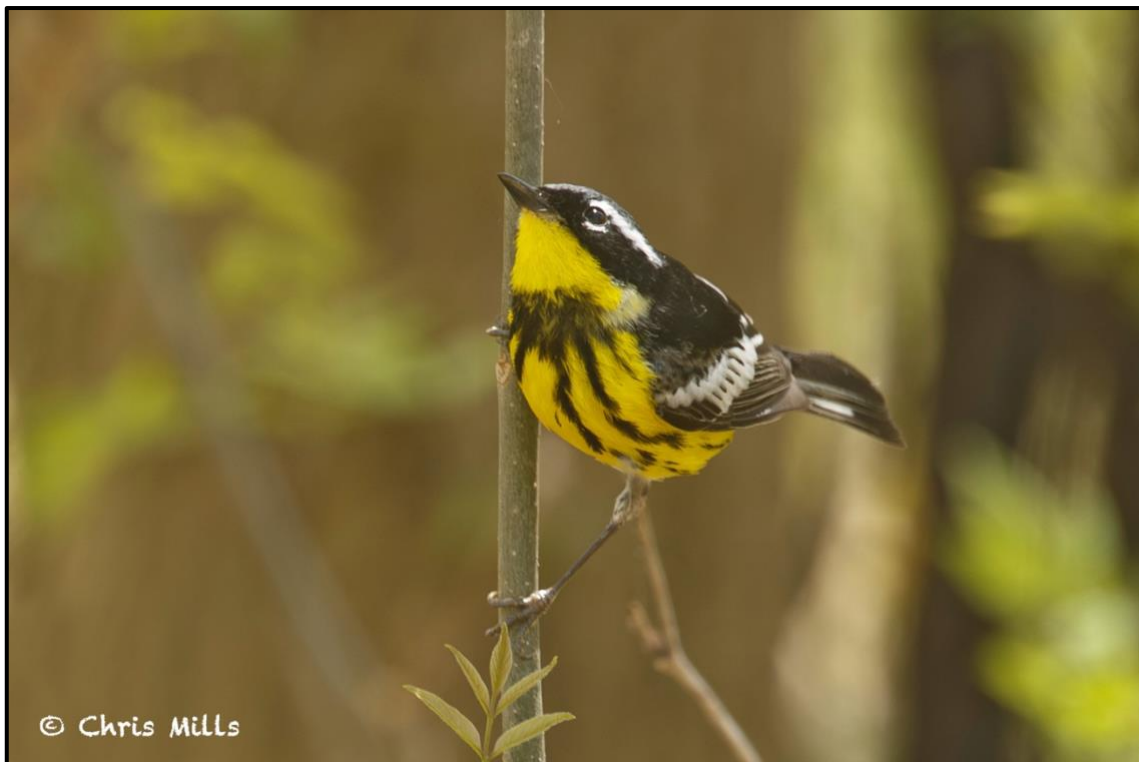
Above: Lincoln's Sparrow