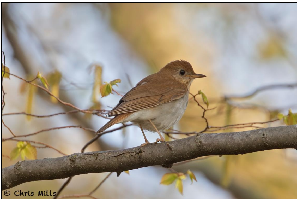
Above: Tree Swallow