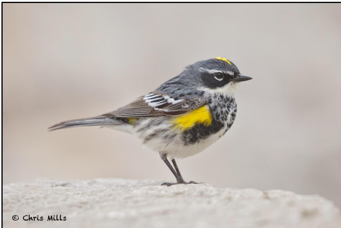
Above: Yellow Warbler