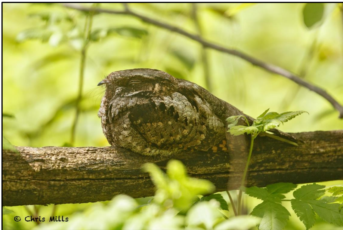
Above: Eastern Screech Owl