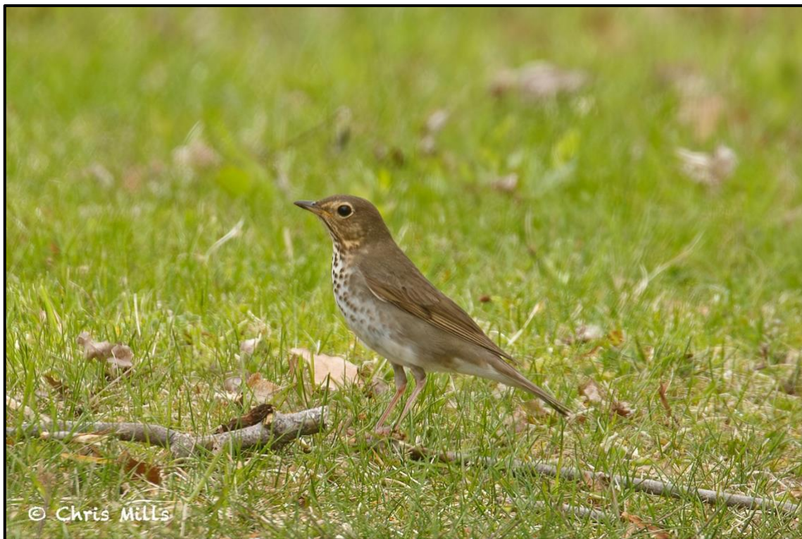
Above: Scarlet Tanager