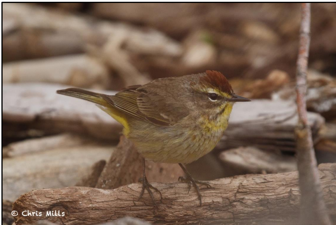
Above: Northern. Parula