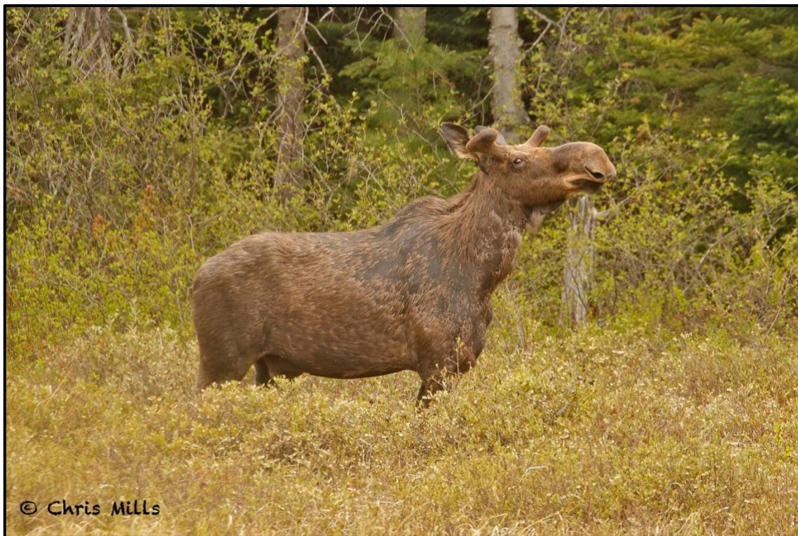
Above: Kentucky Warbler