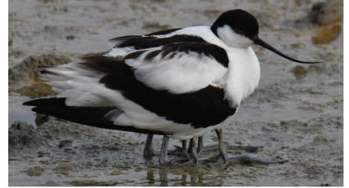
Avocet with chick