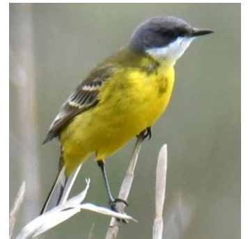
Yellow Wagtail [cinerocapilla]