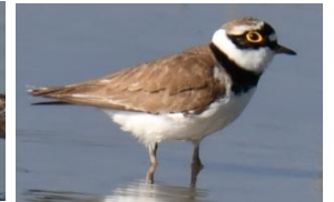
Little Ringed Plover