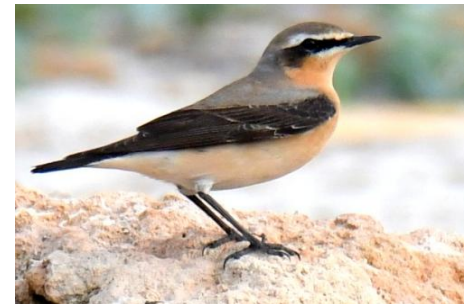
Northern Wheatear [Greenland race]