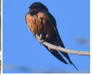
Barn Swallow transitiva