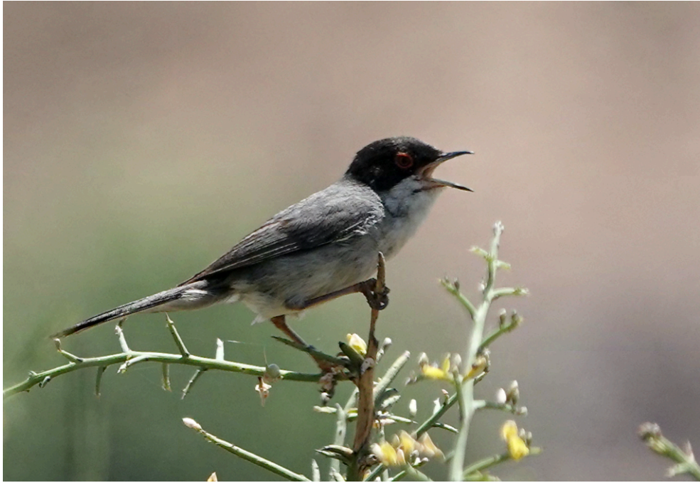
(Dorothy's) Short-toed Treecreeper ( Certhia brachydactyla dorotheae ) – At least 2 birds were seen well at the start of the Atalanti trail at Troodos village on 3 rd June.