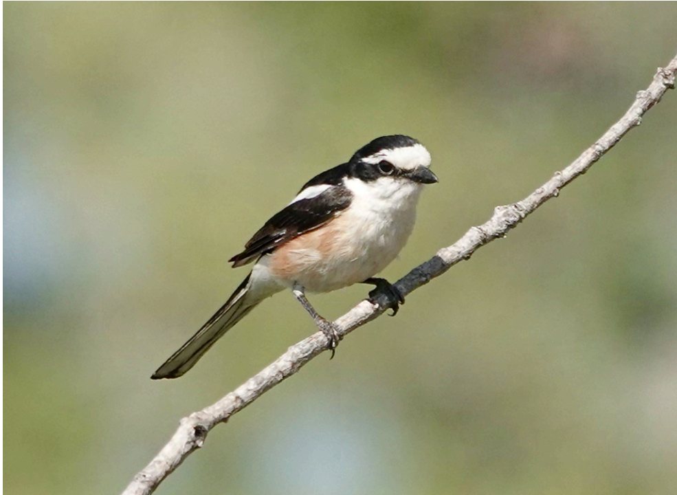
(Cyprus) Eurasian Jay ( Garrulus glandarius glasznery ) – Several showed well around Troodos village on 3 rd June.