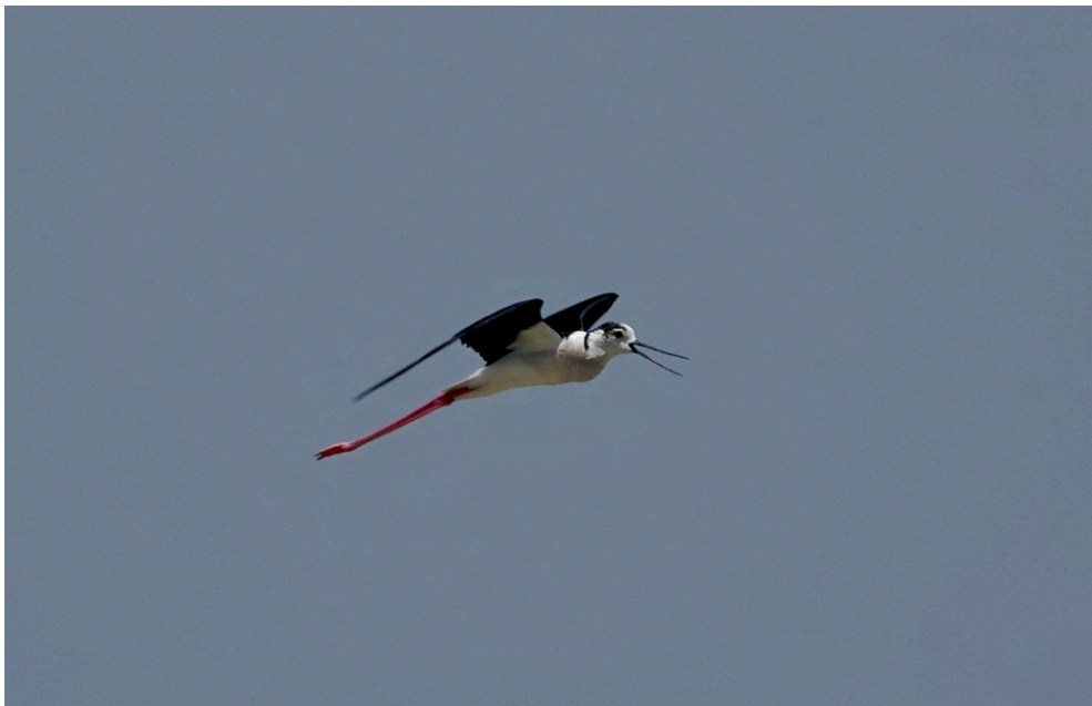
Spur-winged Lapwing ( Vanellus spinosus ) – One flying south over the fields at Mandria on 1 st June was the first seen, with others seen at Akrotiri Marshes on 4 th June.