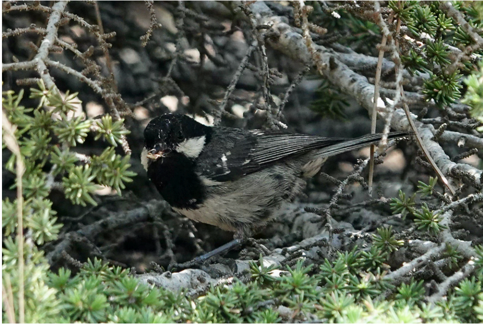
(Southern European) Great Tit ( Parus major aphrodite ) – First seen at Asprokremmos Reservoir on 1 st June, with others seen on 2 nd and 4 th June.