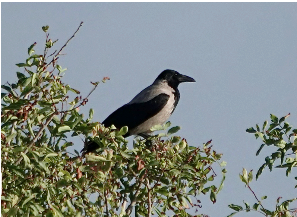
(Cyprus) Coal Tit ( Periparus ater cypriotes ) – 4 birds of this distinctive subspecies were seen around Troodos village on 3 rd June.