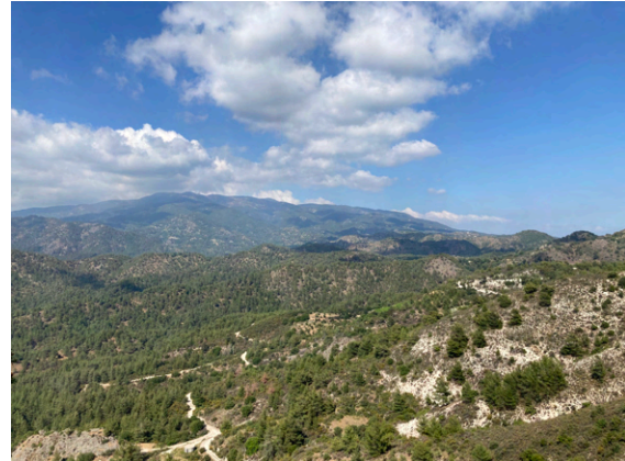
View from Gerokaminia Viewpoint