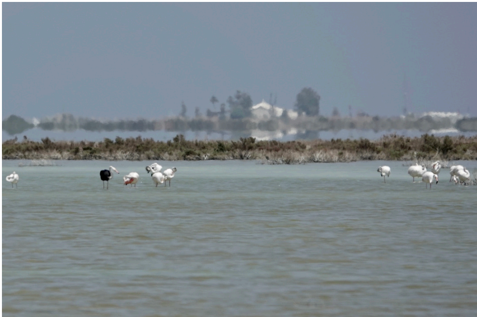
Eurasian Stone-curlew ( Burhinus oedichnemus saharae ) – First seen at dusk on 1 st June when several were calling in a field by Asprokremmos Reservoir. Several were also seen in the fields around Mandria on 2 nd June.