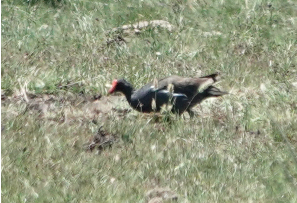
Eurasian Coot ( Fulica atra atra ) – One was seen at Akrotiri Marshes and one with 2 young was on the small patch of water in front of the hide at Zakaki Marshes on 4 th June.