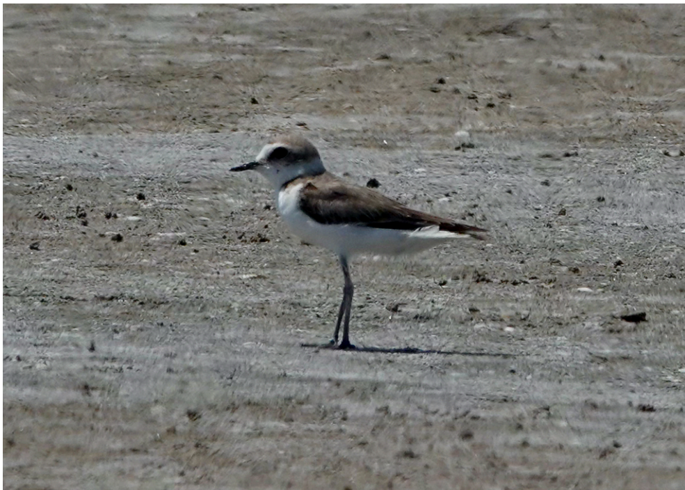
Yellow-legged Gull ( Larus michahellis michahellis ) – A fairly common species, seen around the coast and on large water bodies. First seen at the hotel on 31 st May.