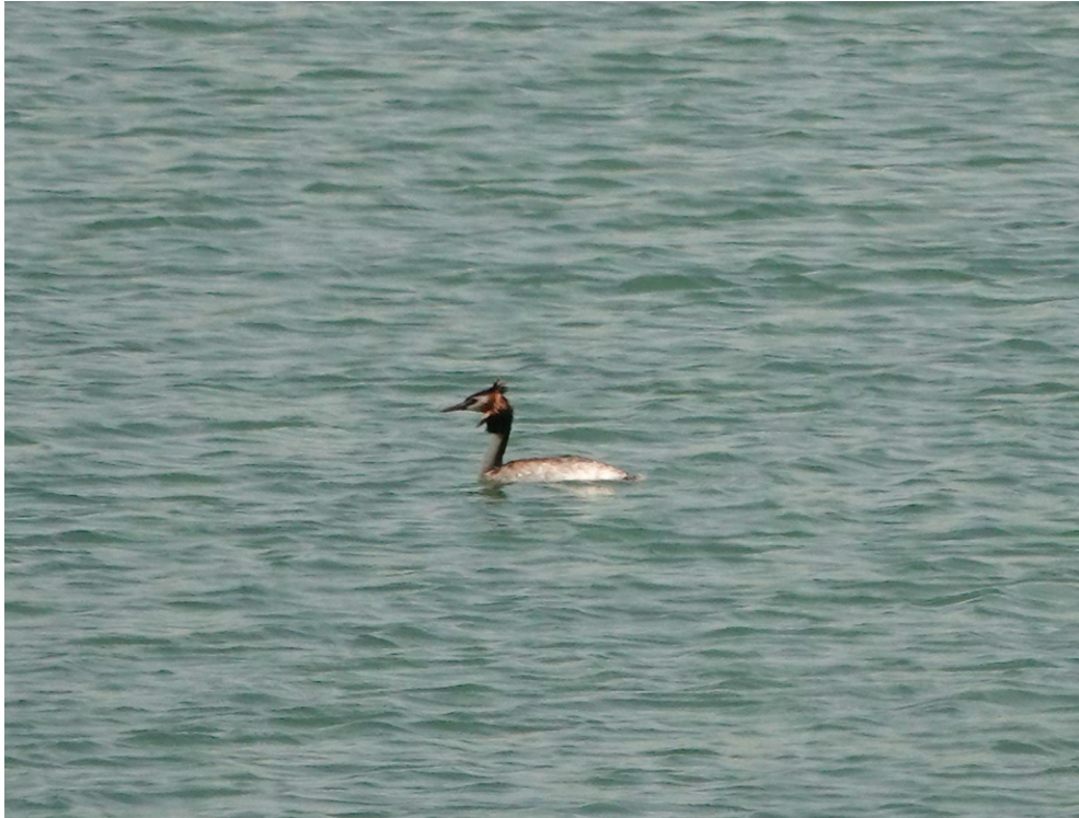
Greater Flamingo ( Phoenicopterus roseus ) – Several flocks were at the Akrotiri Salt Lake on 4 th June, including a bird with a black body, and a pink head and neck.