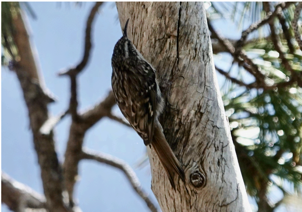
Common Starling ( Sturnus vulgaris vulgaris ) – 2 were seen briefly while driving through Trachoni on 4 th June.