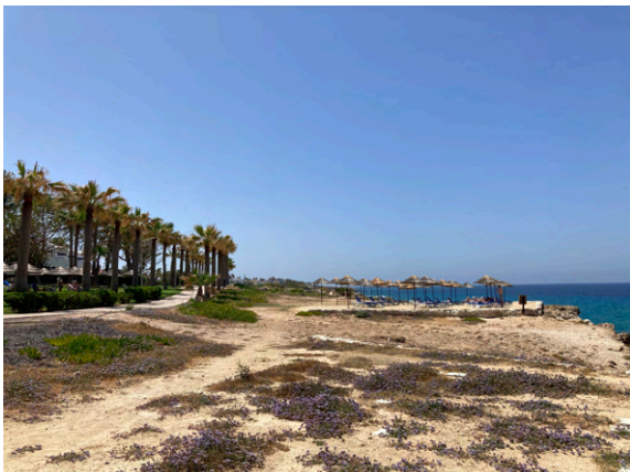
Seafront at Azia Hotel

Tuesday 31 st May: The day was spent exploring the hotel and grounds and just generally chilling out, with an afternoon walk along the main road outside and along a side road to view the fields at Eletherias, where the highlights were a Eurasian Hoopoe, several Spanish Sparrows and Laughing Doves. Overnight at Azia Hotel, Paphos.