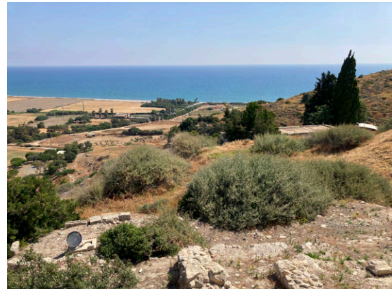
View from Kourion Archaeological Site

Sunday 5 th June: No birding today as this was our last day and the car had to be returned. The day was spent chilling around the hotel, before we needed to leave for the airport after dinner. The return flight back to the UK was as expected, delayed. Our flight finally took off at around 4 am the following morning and we arrived back in the UK just in time for rush hour traffic.