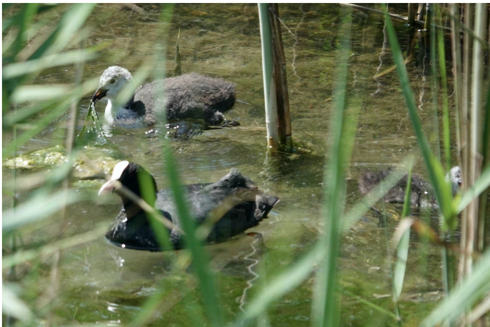
Great Crested Grebe ( Podiceps cristatus cristatus ) – One was on Asprokremmos Reservoir on 1 st June.