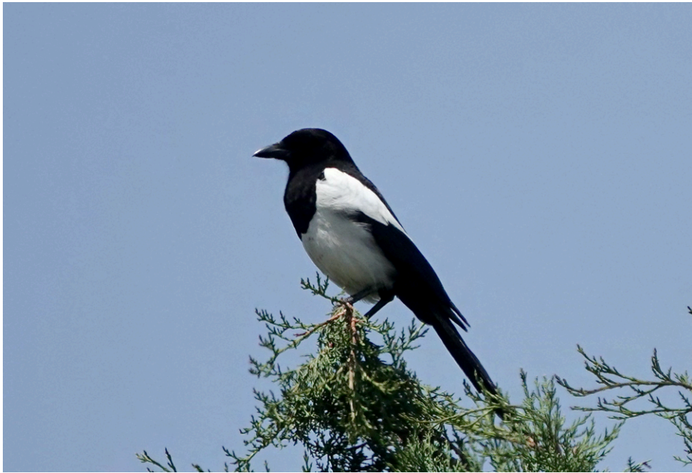
Western Jackdaw ( Coloeus monedula soemmerringii ) – Never common, but seen occasionally. Seen on 2 nd , 3 rd and 4 th June.