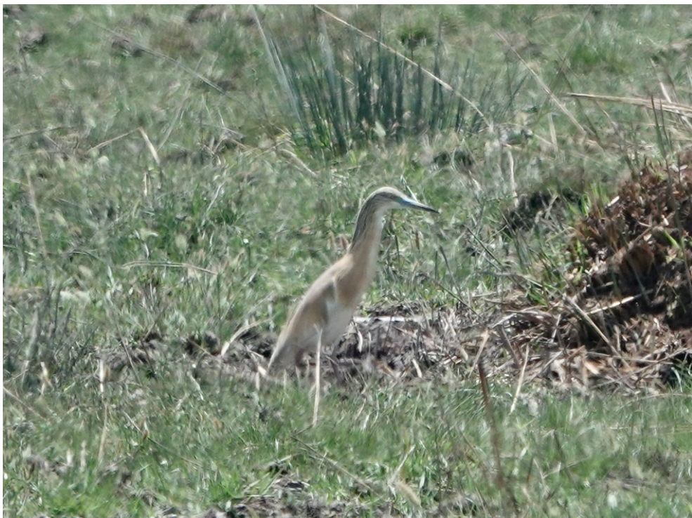
Western Cattle Egret ( Bubulcus ibis ) – Several were at the Akrotiri Marshes on 4 th June.