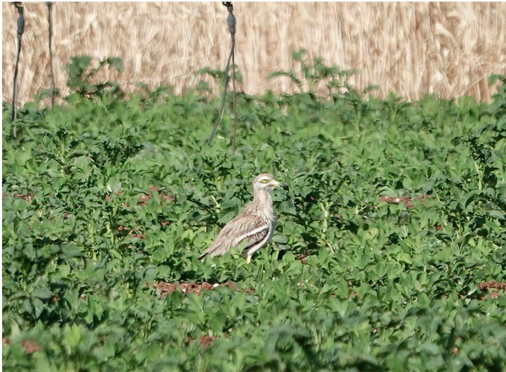
Black-winged Stilt ( Himantopus himantopus ) – Several were along the shore line of the Akrotiri Salt Lake on 4 th June.