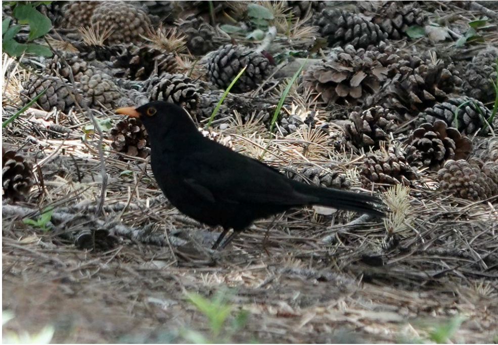
Cyprus Wheatear ( Oenanthe cypriaca ) – First seen on the rocks above the access road to Mavrokolympus Reservoir on 2 nd June, with others seen there and in the Troodos mountains on 3 rd June, and at the Sanctuary of Apollo Hylates on 4 th June.