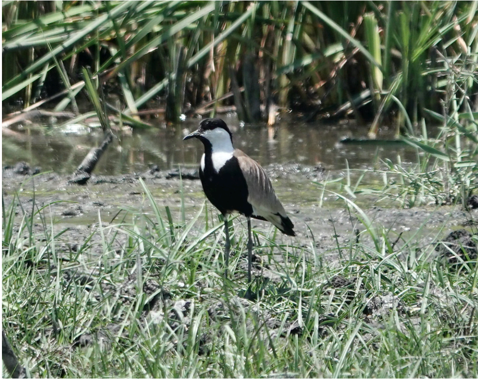
Kentish Plover ( Charadrius alexandrinus alexandrinus ) – A female was on the dried saltpan area of Lady's Mile on 4 th June.