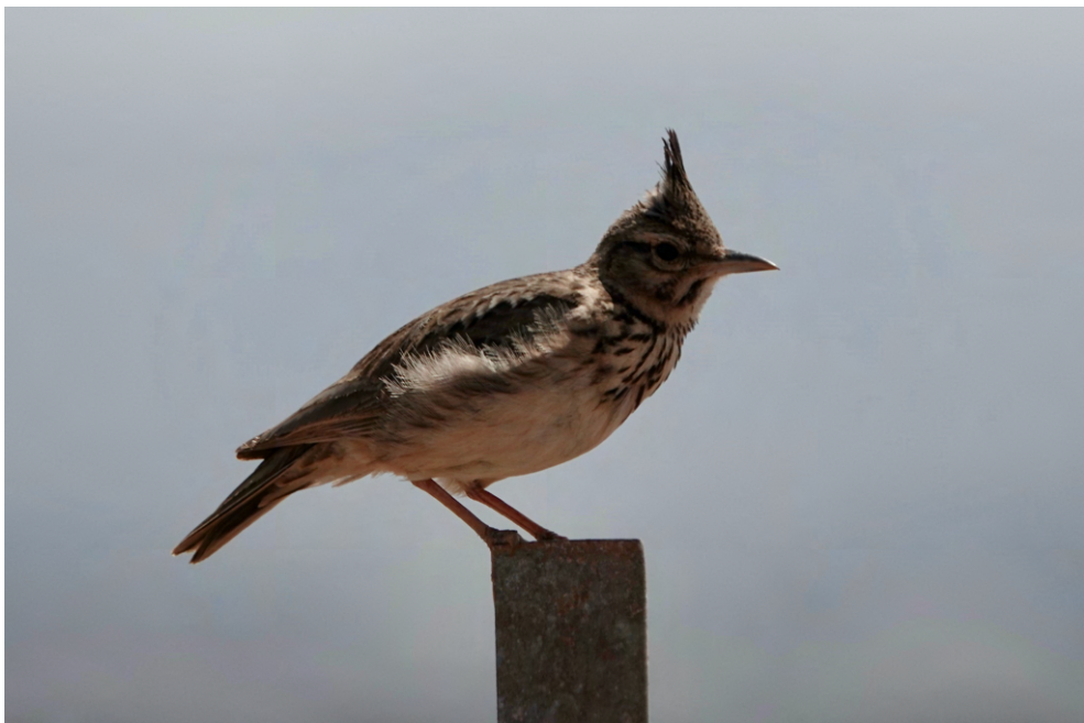
Greater Short-toed Lark ( Calandrella brachydactyla brachydactyla ) – One was seen at 'Lark Corner' in the fields at Mandria on 1 st and 2 nd June.