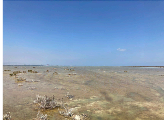
Akrotiri Salt Lake