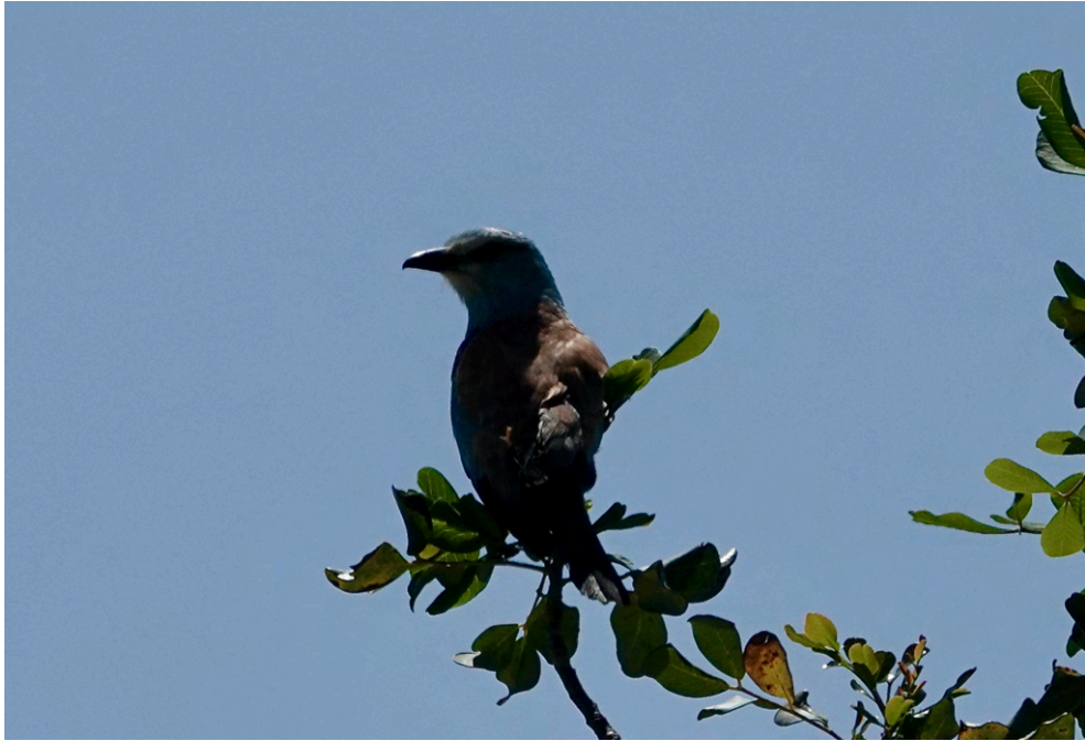
European Bee-eater ( Merops apiaster ) – Two birds were catching insects over a reedbed in the Zseros valley east of Mandria on 2 nd June.