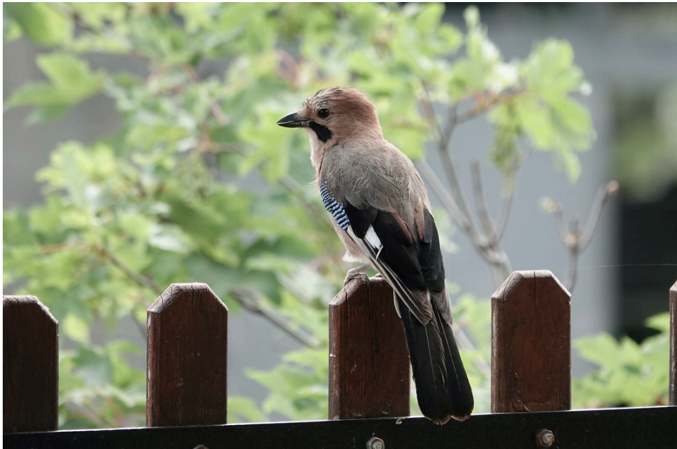
Eurasian Magpie ( Pica pica pica ) – Seen regularly, with the first seen from the car near the hotel on 1 st June.