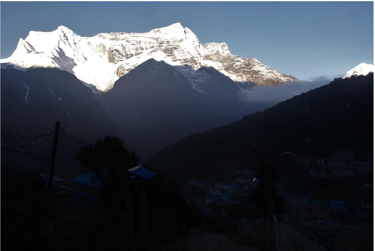
Good morning Namche Bazaar – early morning at sunrise.