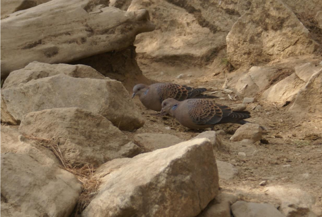
Oriental Turtle Dove near Suspension bridge, Namche (Photo: EVR).