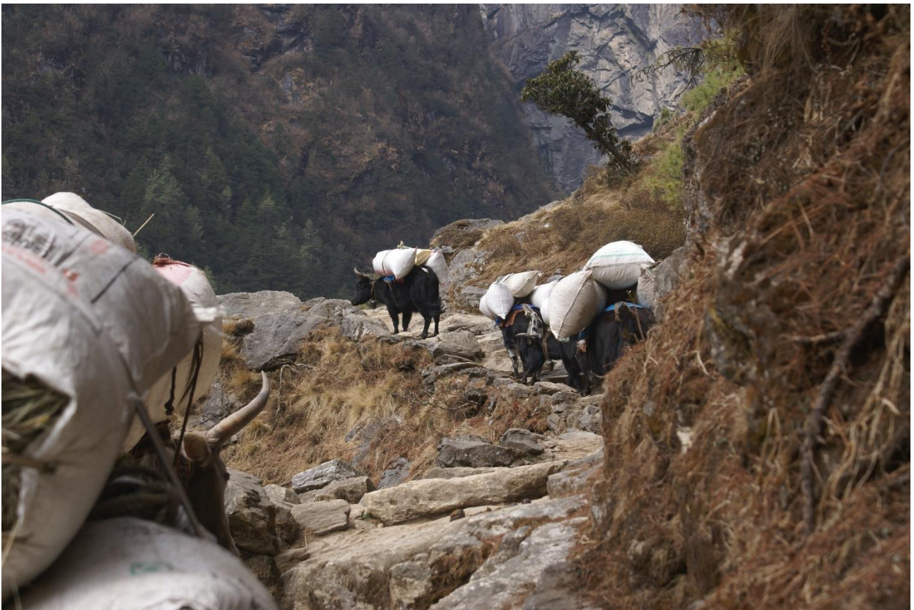
Yak-attack near Suspension bridge

Sunday 27 th March: Trekking after breakfast from Monjo and ended the trek at Lukla. Checked in at Yeti Mountain Home again. Late afternoon we birded in a little valley behind Lukla Airport and the little Lukla hospital (see map).