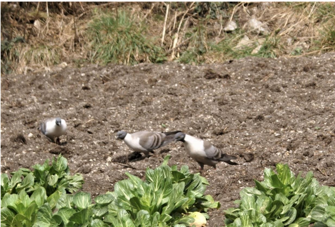
Snow Pigeons near Phakding (Photos: EVR).