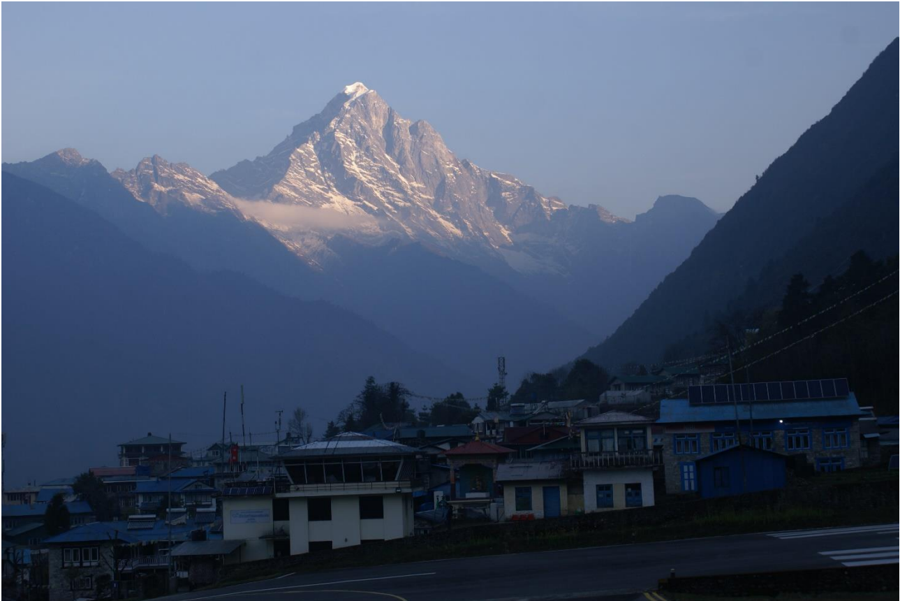
Lukla airport early morning at sunrise (Photo: EVR).

Tuesday 29 th March: In the early morning we left Lukla airport at 7.30 and had a pleasant flight back to Kathmandu and transfer to Hotel Marshyangdi. Shopping and relaxing the rest of the day.