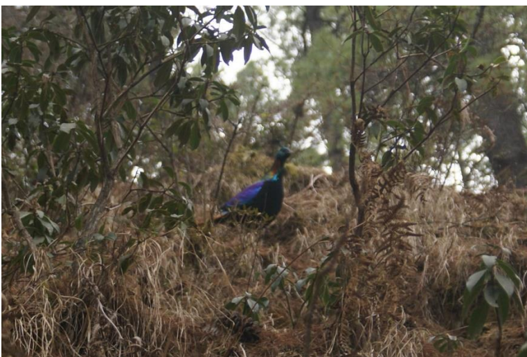
docu-photo of Himalayan Monal male just before sunset, lower Namche.

22/3 3 males seen and 3 heard calling between Jorsale and Namche Bazaar, 23/3 1 male + 2 females seen between Namche and Thame, 24/3 2 males seen between Namche and Tingboche, 25/3 2 males seen and 2 heard calling between Namche and Monjo.