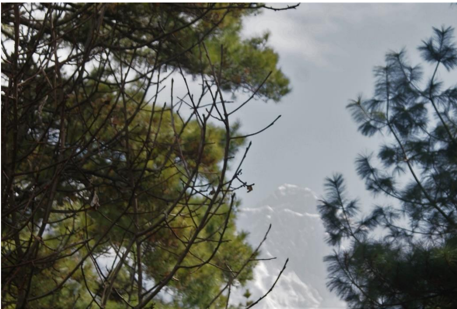
First glimpse of Mount Everest (8850 m) is just after the suspension bridge and Jorsale.

Tuesday 22 nd March: We trekked from Phakding at 8.00 and we soon after got our entrance tickets to Sagarmatha National Park. After Jorsale we crossed the Dudh Kosi by the high suspension bridge and it took us almost 10 hour's before we arrived at Namche Bazaar and we stopped many times for birding. Especially last part after we had crossed Dudh Kosi River was very strenuous for us – we are both 70 years old. It is a steady climb from Jorsale to Namche. We arrived at Namche (3420 m) at 17.30.