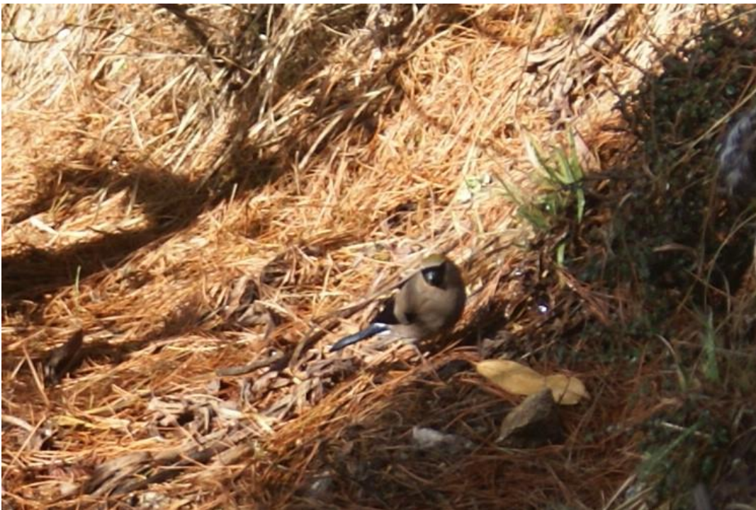
Red-headed Bullfinch, lower Namche.