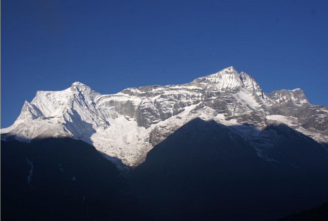
Kongde Ri – the mountain behind Namche Bazaar at sunrise.

Friday 25 th March: Full day birding around Namche and after lunch we trekked down to Monjo for better weather and more birds. In the afternoon we find a fine place behind Budda Logde (see map) where we found accentors and flycatchers among others.