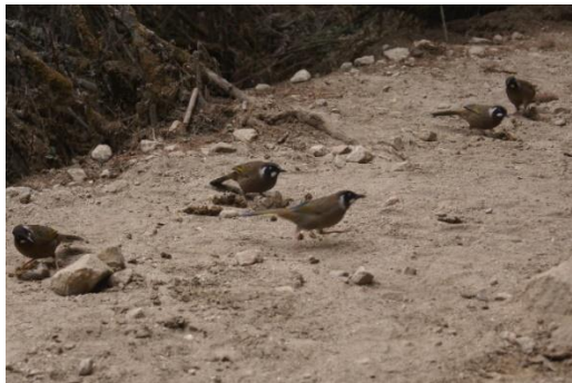
Black-faced Laughingthrushes downhill Namche (Photos: EVR).