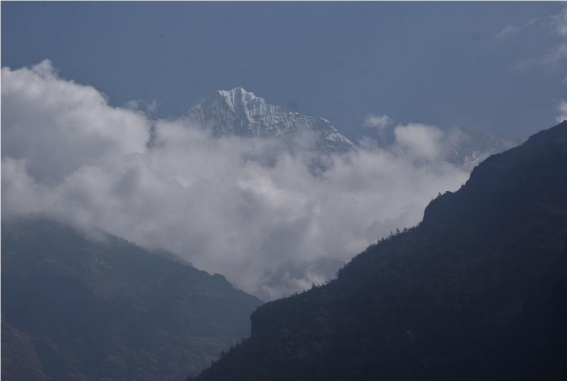
Himalaya – photo from the Everest trek.

Wheatley, T., 2010: Nepal -Everest region, February 12 th – 25 th 2010.