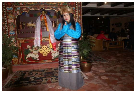
Yeti Mountain Home, Namche Bazaar and Sherpa-woman in national costume.