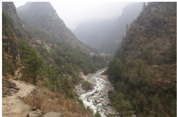
Dudh Kosi River

Tuesday 22 nd March: We trekked from Phakding at 8.00 and we soon after got our entrance tickets to Sagarmatha National Park. After Jorsale we crossed the Dudh Kosi by the high suspension bridge and it took us almost 10 hour's before we arrived at Namche Bazaar and we stopped many times for birding. Especially last part after we had crossed Dudh Kosi River was very strenuous for us – we are both 70 years old. It is a steady climb from Jorsale to Namche. We arrived at Namche (3420 m) at 17.30.