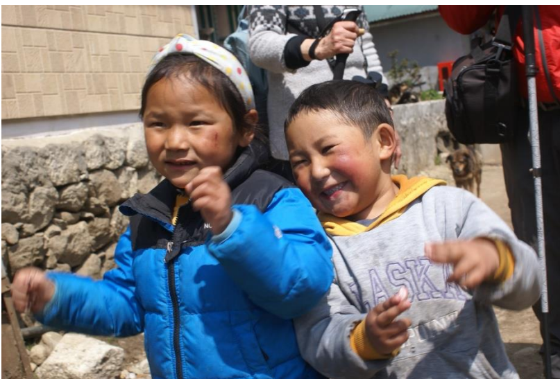
Happy kids in Namche

We felt very safe during the entire trip and had no health issues. When you reach Namche Bazaar there is a risk for acute mountain sickness. We know the symptoms from our visits in Tibet (Nam Tso Chukmo and Largen La pass at 5200 m) and from Peru (Marcapomacocha 4400 m) because the concentration of oxygen in the air falls markedly. On our trip to Namche Bazaar we had no problems at all.