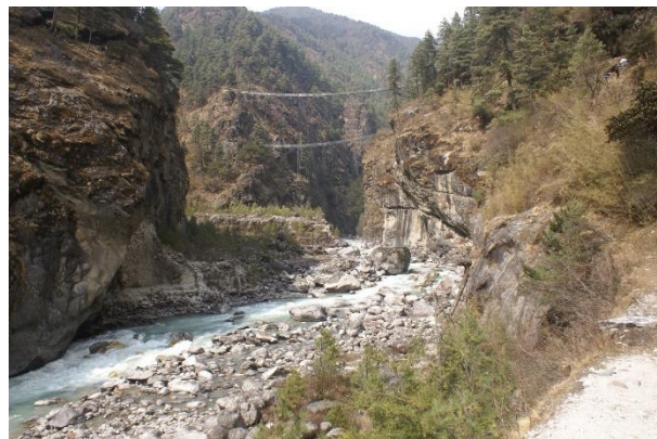
Suspension bridges between Jorsale and Namche Bazaar.