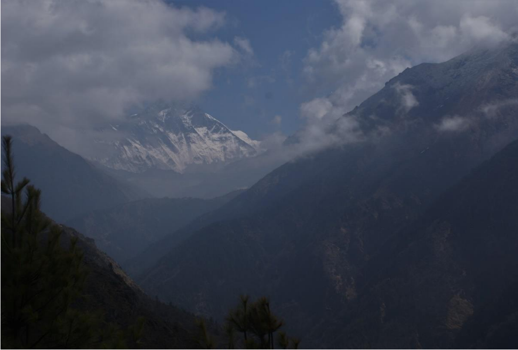
The view from the path against Tengboche – Nuptse, Lothse, Ama Dablam and Everest in clouds.