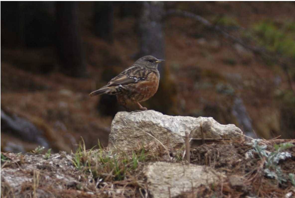
Alpine Accentor behind Buddha lodge, Monjo.

25/3 11 Namche – Monjo and 26/3 15+ behind Buddha lodge, Monjo.