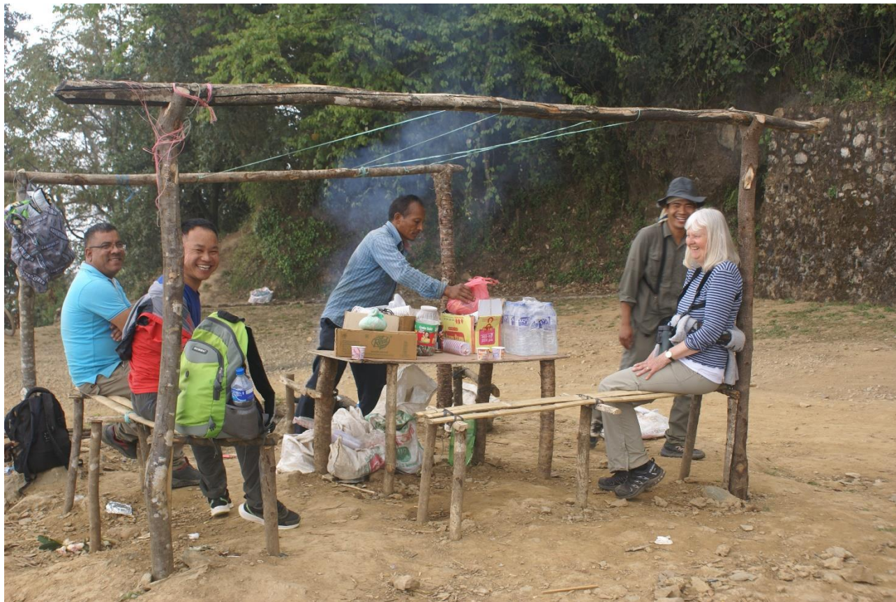
Lunch at Phulchowki mountain (Photo: EVR).

Friday 1 st April: Full day birding at Phulchowki mountain again and this time especially the lower part at the forest. Again many birds including Kalij Pheasant, Greater Yellownappe, Black Eagle, Ultramarine Flycatcher, White-tailed Nuthatch, Grey-sided Laughingthrush, Hoary-throated Barwing, Whiskered- and Stripe-throated Yuhina among others.