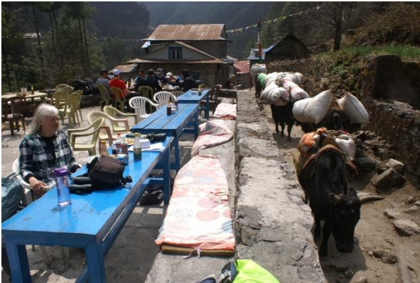
Yak-attack at Jorsale