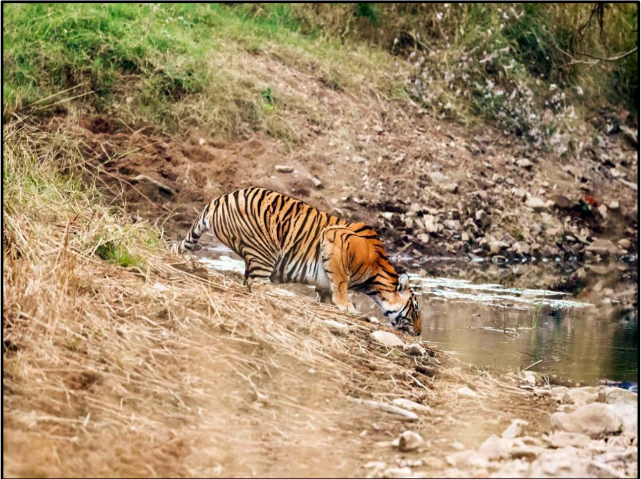
Tiger at Ranthambhore

Trip report & images compiled by Tour Leader: Stu Elsom