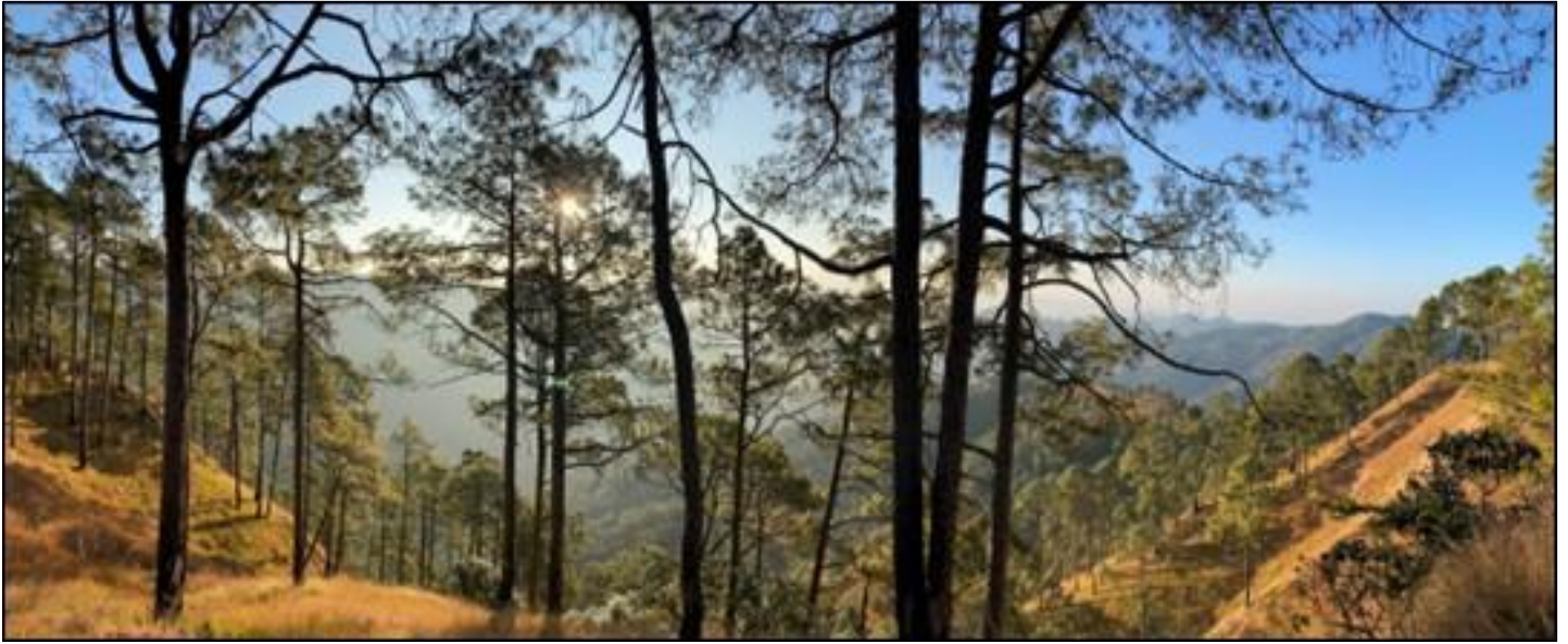
A panoramic view of the beautiful highland forests at Manila