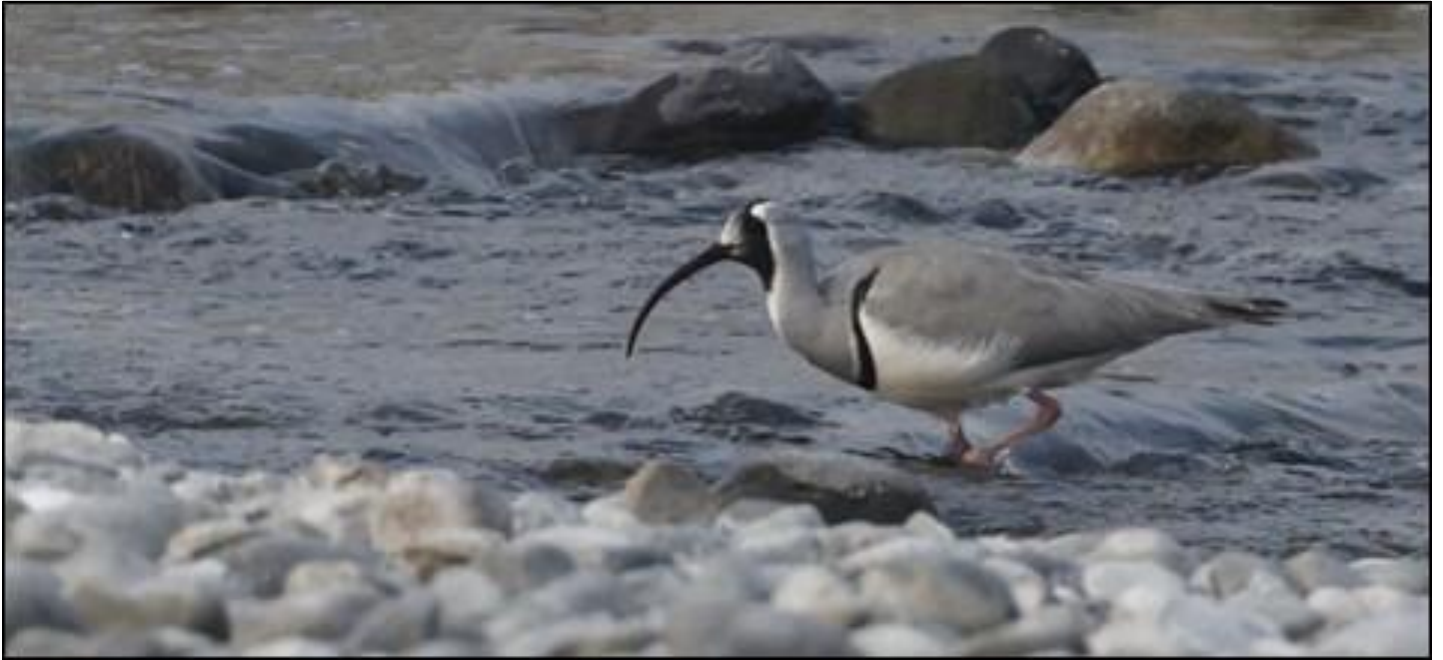
Ibisbill on the Kosi River

for the group. A nearby stream produced a feeding flock which contained the exquisite Small Niltava and a beautifully cryptic Scaly-breasted Cupwing.