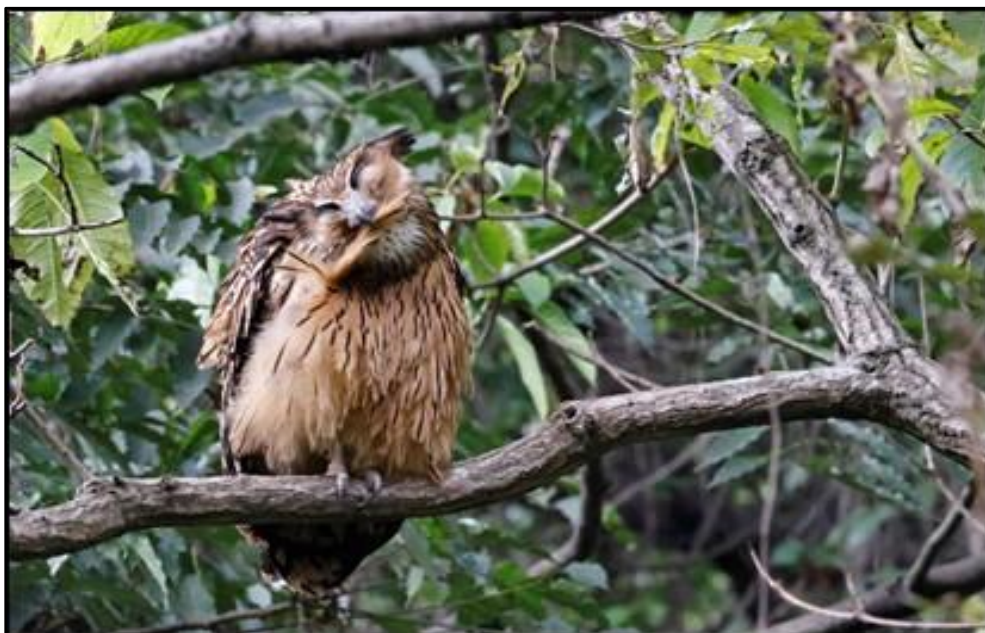
Tawny Fish Owl preening, Chaffi

Boat trips are always popular, and our afternoon spent on the Chambal River was no exception. We enjoyed wonderful close views of Great Stone Curlew (left) as we headed out and then very close encounters with feeding Egyptian Vultures and a flock of eight Indian Skimmers (right).