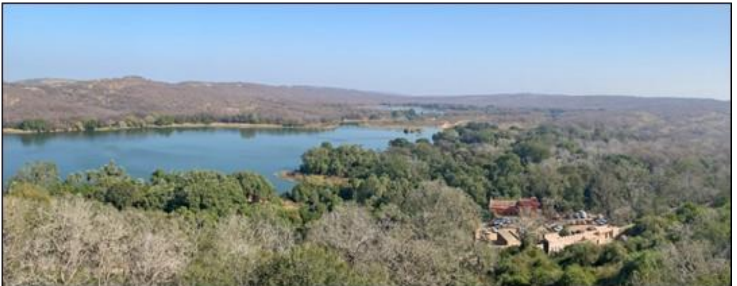
Our final morning spent high above the park exploring the fort, temple and enjoying amazing views.

We started our chilly final morning at Jim Corbett NP with same enthusiasm we had the previous day, but once again the Tigers were ahead of us, and slipped away before we could lay eyes on them. Pallas's and Lesser Fish Eagles were some compensation, and a plethora of new and exciting species followed including no less than nine species of woodpecker including the range-restricted Streak-throated as well as several Brown Fish Owls and beautiful male Black-hooded Oriole.