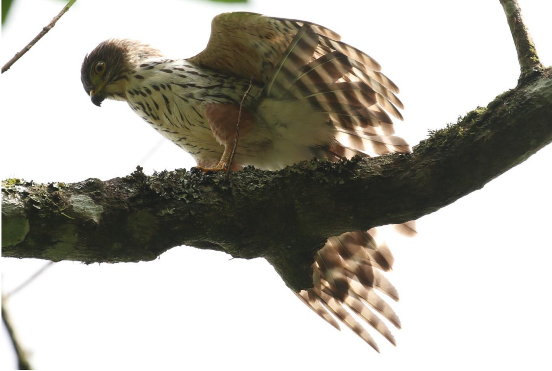
Rufous-thighed Kite (Andy Foster)

space of time. Next up was a Swallow-tailed Manakin and Rufous-breasted Leaf-tosser, which came in so close and fast it scared the life out of us! Slightly further along the trail we had amazing views of a Rufous-thighed Kite, sunning itself, this was followed shortly afterwards by a Slaty Bristlefront. Next up a Blue-bellied Parrot called far off in the distance and after a little playback it flew straight over us and into a nearby tree. As soon as we had located it, it flew off and circled back over us again, giving brief but good flight views, such a rare bird! It was late afternoon as we started to head back towards the minibus, using a little playback on the way for Slaty Bristlefront as a couple of the group had missed it previously, thankfully the bird reappeared and showed well for everyone!