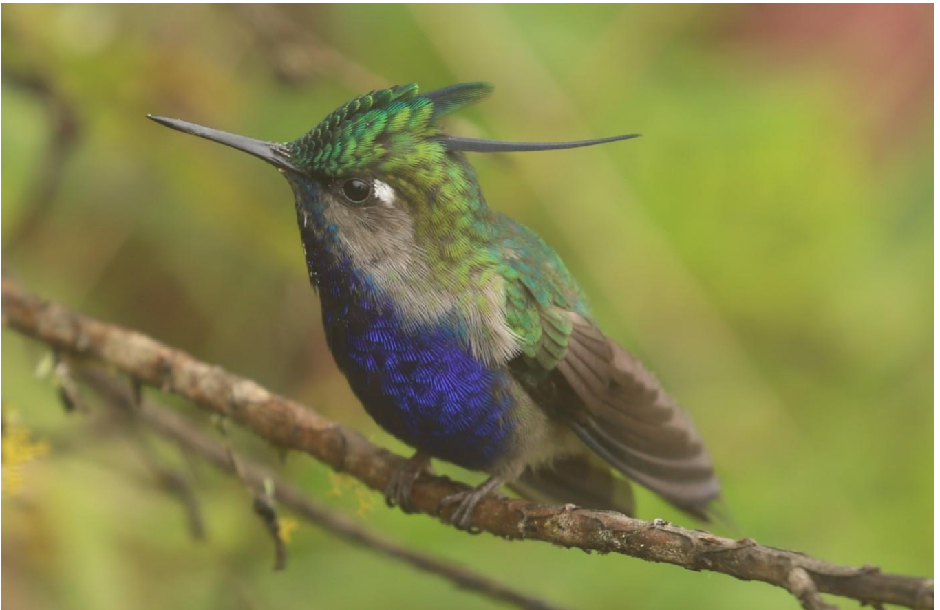
Green-crowned Plovercrest (Andy Foster)