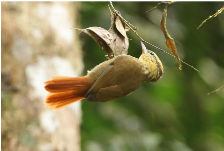
Sharp-billed Treehunter (Andy Foster)

We drove on up the track to our next stop and as soon as we got out of the minibus we picked up a pair of Gray-capped Tyrannulets, this was followed shortly afterwards by great views of a Scale-throated Hermit, Rufous Gnateater, Black-and-white Hawk-Eagle and a White-browed Warbler. We headed on up the track on foot and came across an amazing mixed flock which contained Buff-browed Foliage-gleaner, Ochre-faced Tody-Flycatcher, Sharp-billed Treehunter, (we paused half way through to call in a Rufous-tailed Antthrush!), Plain Antvireo, White-browed Foliage-gleaner, Whiskered Flycatcher, Star-throated Antwren, Rufous-capped Spinetail, Eared Pygmy-Tyrant and a White-shouldered Fire-eye! We walked around the corner to more new birds, picking up White-barred Piculet, Black-goggled Tanager, Spot-billed Toucanet, Scaled Woodcreeper, White-throated Woodcreeper, Streaked Xenops and brief views of a Black-billed Scythebill! What an amazing couple of hours birding!