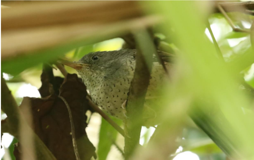
Spotted Bamboowren (Andy Foster)

With the weather slowly changing and distant storm clouds building we drove on and stopped briefly for a Variable Antshrike and Pale-breasted Thrush. Our next stop was by some large stands of bamboo where we saw a couple of Green-winged Saltator and amazingly, everyone had fantastic views of a Spotted Bamboowren! We headed back to the minibus and had our picnic lunch, shortly afterwards, it started to rain heavily with a brief pause before the heavens really opened! We sat in the minibus for around 30 minutes until the rain eased and we headed back to the bamboo where we had good views of Ochre-rumped Antbird, Buff-fronted Foliage-gleaner and another White-browed Foliage-gleaner.