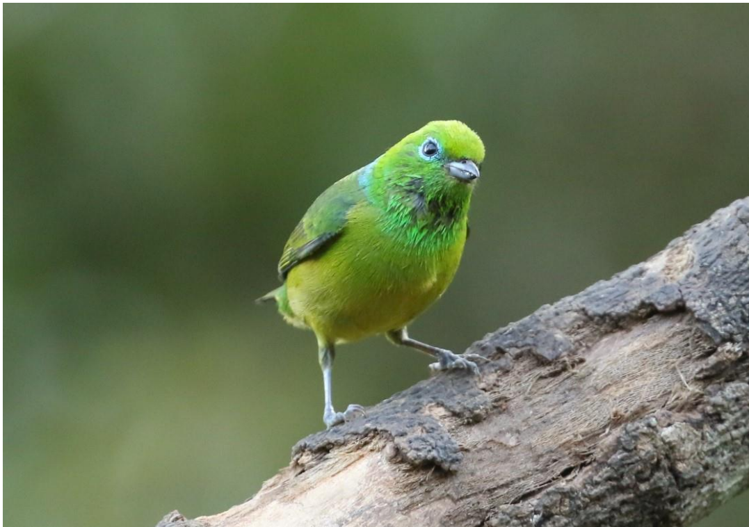
Blue-naped Chlorophonia (Andy Foster)

We met up just before breakfast at 05.45 and did some birding from the deck, picking up a pair of Blue-naped Chlorophonias in the process!