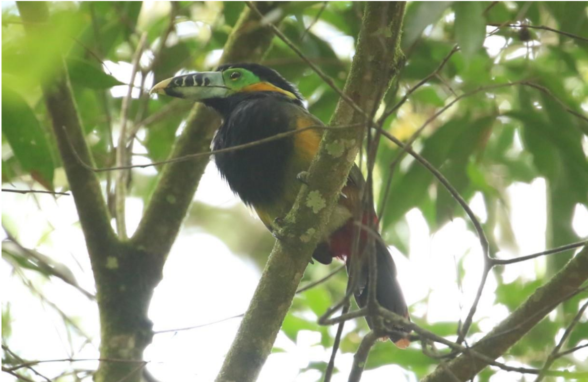
Spot-billed Toucanet

birding various trails within the grounds. As we had been so successful along the Macae de Cima Trail on Monday it was hard to find many new species this afternoon, this together with sporadic rain meant we saw fewer species than normal, but we did however manage to find Spot-billed Toucanet, Rufous-capped Motmot, Tufted Antshrike, Whiskered Flycatcher, Rufous-breasted Leaf-tosser, Atlantic Black-throated Trogon, Surucua Trogon, Greenish Schiffornis, Creamy-bellied Thrush, Rufous-headed Tanager and good views again of White-browed Woodpecker, so not such a bad afternoon after all!