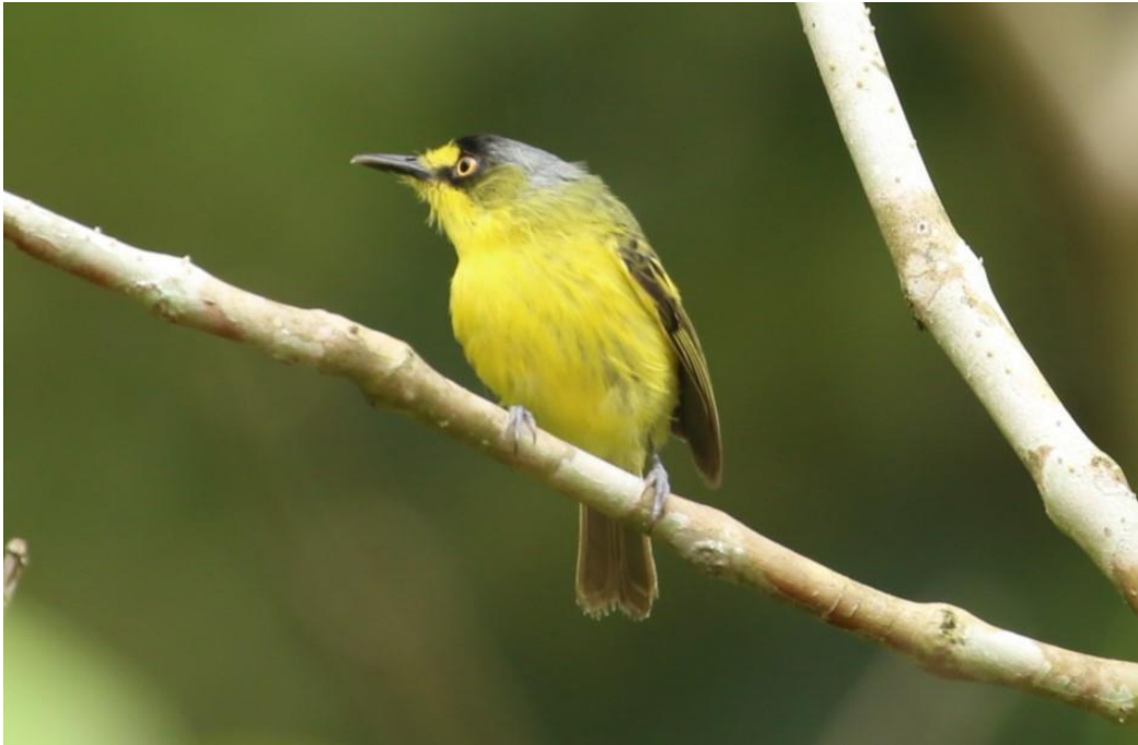
Gray-headed Tody-Flycatcher (Andy Foster)

Shortly after breakfast we set off for a days birding out towards Duas Barras and Sumidouro, with one of our main targets being the Three-toed Jacamar. We departed the lodge after breakfast and an hour later had arrived at our first birding spot of the day. As usual this was very productive and we picked up several great birds including Blue-winged Macaw, Toco Toucan, Yellow-chinned Spinetail, Glittering-bellied Emerald, Blue-black Grassquit, Double-collared Seedeater, Swallow-tailed Hummingbird, Streamer-tailed Tyrant and White bellied Seedeater.