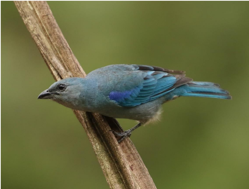
Azure-shouldered Tanager (Andy Foster)

Itororo lodge is located at 1200m in altitude, so has a wonderful cool climate compared to the lowlands in Rio. Upon arrival with tea and coffee to hand, we got to grips with the “common” feeder birds including Ruby-crowned Tanager, Golden-chevroned Tanager, Plain Parakeet, Maroon-bellied Parakeet, Burnished-buff Tanager, Brassy-breasted Tanager, Sayaca Tanager, Azure-shouldered Tanager, Rufous-bellied Thrush and hummingbirds including Brazilian Ruby, White-throated Hummingbird, Violet-capped Woodnymph and Black Jacobin.