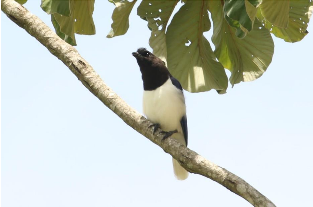
Curl-crested Jay (Andy Foster)

We arrived back at the lodge to some fresh coffee, tea and cake! We had a short break before dinner which was as usual served at 18.30, followed by our daily checklist. We had seen an amazing 104 species during the day!