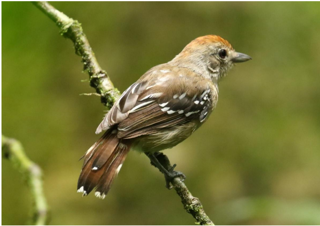
Sooretama Slaty Antshrike

We stopped for our picnic lunch before continuing along the Purple Trail where we picked up Moustached Wren, Chestnut-backed Antshrike and another of our main targets, Eye-ringed Tody-Tyrant. It was now nearing 14.00 so we turned around and started our walk back, picking up better views of Sooretama Slaty-Antshrike and White-flanked Antwren along the way, together with Grayish Mourner, Long-billed Wren, Amazon Kingfisher and Palm Tanager.