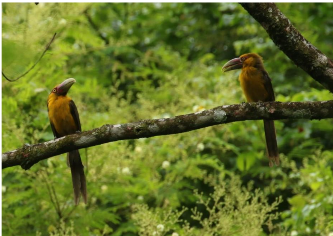
Saffron Toucanets (Andy Foster)

We arrived at our first destination of Tres Picos, it had clearly been quite windy during the night but it was thankfully calmer now, although large rain clouds were starting to form already. We set straight to work and used some mixed tanager flock playback with an instant response from Violaceous Euphonia, Chestnut-bellied Euphonia and a male Orange-bellied Euphonia. I was then going to use some playback for Saffron Toucanet when suddenly Paulo spotted one in a nearby tree, a little bit of playback had them flying over and perching very close by, we had 8 in total, what a great bird!