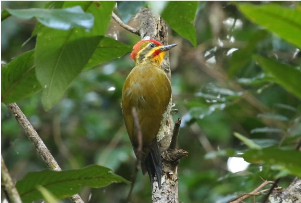
Yellow-browed Woodpecker (Andy Foster)

It was quite a cloudy morning but it was clear that the sun would soon come through and burn off any early morning mist. With the weather forecast looking good we set after breakfast for a days birding along the road towards Macae de Cima. Half an hour later we pulled off the main road and started our way up the dirt track. Our first stop was quiet as there was still very little sunshine but we did manage to pick up Crested Oropendola, Yellow-browed Woodpecker, Uniform Finch, Orange-eyed Thornbird, Gray-hooded Attila and Cliff Flycatcher.