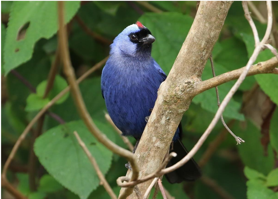
Diademed Tanager

We started our long walk back down towards the minibus picking up a few more species along the way, but the weather had turned against us and there was now thick cloud everywhere, which really cut down visibility and hampered our efforts to find new species. We did however manage to find a Velvety Black-Tyrant and some of the group had very brief flight views of a Gray-winged Cotinga.