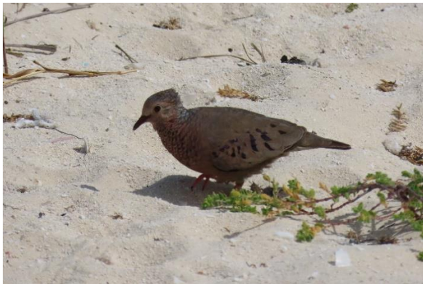
Common Ground Dove