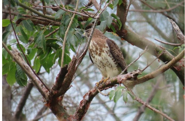
Broad-winged Hawk (Cuban ssp.)

88 American Barn Owl Tyto furcata furcata Playa Larga 2024-02-26