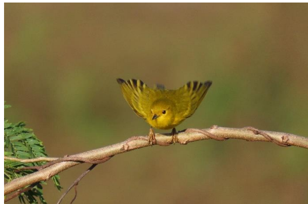
Yellow (Golden) Warbler