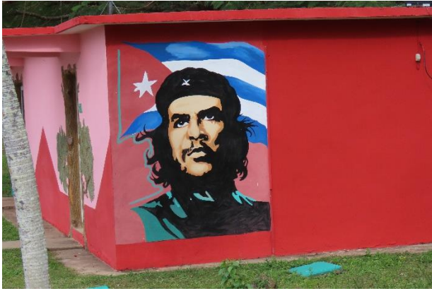
Ernesto "Che" Guevara