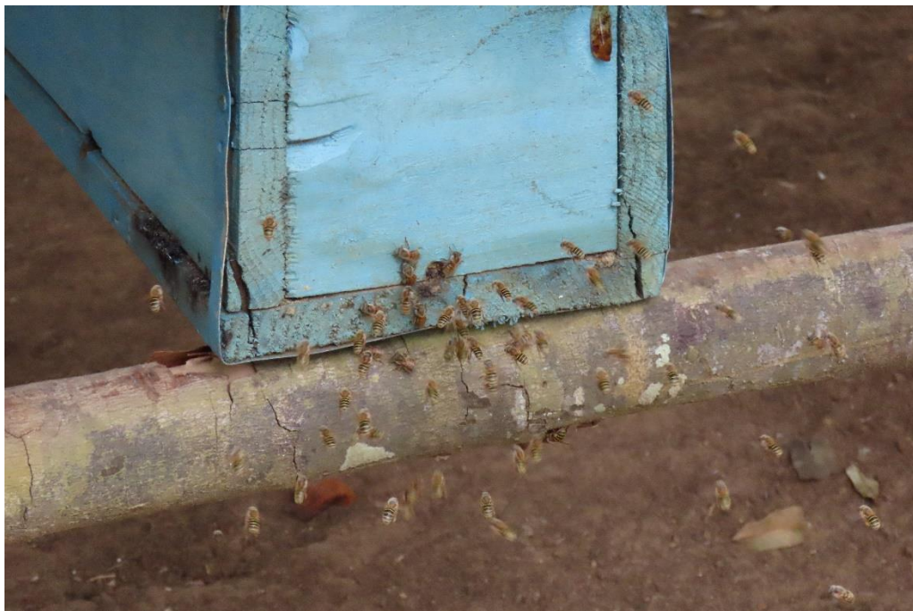
Sampling honey and honeycomb from Cuban stingless bees