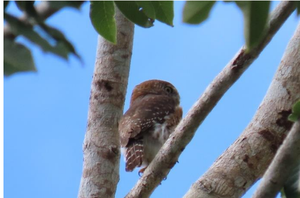
Cuban Pygmy Owl

91 Stygian Owl Asio stygius siguapa Lifer Las Terrazas -- Reserva de la Biosfera Sierra del Rosario 2024-02-24