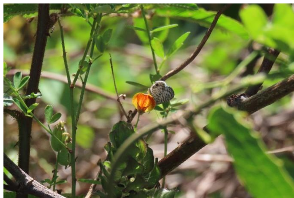
Tropical Striped (Cassius) Blue