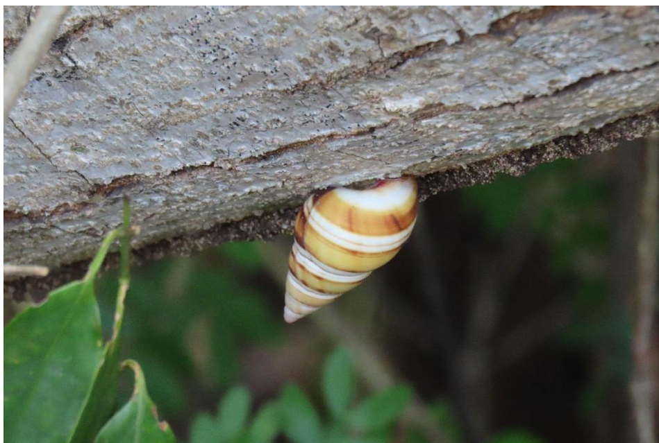
Florida Tree Snail