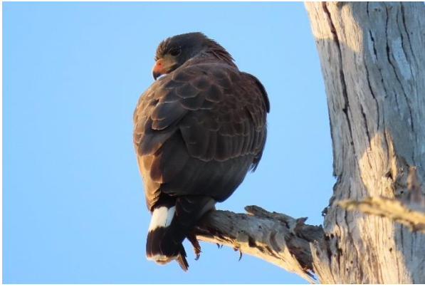
Cuban Black Hawk