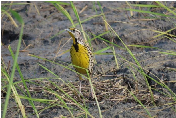
Eastern Meadowlark (Cuban ssp.)