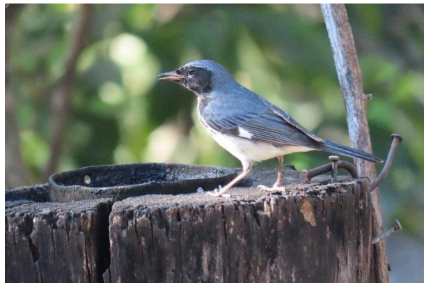
Black-throated Blue Warbler