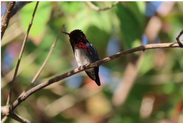
Bee Hummingbird (male)