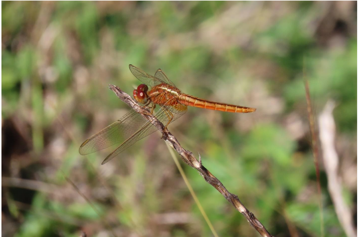
Oriental Scarlet (Scarlet Skimmer)