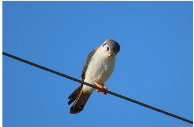
American Kestrel (Cuban ssp.)