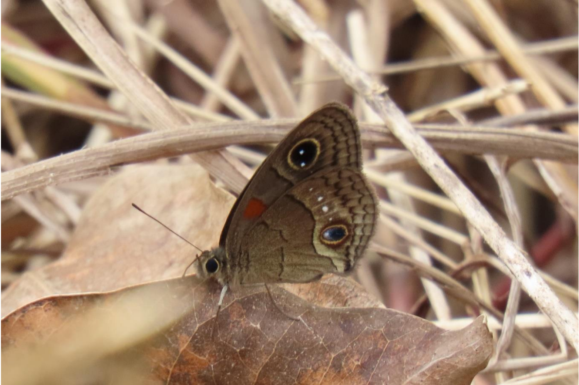
Hubner's Glad-eye (Cuban Common Calisto)