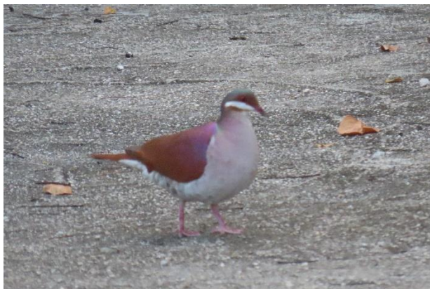
Key West Quail-Dove