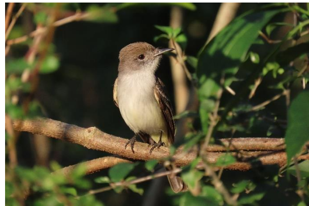
La Sagra's Flycatcher