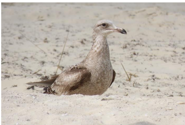
American Herring Gull