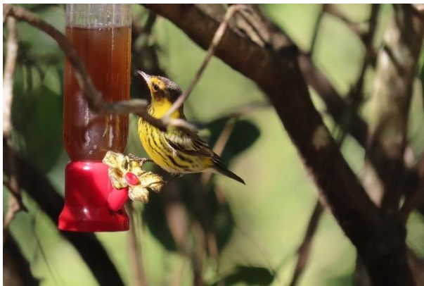
Cape May Warbler