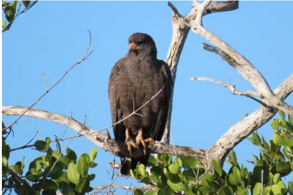
Cuban Black Hawk