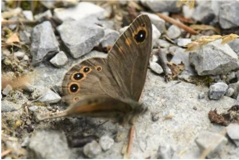
Northern Wall Brown