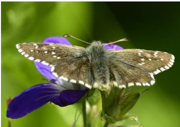
Oberthur's Grizzled Skipper