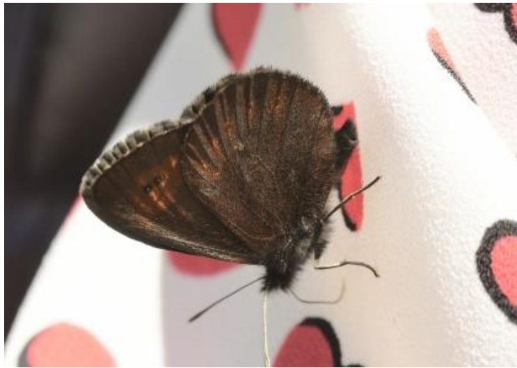
Woodland Ringlet (on wife`s arm)