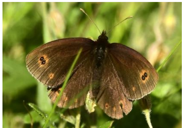
Common Brassy Ringlet