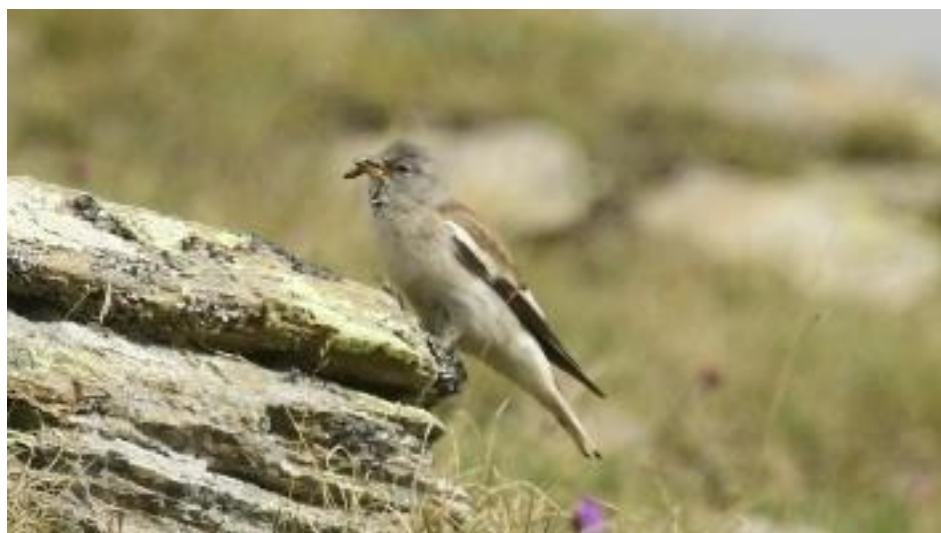
White-winged Snowfinch (These were only seen at the top of the Obergurgl gondola area)