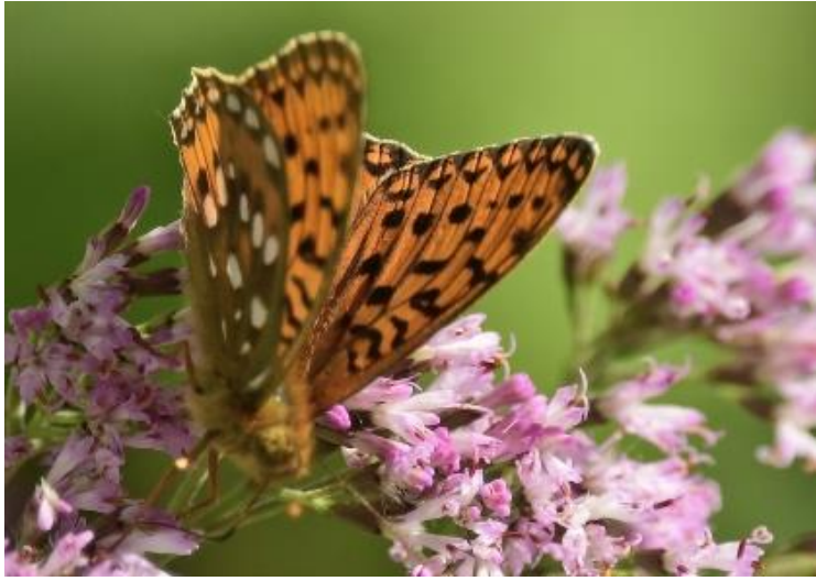
High Brown Fritillary