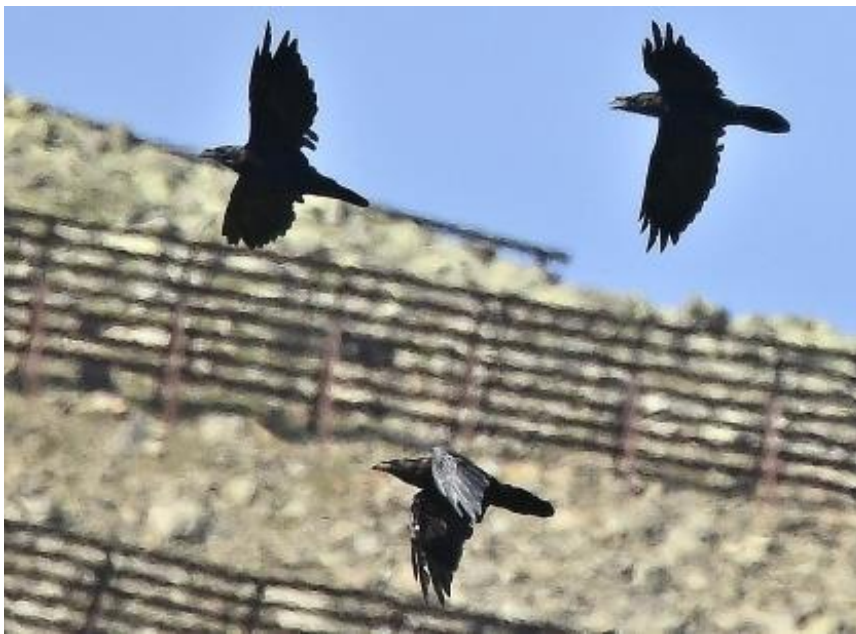
Three Ravens at Solden mid station, Alpine and Red Billed Choughs were also seen here.