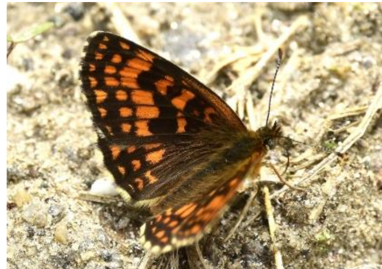
False Heath Fritillary