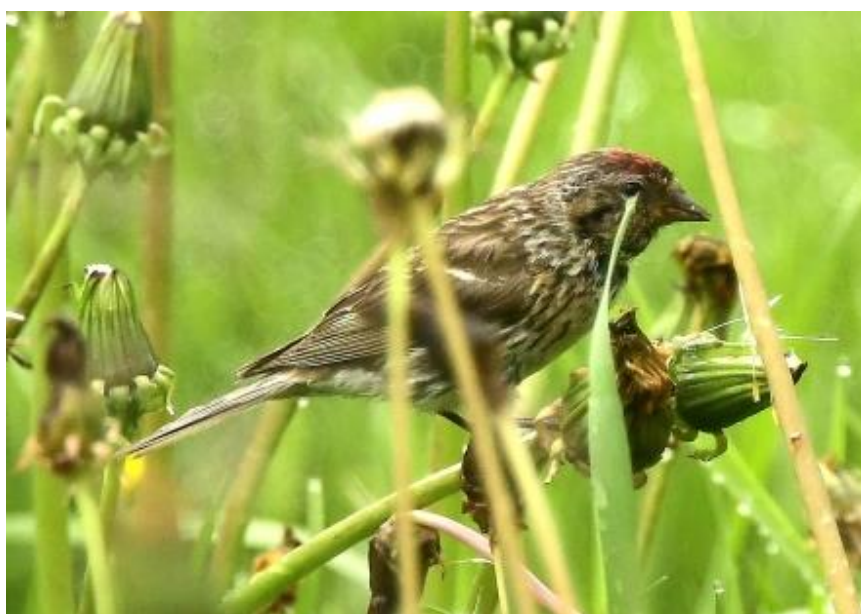
Redpolls and Linnets were common behind the hotel as were Cuckoos, Crag Martins, Sand Martins and Common Swifts