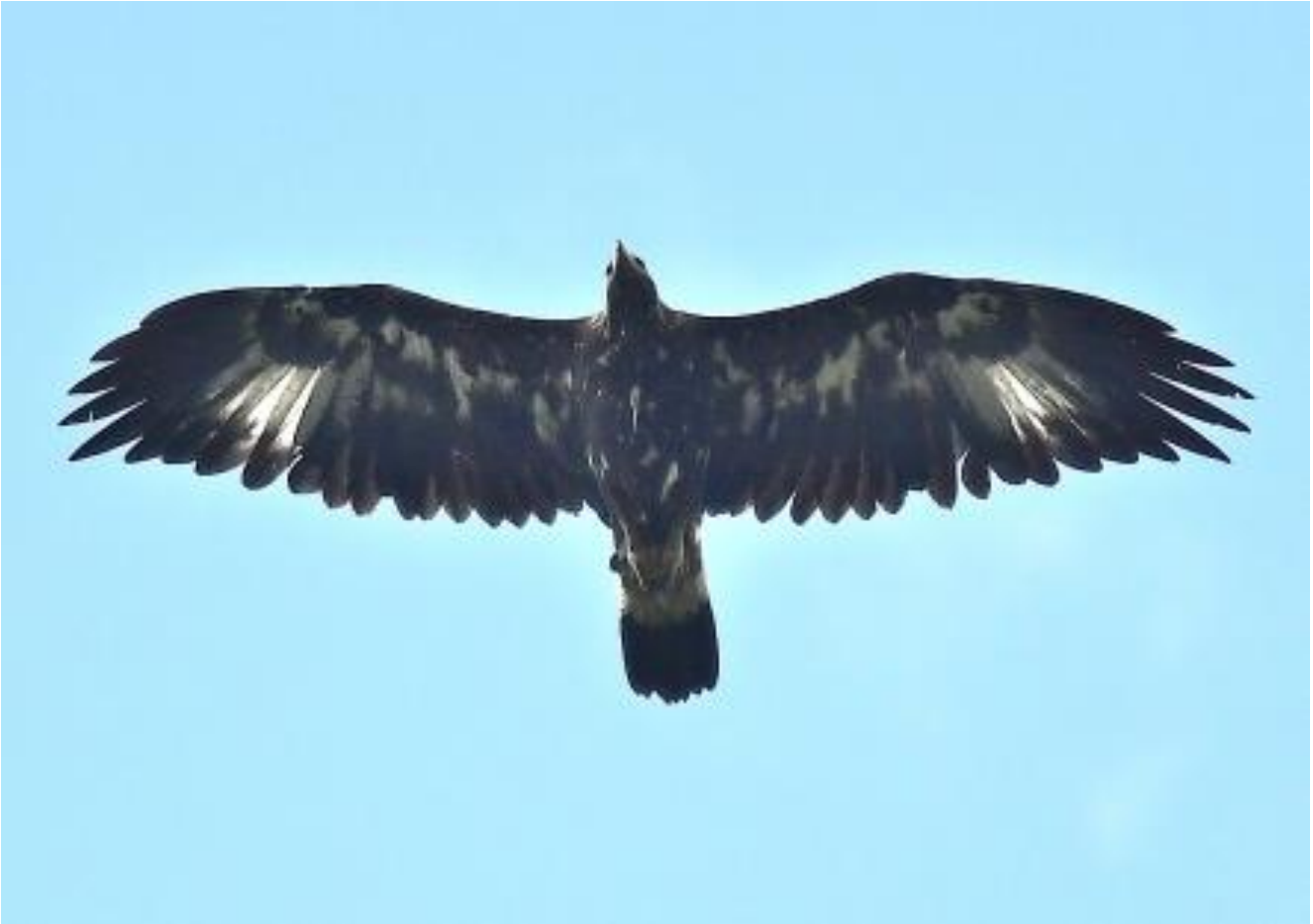
Golden Eagle at Solden