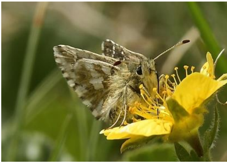
Large Grizzled Skipper