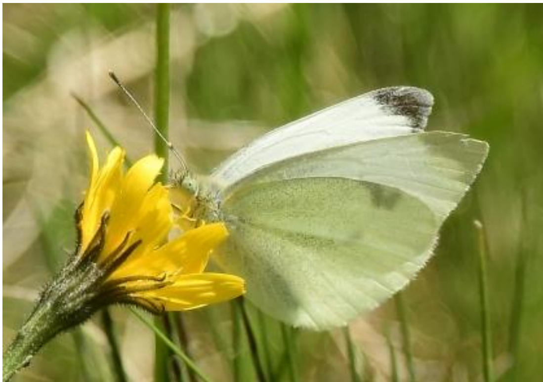
Southern Small White

In addition to the butterflies shown above common UK butterflies seen and identified were; Small White, Large White, Common Blue, Red Admiral, Small Tortoiseshell, Painted Lady and Orange Tip.