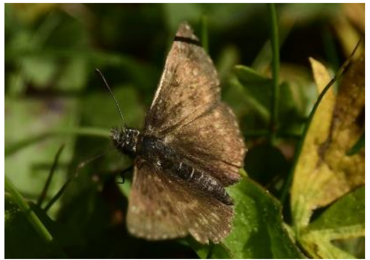
Marbled Skipper (probable!)