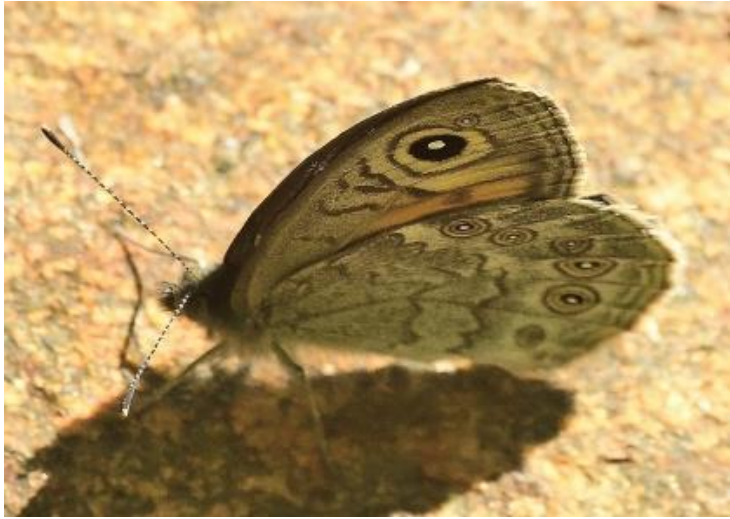
Large Wall Brown