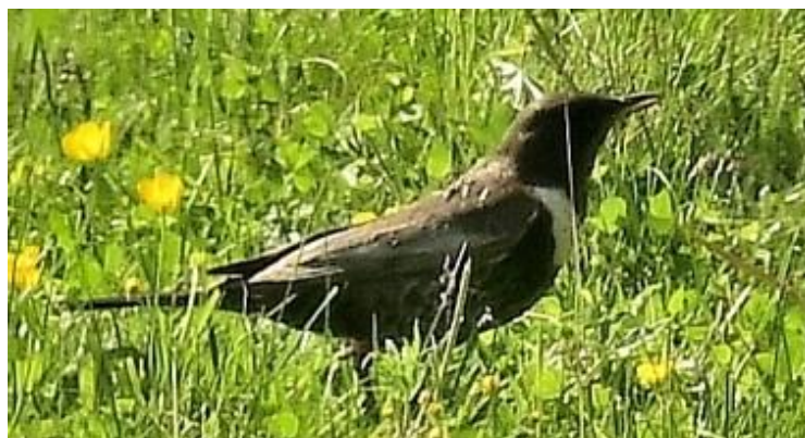
Ring Ouzel on Solden ski run