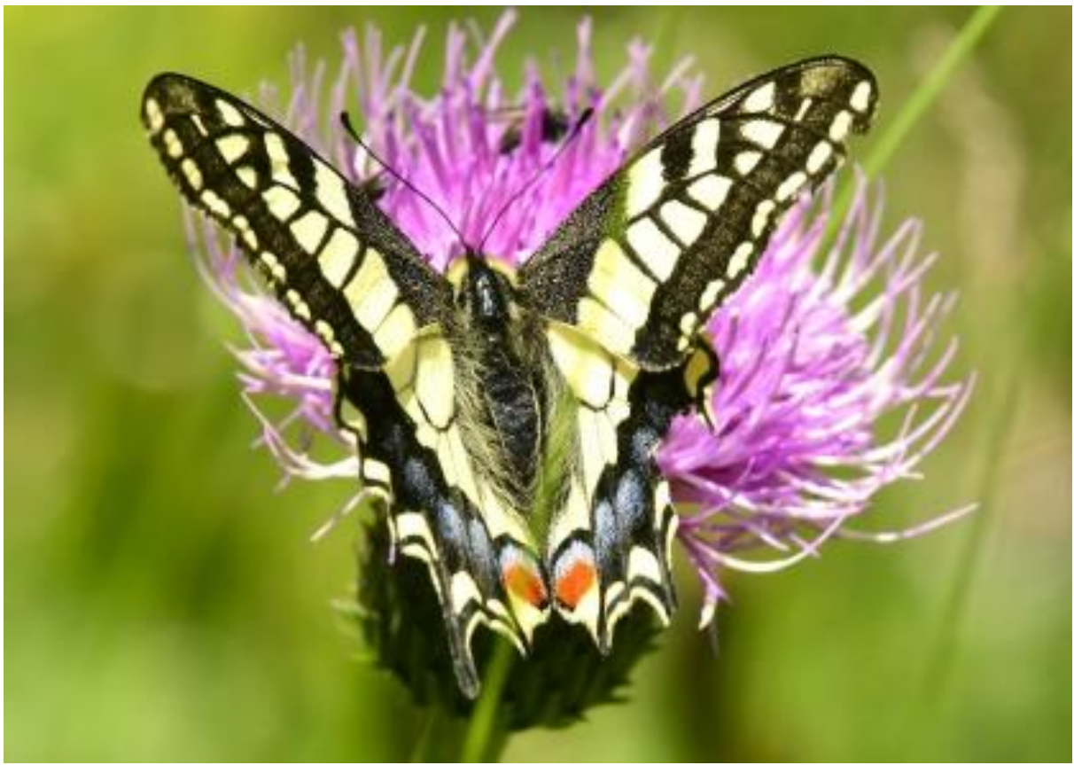
Swallowtail (very common!)