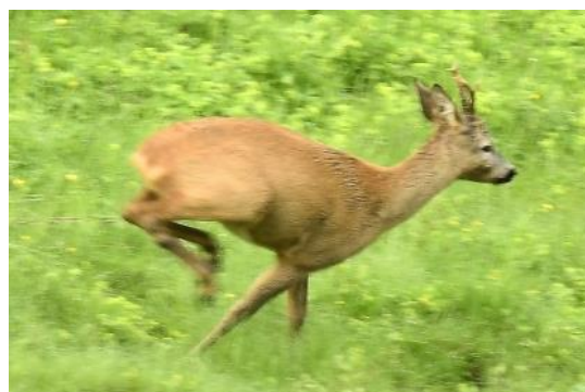
This Fallow Deer was running at speed behind our hotel