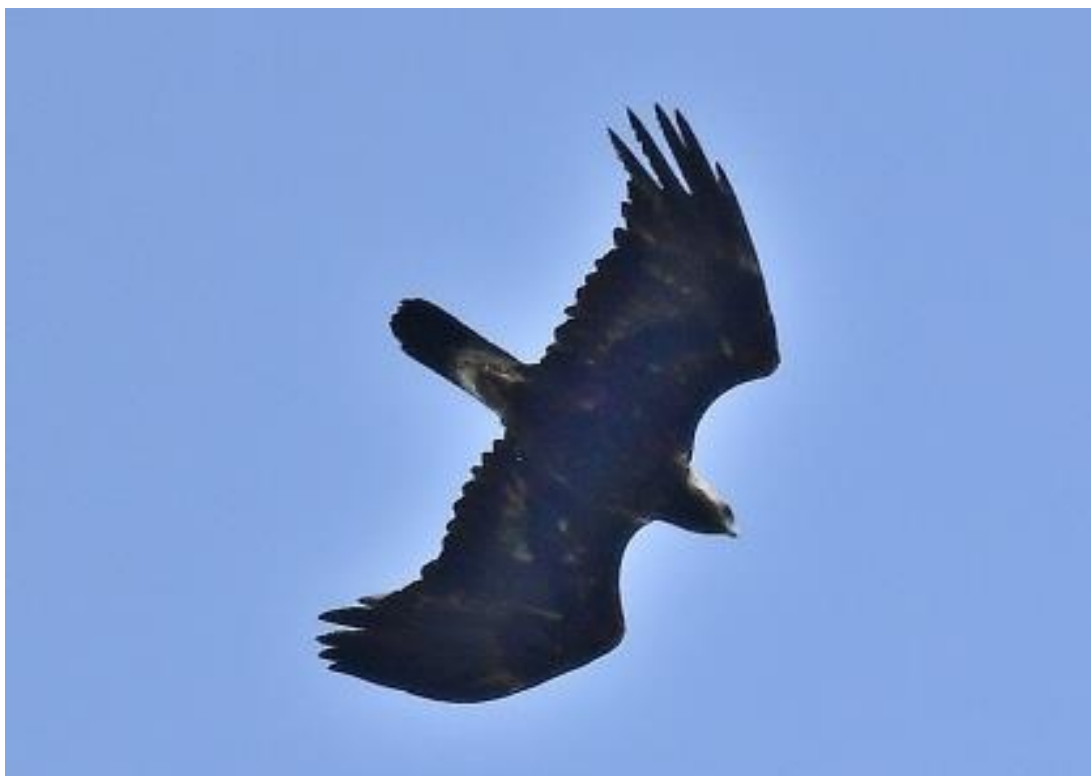
This was the second Golden Eagle flying with top picture Eagle, the first good sighting of these fabulous birds in eight weeks of holidays!