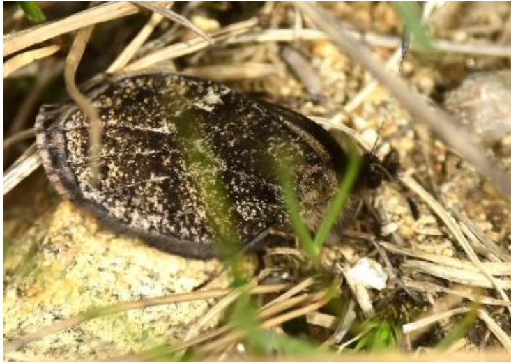
Sooty Ringlet (probable)