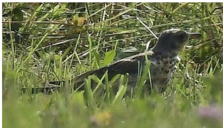
Fieldfare at Solden