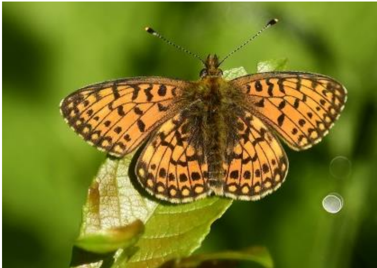
Small Pearl-bordered Fritillary