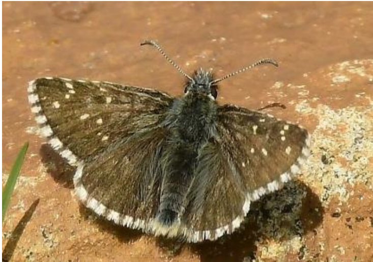
Dusky Grizzled Skipper