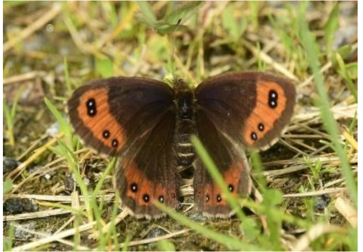
Stygian Ringlet (Probable)