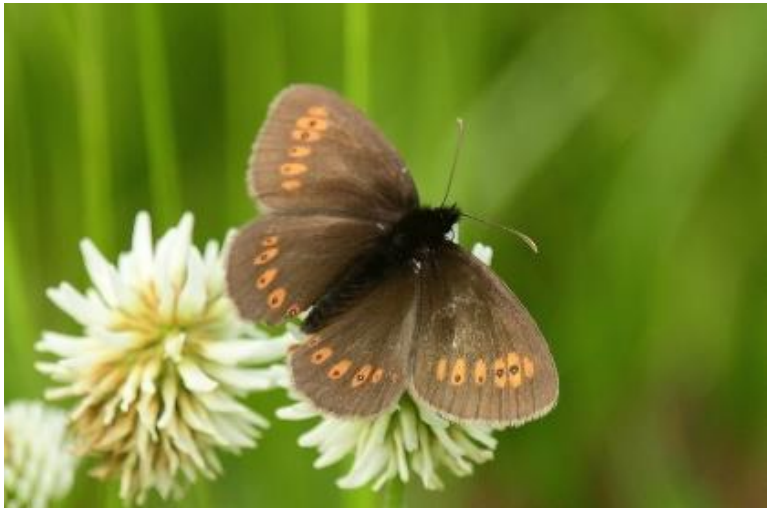
Lesser Mountain Ringlet