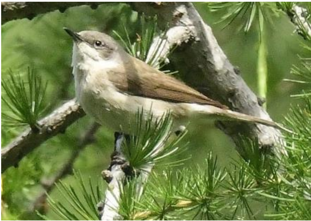
Western Orphean Warbler (probable)