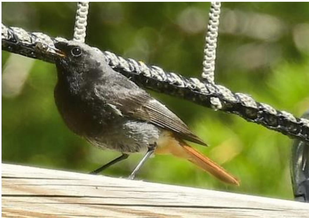
Black Redstart were fairly common and nested in the hotel roof