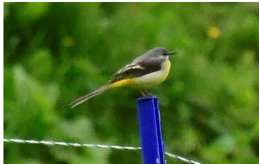
Grey Wagtail (behind hotel)

For a full list of species seen please see table at the end of this report.