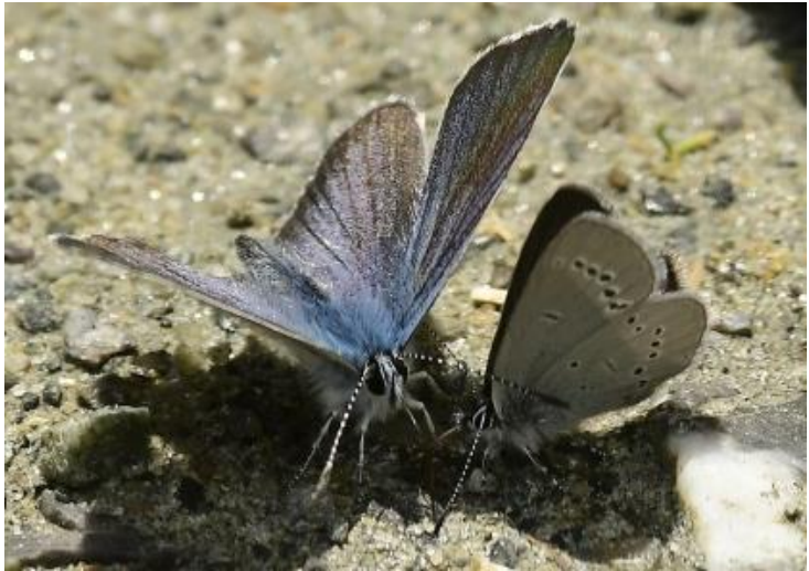
Little Blue (right hand) with Silver Studded