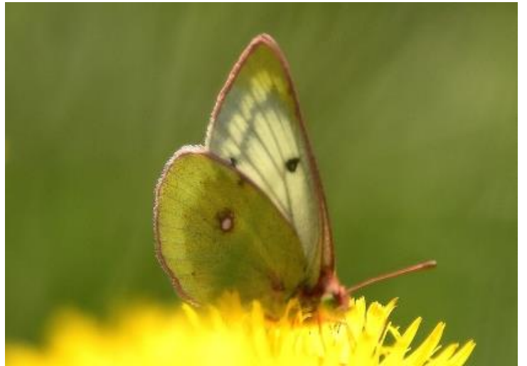
Mountain Clouded Yellow