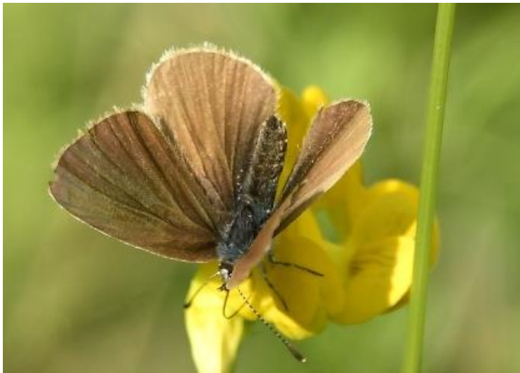
Dusky Large Blue