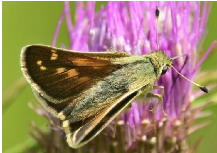
Silver Spotted Skipper