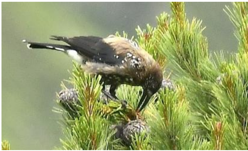
Nutcracker (common in most areas)