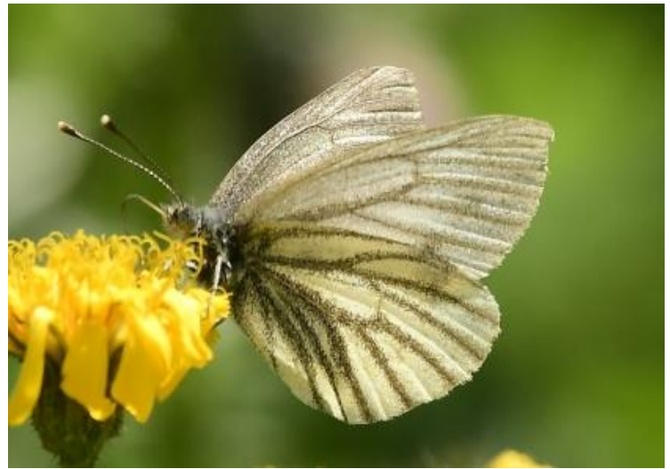
Mountain Green-veined White