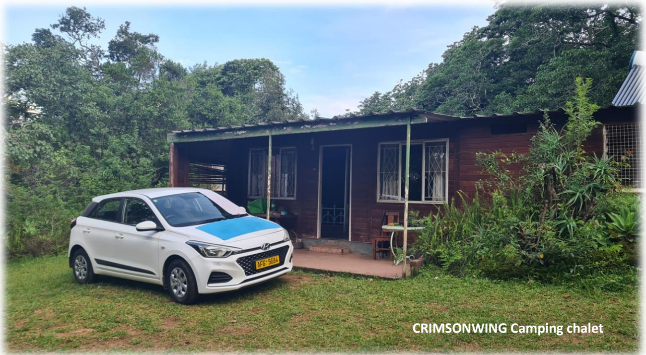
CRIMSONWING Camping chalet