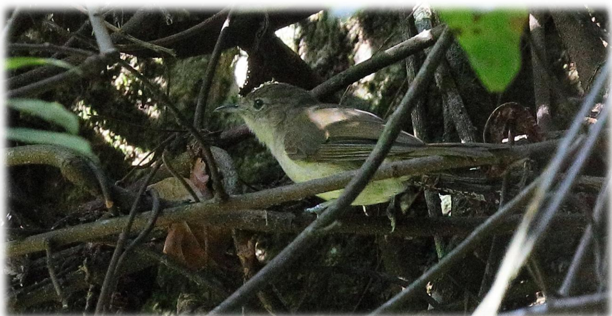
237. SHARPE'S GREENBUL ( Phyllastrephus alfredi ) MALAWI/ ZAMBIA 2-4. Nov 18 th Manyanjere Forest which is actually in Zambia. The birds were singing as soon as we entered the forest and eventually showed well although it was still dark for photos. Split from Yellow-streaked Greenbul.