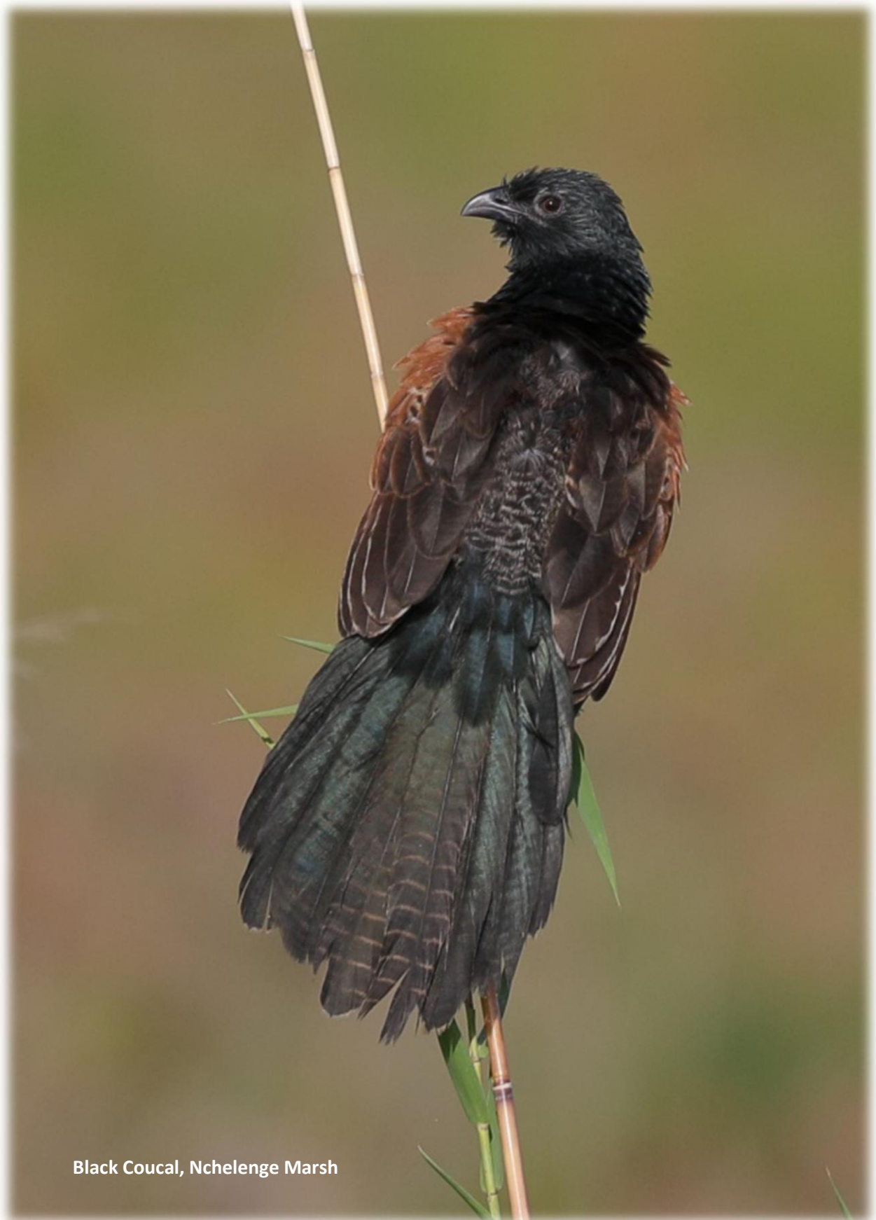
Black Coucal, Nchelenge Marsh