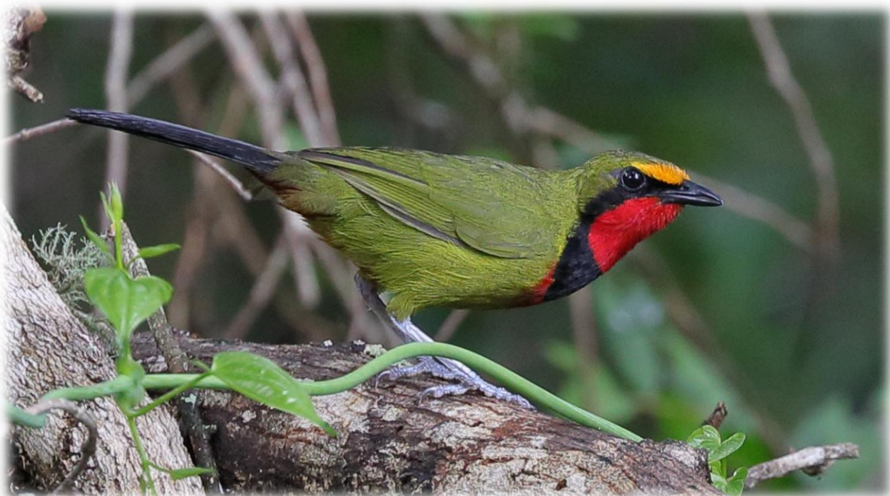
198. Gorgeous Bushshrike (Four-colored) ( Telophorus viridis [quadricolor-group]) AKA Perrin's Bushshrike . ZAMBIA 2 seen and another 8 heard, Dec 2 nd at Mavunda Forest.