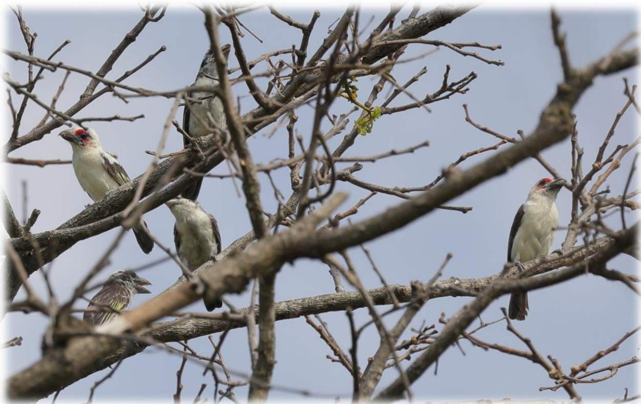
166. CHAPLIN'S BARBET ( Lybius chaplini ) ZAMBIA 6+, Nov 28 th , Chisimba. Very easy from the roadside searching the fruiting trees.