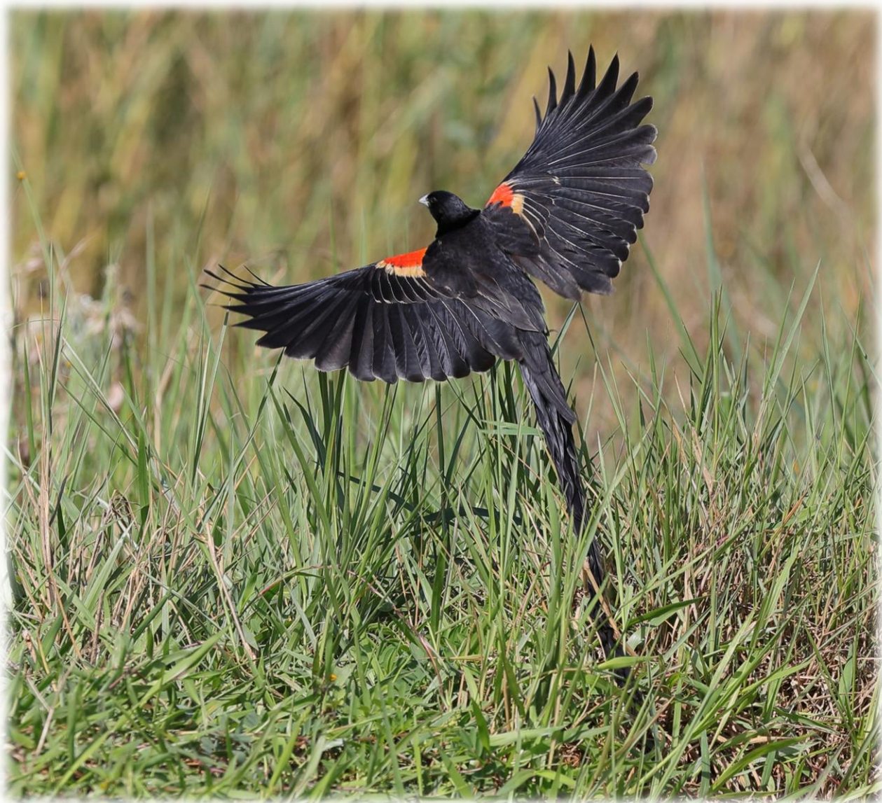
368. Long-tailed Widowbird ( Euplectes progne ) ZAMBIA 3+ males c 10km north of the Luapula River Bridge.