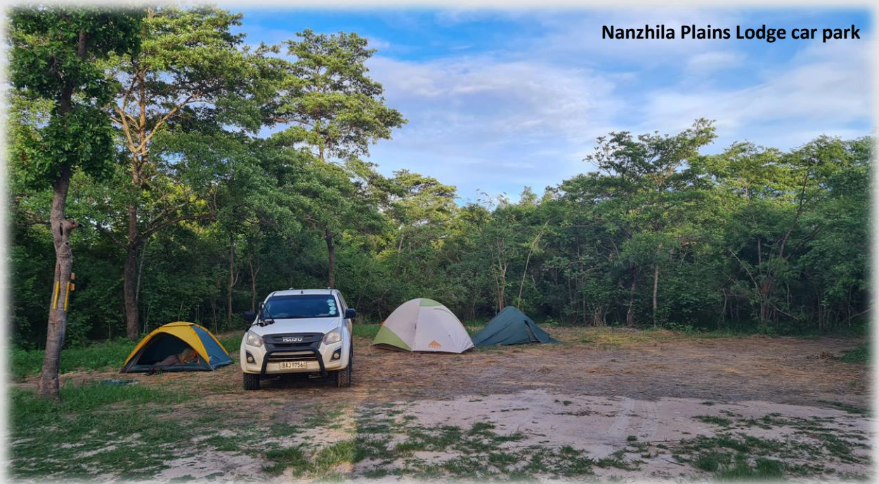
Nanzhila Plains Lodge car park

We did have some issues at the Airport; The ATM's there were quite temperamental and on arrival, it took several attempts to withdraw cash. A few days later I tried to withdraw 200,000 MKW (£96) and the machine didn't dispense the cash but took it from my account. Never had these problems before..... anywhere.