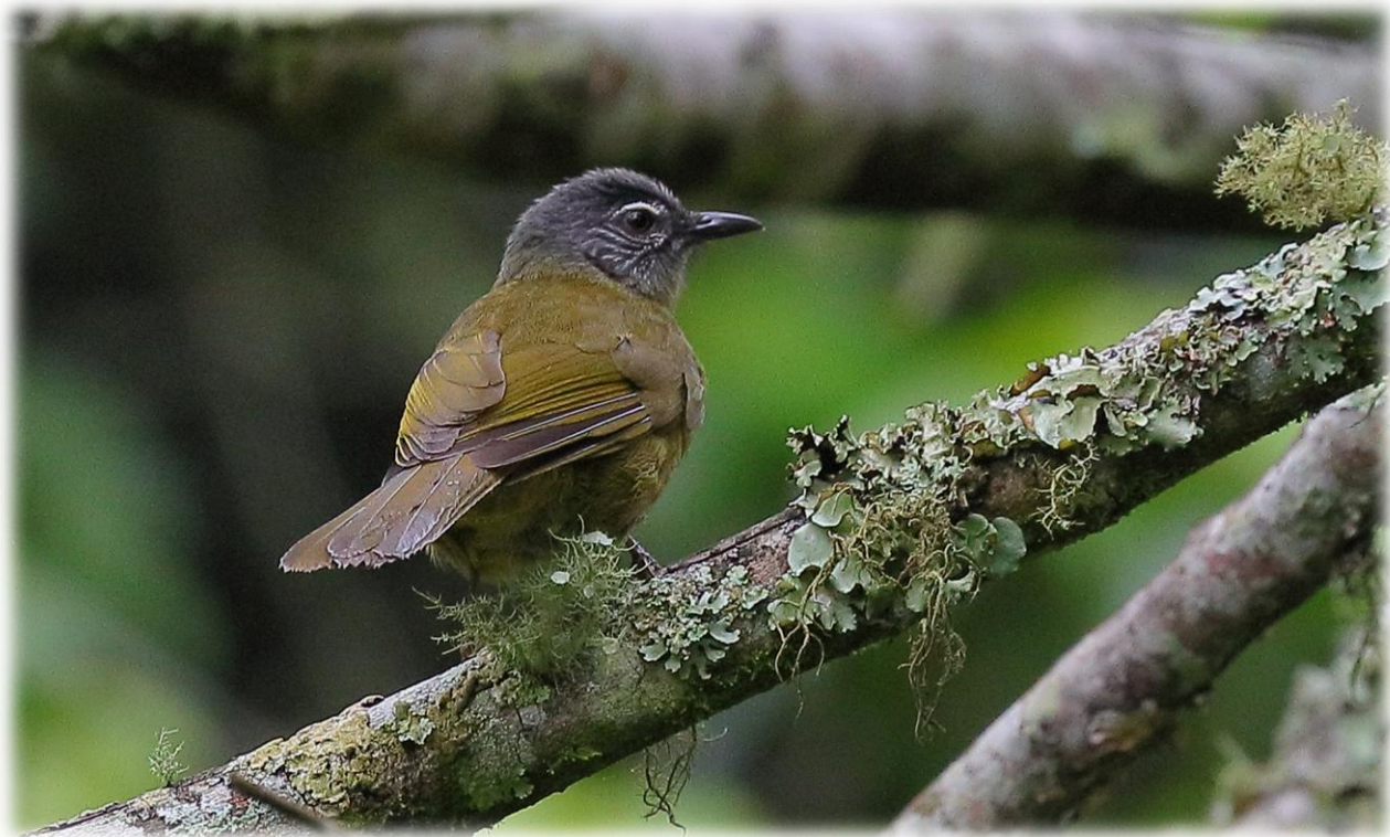
232. STRIPE-CHEEKED GREENBUL ( Arizelocichla milanjensis ) ZIMBABWE c 20, Dec 18 th Seldomseen where the most common bird.