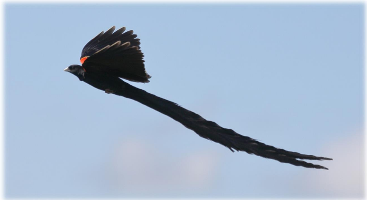
367. Red-collared Widowbird ( Euplectes ardens ) ZIMBABWE 2 males and a female near Mutare.