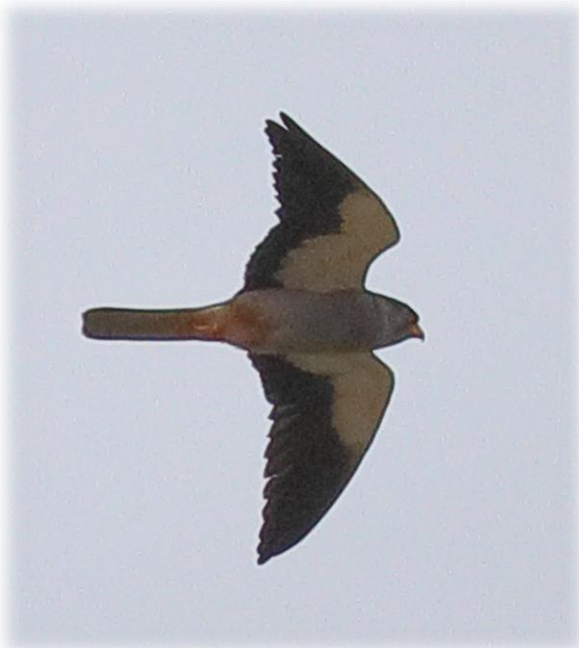
181. Dickinson's Kestrel ( Falco dickinsoni ) MALAWI 2, Liwonde. ZAMBIA 2 north of Mwinilunga, 2, Mwekera, 1 at Mutinondo and 1 at Kafue NP.