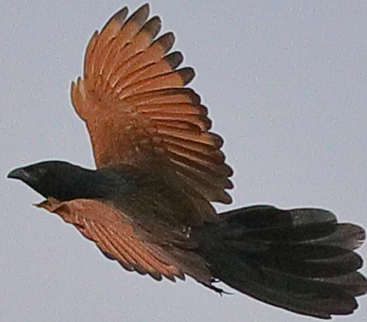
Black Coucal, Nanzhila Plains.