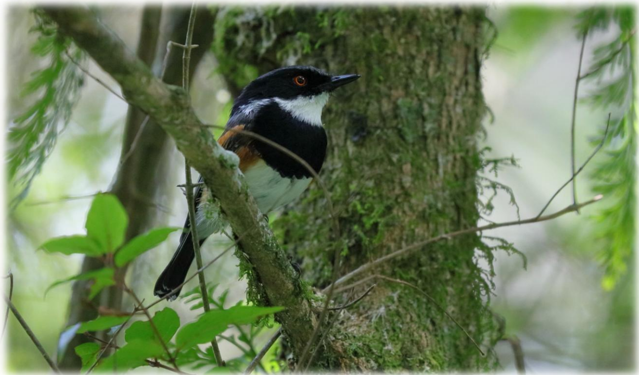
193. Cape Batis (Grey-mantled) ( Batis capensis [capensis-group]) ZIMBABWE Common at Seldomseen.