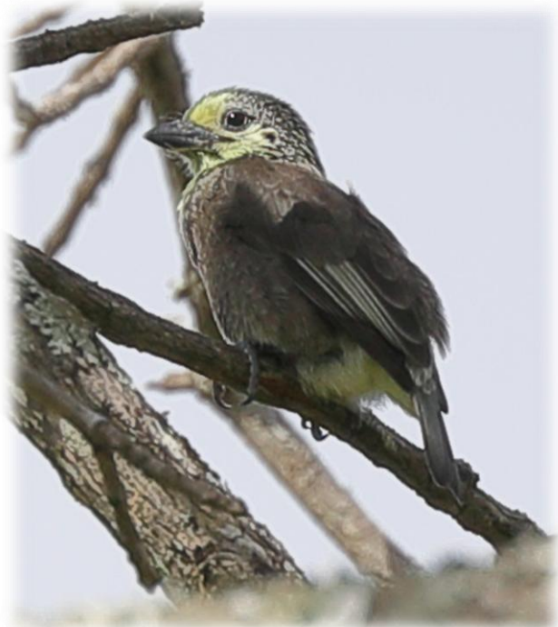
162. Anchieta's Barbet ( Stactolaema anchietae ) ZAMBIA Up to 9 birds at Mutinondo seen, but probably lots more.