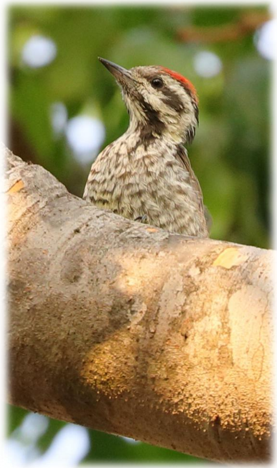
180. STIERLING'S WOODPECKER ( Dendropicos stierlingi ) MALAWI 2, Nov 25 th Dzalanyama (photo) and another Nov 26 th .