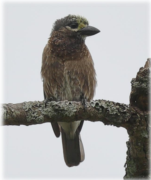
160. White-eared Barbet (White-eared) ( Stactolaema leucotis leucotis/kilimensis ) MALAWI 1-2 at Zomba. ZIMBABWE 1, Seldomseen.