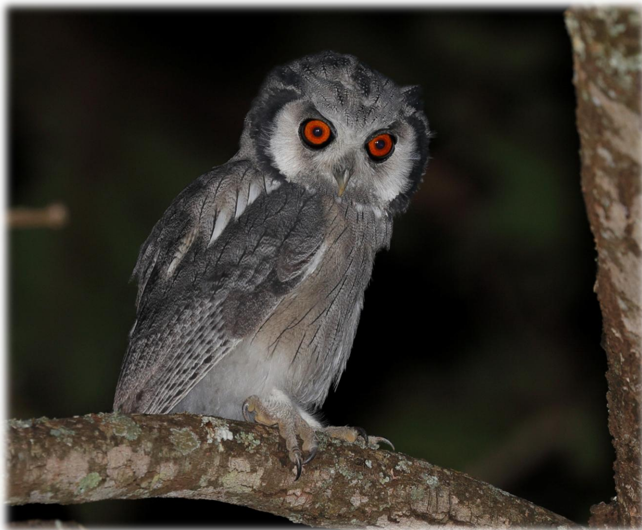
128. SOUTHERN WHITE-FACED OWL ( Ptilopsis granti ) ZAMBIA 1, Nov 29 th perched on the dirt road 1-2 birds east of Mwinilunga. We stopped and turned off the headlights and waited playing the call after a few minutes. We then heard a growling call from the opposite side of the road and found this bird perched out in the open and very confiding. Another at Mutinondo near the Big Chipundu dambo. Note red irides.