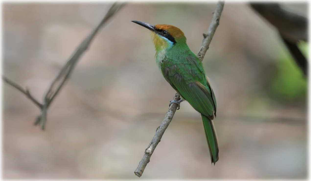
157. Böhms Bee-eater ( Merops boehmi ) MALAWI 5+ Liwonde.