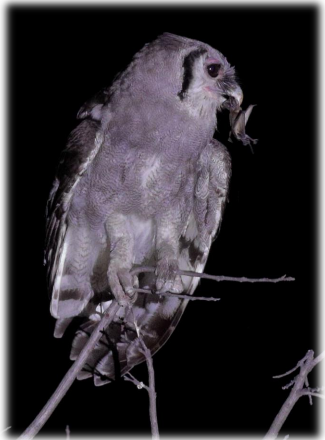
130. Verreaux's Eagle-owl ( Ketupa lactea ) MALAWI A pair calling at the Blend Hostel at Zomba, the much larger female above left. Another with a bat, above right, at Liwonde.