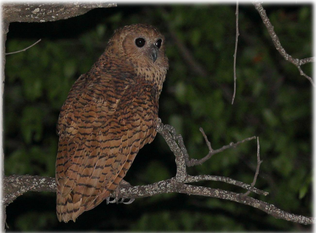
131. Pel's Fishing Owl ( Scotopelia peli ) MALAWI 2 birds, Nov 22 nd Liwonde.