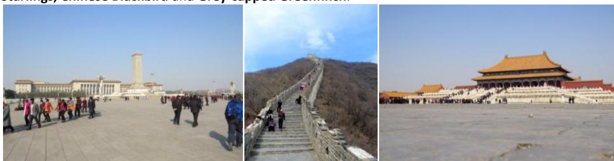
Left to right: Tiananmen Square, Mutianyu Great Wall, Forbidden City. Note the recurring absence of crowds...

birds including Grey-capped Pygmy Woodpecker , Crested Myna and both White-cheeked & Red-billed Starlings , Chinese Blackbird and Grey-capped Greenfinch .