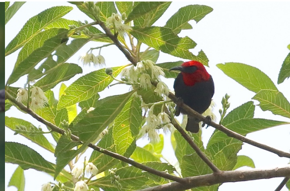
New Caledonian Myzomela ( Myzomela caledonica )