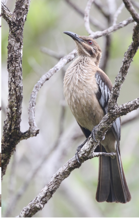
New Caledonian Friarbird ( Philemon diemenensis )