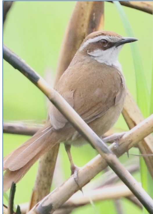
New Caledonian Thicketbird ( Cincloramphus mariae )