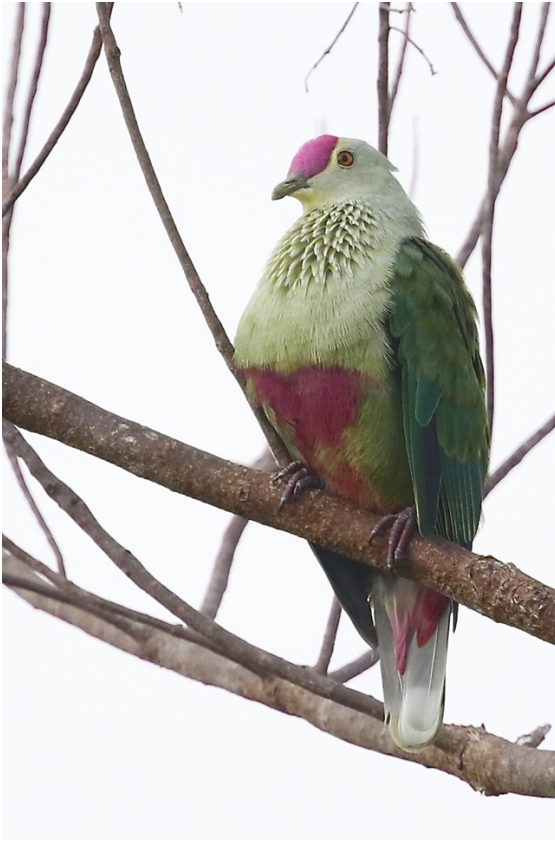
Red-bellied Fruit Dove ( Ptilinopus greyi )