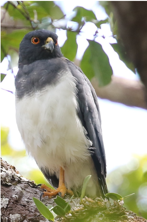
White-bellied Goshawk ( Accipiter haplochrous )

Recorded around the garden at Mont Dore on several occasions.