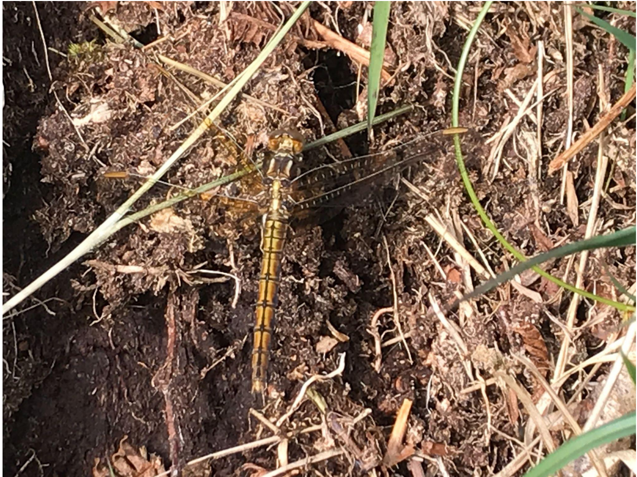
Keeled Skimmer, Arisaig

Northern Damselfly: 2 Logierait Azure Damselfly Common Blue Damselfly Blue-tailed Damselfly Large Red Damselfly Azure Hawker: 7 Glengarry Pinewoods