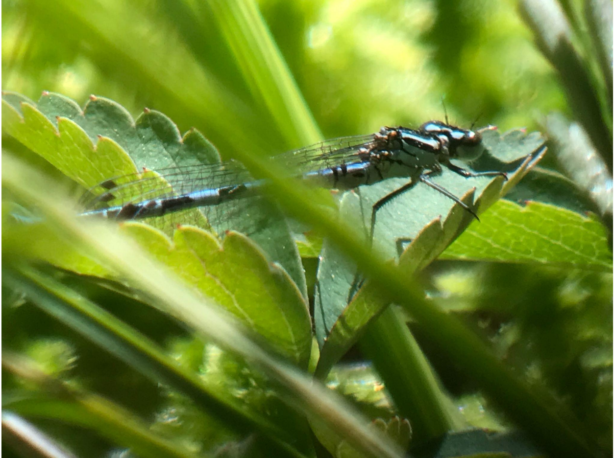
Male Northern Damselfly, Logierait

Blair Atholl Estate , Glen Tilt car park (56.77426, -3.84349).