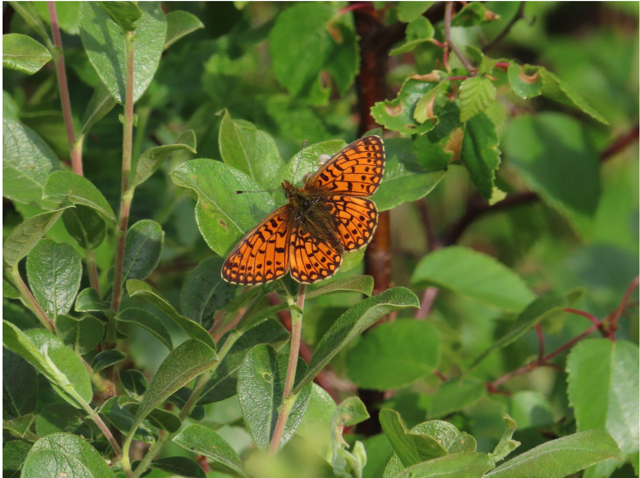
Small Pearl-bordered Fritillary, Glasdrum Wood

Chequered Skipper: Allt Mhuic, Glen Loy, Glasdrum Wood