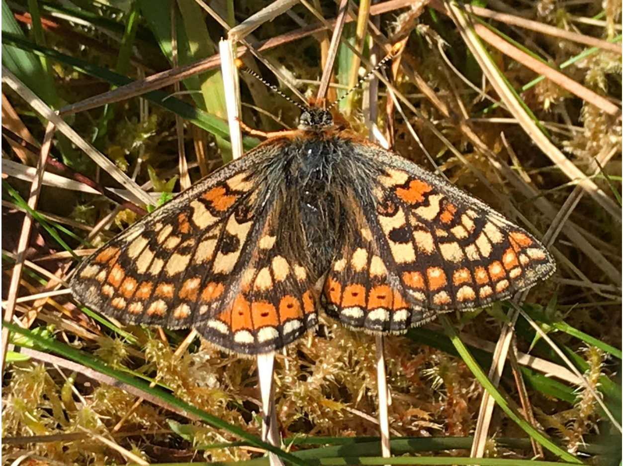
Marsh Fritillary, Arisaig

Loch Bran , car park (57.238891, -4.474854).