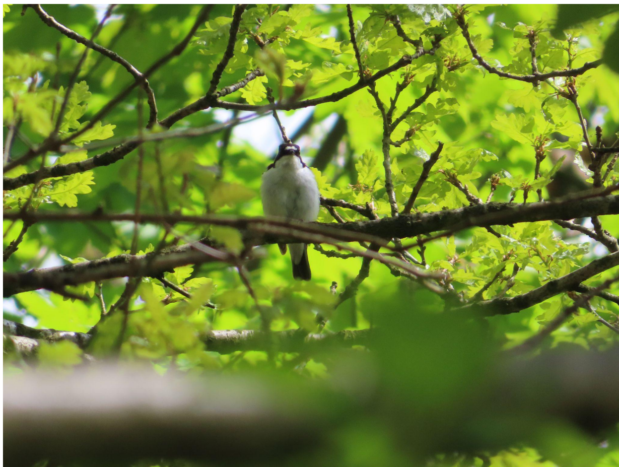
Male Pied Flycatcher, Tunstall Reservoir, Durham