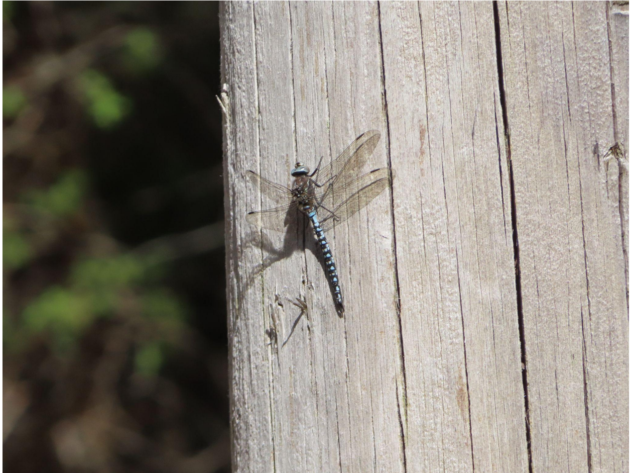
Basking Azure Hawker, Glengarry

saw a Golden-ringed Dragonfly here. Carry on following the track and at (57.070286, -4.851113) you will see a small track on the right, do down here about 30 yards and on your left through the trees you will see a sphagnum pool. During our visit in warm sunshine this pool was absolutely teeming with odonatas—dozens each of Four-Spotted Chaser and Large Red Damselfly . Also present were at least 5 male White-faced Darters and a single Azure Hawker . Along the track we saw several piles of Pine Martin droppings (said to be a common species in this area), while Wild Cat and Otter are also said to occur. The only mammal we saw was a Roe Deer .