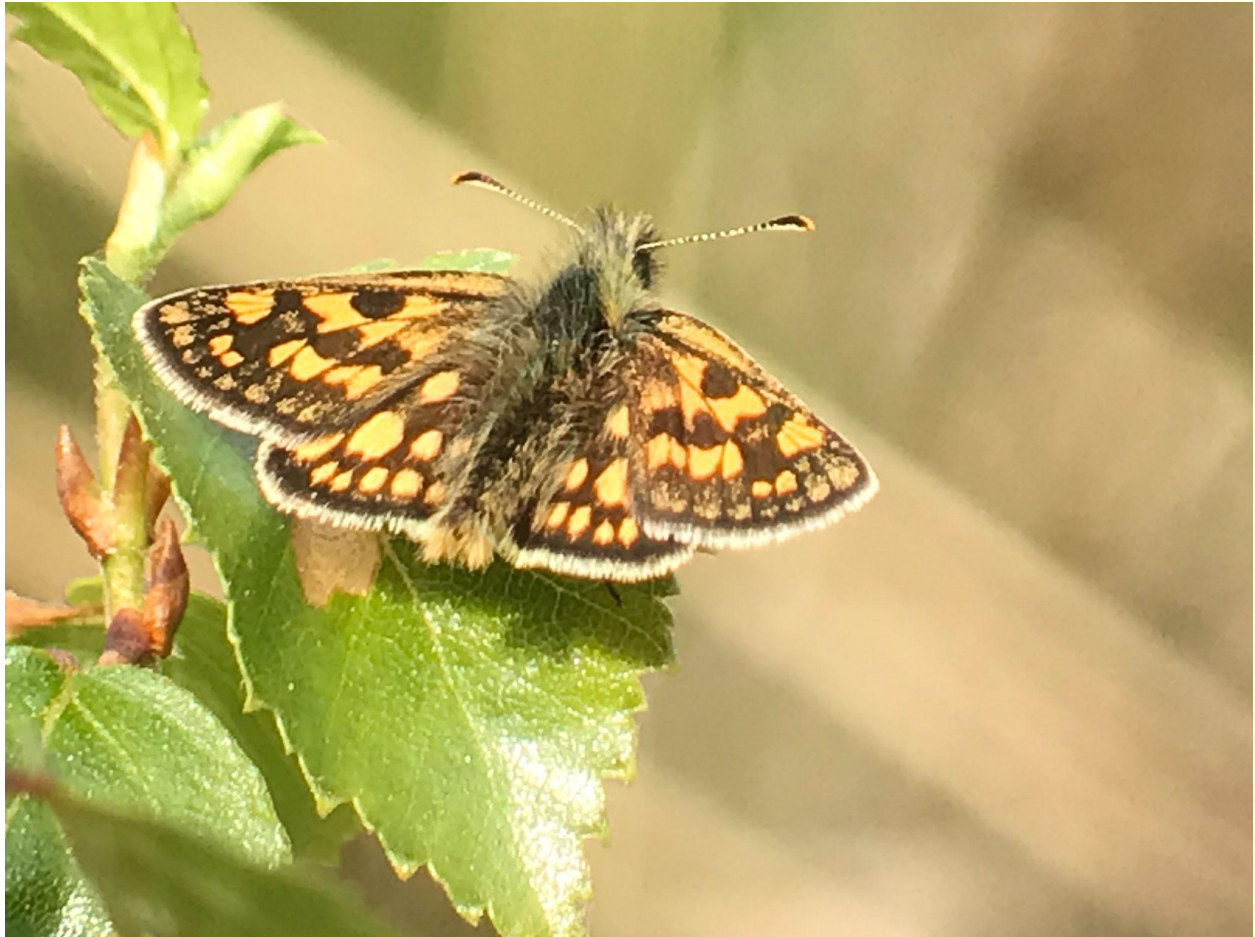
Chequered Skipper, Altit Mhuic

This was a trip primarily timed and centred around observing Chequered Skipper , a species that had previously eluded us during our previous visit to the Fort William area (admittedly at the wrong time of year and in poor weather!). Below I've given grid references in the format they appear in Google Maps, so simply paste them into that platform and it should take you straight to the relevant site.