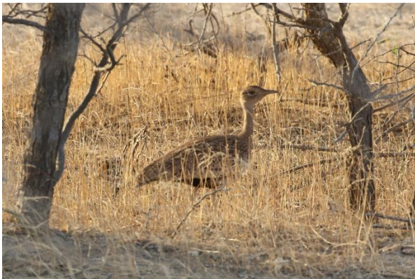
Savile's Bustard, Marigots