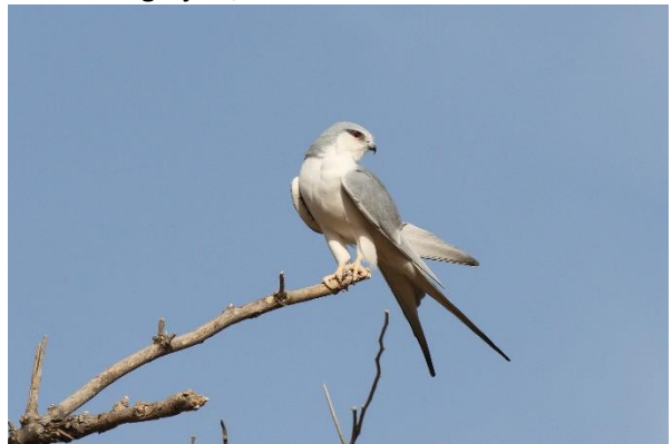
Scissor-tailed Kite, Kousmar Island