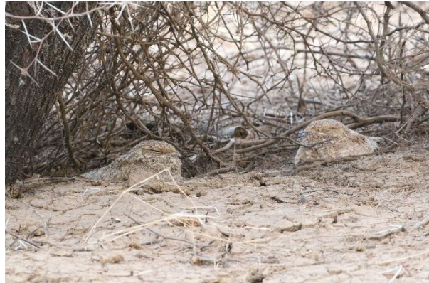
Golden Nightjars, Podor