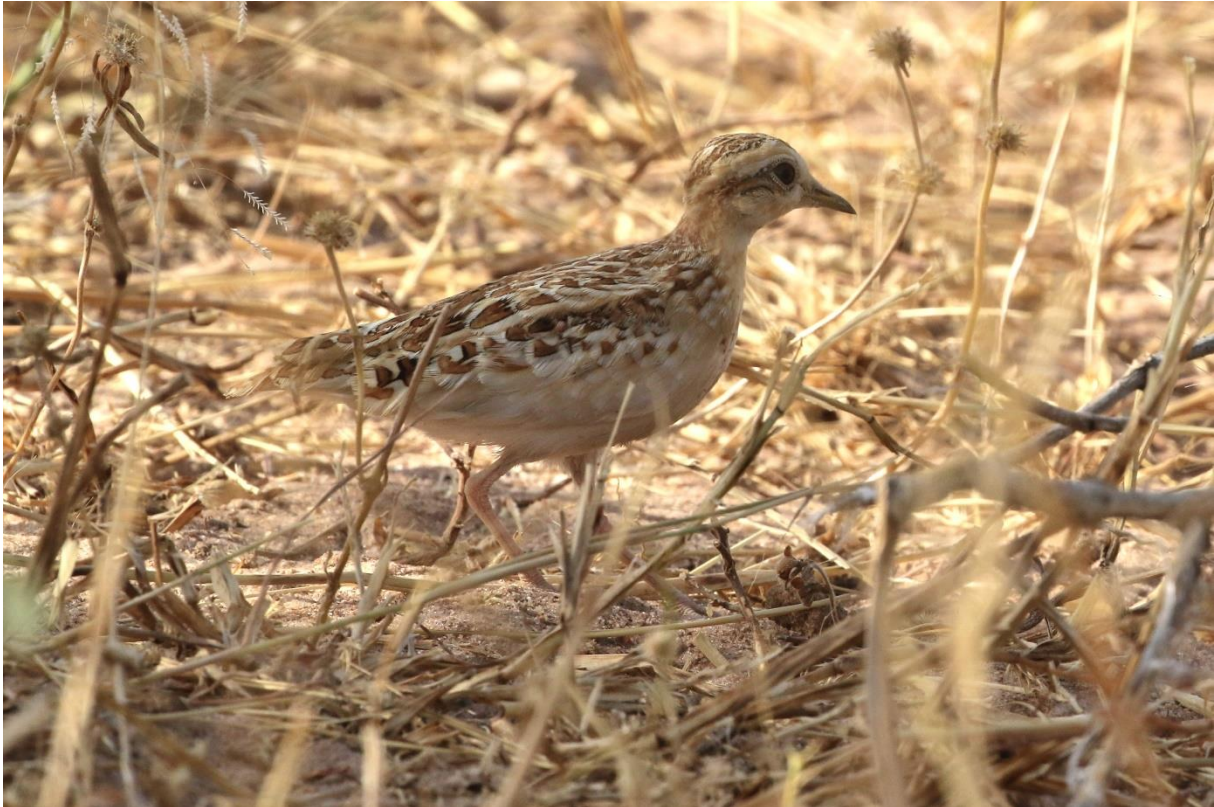
Quail-plover near Mbacké