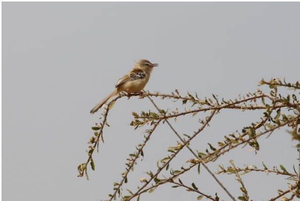
Cricket Warbler, Richard Toll