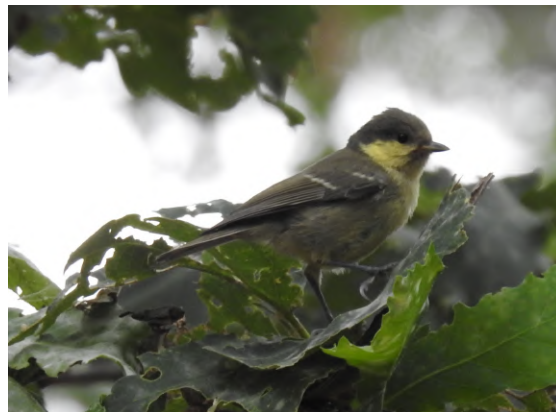
Eurasian Jay, Parc Djebel El Ouahch, 26 June 2022 (Ronald de Lange) / Coal Tit, Tamentout-forest, 25 June 2022 (Ronald de Lange). Two very distinctive subspecies of North Africa.