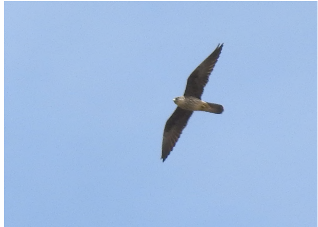
Booted Eagle, Ziama Mansouriah, 25 June 2022 / Eleonora's Falcon, Tamentout-forest, 25 June 2022