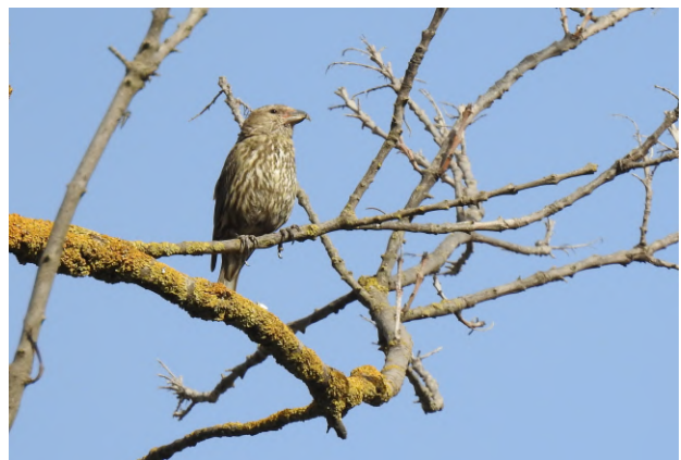
Red Crossbill, Parc Djebel El Ouahch, 26 June 2022. Another endemic taxon for North Africa.