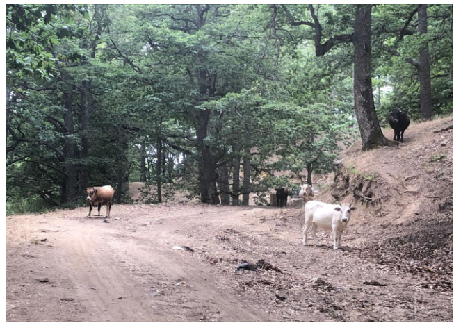
Temperature rising to 44 C on 26 June (Erik Ernens) / cattle in Tamentout-forest (Erik Ernens)

26 June: final morning in the field with Larbi. We first visited an unnamed site along CW51 just east of Parc Djebel El Ouahch. The latter parc is forested with pine trees making it a good site for species like Eurasian Jay, Common Firecrest and Red Crossbill. After that, we visited the beautiful Gorges du Rhumel with its bridges. It dissects the city of Constantine and is home to the localised cirtensis -subspecies of Eurasian Jackdaw. Very hot with the highest recorded temperature being 44 C, the highest I ever experienced anywhere in the world. After having seen and photographed the Gorge, the bridges and the birds, we were dropped at the airport where our plane departed at 13:30. We arrived on time at Orly, Paris, after which we drove back to the Netherlands where we arrived safely at our houses around midnight. Next day, it was a working day for us as usual.