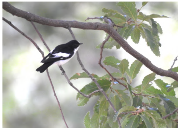
Short-toed Treecreeper, Tamentout-forest, 25 June 2022 (Erik Ernens) / Atlas Flycatcher, Tamentout-forest, 25 June 2022 (Ronald de Lange). Two more endemic taxa for North Africa.