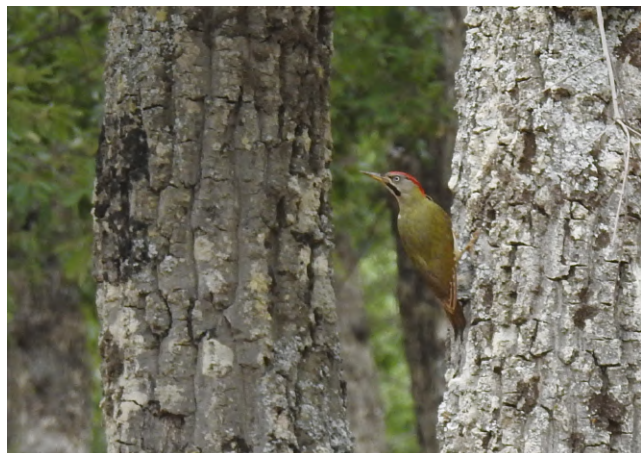
Ferruginous Duck, Taher, 25 June 2022 / Levillant's Woodpecker, Tamentout-forest, 25 June 2022