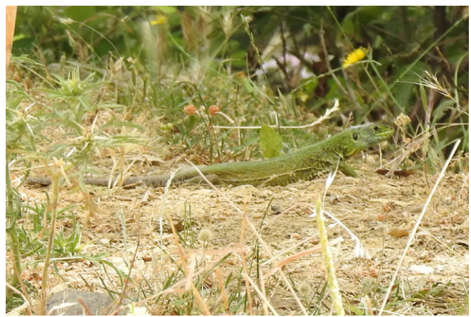
Barbary Macaque, near Taza, 25 June 2022 / Ocellated Lizard, Tamentout-forest, 26 June 2022.