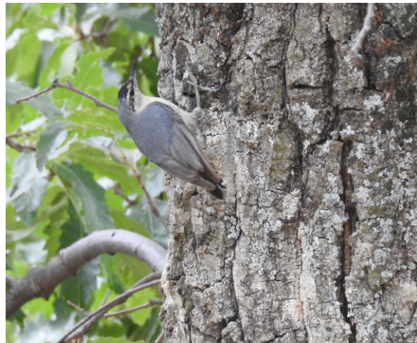
Algerian Nuthatch, Tamentout-forest, 25 June 2022