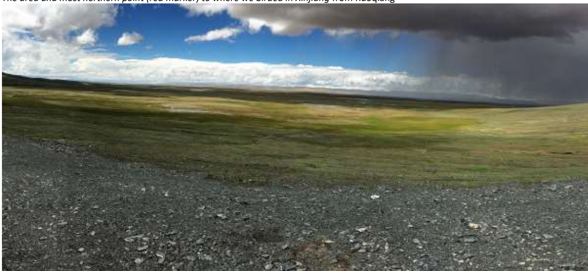
Into the great wide open.....(the Tibetan plateau)