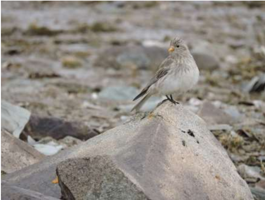
Female by Anne Murray