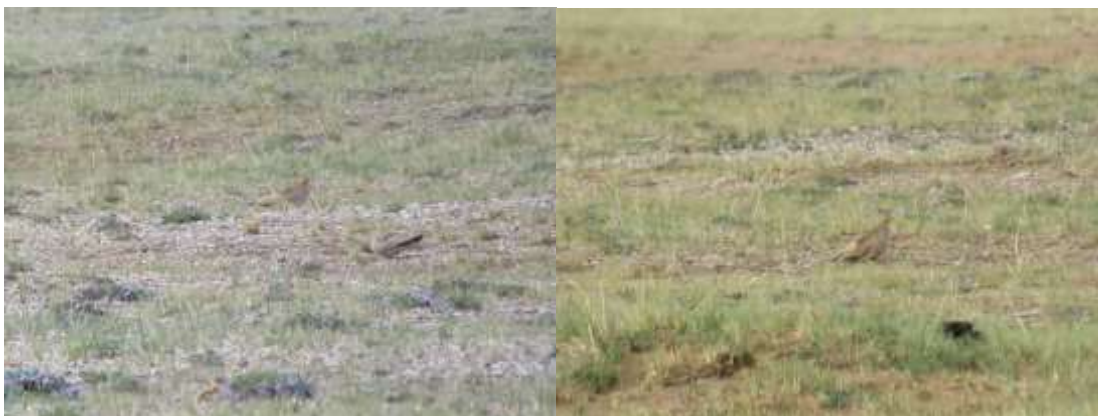
A pair on 23-06.