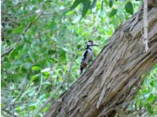
Long time no see Woodpecker for me