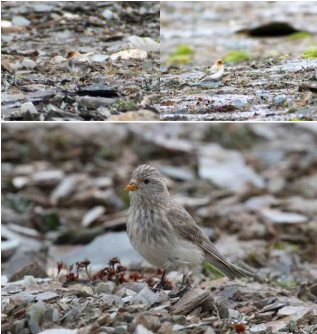
Female

The call reminded of Reed Bunting or maybe even Penduline Tit.