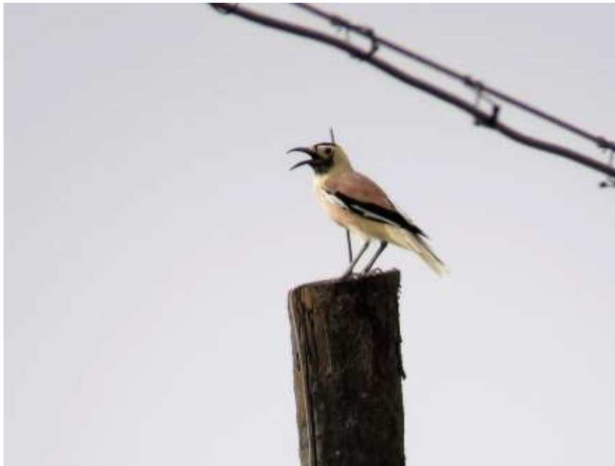
Great new Ground Jay!