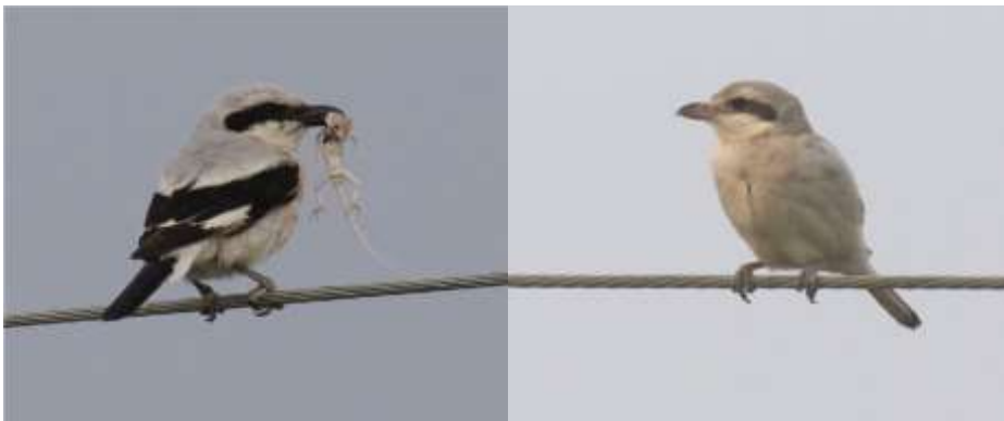
The pair