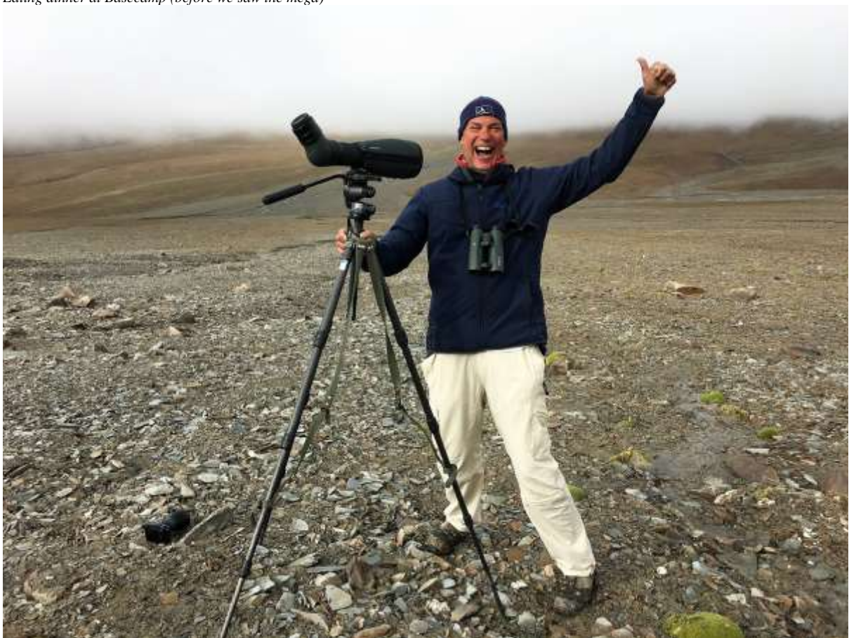
The day after....