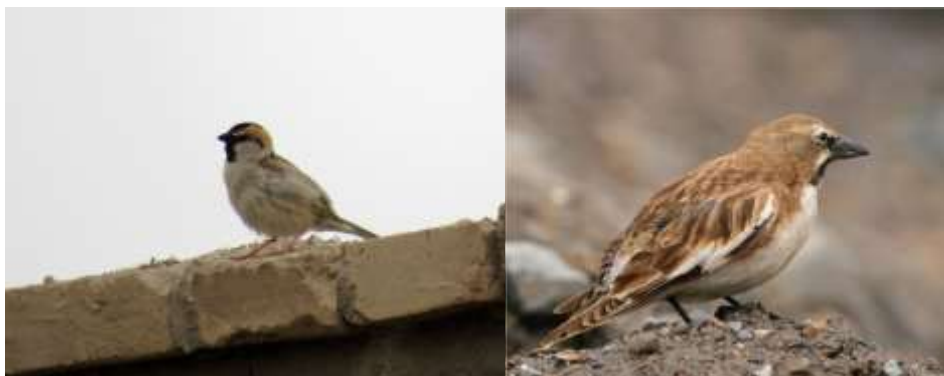
Again Saxaul Sparrow on a trip, always a treat.

Commonly seen on the trip, mainly in towns on the plateau.