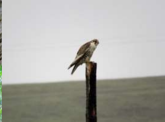
Sakers where everywhere