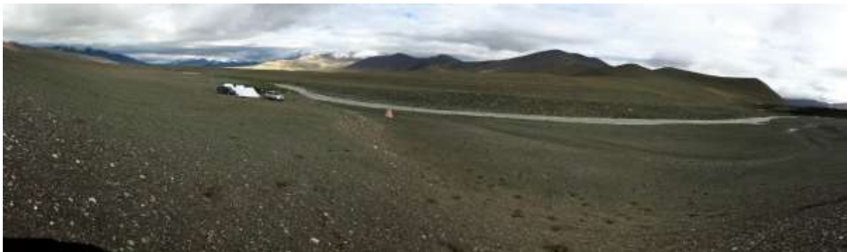
Basecamp from where we undertook our "Sillem's searching's"

On this trip the weather was variable on the Tibetan plateau with every thinkable weather type following quickly after each other. The Xinjiang part was dry, hot and windless.