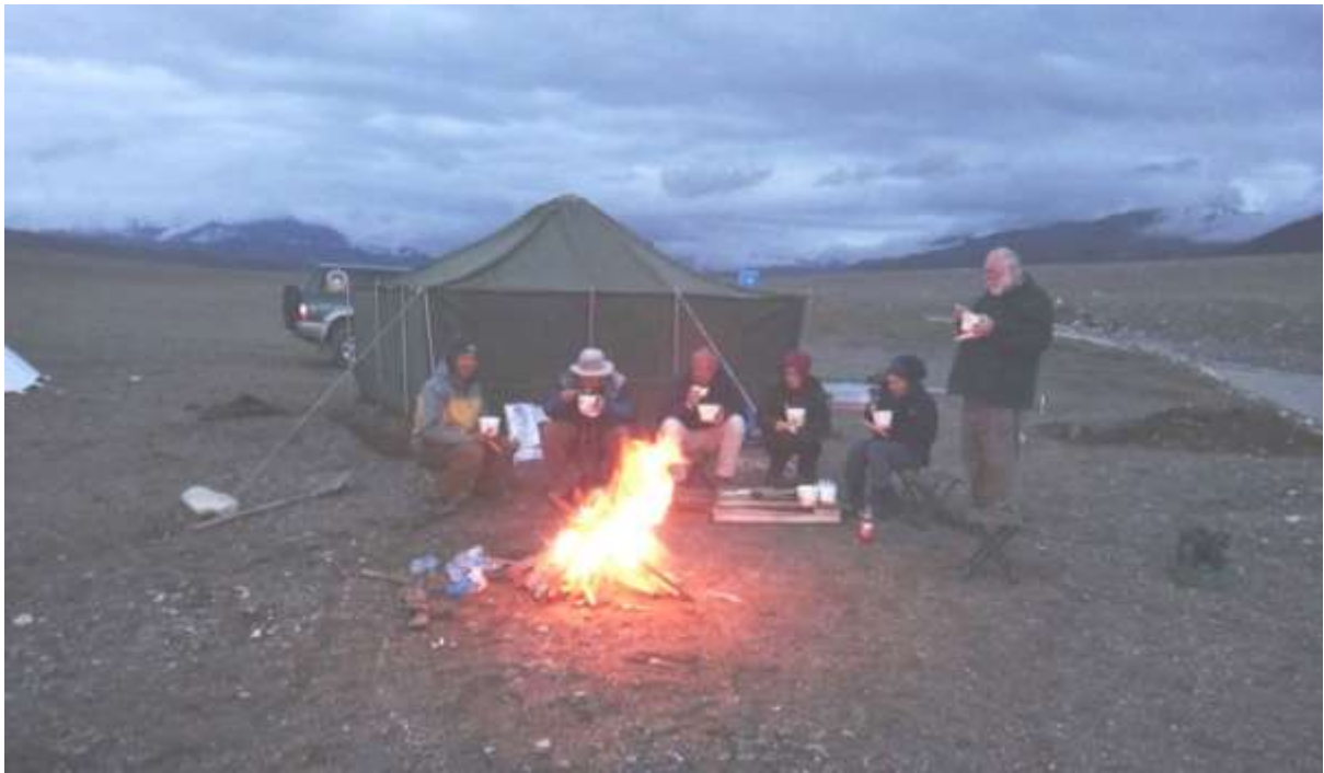
Eating dinner at Basecamp (before we saw the mega)