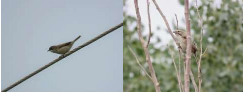
Desert Lesser Whitethroat and

18 birds in total in the Xinjiang province giving nice views. Small pale whitethroats with a song which was different but sounded related to curruca birds.