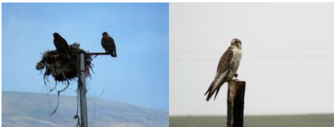
Upland Buzzards at a nest see how variable they are.