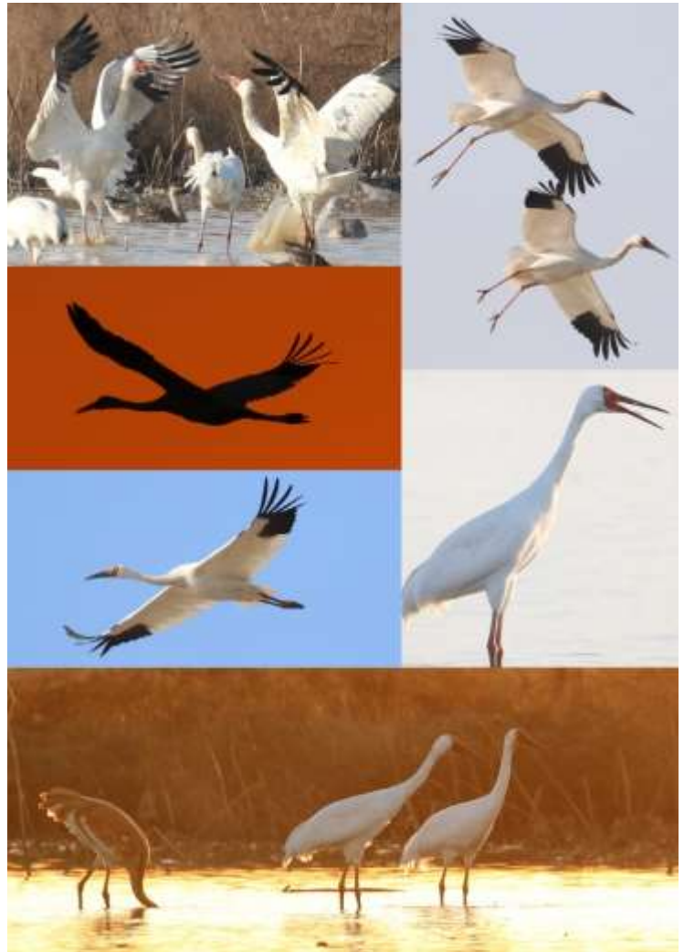
Above; Crane Lotus Pond (OC); below: Baer's Breakthrough (MS)