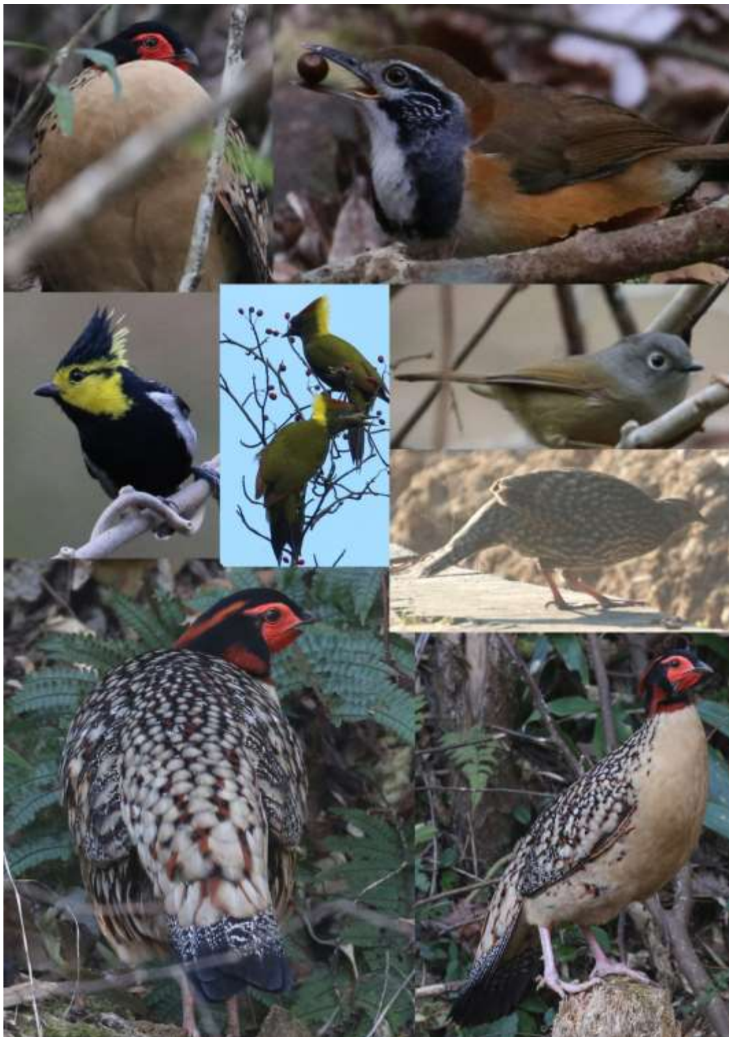
Right: Emei Feng (OC)

bamboo zone was much quieter with little apparent, but the slightly more varied mosaic of bamboo and scrubby woodland, especially along the road beyond the road running uphill to the summit was rather better with species including Speckled Piculet , Rufous-faced and Pallas's Warblers and Sultan Tit . Some good flocks of tits , bushtits and fulvettas and the odd bluetail were seen at various elevations; rice paddies towards and at the first village along the road yielded Asian Barred Owlet , over 50 Little Buntings , Blue Rock Thrush and a few Mandarins amongst commoner species. A few small lakes and pools further along were also checked.