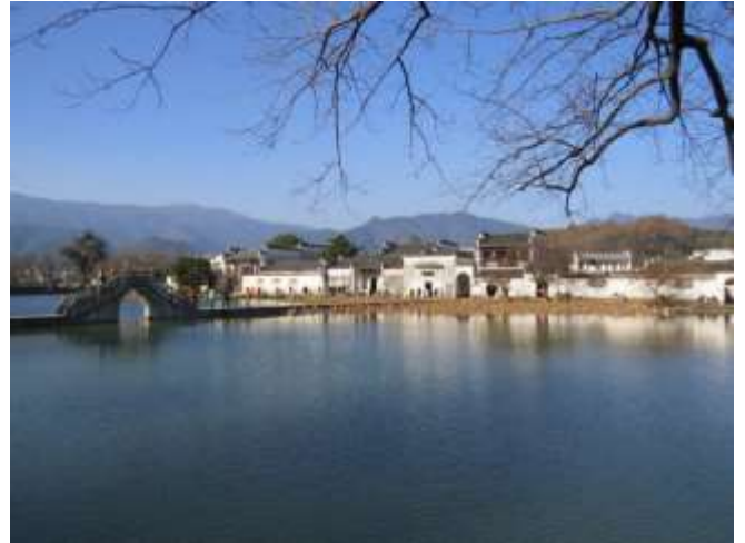
Above: Hongcun village ; below Huangshan scenery

Kingfisher . Rather more interesting were the paddyfield and scrubby edges nearby, in a valley running into a mostly dry lake. Here we had the only Bonelli's Eagles and Russet Sparrows of the trip, Daurian Redstart and opened our account on Olive-backed Pipit .