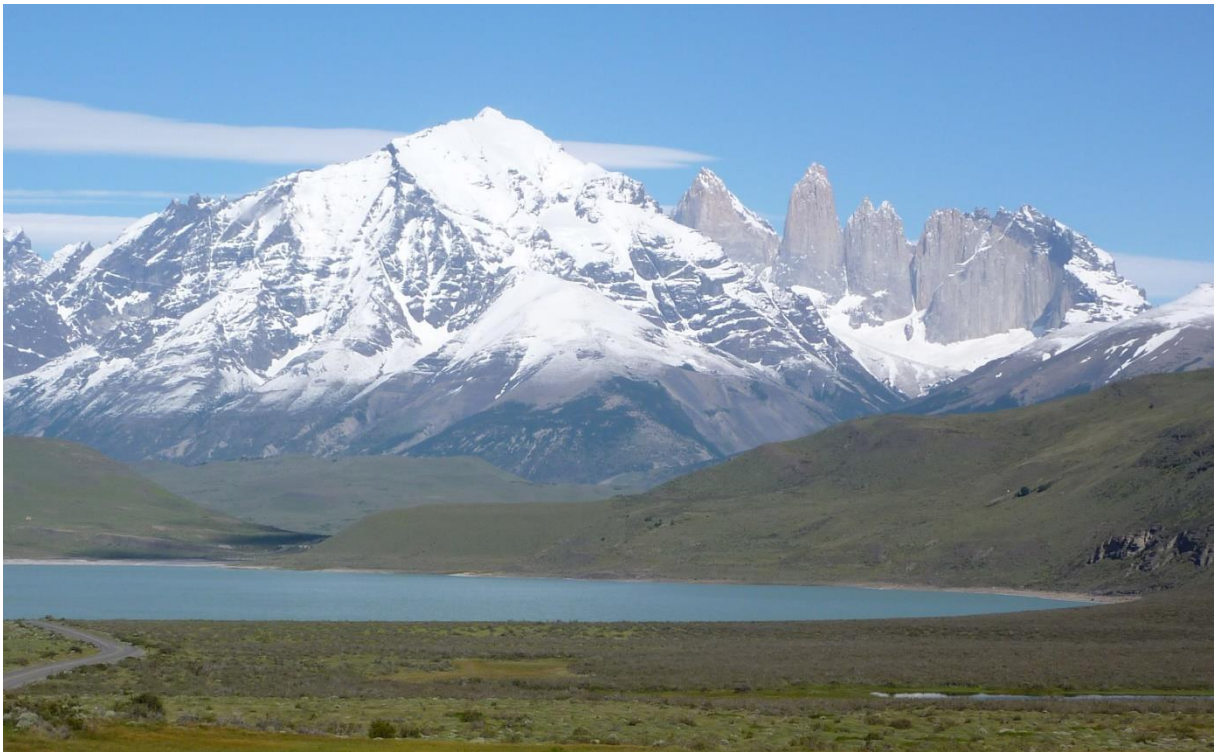
Torres del Paine N.P.