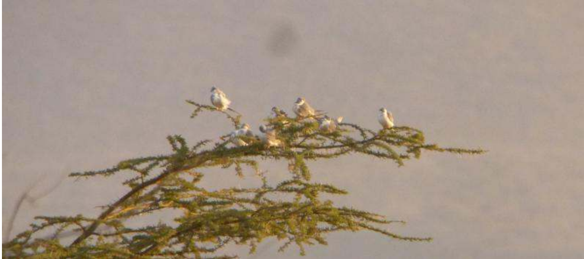
Scissor-tailed Kites in evening light, Awash NP (Wouter Teunissen)