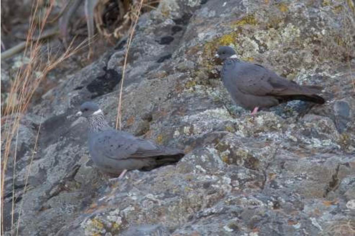
Pair of White-collared Pigeon (Wesley Overman)