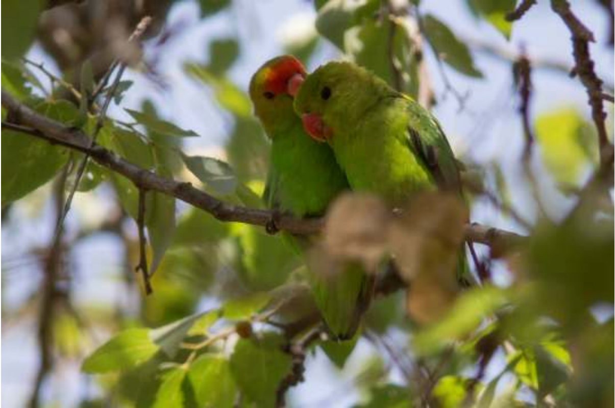
Pair of Black-winged Lovebird (Wesley Overman)