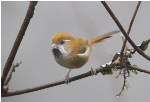
Golden Parrotbill - Suthora verreauxi

At 5:00 I was on my way arriving at 6:00 at the pass (Map 1). The conditions were not good at all: it was cold with a dense fog and rain. I did some roadside birding until the rain stopped. Then I went onto the trail. The first part had a few steep and slippery sections. At the first clearing I found a pair of Golden Parrotbills. Much appreciated as I had missed these at Mount Fansipan as well. After that the trail was significantly overgrown and I had to crawl several times through bamboo tunnels. Pale-throated Wren-Babblers appeared to be common here. At the gully (Map 2) I found a pair of Streaked Barwing!