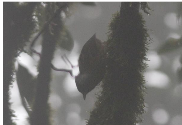
Streaked Barwing - Actinodura souliei