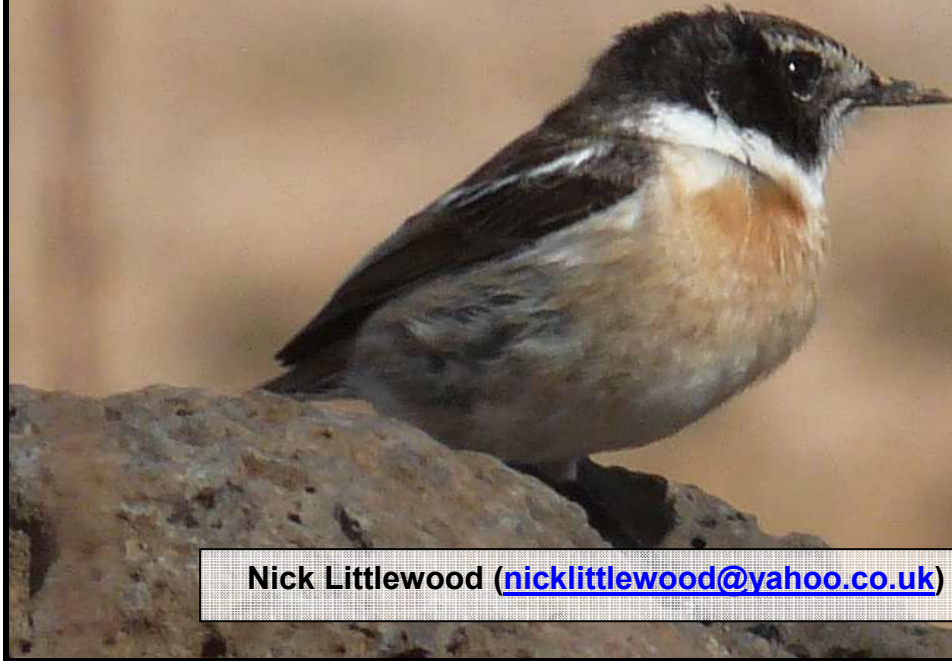
Fuerteventura Chat, Embalse de los Molinos

Fuerteventura, Canary Islands 15 to 18 December 2010