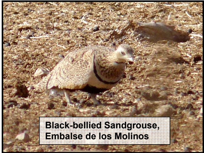
Black-bellied Sandgrouse, Embalse de los Molinos

Overnight rain cleared soon after dawn, but left a very windy day. Thus I deferred plans to head into the mountains around Betancuria and instead headed first to the beach at Caleta de Fuestes which held a selection of waders including c.10 Kentish Plovers. Heading inland, Rosa del Taro held just 3 Coots and, as I approached Embalse de los Molinos, another band of rain arrived. Hence I headed down to the sea at the end of the road (Puerto de Los Molinos) and sat out the rain a while. As it dried a little, I found a sheltered spot in the rocks and seawatched for a half hour but with nothing to show for the effort. I headed back up to Embalse de los Molinos, which held a few Ruddy Shelducks and got excellent close views of a male Fuerteventura Chat on the wall near the dam. Heading back towards the road, 2 Black-bellied Sandgrouse showed well among a field of goats.