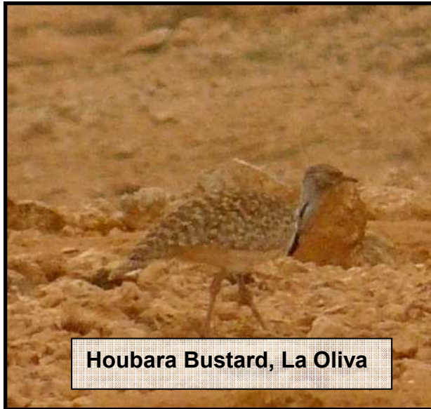
Houbara Bustard, La Oliva