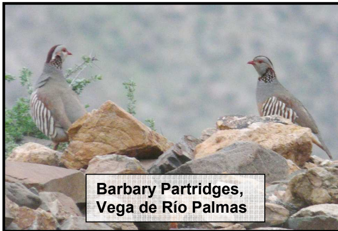
Barbary Partridges, Vega de Río Palmas

As the wind was still strong, I decided to head into the island's capital Puerto del Rosario to look around the harbour for anything sheltering there. The harbour itself was almost birdless but a few waders frequented the shore to the north. Finally, I seawatched for the last hour and a half of daylight from Caleta de Fuestes, which produced 27 Gannets.