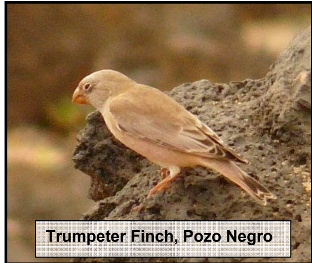
Trumpeter Finch, Pozo Negro

After some lunch back at the apartment, I ventured out to La Oliva and spent from around 2pm until 6pm on the track that passes the cultivations at Rosa de los Negrines. A very distant Houbara was soon seen and then, after a few stops and scans, a much closer bird just past the cultivations. A short while later I encountered a displaying male that performed superbly. Further along the track, a pair of Fuerteventura Chats was found in a small area of vegetation.