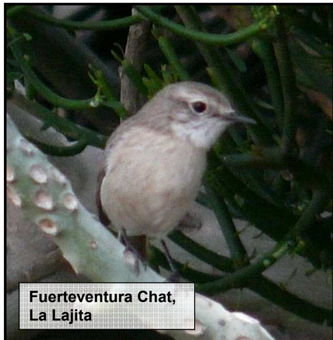
Fuerteventura Chat, La Lajita

A walk through the trees alongside the main road at Costa Calma produced a few additions to the trip list. Then I ventured down onto the beach at Hotel Meliá Gorriones. The tidal lagoon appeared birdless, but the edge of the Salicornia en route held a good number of waders including c.40 Kentish Plovers.