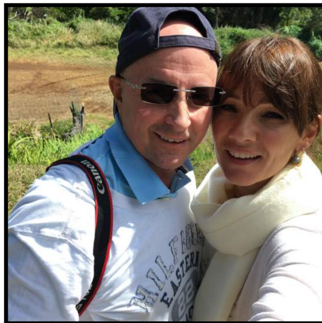
Author and wife on Mount Koghi