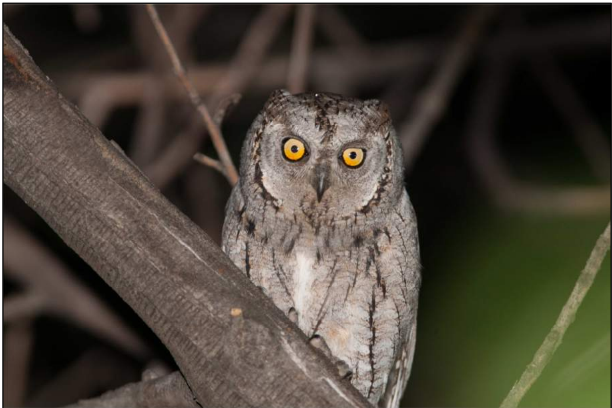
Scops Owl – Otus scops by Machiel Valkenburg

Masked Wagtails. We spend most of our time birding the Sogety valley during our time in the east. We started at the northern part where a small well was the local theater for the evening. At this artesian, in no time tens of Mongolian Finches with many Grey-necked Buntings came to drink. Very quickly a Crimson-winged Finch came in as well for a little drink. On the surrounding plains species like Tawny Pipit, Horned Lark, Isabelline Wheatear and Lesser Short-toed Lark are common. Sometimes we were lucky to find a Desert Wheatear, Asian Desert Warbler or Demoiselle Crane. In the air a Black-eared Kite or Long-legged Buzzard was always nearby. A colony of Lesser Kestrels proved an interesting subject for the photographers of the group. The main attractions however were the four Pallas's Sandgrouses we found during a morning excursion among many Black-bellied Sandgrouses. Our last visit in the east was the Kokpek Pass but now with good weather the Chestnut-headed Bunting proved very obliging and we all had great views of this master bird.