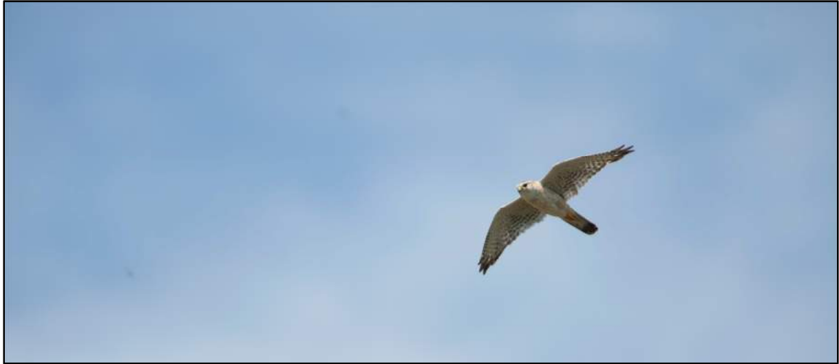
'pallid' Merlin - Falco columbarius pallidus

Demoiselle Cranes were easily approached. We finally headed back to Almaty by way of the Wish Tree where some Barred Warblers and Lesser Grey Shrike showed outstandingly.