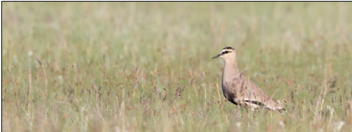
Sociable Lapwing - Vanellus gregarius by Gerard de Jong

The last days of our tour were an exploration of the Korgalzhyn Nature Reserve near the capital of the country, Astana. A morning flight brought us to Astana from where we drove a further 200km to the small village of Korgalzhyn. During the drive we noted over 30 individuals of Red-footed Falcon nesting next to the road. Pallid Harriers were abundant as well and a few Short-eared Owls displayed wonderfully. The whole group was excited when we saw our first Black Lark; it displayed its stunning 'butterfly' flight where it beats its wings very slowly as it ascends. Over the course of our stay we must have seen many thousands of these gorgeous and special birds. Around the village we found the endangered Sociable Lapwing which has a stronghold here. One couple paraded over the steppes and we all had great sightings.