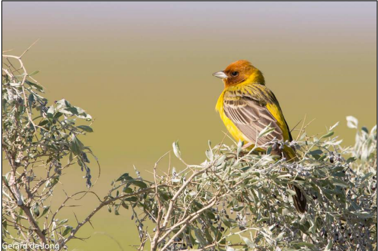
Red-headed Bunting – Emberiza bruniceps by Gerard de Jong

especially interesting but Hume's Warblers were the most numerous. Hundreds of Common Rosefinches and the taxonomically interesting 'indicus' subspecies of the House Sparrow along with loads of Common Nightingales and Spotted Flycatchers made it a very interesting spot. In the evening we witnessed as well the migration of no less than 80 Crested Honey Buzzards!!