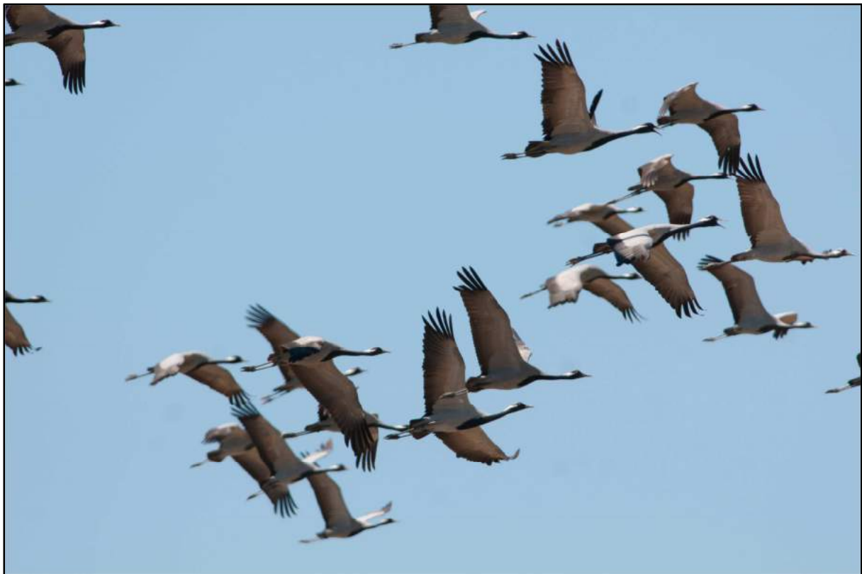
Demoiselle Crane – Anthropoides virgo by Machiel Valkenburg

Ibisbill. The bird was found soon afterwards and all of us had walk away views. However to get to this spot proves to be more difficult every year because of border guard patrols. A little higher up around the Observatory we birded the juniper scrubs and quickly found all desired species such as White-browed Tit Warbler, Sulphur-bellied Warbler and more White-tailed Rubythroats, White-winged Grosbeaks and Fire-fronted Serin. Around us we heard the calls of Himalayan Snowcocks constantly but were unable to locate any from this spot. When going higher along the asphalt road leading to Cosmos Station, we found several Brown Accentors which showed very well. Both Yellow-billed (Alpine) and Red-billed Chough were seen on many occasions and sometimes provided very close encounters. At the very top (3600m) we were very lucky to come across a fine couple of Güldenstädt's Redstarts. On the last day we descended back to Almaty and made some small stops in the pine forests where Songar Tit (sometimes regarded as a split from Willow Tit) was seen beautifully up close. At the last we were very lucky with four soaring Himalayan Vultures and at the river we found a Blue Whistling Thrush and a Brown Dipper with youngster. The first part of our tour finished with a few good beers in our Almaty hotel.