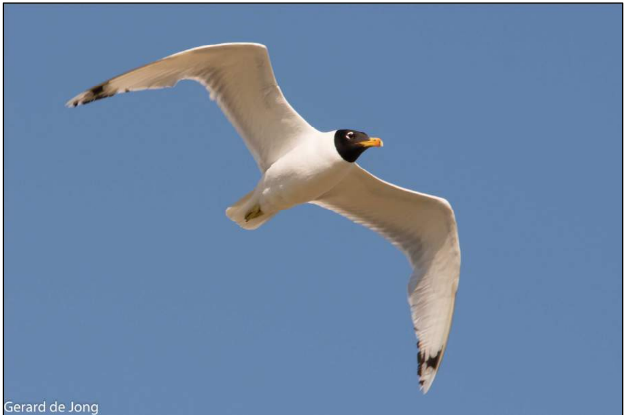
Pallas's Gull - Larus ichthyaetus

Another steppe treasure is the White-winged Lark which is less abundant than the Black Lark but nonetheless was seen on many occasions. Korgalzhyn is a 'must do' for all birders with an interest in waders and we were lucky to see thousands of individuals of Ruff, Terek Sandpiper, Green Sandpiper, Spotted Redshank, Curlew Sandpiper, Temminck's Stint, Little Stint and Red-necked Phalarope. This abundance was enriched with large flocks of White-winged and Black Terns, Marsh Harriers, Black-winged Pratincoles, Horned Grebe's, Arctic Loon, Pallas's Gulls, Steppe Gulls, Booted Warblers, Savi's Warblers, Moustached Warblers and loads of Northern Wheatears. Some special birds we were hoping to find were the 'steppe' Twite and 'steppe' Merlin; both subspecies revealed themselves excellently giving walk away views. After two nights in Korgalzhyn we headed back to Astana and made one more stop near the city, where the drop-dead-gorgeous Pine Bunting was quickly found. Both male and female were present and gave prolonged views. In the evening we enjoyed our final dinner in the city and the group went to bed as they needed to make their direct flight to Amsterdam with KLM. Machiel stayed in Kazakhstan for another tour.