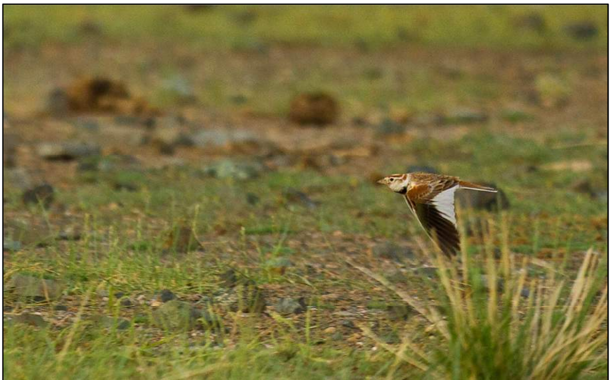
Mongolian Lark – Melanocorypha mongolica

The first lake we toured was Lake Achit Nur, which was also the largest lake that we would visit, followed by Lake Khar-Us-Nur and a small saline lake which we dubbed Relict Gull Lake, and you may guess why! The stone deserts nearby Lake Achit Nur were dotted with small bushes and proved to be the perfect habitat for one of the most sought after species of this special country: the incomparable Henderson's Ground Jay!! Soon we found Greater Sand Plover, Daurian Shrike and many Horned Larks closer to the lake. The lake was full with waterbirds: Black-throated Loon, Goldeneye, Goosander, Smew, Red-crested Pochard and more Bar-headed Geese. One of the best sightings here was surely a couple of elegant Swan Geese! While a White-tailed Eagle patrolled the air, we found along the Khovd River an adult male Long-tailed Rosefinch, which showed very well; the contrast between the white wing and reddish body made this the bird of the trip for some. Large mixed flocks of foraging Common and Pacific Swifts came close and some of us tried photographing these fast birds.