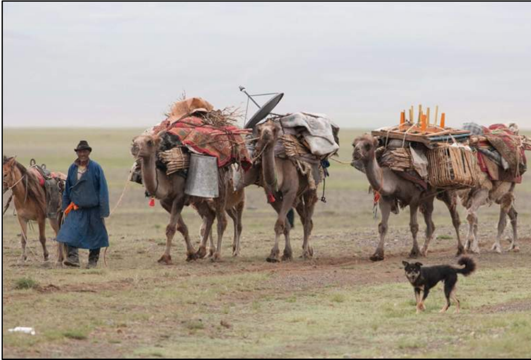
Mongolian caravan, note the satellite dish!