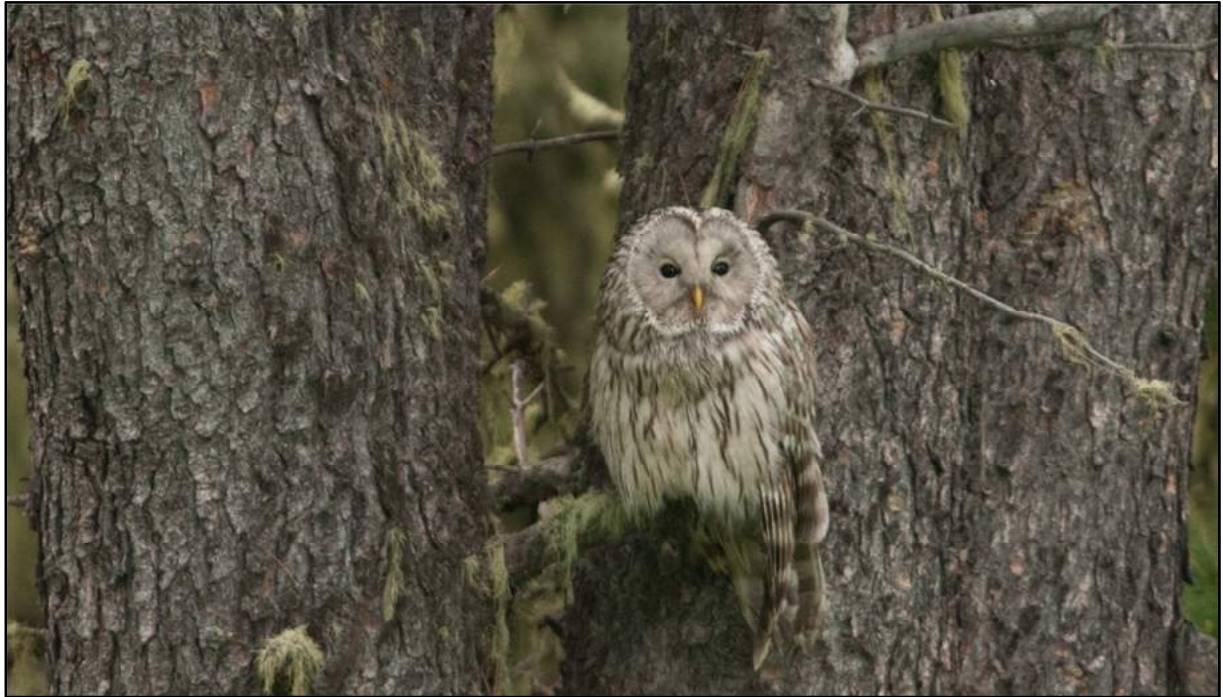
Ural Owl – Strix uralensis

Our journey continued southwards towards the Chuya plains and at every turn we became more and more amazed at the impressive landscapes of the Russian Altai. A perched adult Imperial Eagle must have been the highlight of our drive for many and several sightings of Demoiselle Cranes were equally interesting. For three nights we lodged in beautifully decorated yurts, nomad dwellings from the times of Genghis Khan. We made day excursions to Tabozhok and Beltir in search of high mountain birds, which we found in good numbers. On both days the scenery was splendid and our 4WD cars proved to be essential in the rough terrain. Brown and Altai Accentors were found on several occasions and sometimes gave walk away views. On the mountain lake near Beltir we found our first Siberian Scoters, very amiable birds. While searching for Altai Snowcock, which we unfortunately never found, we came across some colorful Gldenstdt's Redstarts and many Water Pipits of the 'blakistoni' race. At a colony of Pale Sand Martin we also found a Eurasian Hoopoe and a group of four Pallas's Sandgrouse, which we scoped for over ten minutes near to the village of Kosh Agash, are worth mentioning as well. Many Black Vultures and a single Lammergeyer were showing wonderful.