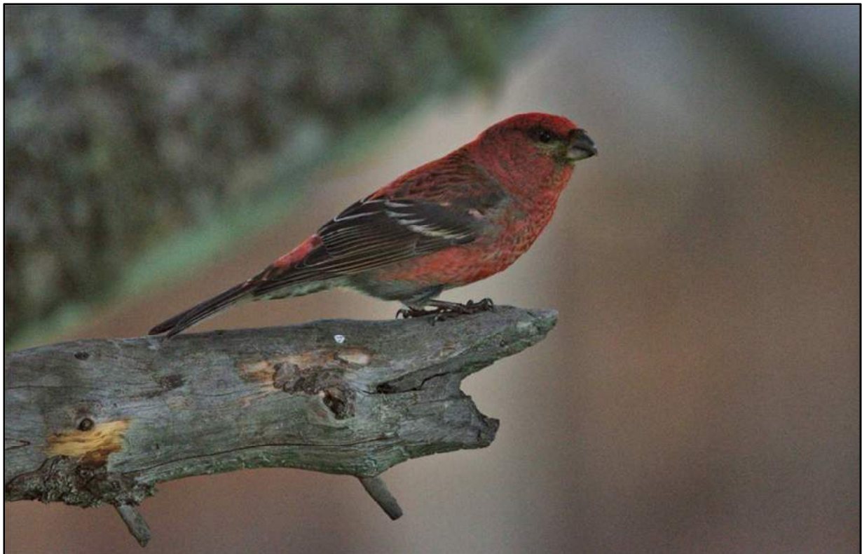
Pine Grosbeak – Pinicola enucleator