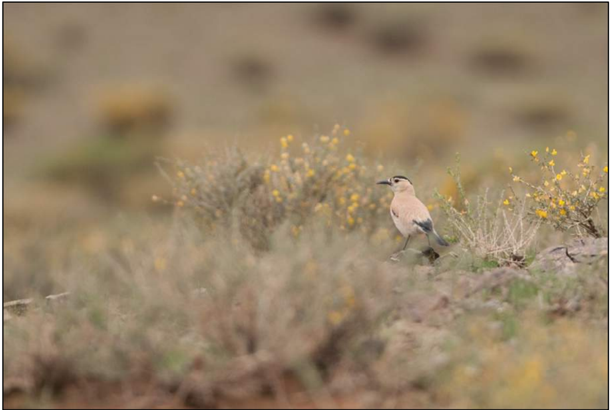
Mongolian Ground Jay – Podoces hendersoni

On the sandbanks we found Mongolian Gulls in a group of gorgeous Pallas's Gulls and Caspian Terns; the terns looked really small compared to the size of the Pallas's Gulls. High above the lake circled an adult Pallas's Fish-eagle with its distinctive tail pattern and long neck. What a heck of a bird!! We returned back to the Russian border and crossed back into Russia, staying again for a few nights at the delightful yurt camp.