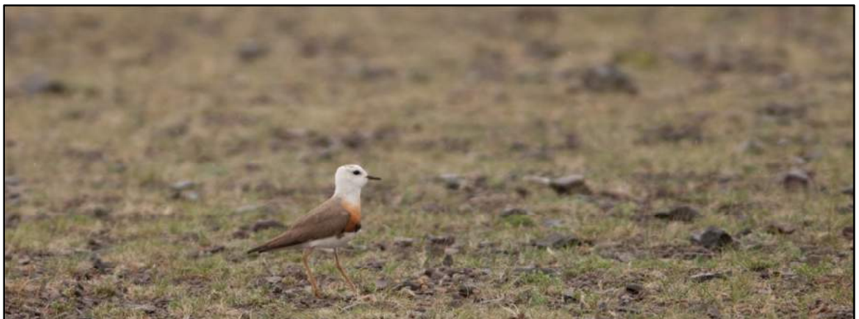
Oriental Plover – Charadrius mongolus

◦ Website www.rubythroatbirding.com ◦ contact machiel@rubythroatbirding.com ◦