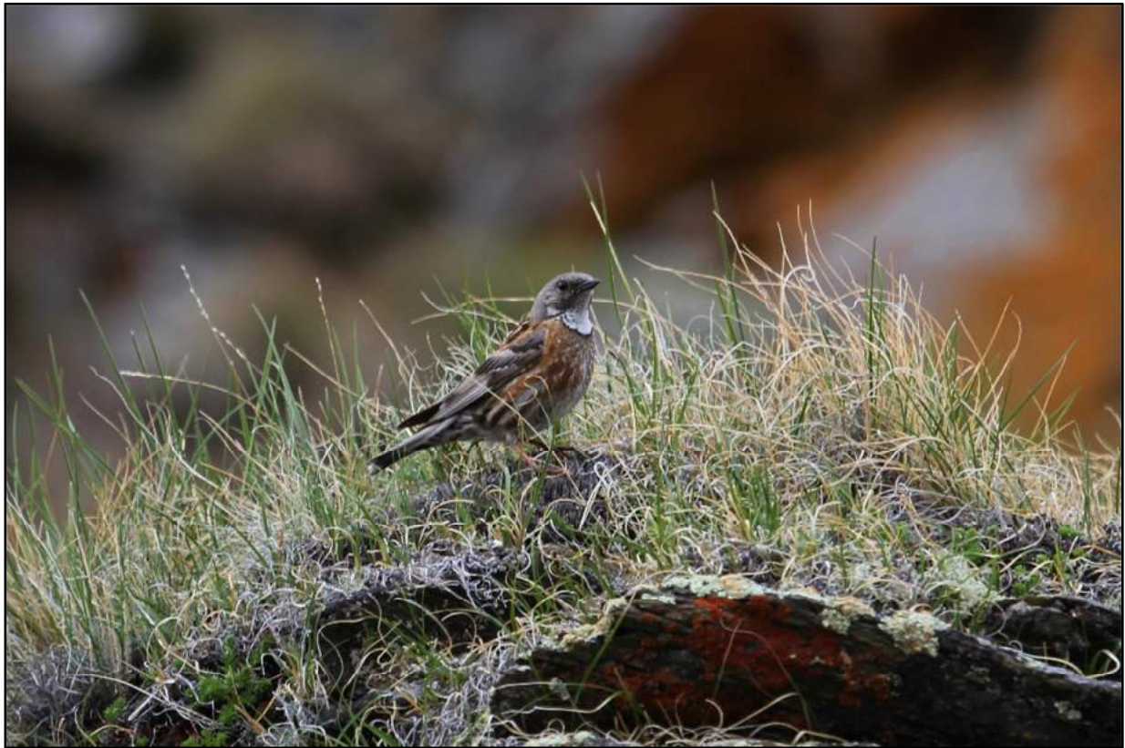
Altai Accentor – Prunella himalayana